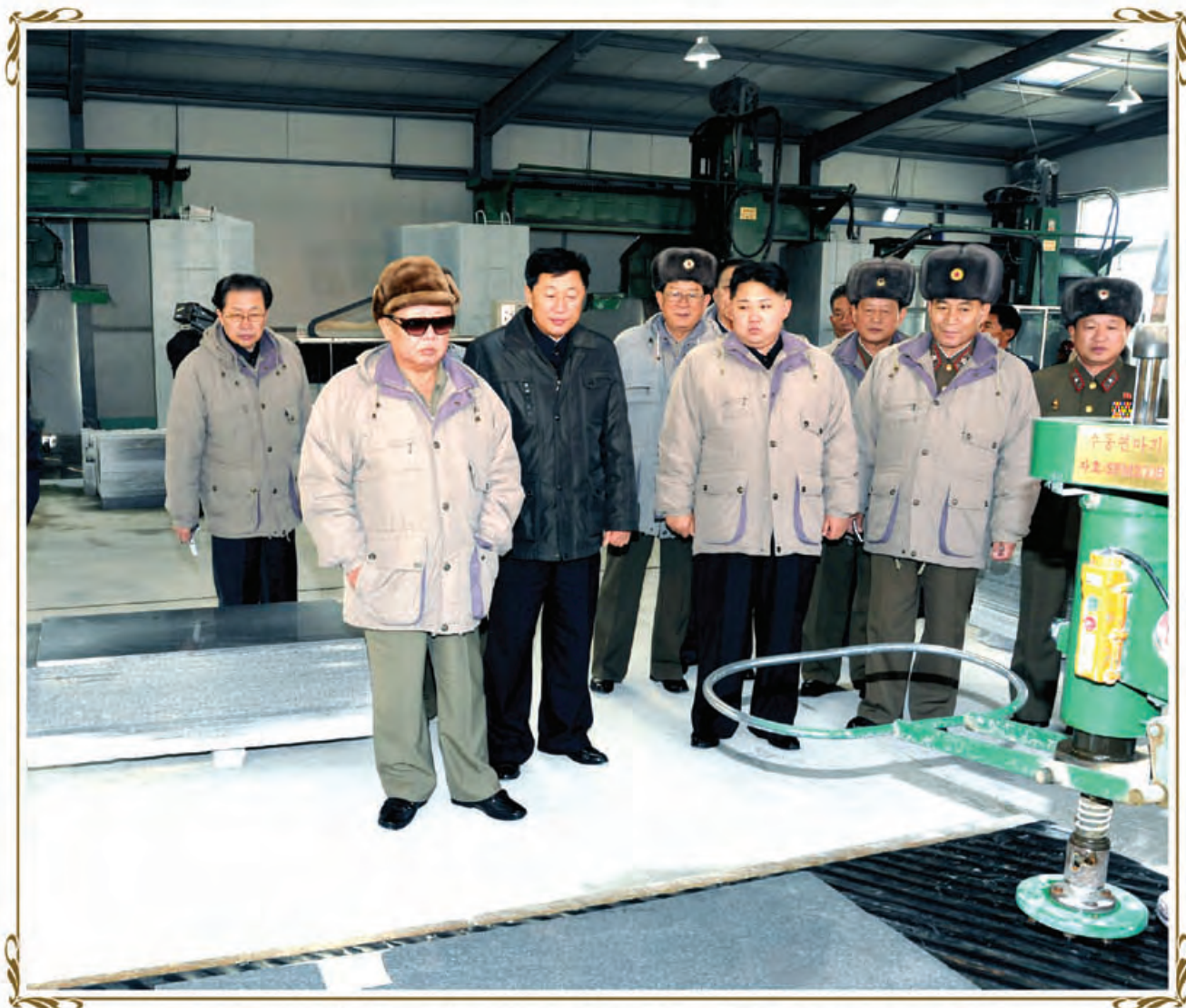
Leader Kim Jong Il gives on-site guidance at the stone dressing factory.