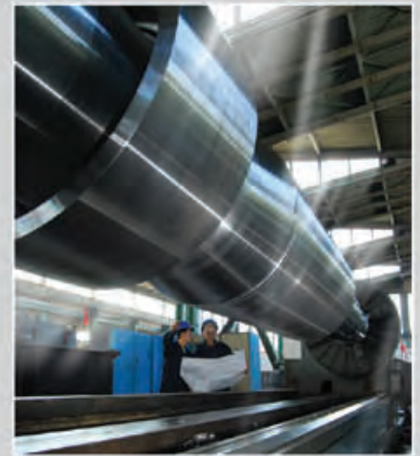
Taeon Heavy Machine Complex