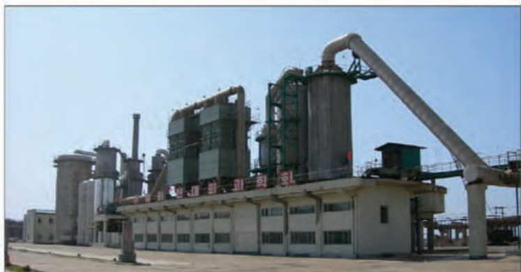
Machine-building giants in Taeon, Ryongsong and Ragwon have introduced CNC system into large-sized machines and built modern casting processes, thereby turning out green-energy facilities, hydropower

CNC-system-applied factories mushroom everywhere in the country, particularly in Huichon.