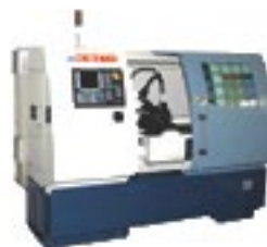
CNC Lathe "Kusong 6D"