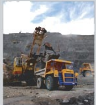
Musan Mining Complex