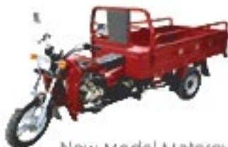
New Model Motorcycle