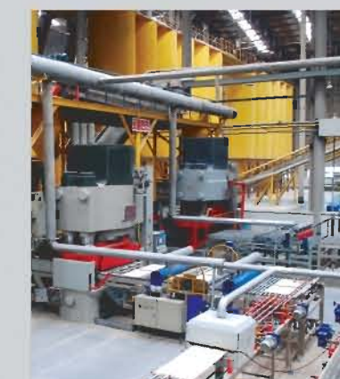
Taedonggang Tile Factory