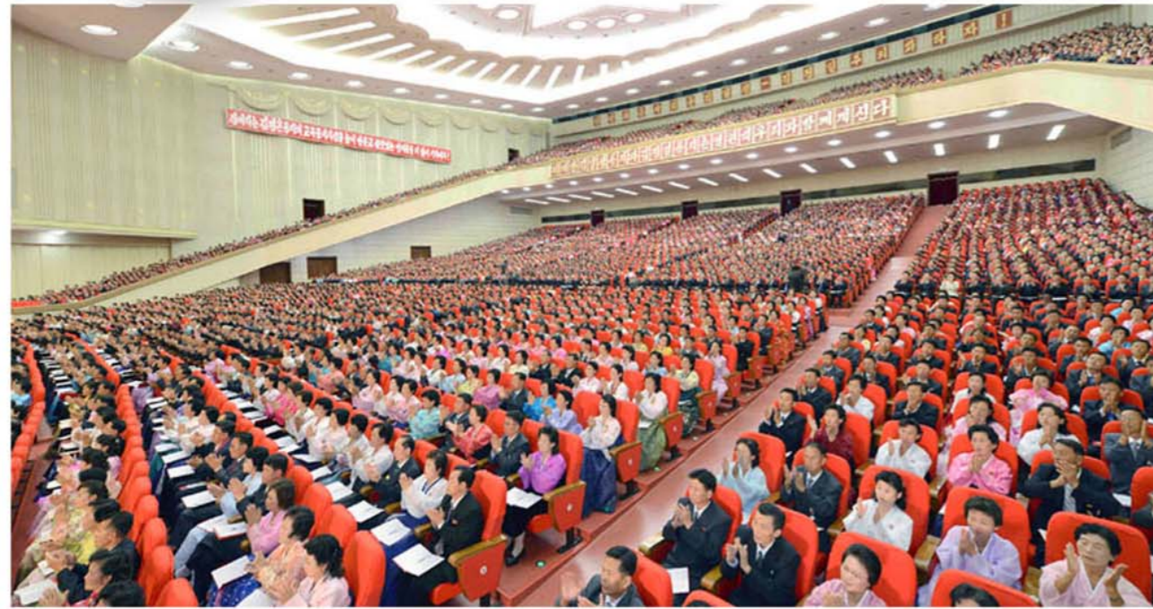
The 13 th national meeting of educational workers was held