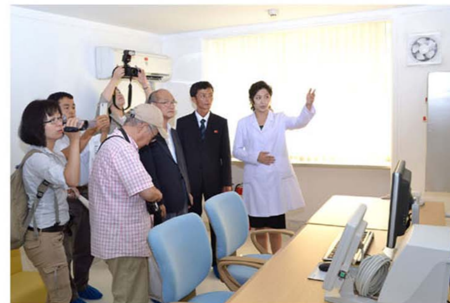
A delegation of Japan-DPRK Friendly Association from Fukuoka Prefecture looks round the Okryu Children's Hospital