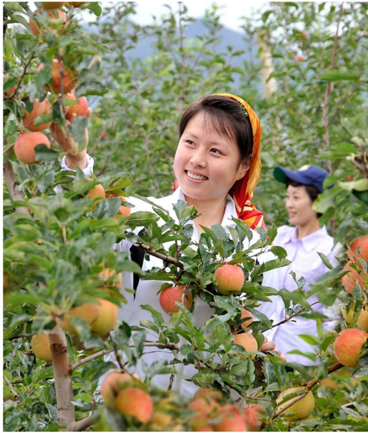
Joy of rich harvest