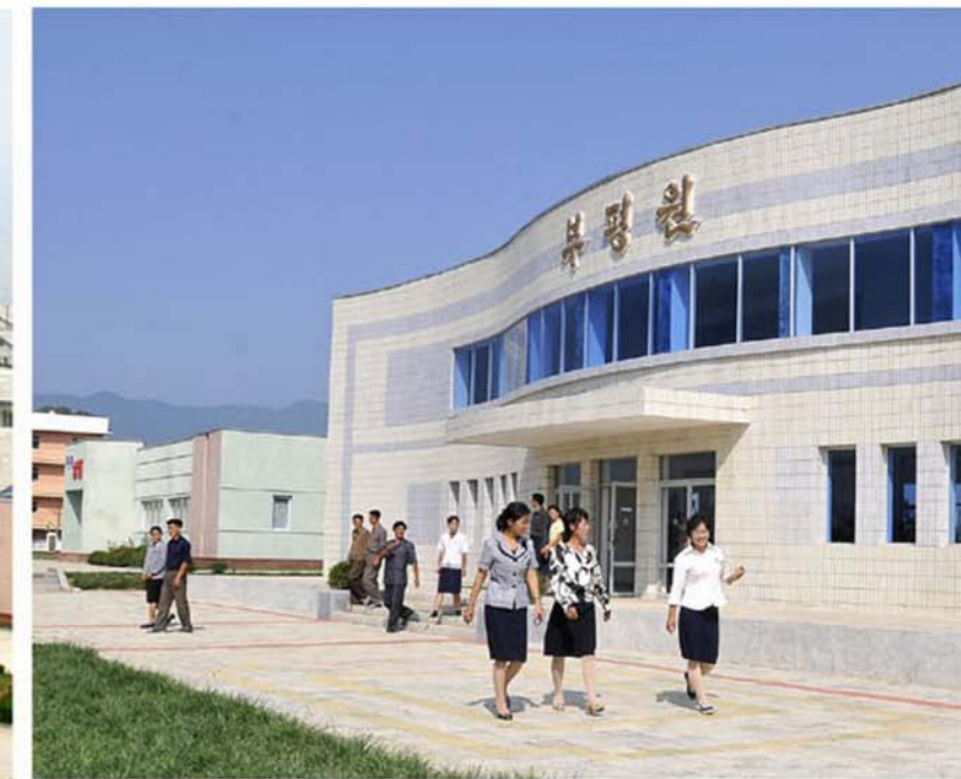
Cozy villages and welfare service facilities