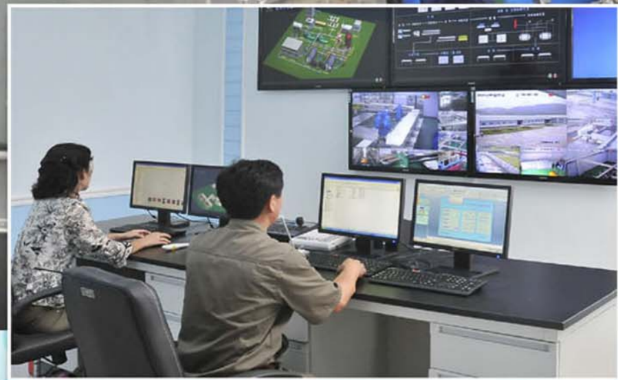
The factory turns out salted pollack roes, dried pollack and various other seafood products