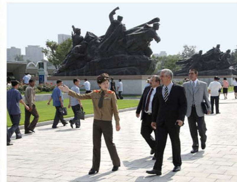
The Cuban Foreign Ministry delegation visits the Victorious Fatherland Liberation War Museum