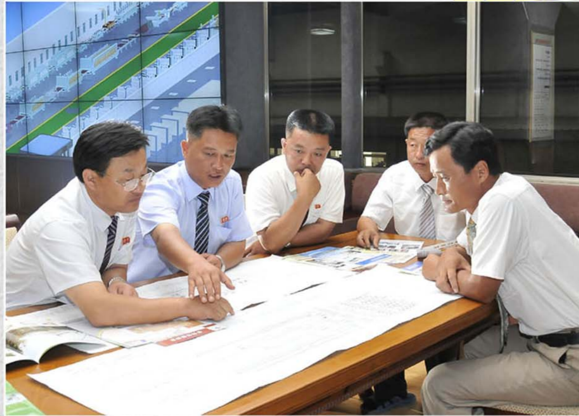
The factory sets up proper strategies of management and business and increases the proportion of domestically-available raw materials in production, thus putting the tile production on a normal track