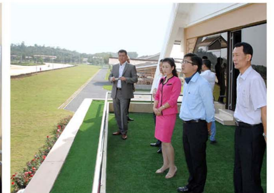
The Mongolian delegation led by advisor to the Foreign Relations Minister visits the Mirim Riding Club