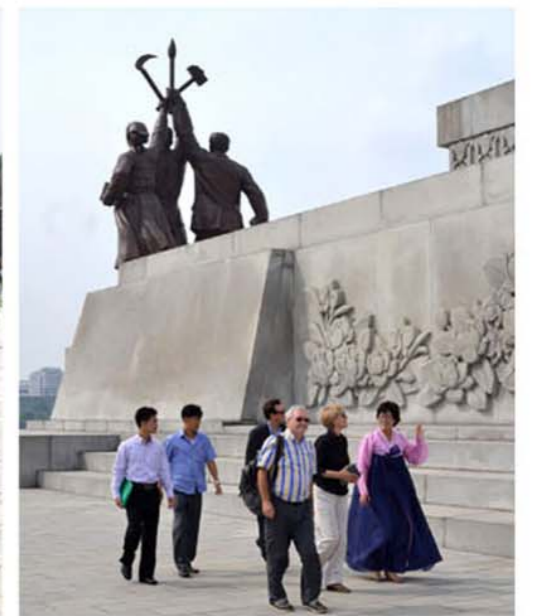
A delegation of the EU-Asia Centre at the Tower of the Juche Idea