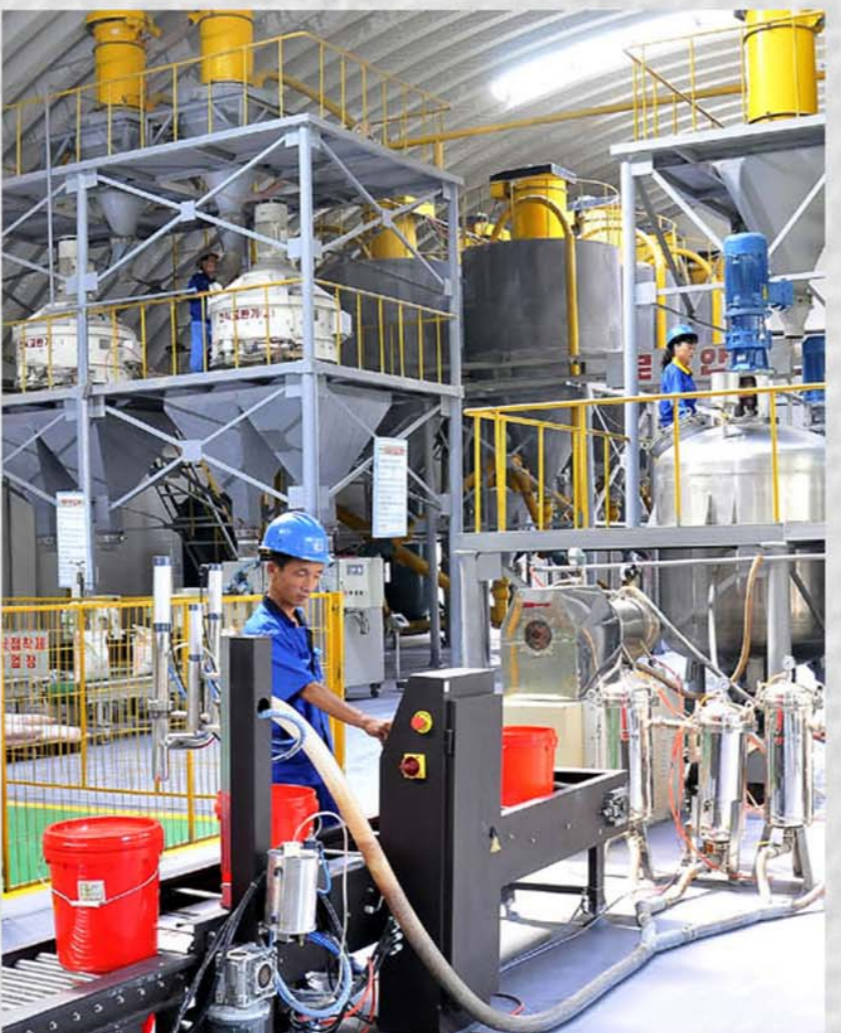
It produces plastic bags and adhesives