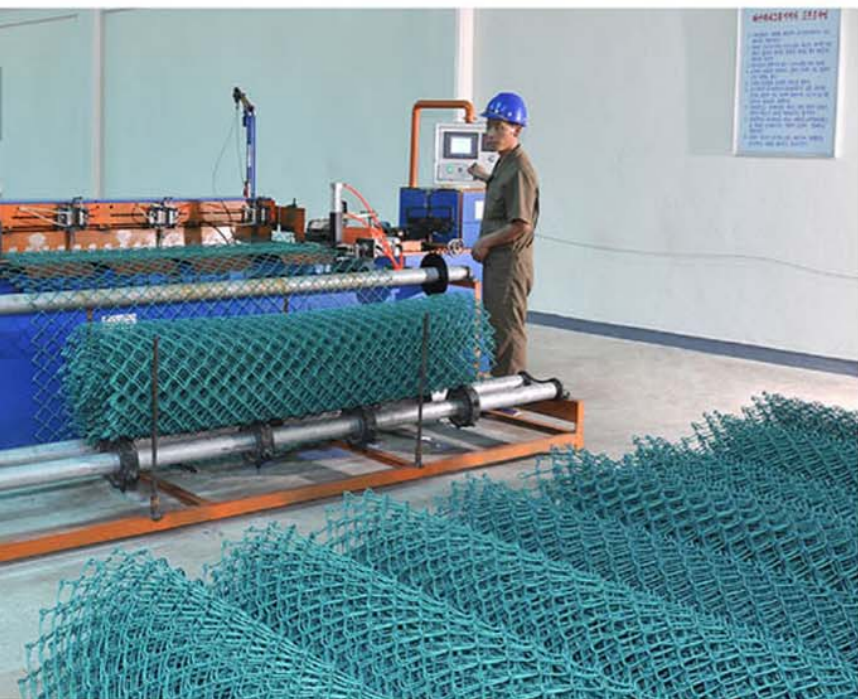
Wire-net fence factory