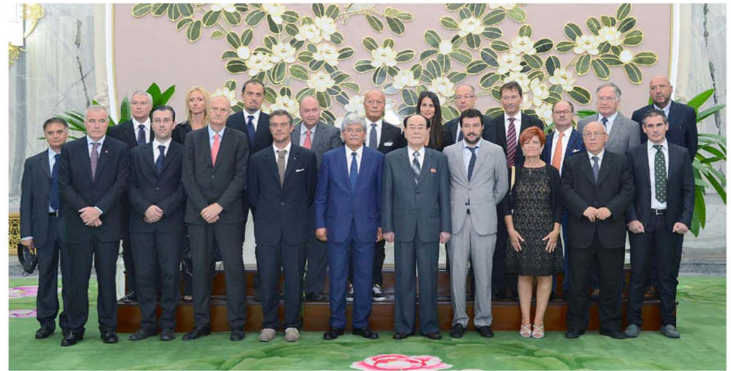
Kim Yong Nam, President of the Presidium of the Supreme People's Assembly of the DPRK, meets the delegation of Italian parliamentarians from different political parties