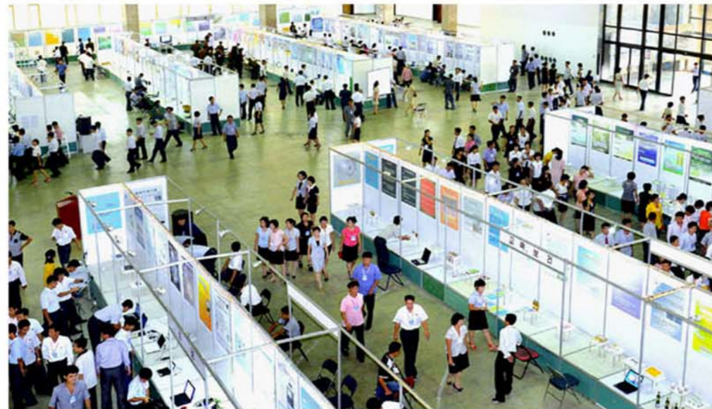
A national exhibition of sci-tech achievements made by young people was held. Presented there were over 3 600 items of inventions and new conceptions, including 750 IT products.