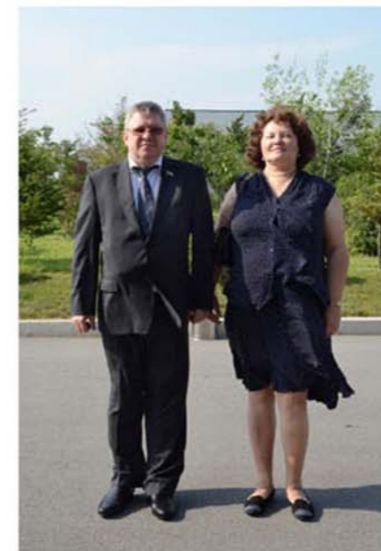
A delegation of Russian Federation Council led by its First Vice-chairman