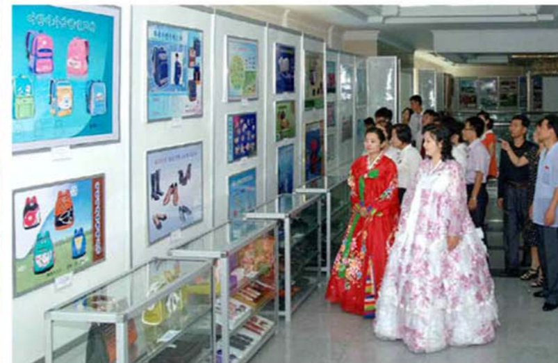
A design show of furniture and daily necessities was held. It put on display designs and goods that met the likings and aesthetic tastes of the people.