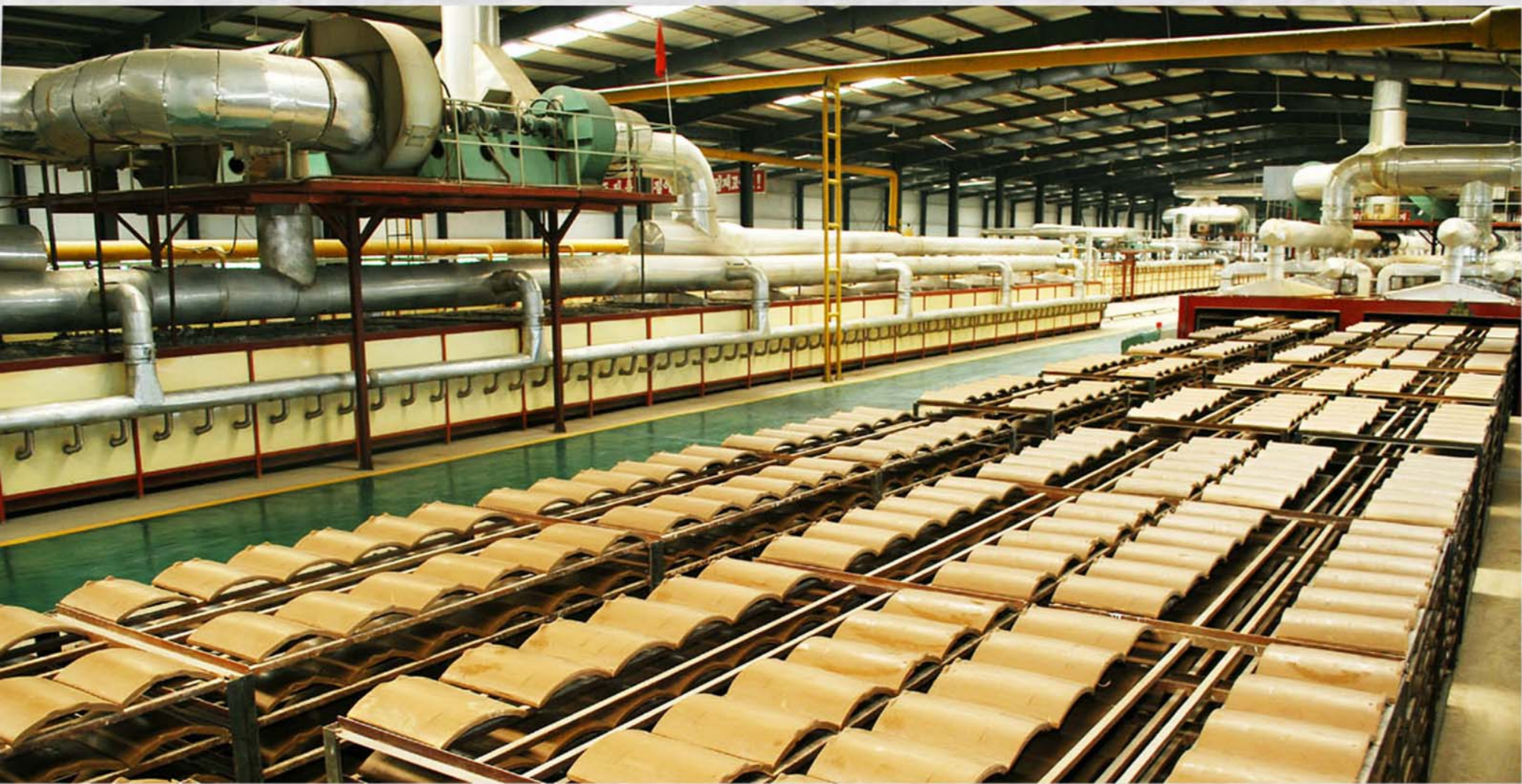
Roof-tiles are produced