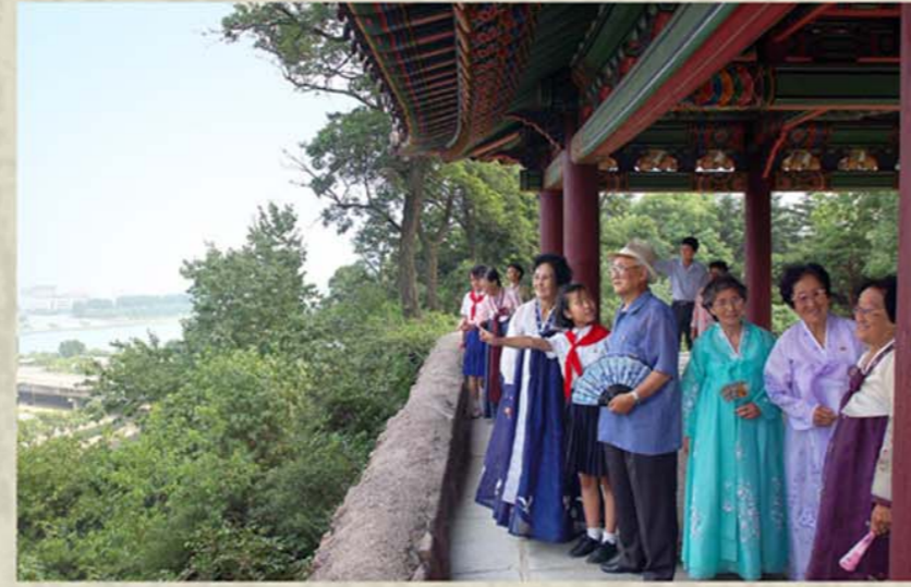
Working people spend a good time, looking round the historical remains in the hill

The pavilion, five kan (14.58 m) in the façade and three kan (7.68 m) in the flank, preserves the features unique to Korean wooden structures. Its pillars, roof and all other architectural elements are well-balanced and looking solemn and spacious. The creeper-patterned board put on top of the first cornice on a pillar to hold the beam support is as good as a wood carving.