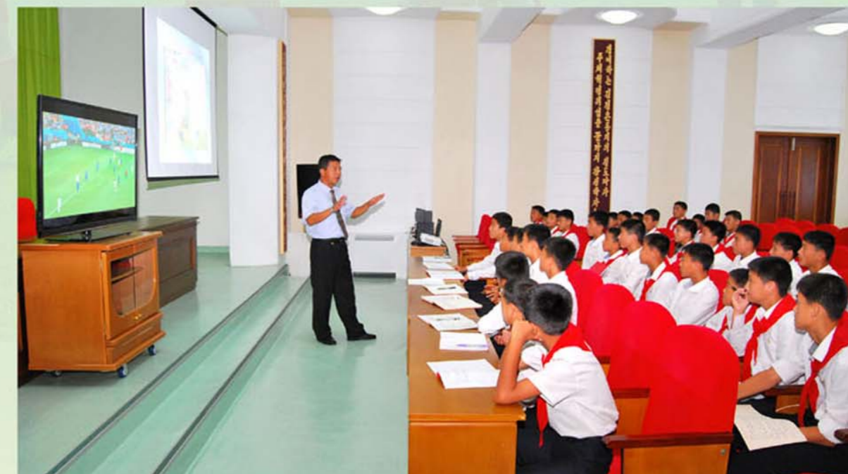
At the sci-tech knowledge dissemination room