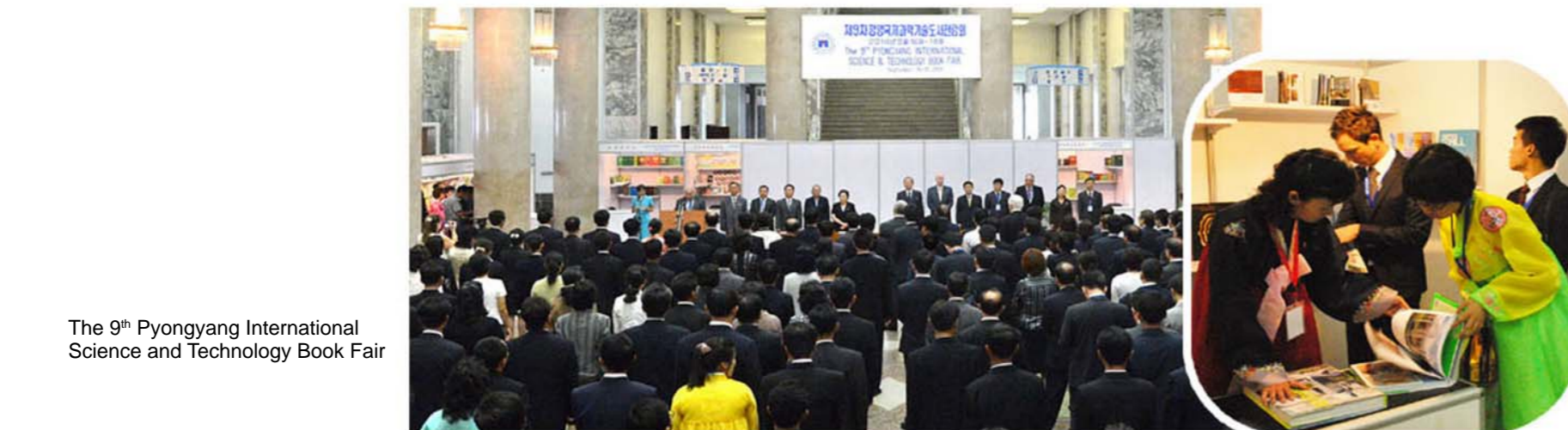
The 9 th Pyongyang International Science and Technology Book Fair