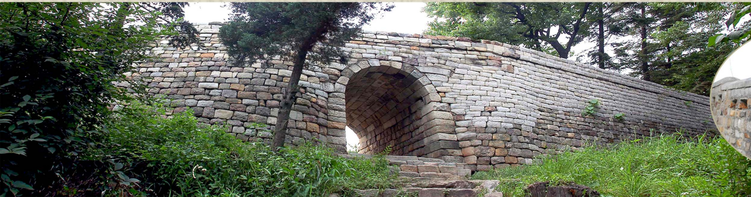
Walls of Pyongyang City

Hyonmu Gate is erected on a 2.5-metre-high stone elevation and has a gate tower three kan (7.05 m) in the façade and one