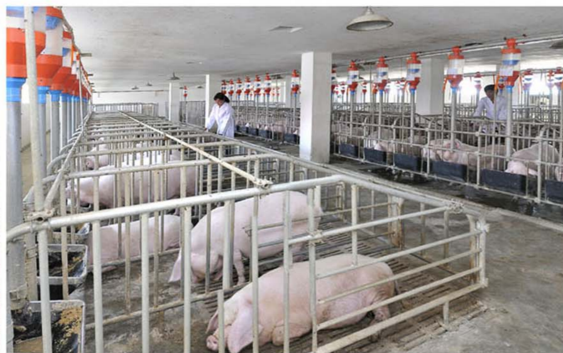
Pig farms in the farm are conducive to enriching the soil fertility by establishing a production cycle of fruit and livestock farming