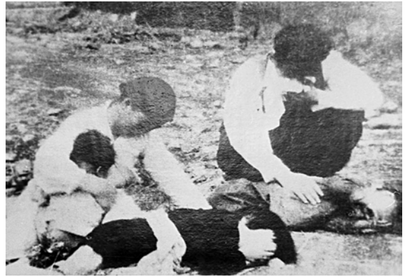
Children killed by American poison gas.

► fought against the enemy. Though without guns, we fought with rifles in our hands to defend our native village.