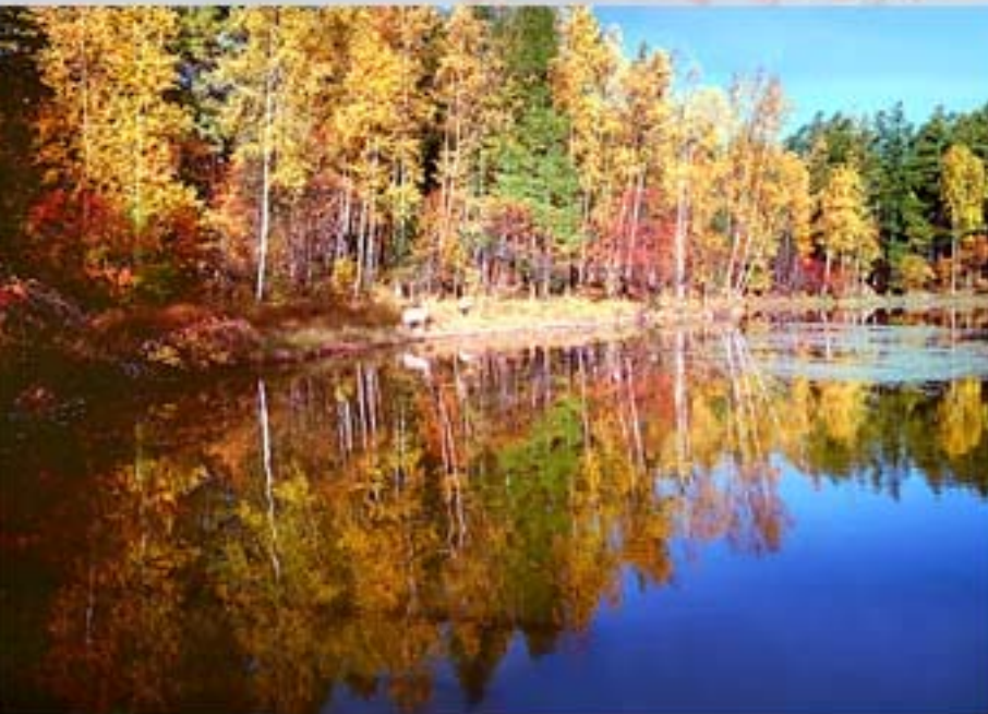
Lake Samji against an autumn-tinted background.

M T. PAEKTU—2 750 metres above sea level—is the highest mountain in Korea. It rises in Samjiyon County, Ryang-gang Province, in the northern inland area of Korea, bordering China.