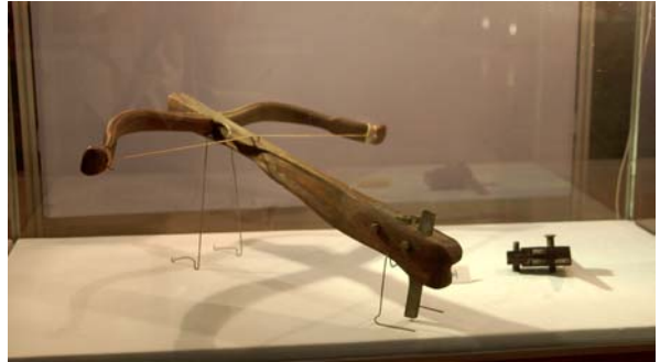
Soenoe of Ancient Korea.

Looking round the fossils of "Ryokpho man" and "Tokchon man" which date from the stage of Paleolithic man and those of "Sungnisan man" and "Mandal