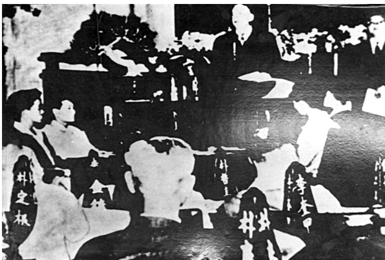
Dulles instigates war provocation in the puppet south Korean "National Assembly."

The US imperialists attached greatest importance to Asia, especially the Far East, in their attempt to realize their strategy of world hegemony, and Korea became their first target because of the military strategic position of the Korean peninsula and the then political situations there. Report No. 4849 of the Information & Investigation Bureau of the US State Department dated January 28, 1949 said that "in view of the strategic position held by Korea in Northeast Asia, establishment of control over Korea and her people ... will considerably strengthen the position of our country [the United States]." Indian newspaper Crossroads dated December 22, 1950 reported that "The US plan" for Korean unifica-