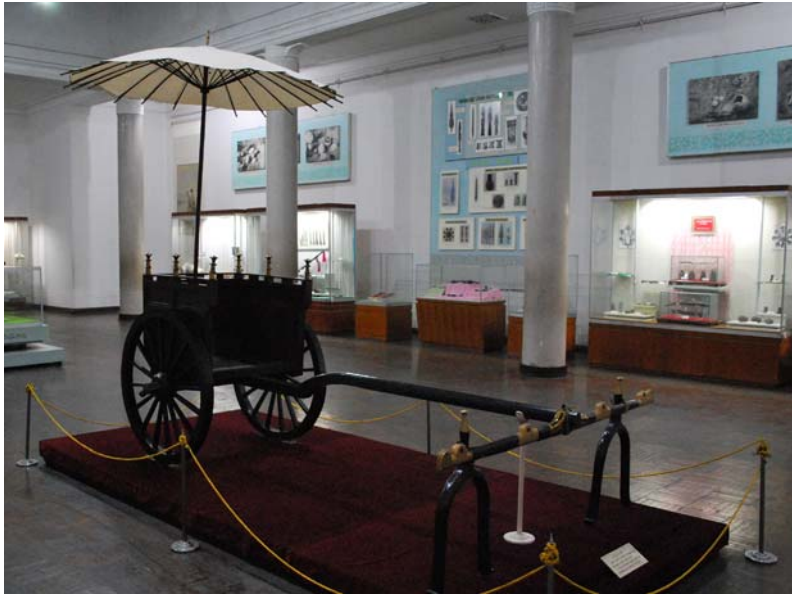
A carriage of Ancient Korea.

a vast territory as a slave-owning state of strong centralistic power.