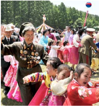
Front Cover: In Korea children significantly celebrate the International Children's Day