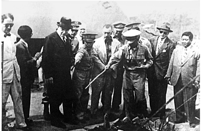
Dulles studies a relief map to acquaint himself with war preparations.

To dominate the world is an ambition the American ancestors began to harbour when founding their country, the United States of America, and to realize the ambition became the general line and ultimate goal of the aggressive foreign policy of the US imperialists after World War II. The US imperialists, who had fattened militarily and economically through the war, emerged as leader of imperialism after the war, and overtly began to try to realize their ambition of world