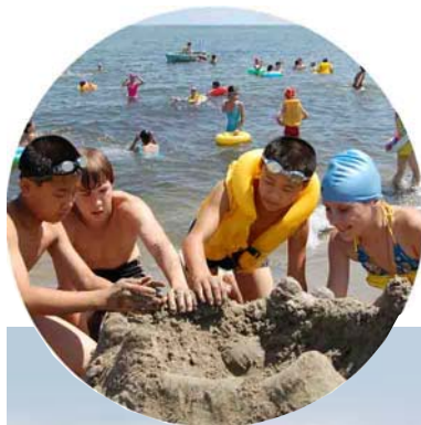
A view of the Songdowon International Children's Camp.

Chairman Kim Jong Il, carrying forward the President's loving care for the rising generations, saw that whatever best things in the world were procured for the children. On a visit to the then Pyongyang Senior Middle School No. 1 in February 1985, he famously stated that the education of the rising generations is an essential problem related to the