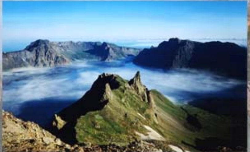
Lake Chon on Mt. Paektu.