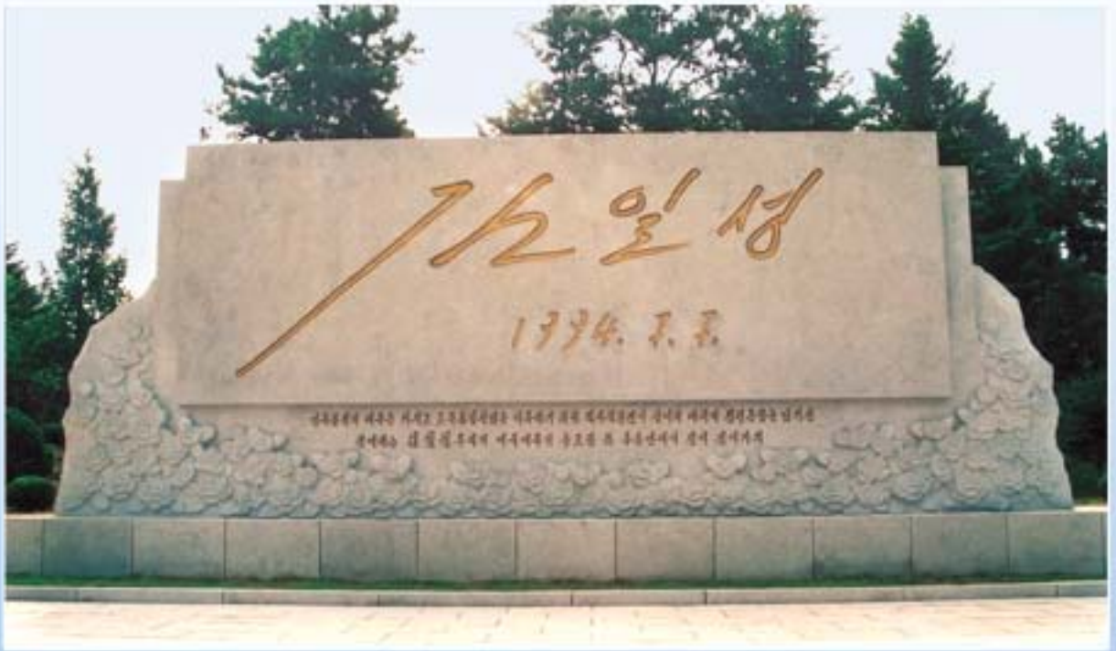
The monument bearing a model of the autograph President Kim Il Sung left on a document at the close of his life.