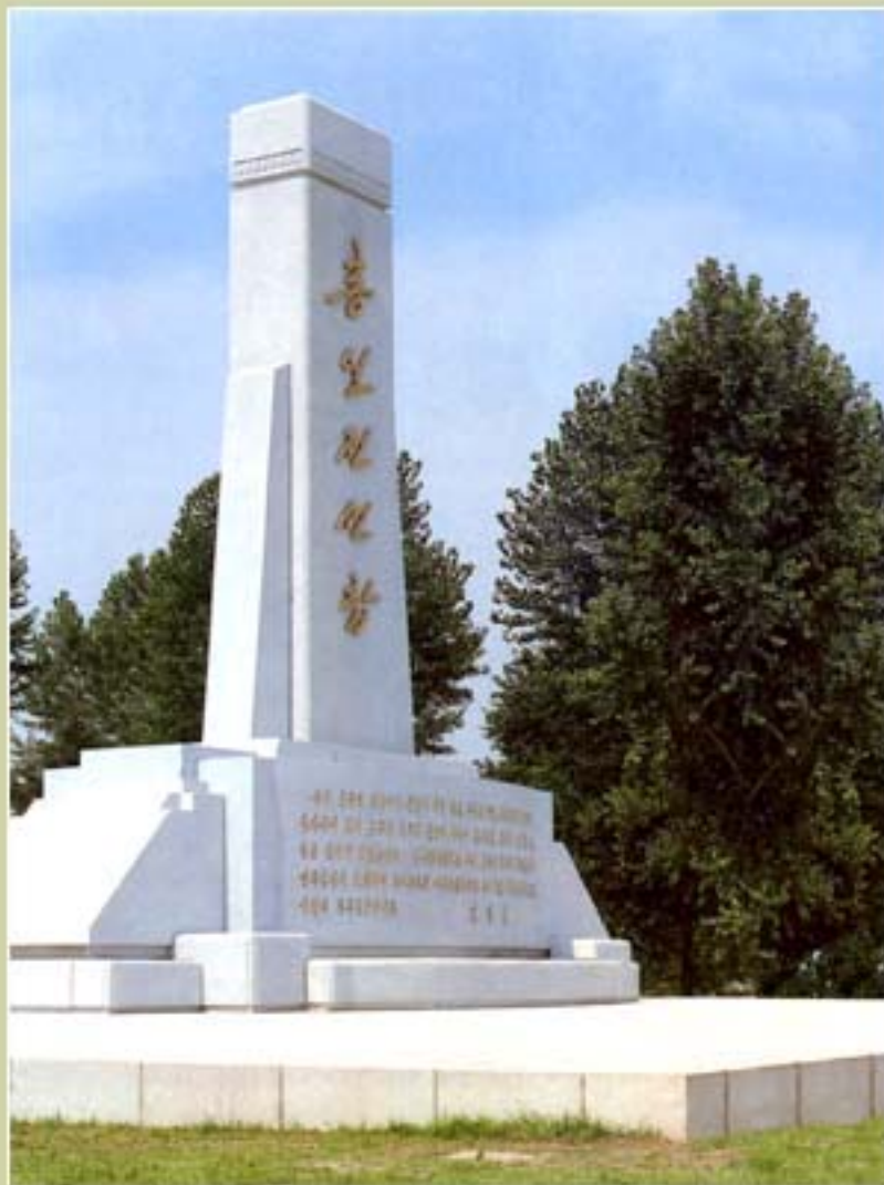
The Monument to the United Front.

Supreme Commander Kim Jong Un of the Korean People's Army, while inspecting Panmunjom in March 2012, saw the monument and said that Chairman Kim Jong Il had visited the place four times in his lifetime and seen to it that the monument was erected there to convey to all generations to come the noble patriotic intention of the President who had left his last autograph on the historic document for putting an end to the tragic national division and achieving the sacred cause of national reunification.