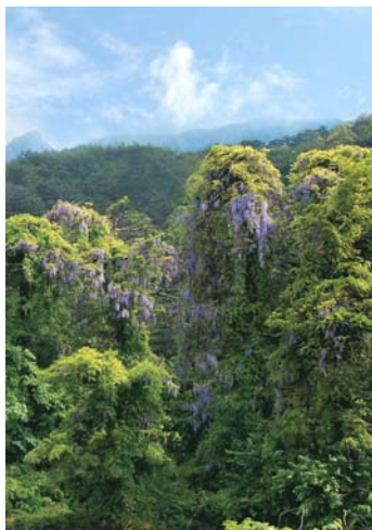
Back Cover: Arrowroot flowers in the Singye Valley