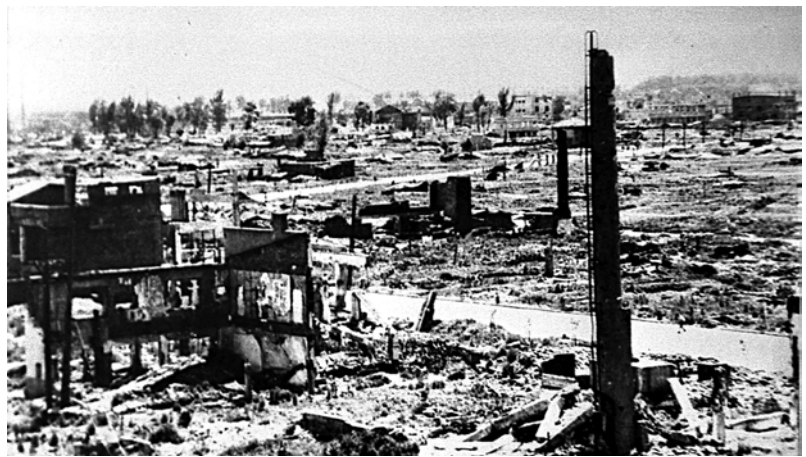
The central part of Pyongyang devastated in the US imperialists' bombing.

As long as eternal peace is not ensured on this land and imperialism keeps remaining on the earth, I will live with an