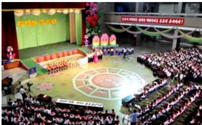
A celebration stage The Sun and Flowers held by members of the Korean Children's Union on the occasion of the 66 th anniversary of the union.

Now Korea is blessed with another peerlessly great leader, and the schoolchildren are happy under his care. One May day last