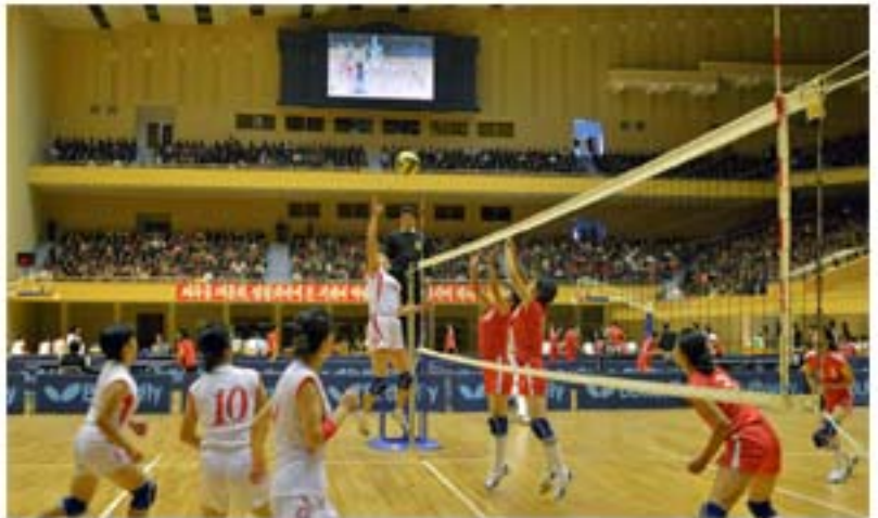
The inter-provincial games held in the Pyongyang Indoor Stadium in October 2013.

This stadium, refurbished in an up-to-date way on the occasion of the 65 th anniversary of the DPRK founding, is showing off its new appearance. All the architectural elements of its interiors are well harmonized in a beautiful, artistic way, drawing the visitors' admiration. The large hall for sports games