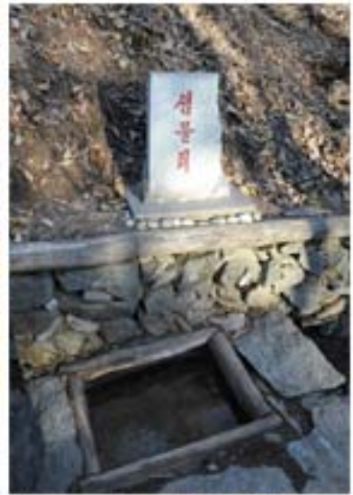
The site of a bivouac and a well.