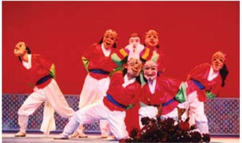
A scene from the Pongsan mask dance.

Along with the mask dance, the masks developed further in