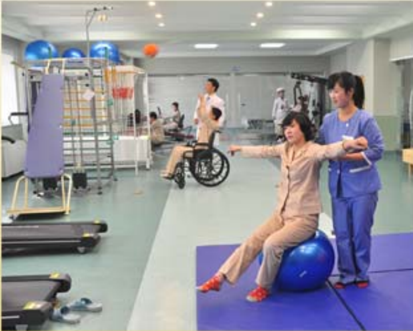
Disabled people go through treatment for functional rehabilitation.