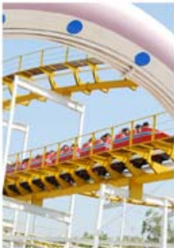
Back Cover: In the Mangyongdae Pleasure Ground