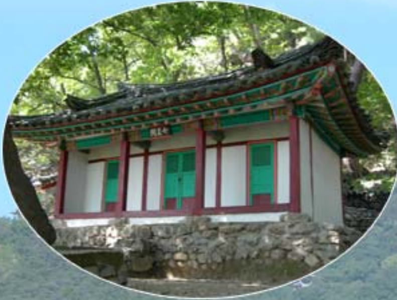
The Chilsong Pavilion.

mitage. The 500-odd-year-old tree was designated as State Natural Monument No. 19 for its curious shape and pedagogical importance. It is 18 m tall, its trunk being 5 m round at the breast height and its bottom girth 7.1 m. Its trunk forks off into three at the height of 6 m. Another monumental tree is Toona sinensis Roem. It has been growing since around the year 1900. It was designated as State Natural Monument No. 20 because it indicates the northern limit of the kind's distribution in the western region of Korea and it is of significance in conducting research into its specific features related to biology and botanical distribution and in giving an additional charm to the local scenery. It is 12 m high, its girth being 1.9 m at the bottom and approximately 1.5 m at the breast height. Speaking of the monumental ginkgo tree in Mt. Ryongak, it has grown for over 500 years along with the Pobun Hermitage boasting of its long history. At first three young ginkgo trees were planted, but in ►