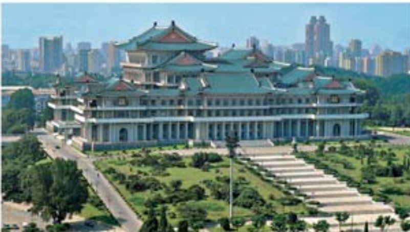
The Grand People's Study House stands prominently in the heart of Pyongyang.

Kim Jong Il liked best those officials who were addressed by people with the word "our" and spoke highly of them whenever he met them. In October 2003 he said, "People call those who are most devoted to their welfare 'our chief secretary,' 'our director,' 'our management board chairman,' and also call a neighbourhood unit head taking good care of them with the prefix of 'our.' The word 'our' is really a good expression with deep meaning. People and soldiers call their superiors with or without the prefix of 'our' with a different implication. 'Our' is not an official or honorary title. It is the highest title and appreciation given by the people and soldiers to the officials working with de- ▶