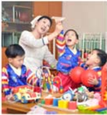
Front Cover: Children grow happily at the Pyongyang Baby Home