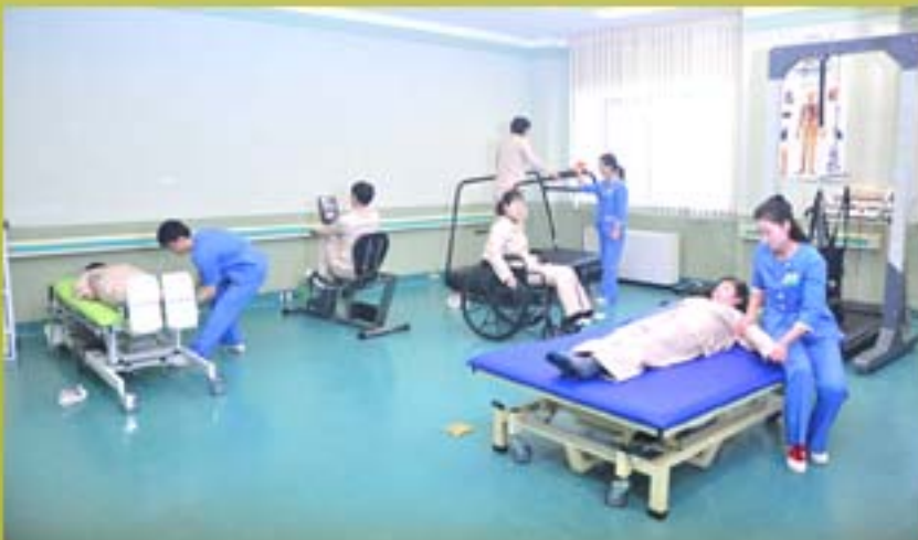
Manual treatment and different kinds of exercises are applied.