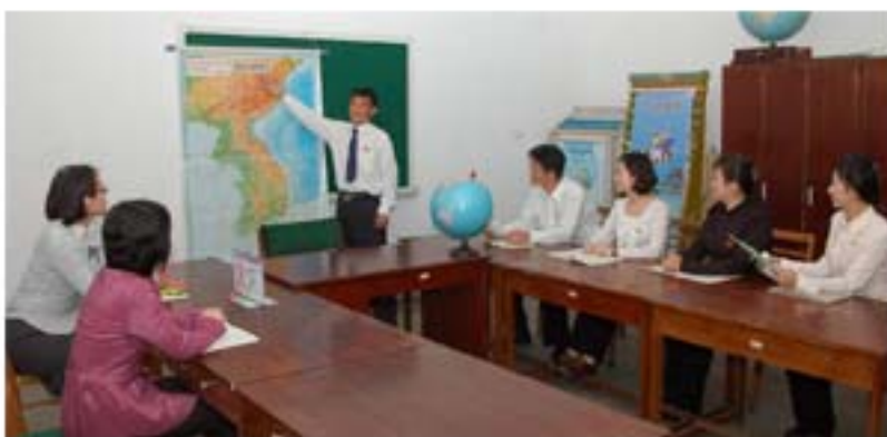
Teaching experience is swapped.

took first place at the national symposium on teaching methods by presenting several new teaching methods including “An Effective Method for Correct Teaching of Concepts and Principles in Mathematics.” The qualifications of all the teachers improved and many teachers won the title of October 8 Model Teacher. All the teachers of the school received the Certificate of Registered New Teaching Method and the Certificate of Original Laboratory Apparatus and