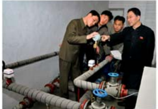
Geothermal-based cooling and heating system gets more functional.

The factory decided to substitute the electric cooling and heating equipment in the production field and offices with geothermal one. It was not an easy job to tackle as the factory had no experience and few tech-