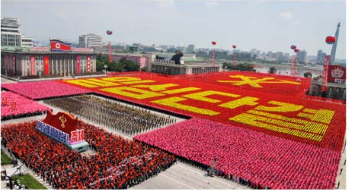
The military parade and Pyongyangites' demonstration in celebration of the 60 th anniversary of the victorious Fatherland Liberation War display the single-hearted unity of the Workers' Party of Korea and the masses of the people (July 2013).

► votion to them and an expression of respect, love, trust and affinity for the true servants of the people. The word 'our' reflects vividly the true nature of our society where the national leader, the Party and the popular masses are united together in perfect harmony and all its people trust and love each other."