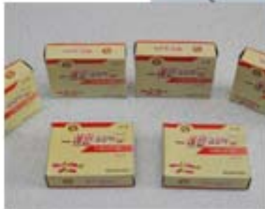
Developers of the hemin capsule and boxes of the products.

time of pregnancy, delivery and bleeding—in a short period of time and has no side effects. The demand for the medicine is increasing as it is effective in treating iron-deficient anaemia that troubles growing children and elderly people. The medicine also fights against inflammation, stress and hepatic virus and lowers the blood pressure, and is in wide use for treating porphyria as well. It was presented to the 2013 9 th Pyongyang Autumn International Trade Fair and was favourably commented upon.