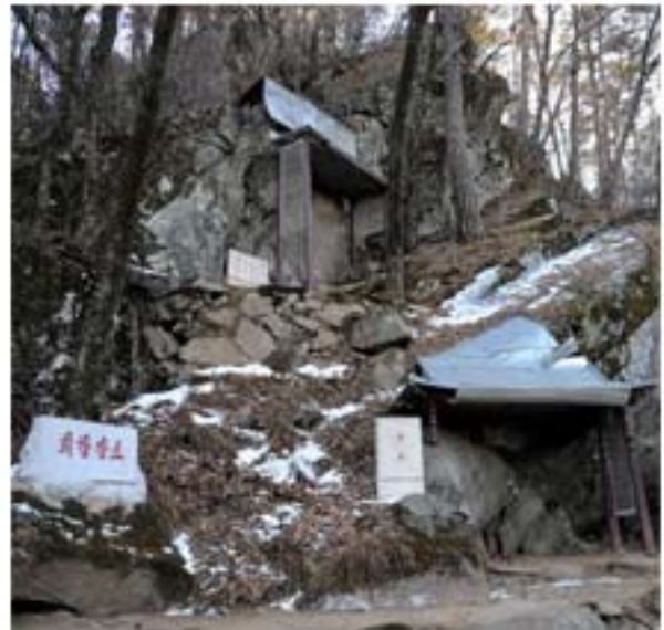
An old meeting place.

Ubiquitous in the area are slogans and statements written on tree trunks or rock faces; some typical ones are "Long live the three good lucks of our nation—Heaven-sent illustrious commander General Kim Il Sung, Commander of Mt. Paektu Kim Jong Suk and their successor Paektu