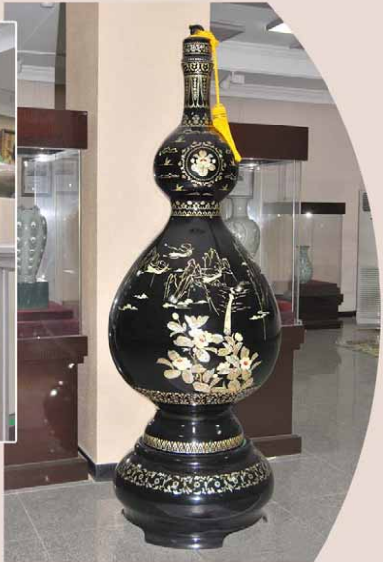
The lacquered vase “Eight Fairies of Mt. Kungang and Magnolia.”

► Korean lacquer art developed into the lacquered mother-of-pearl workmanship. A lacquered mirror inlaid with processed shells, amber and beads presumed to date back to the 8 th century has been unearthed in South Kyongsang Province and this shows the development of the lacquered mother-of-pearl workmanship at the time.