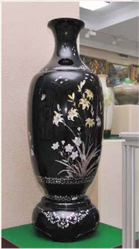
The lacquer work “Lily-Patterned Flower Vase.”