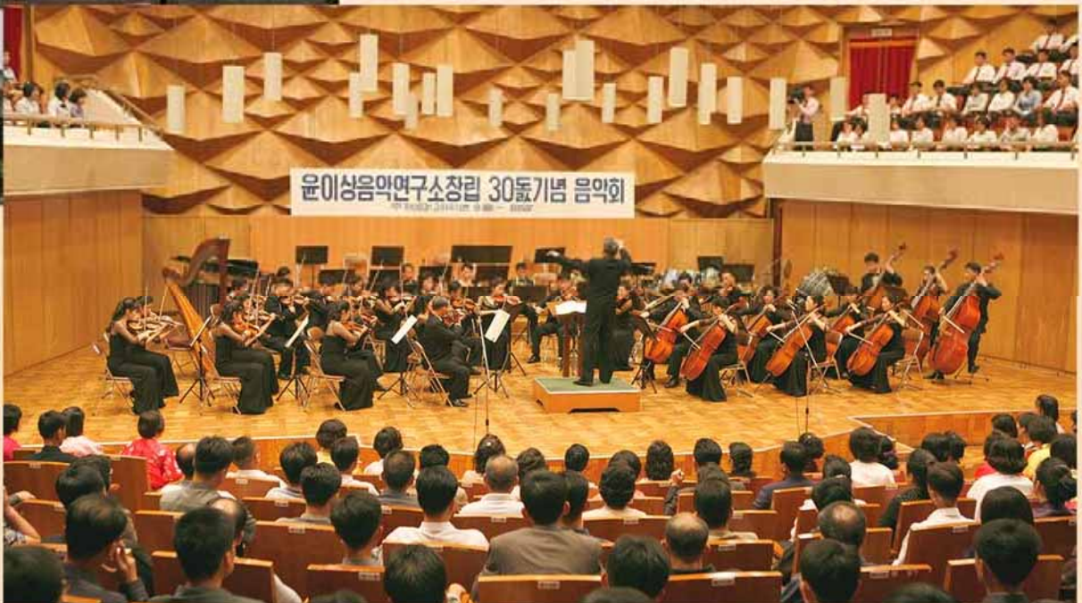
A scene from the concert held in September 2014 in commemoration of the 30 th founding anniversary of the Yun I Sang Music Institute.