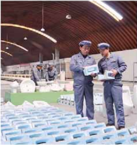
The sanitary ware workshop.