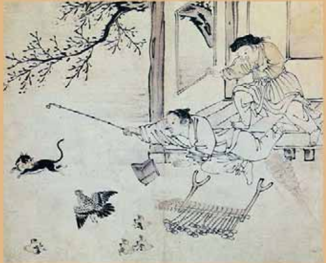
Shooing the Cat Away.

vellous show of the humble and honest character of the peasantry that was bound by the feudal caste. By giving a deep-going portrayal of the expressions and movements of each of the figures of different social standings through an aspect of everyday life, the picture is well indicative of the irrationality of the caste of the feudal society and the unfair system of human relations. The persuasive composition, simple description of shapes, treatment of the environment based on smart strokes and other qualities of the painting are helpful in understanding the superiority of the Korean painting.