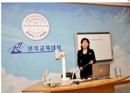
At a distance-learning lecture.

Meanwhile, as there are special rooms for dis- ▶