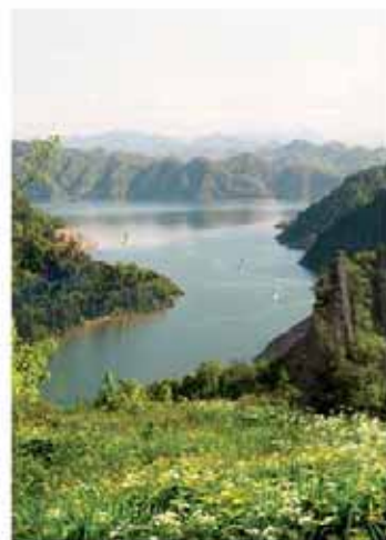
Back Cover: The shores of Lake Suphung