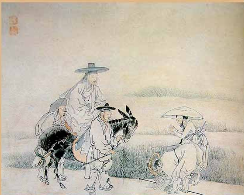
The Nobleman and the Peasants.

One of his typical works is The Nobleman and the Peasants . The picture shows a nobleman traversing a country road on a donkey on a summer day and a couple of peasants making a polite bow to the nobleman. The nobleman with a horse-hair hat on looks down at the peasants proudly and arrogantly; a sly-looking servant pulls back the reins of the horse to stop it for a moment; another servant with entangled hair wears a wry smile, carrying a heavy burden on his back behind the nobleman. All these funny components are a mockery of the nobleman's show of power. Meanwhile, the male peasant makes a bow with his head nearly touching the ground, and his wife greets with her hands carefully closed together. This is a mar-