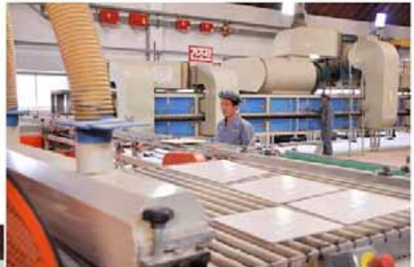
The tile workshop.