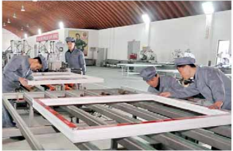
The plastic sash workshop.