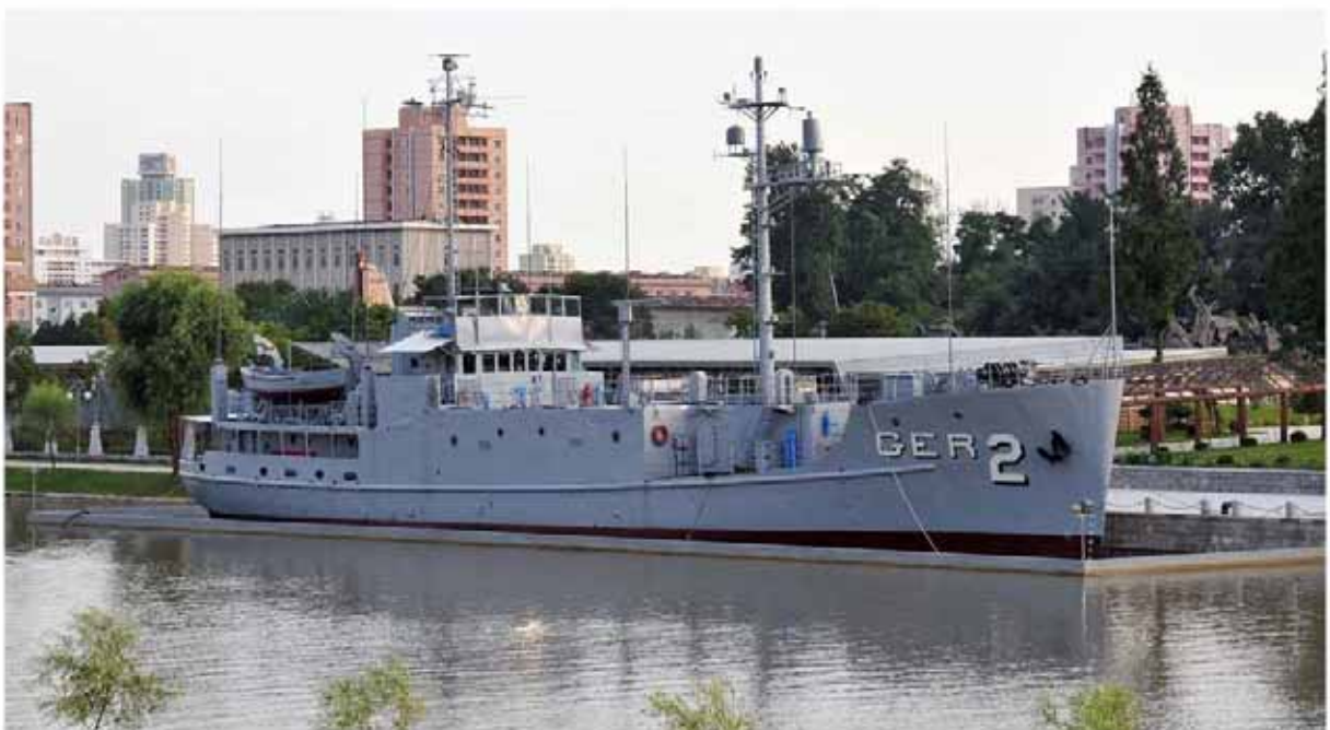
The US's armed spy ship Pueblo captured by the KPA navy men.