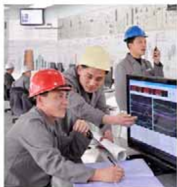
Front Cover: The Namhung Youth Chemical Complex builds on its sci-tech foundation for increased production