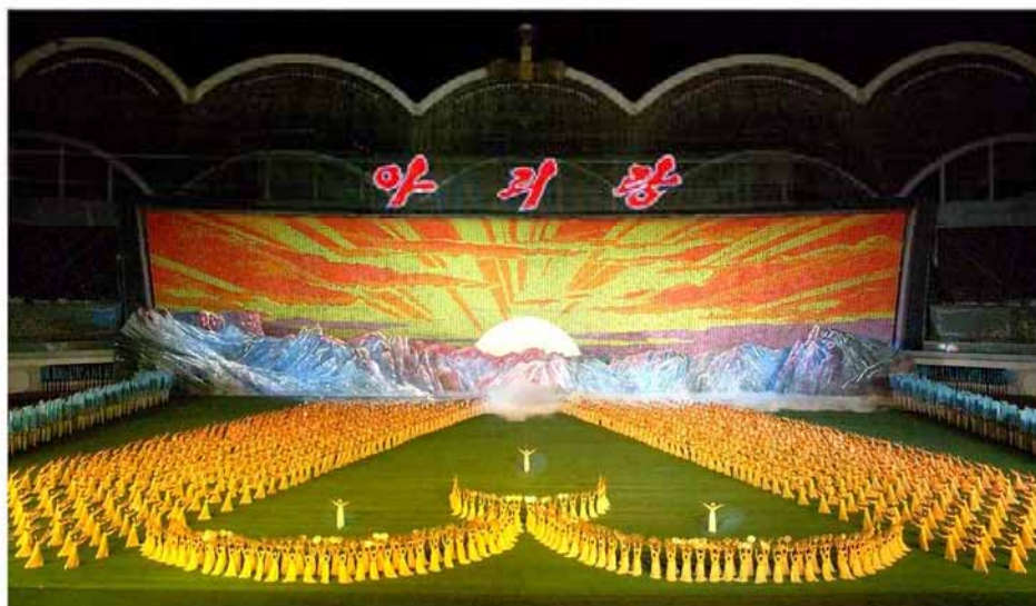
A scene from the mass gymnastics and artistic performance Arirang , a Kim Il Sung Prize winner.