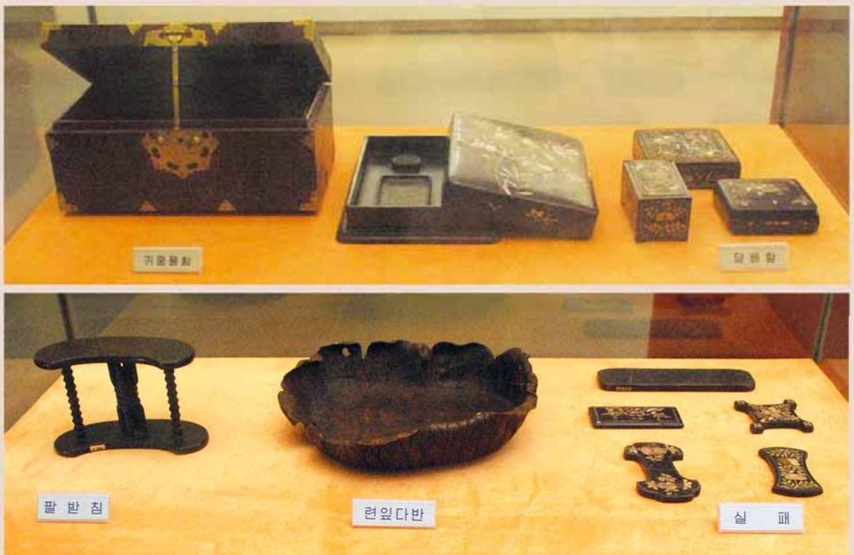
Old lacquered artefacts.

In the periods of Palhae (late 7 th century–early 10 th century) and Late Silla (676–935), the