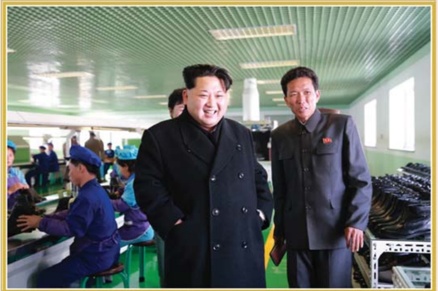
The respected Kim Jong Un gives field guidance at the Wonsan Footwear Factory in November Juche 104 (2015)