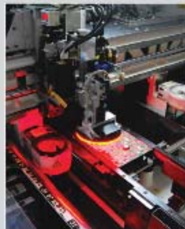
Phurunhanul Electronics JV Co Ltd

OF THE DEMOCRATIC PEOPLE'S REPUBLIC OF KOREA