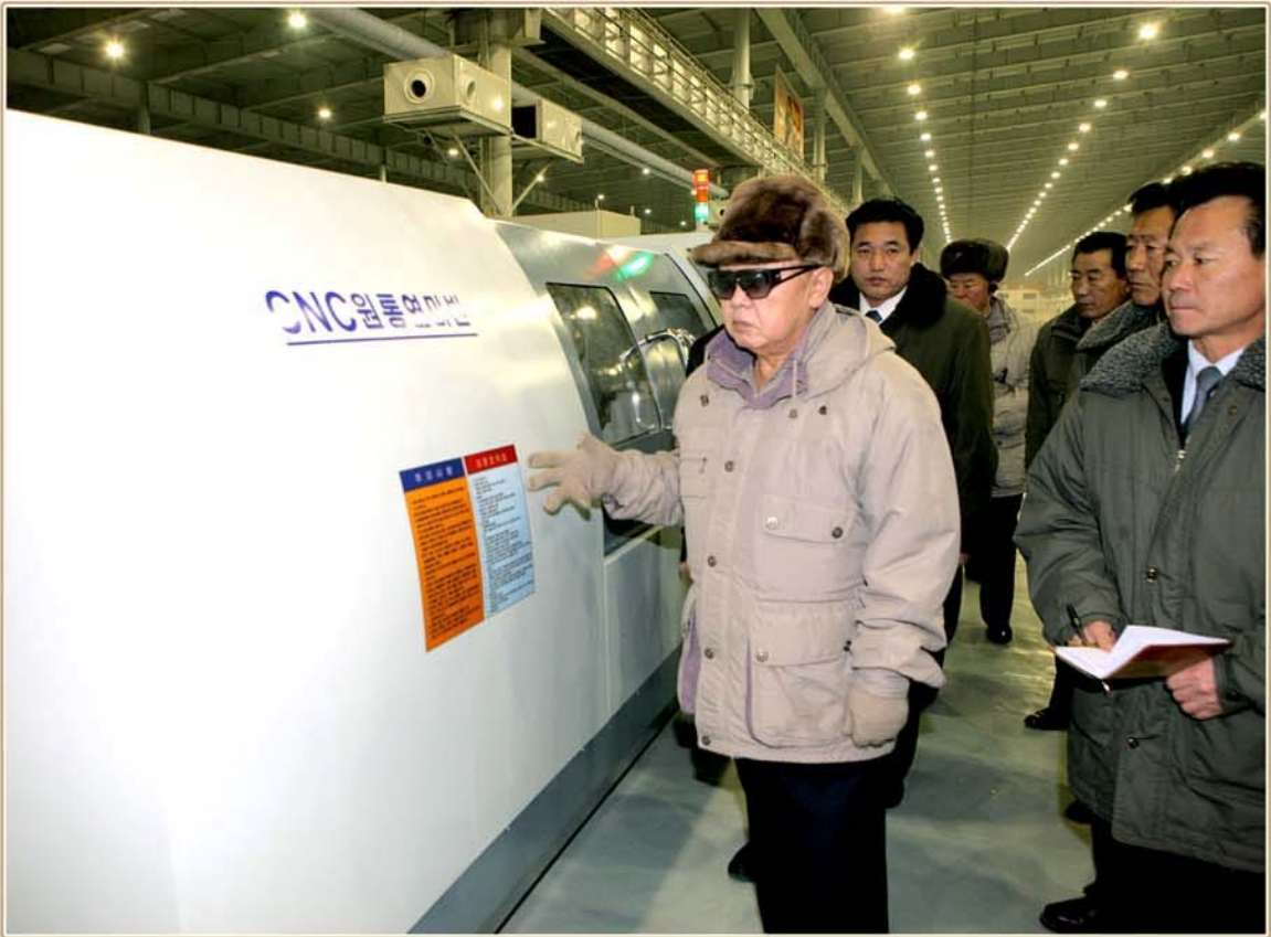
Chairman Kim Jong Il sees new models of CNC machine tools in December 2010.

T HE DEMOCRATIC PEOPLE'S REPUBLIC of Korea's cause of building a socialist power is suffering all sorts of difficulties due to atrocious anti-DPRK schemes of hostile forces. Despite the difficulties the Korean people are advancing vigorously on the strength of their own resources, their scientific and technological potentialities.