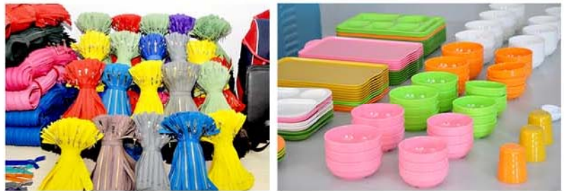
Different kinds of zips and melamine resin products.

phisticated to save time and labour while checking the quality of zips accurately. The annual production capacity can fully meet the national demand for zips needed for production of necessities of life.