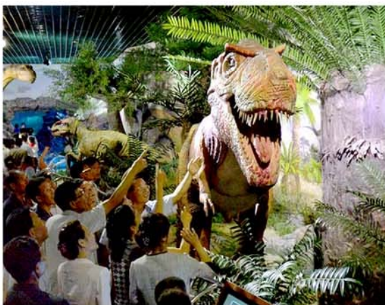
Working people and schoolchildren look round the Mesozoic hall.

Saying that the animal ancestor of the human being was a monkey with two legs and the