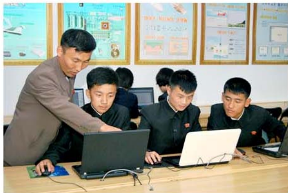
The IT circle.