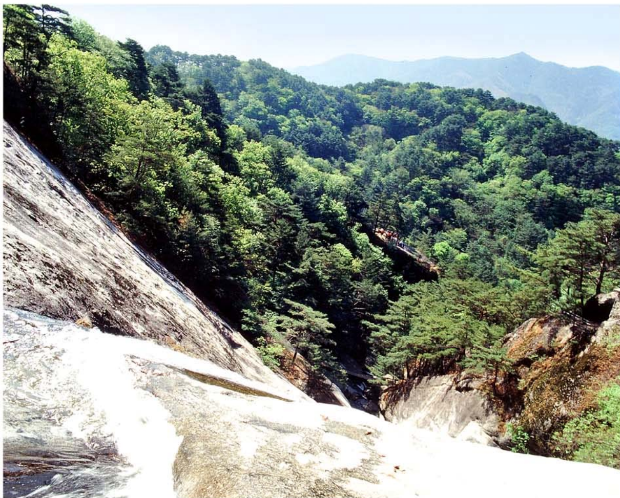
On the Manphok Rock.