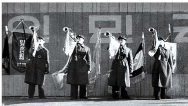
Scenes of the first military parade of the Korean People's Army in celebration of its development into regular revolutionary armed forces in February 1948.

The leader Kim Il Sung, who had defeated by guerrilla warfare the Japanese imperialists—who were swaggering as "leader of Asia"—and accomplished the historic cause of national liberation, regarded the construction of regular armed forces as a vital problem related to the construction of a new Korea and the future of the nation and accelerated the building of a regular army purposefully. In 1945 the Pyongyang School was established and in 1946 the Central Security Cadre School was founded. The Marine Security Cadre School and the Flying Corps were set up in 1947. Thanks to the energetic guidance of the leader who paid deep attention to the training of military and political officers, founding of different services, arms, special units, and deciding military ranks and uniforms, and developing Korea's