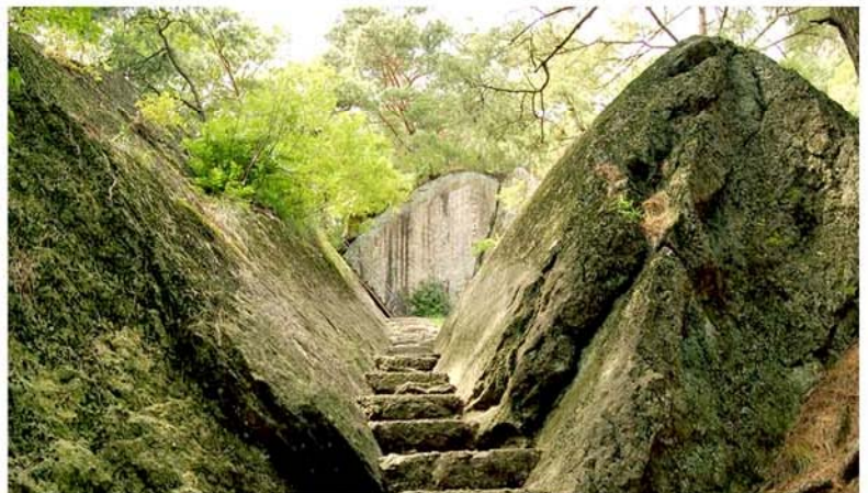
The road to Ssang (couple) Rock.