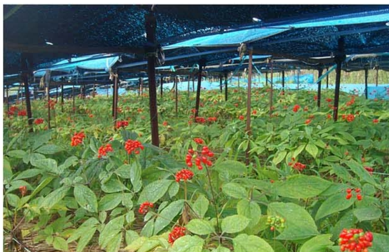
An insam plot.

Insam was widely known as an excellent medicinal material from long ago and used as the best tonic. It has good effects in strengthening restorative and immune functions, stimulating the central nervous system, improving the hematogenous function and the digestion and absorption of foods. It also has nice effects on metabo-