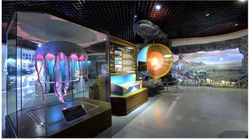
The general hall of ancient life.

▶ modern man was born through the stages of Pithecanthropus, Palaeolithic man and Neolithic man, the guide concluded that lots of fossils of mankind and their stonework as well as mammal fossils were discovered in the Taedong River basin centring Pyongyang, vividly proving that Korea is one of the cradles of