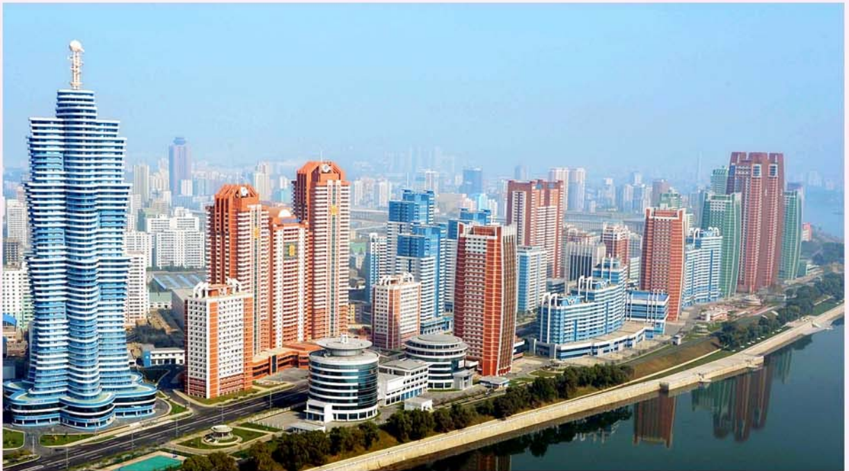
The Mirae Scientists Street.