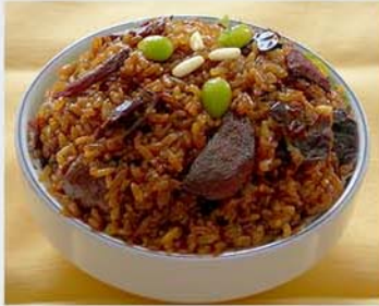
Yakbap (sweet rice).