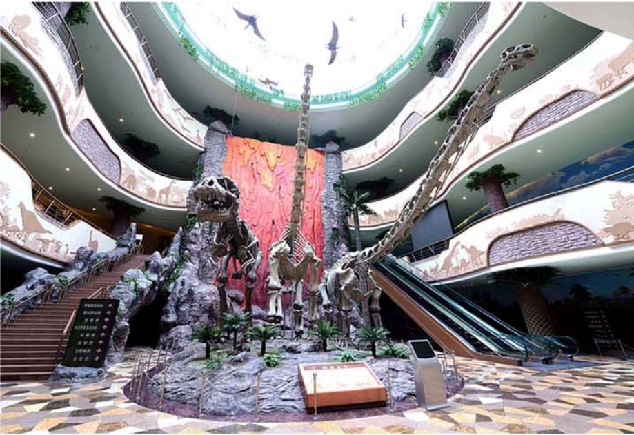
The central hall.

► knowledge of stars. One of the editions was about a meteorite that fell down in a country in March 1976.