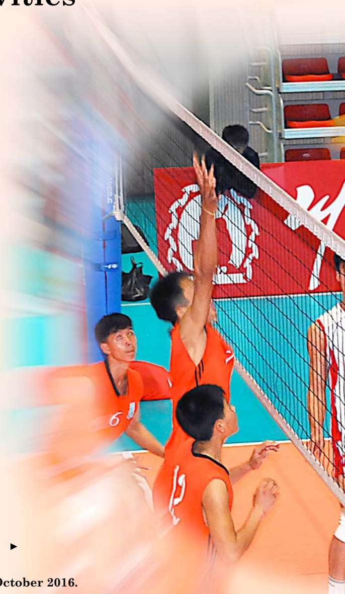
Scenes from the 13 th People's Games in October 2016.

In the tennis event, the South Phyongan Province team was ranked high. Having learned a lot of experience and lessons from the National Inter-provincial Games-15, they achieved an unprecedented success at the last People's Games. The coach organized the team with industrial and farm workers from the lowest echelons who had practiced tennis while engaged in everyday sports activities. And he trained them strenuously. He concentrated on the