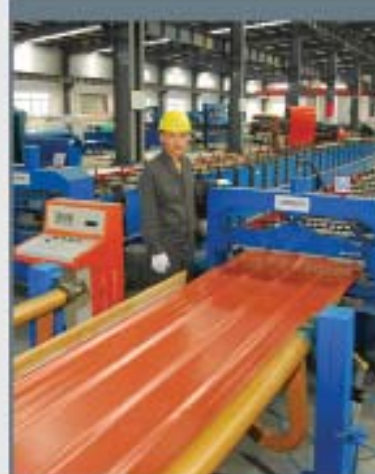
Chollima General Building-Materials Factory