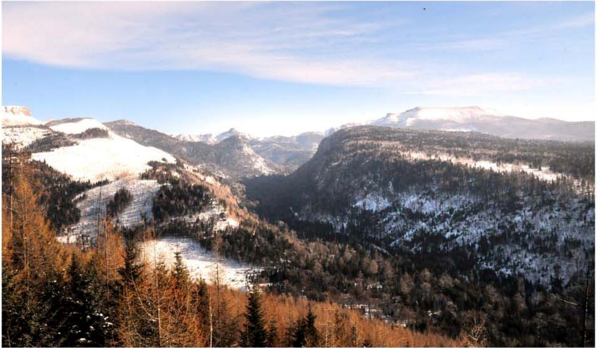
Terrain Features Appropriate to a Natural Fortress.