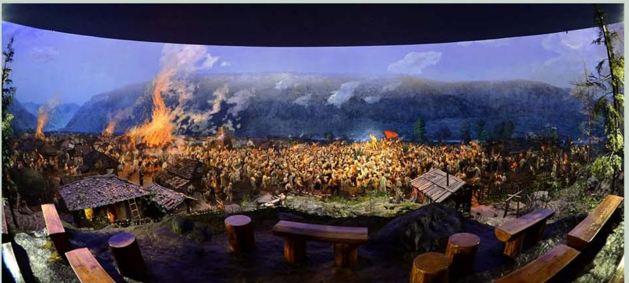
A large-scale panorama showing the Battle of Pochonbo.