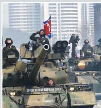
Front Cover: Military hardware marches displaying their manoeuvrability and strike capability