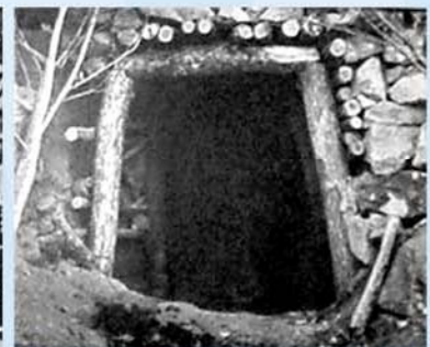
KPA soldiers fight active positional defence battles based in tunnels.