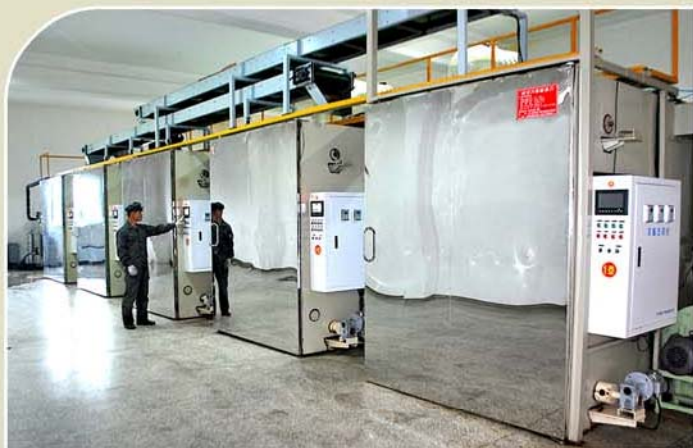
The mushroom substrate fermenting facility.