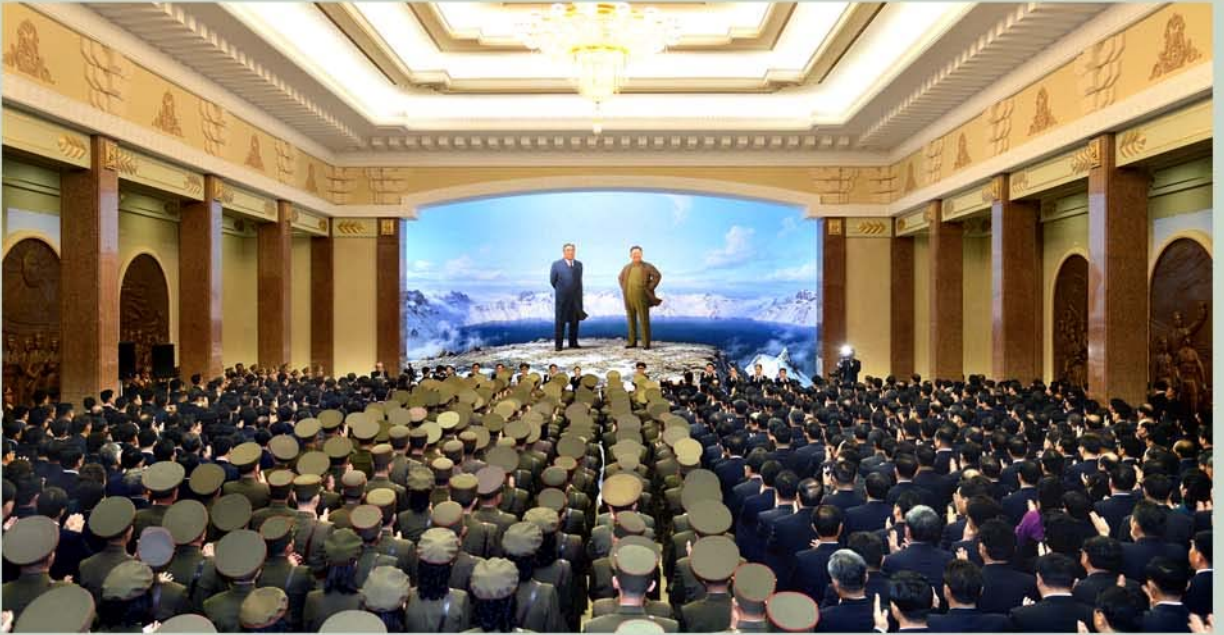
The opening ceremony of the Korean Revolution Museum in March 2017.

► the periods of the anti-Japanese revolutionary struggle, the building of a new Korea, the Fatherland Liberation War, and the laying of the foundation of socialism. Spectacular in particular are two halls with large-sized panoramas. One of the panoramas depicts the Battle of Pochonbo which the Korean People's Revolutionary Army waged after advancing into the border area of Korea, displaying the spirit of resistance that Korea was not dead but alive and convincing the Koreans that they would surely win if they fought against the Japanese aggressors, during the anti-Japanese armed struggle. The other depicts the Battle on Height 1211 that shows how the Korean People's Army defeated the US imperialist aggressors