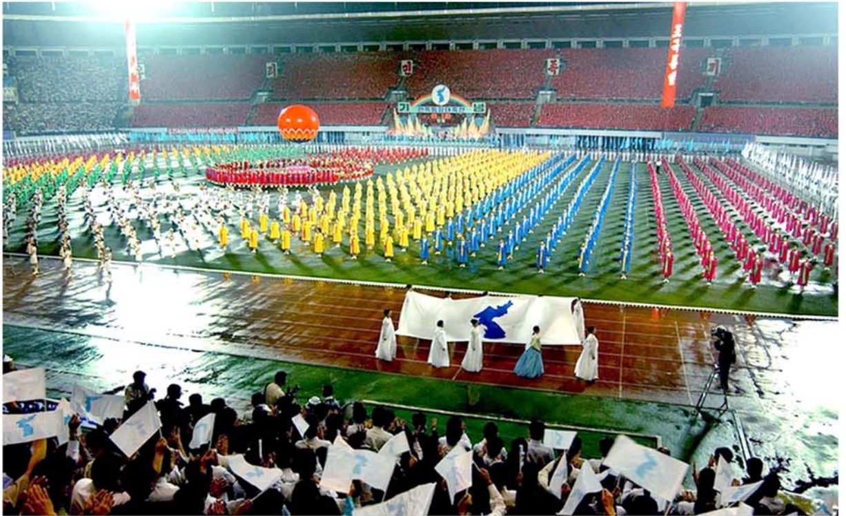
The venue of the opening ceremony of the grand national reunification festival held in 2005 on the 5 th anniversary of the publication of the June 15 North-South Joint Declaration.

► were held pan-national rallies involving the north and the south and overseas Koreans. On August 15, 1990 a pan-national rally for peace and reunification of Korea was held splendidly at Panmunjom. Afterwards, there took place a starting ceremony of the Paektu-Halla grand march for reunification, a reunification-oriented football match between the north and the south and a pan-national reunification concert. And a unified team was organized with table tennis players of the north and the south to take part in the World Table Tennis Championships, and female players of the team won its women's team event. The Pan-National Alliance for Korea's Reunification (Pomminryon), a standing national united front body, and the Pan-National Alliance of Youth and Students for Korea's Reunification (Pomchonghangnyon) were formed, and their branch organizations came into being in the north and the south and many regions abroad.