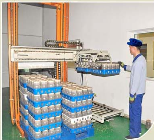
The cultivation area.