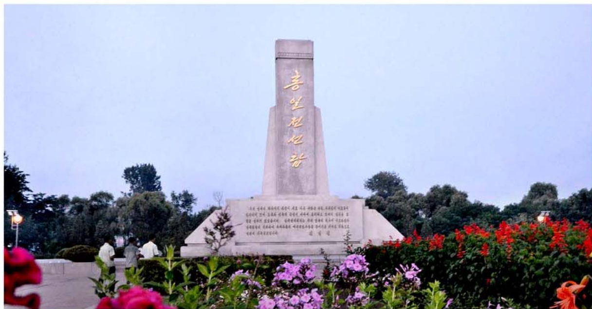
The Tower of the United Front.

Under the wise leadership of the President there