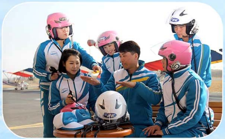
Flying skills are honed.