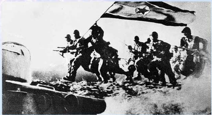
KPA soldiers switch over to the counteroffensive as ordered by Supreme Commander Kim Il Sung in his radio address.

In early 1952 the ruling circles of the US were continuing to feed troops into the Korean front while