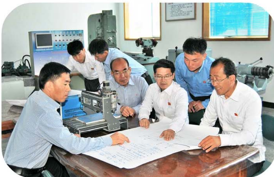
A consultation about design and manufacture of facilities for experiments and practice.

A national university teachers' contest of 3- and 4-D designs held in September that year also