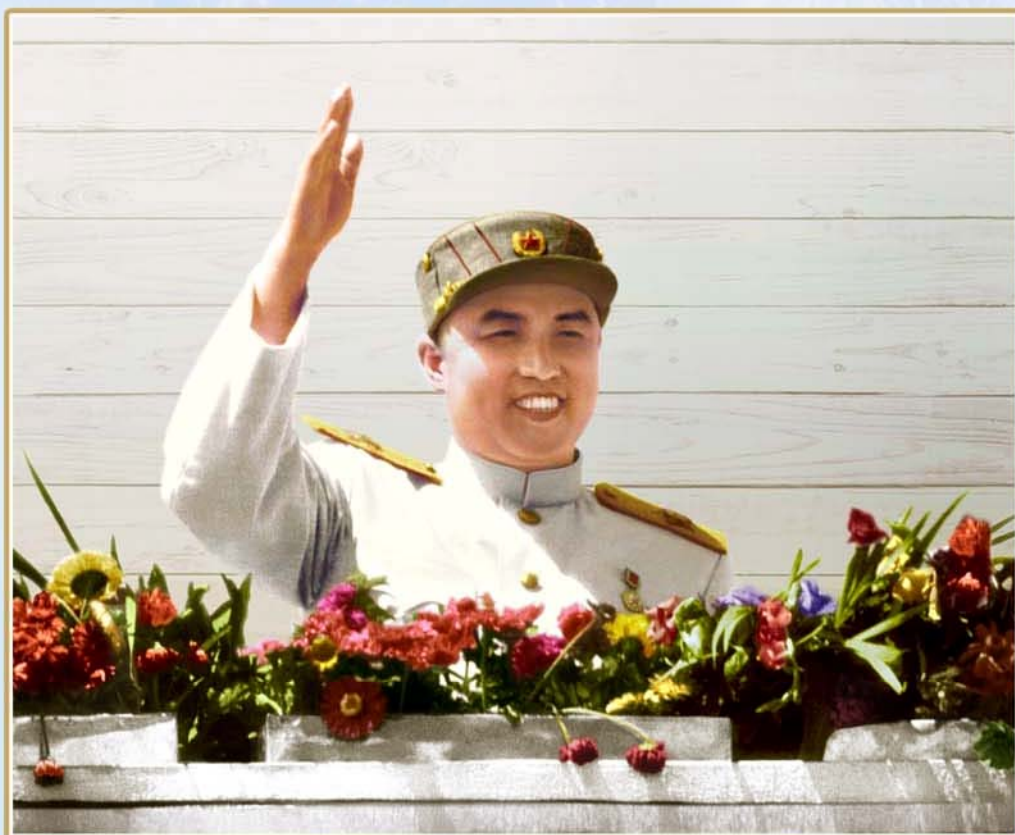
Kim Il Sung acknowledges enthusiastic cheers of officers and men of the heroic Korean People's Army and the people.

T HE FATHERLAND LIB-eration War in the 1950s was an all-people resistance put up by all the army and people of Korea against the US imperialist aggressors. Lots of fierce battles were fought to defend even an inch of land, a single tree and a blade of grass. The unprecedented war finally ended in victory for the Korean people who fought the aggressors even at the cost of their blood and lives. The spiritual mainstay that supported the Korean army and people during the war was their firm conviction that they would win without fail as they were led by Supreme