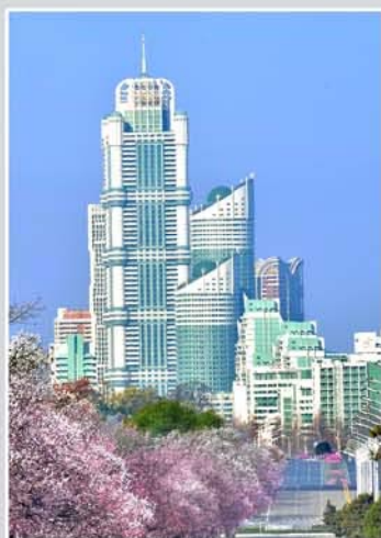
Back Cover: Ryomyong Street in spring