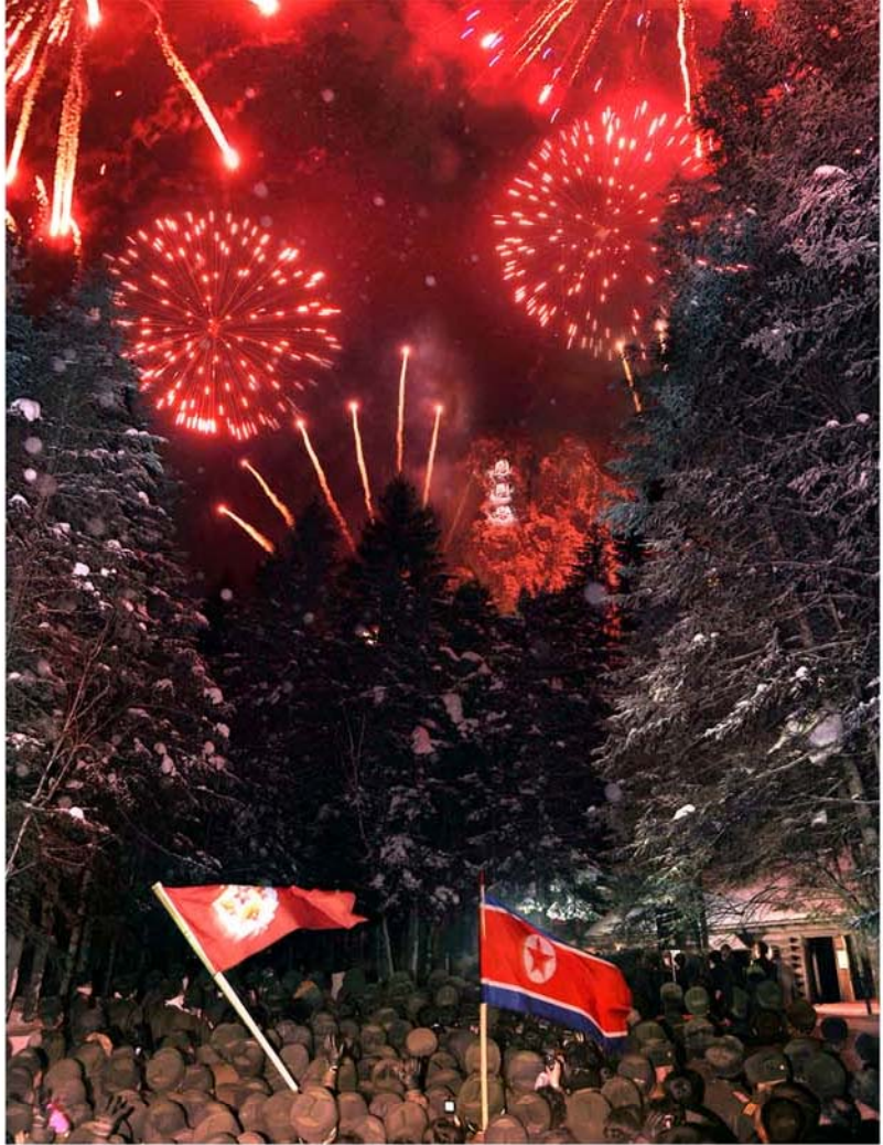
Nocturnal View of Firework Display in February.