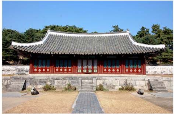
The Taesongjon of the Koryo Songgyungwan.

Koryo Songgyungwan, located in Pangjik-dong, Kaesong, was the highest institution of education in the period of Koryo (918–1392), a feudal state. It has the longest history of its kind in the world. In 992 Kukjagam, the highest national institution of education, was set up in Kaegyong, the capital of Koryo. In 1087 it moved into Taemyong Palace, a detachment of the royal palace, built in Kaegyong in 1047. It was reorganized as Songgyungwan in 1298, as Songgyungwan in 1308, as Kukjagam in 1356 and finally as Songgyungwan in 1362. The buildings of the