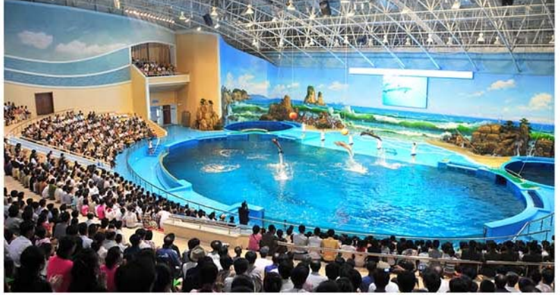
The Rungna Dolphinarium.