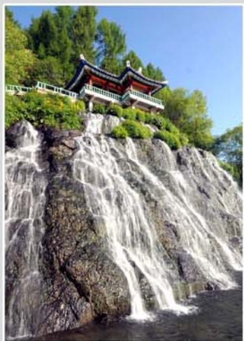
Back Cover: The Rimyongsu Cascade