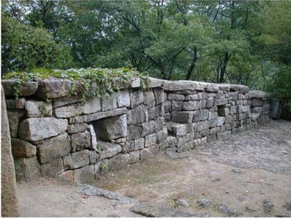
The Taehungsan Fort.