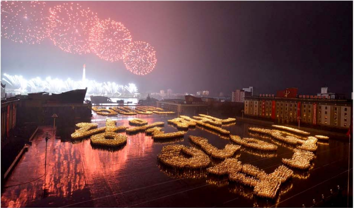
A torchlight procession of the young vanguard, “Young People, March Forward after the Great Party!” (October 2015).