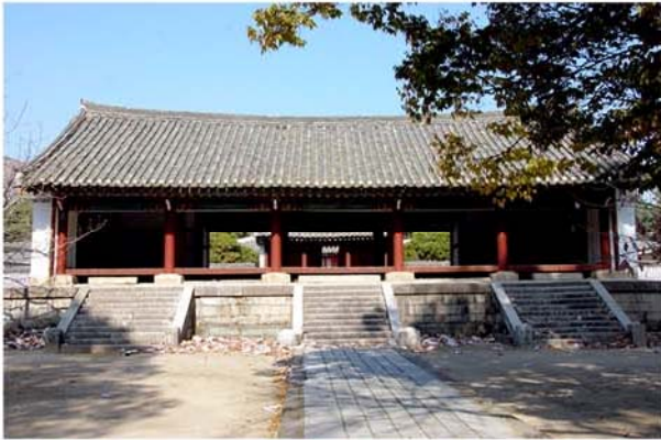
The interior of the Myongryundang of the Koryo Songgyungwan.

Kon was registered in the UNESCO list of world cultural heritage as it is a valuable historical and cultural relic carrying the history of the building of the unified state.