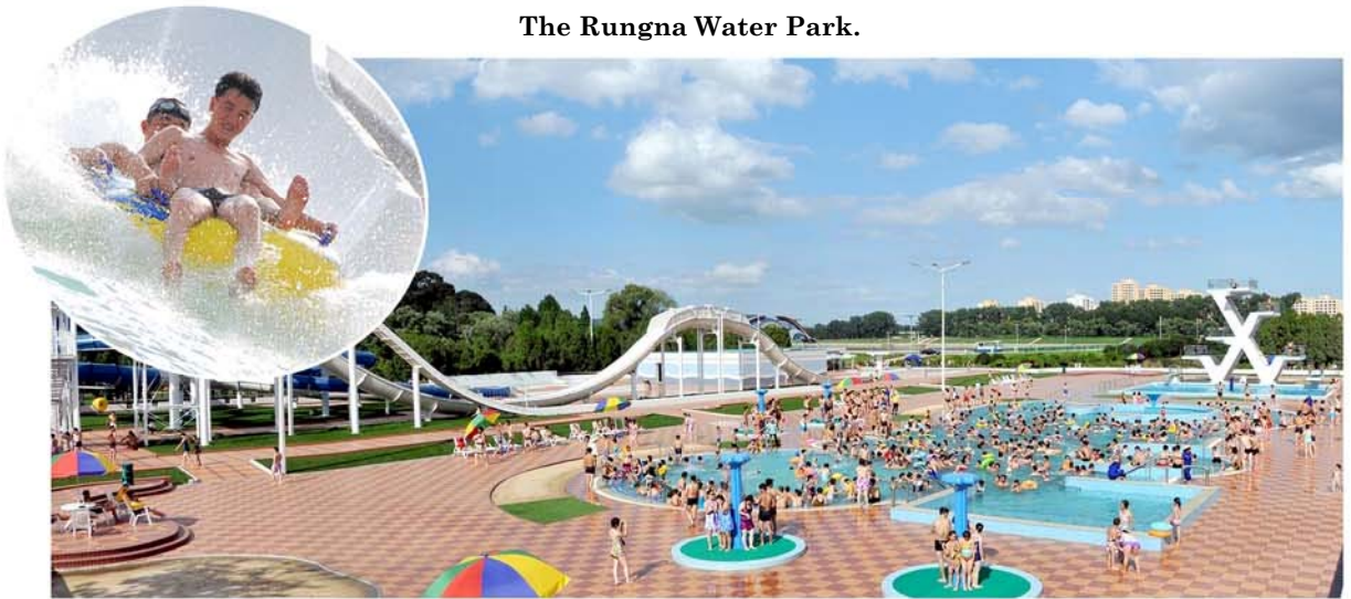
The Rungna Water Park.

I T IS AUGUST WHEN THE sun is scorching the earth. The Rungna People's Pleasure Ground, located in Rungna Islet in the Taedong River that meanders past the Chongnyu Cliff in Moran Hill, is one of the most popular resorts in Pyongyang. One of these days we visited the ground for news coverage.