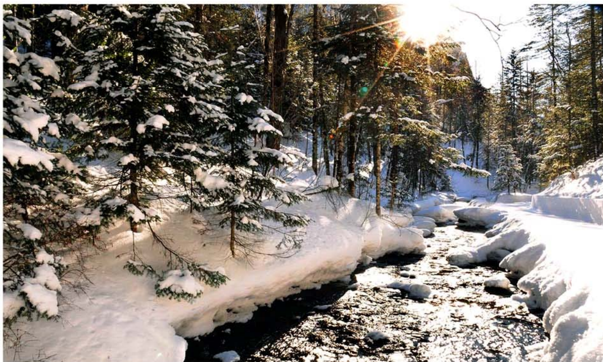
Sobaek Stream Flowing All the Year Around.