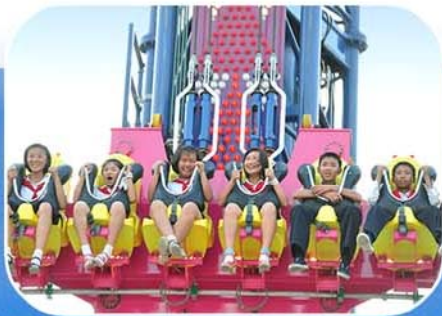
At the Rungna Amusement Park.