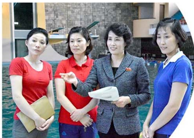
Students polish their performing skills.

W HEN YOU GO TO THE swimming pool of the Changgwang Health Complex on the bank of the scenic Pothong River in Pyongyang, you can see little children performing beautiful synchronized swimming movements to the tune of cheerful music. Reminiscent of dancing water flowers, they are pupils of the juvenile sports school attached to the Changgwang Health Complex. The well-furnished school attracts many children aspiring to be synchronized swimming players.