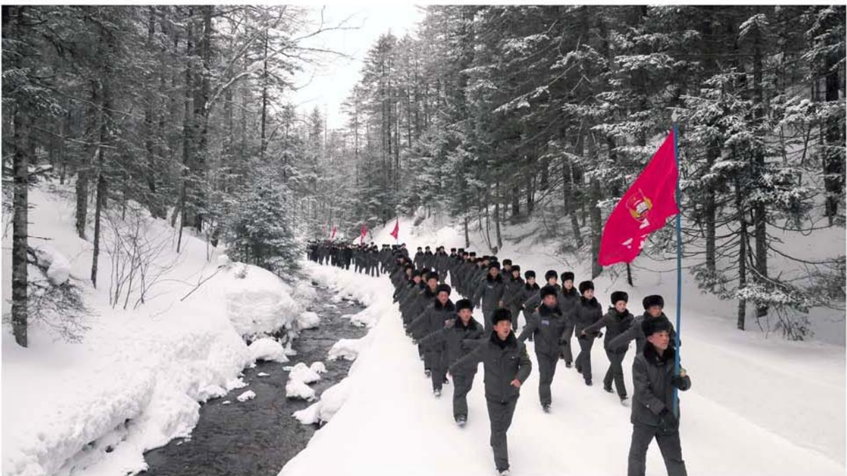
Endless Stream of Visitors.