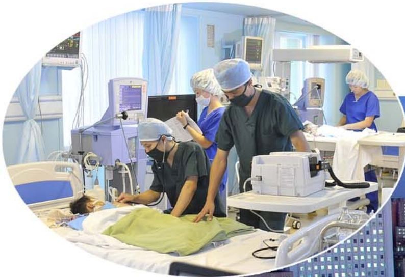
Doctors of the cardiovascular surgery department give an intensive treatment.

For successful operation of a child’s heart which is as small as an egg, they made a model the same size as a person’s chest and installed an embroidering tambour which was the same size as a child’s heart. Using the model, they trained strenuously all the year round to make stitching as accurate, swift and flexible as possible. It was by no means easy ▶