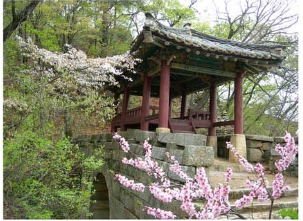
The north gate of the Taehungsan Fort.