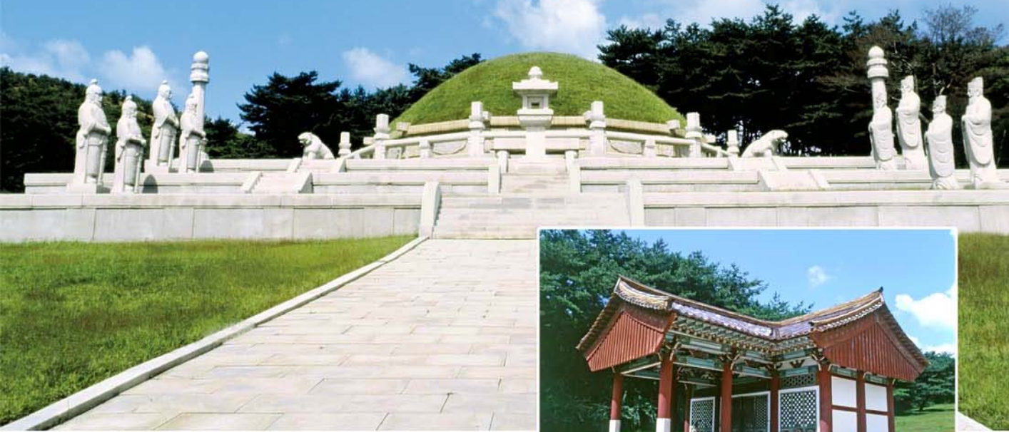
The Mausoleum of King Wang Kon and the memorial house.