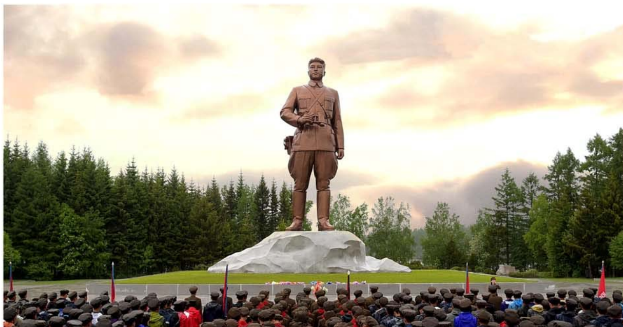
A statue of President Kim Il Sung on the shore of Lake Samji.

W HEN KIM IL SUNG declared an armed struggle against the Japanese imperialist aggressors, his nation's power was fairly trifling. It was useless to mention Korea's military capabilities. At the time the imperialist Japan, occupying Korea in a violent way, was a newly emerging military power which was on its straight road to expansion. It was a formidable aggressor armed to the teeth with modern weapons and combat equipment.