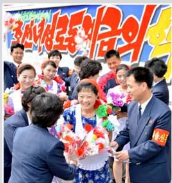
Front Cover: Model workers of the Pyongyang Kim Jong Suk Textile Mill are leading the Mallima speed movement