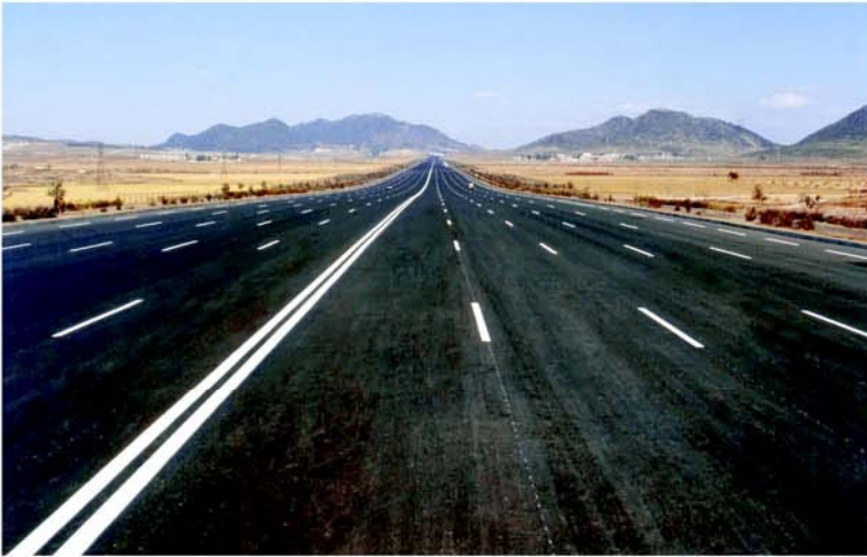
A section of the Youth Hero Road.