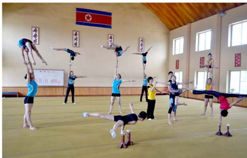
Sportspersons intensify physical training and polish technical movements.