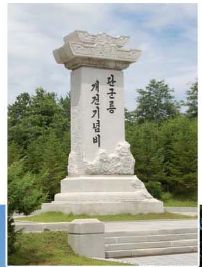
The Mausoleum of King Tangun and the Monument to the Reconstructed Mausoleum of King Tangun.

In September 1993 the President inspected the relevant site and designated a spot where a mausoleum was to be rebuilt for Tangun, and on July 6 next year, the last year of his life, he examined the final plan. ▶