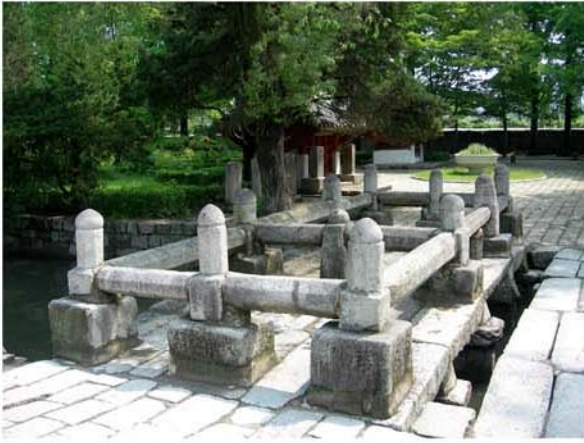
The Sonjuk Bridge.