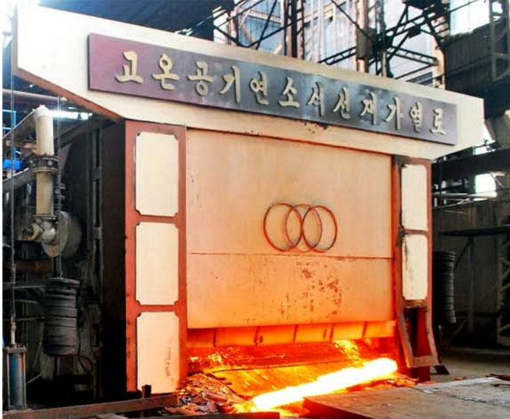
A high-temperature air combustion-style wire rod heating furnace.