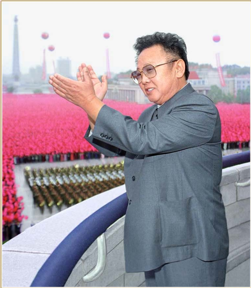
Chairman Kim Jong Il waves in return for the people's enthusiastic cheers in October 2000.

► State and make sure that better bases for their recreational and leisure activities were built across the country. The Koreans never witnessed any reduction in popular policies while invariably benefiting from universal, free compulsory education, free medical care, the social security system, the recuperation and relaxation system, etc. And the Pyongyang Grand Theatre, the National Theatre, the Taedongmun Cinema, the Central Zoo and other centres for cultural activities were renovated; lots of cultural facilities were newly built or renovated including the indoor swimming pool of Kim Il Sung University