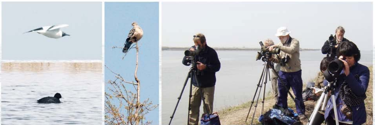
A joint survey of migratory birds is made.