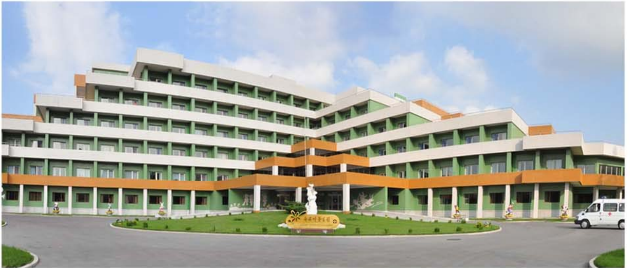
The Okryu Children's Hospital.

The Munsu area has turned into a hospital village.