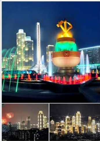
Back Cover: Ryomyong Street at night