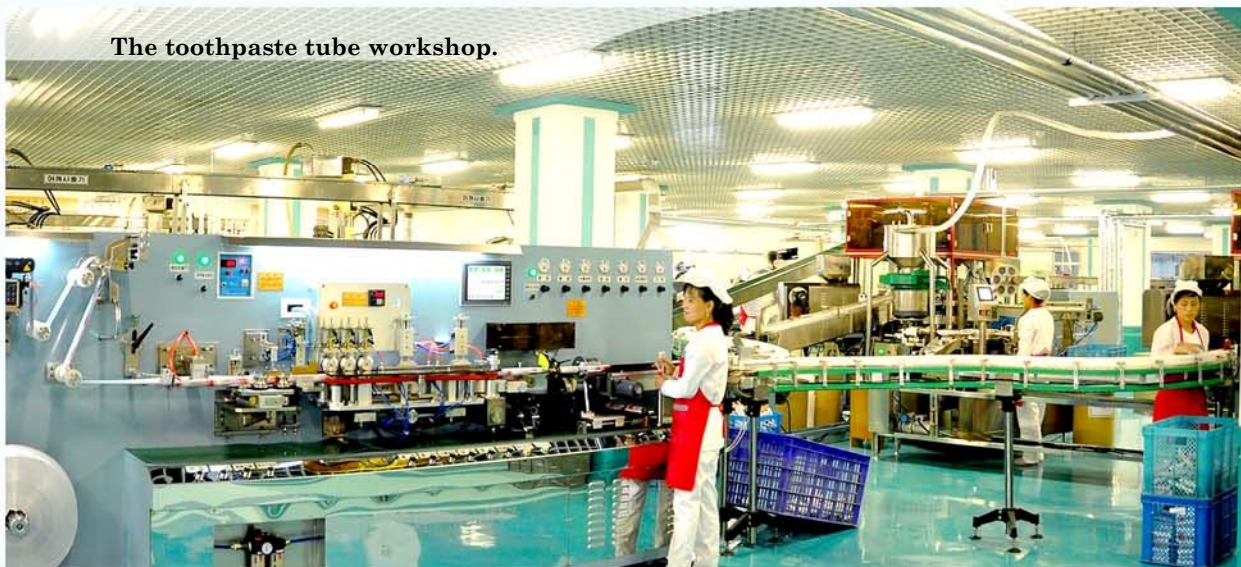
The toothpaste tube workshop.

SOME TIME AGO I VISITED the newly built Pyongyang Dental Hygiene Supplies Factory. Occupying not so large an area covered with trees and flowers, the factory consists of a production building, an office building and a welfare facility. The outer walls of the production building are covered with white and green tiles in good harmony, and the front wall features a mark of Paekhak (white crane), which the Korean people regarded as a sym-