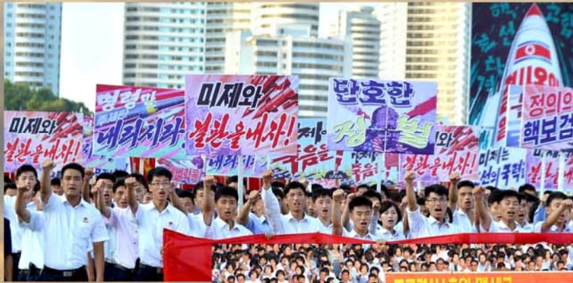
The Pyongyang citizens' mass rally and demonstration to fully support the DPRK government's statement in August 2017.