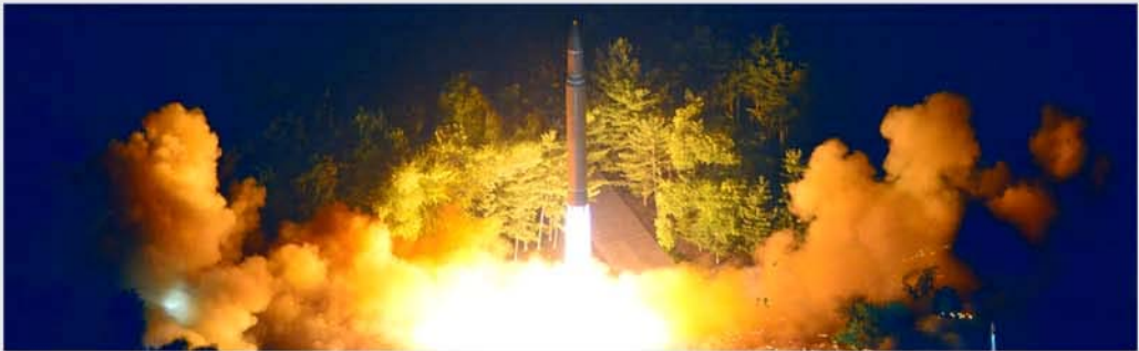
The successful second round of test fire of intercontinental ballistic missile Hwasong 14 on July 28, 2017.