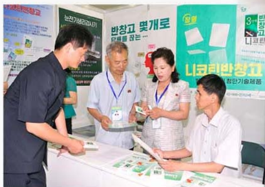
The developers of the nicotine plaster.

Smoking makes the human body absorb carcinogenic tar and poisonous carbon monoxide, but the plaster is free from carcinogenicity and contains only nicotine which tastes of tobacco. When a patch of the material is stuck to the body you'll be gradually reluctant to smoke. Even if you habitually take a cigarette in your mouth you'll soon smash out as its taste is unpleasant.