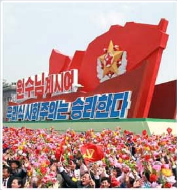
Front Cover: The demonstrators give vent to their trust in the Workers' Party of Korea