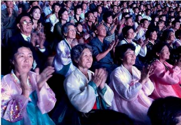
Elderly people celebrate the International Day of Older Persons.

My federation will continue to strive to make the elderly lead a worthwhile life and help further improve the State policy of protecting the elderly as required by the developing reality and the elderly. □