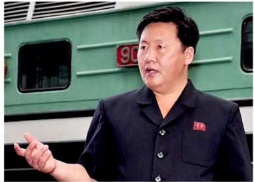
Jo Nam Il.

The Americans have conceived plans for “beheading operation” and “internal harassing operation” for the purpose of making a “conquest” of Pyongyang—that we