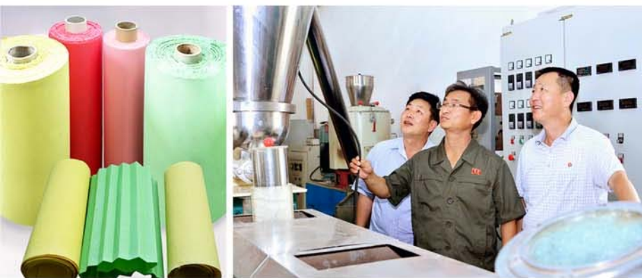
Functional paper goods are developed for the people's life and the economic development.

in the air to a hundred. World-wide, the capability of lowering the number of bacteria per 1 ft 3 to 1 000 is defined as 1 000-level, and that of doing to 100 as 100-level. Considering the fact that the 100-level is recognized as the advanced, their success is very notable. This air-cleaning paper has a wide range of usage. In the medical sector, in particular, it can perfectly provide an operating theatre with a germ-free condition in case of operation. At present the paper is used in operating theatres of several hospitals including the Breast Tumour Institute of the Pyongyang Ma-