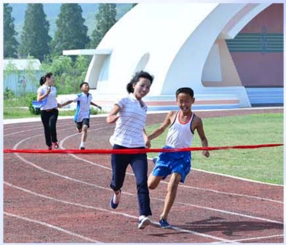
The campers enjoy themselves to their heart's content.