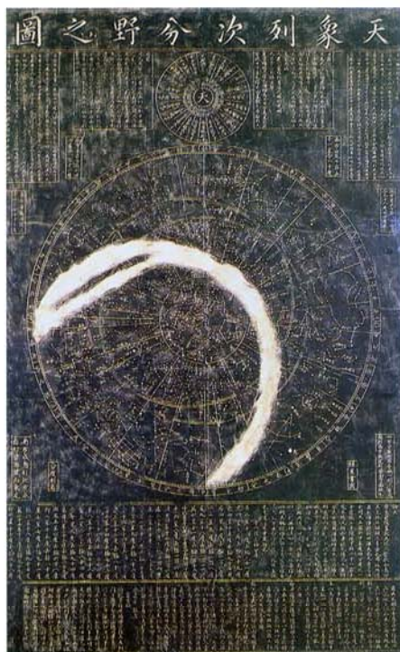
The astronomical chart Chonsangryolchabunyajido .

Medicine of Koguryo, too, was on a high level. Acupuncture and