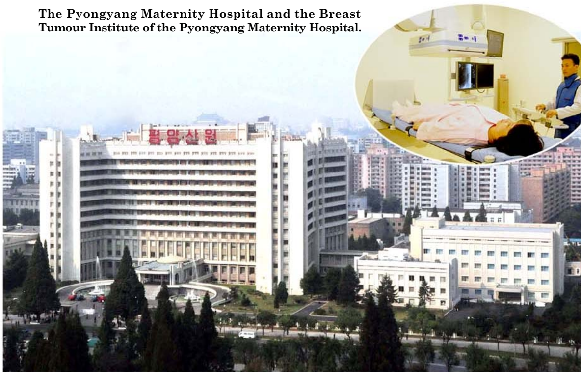
The Pyongyang Maternity Hospital and the Breast Tumour Institute of the Pyongyang Maternity Hospital.

The Academy of Koryo Medicine, a Korean-style gabled house, studies and disseminates the methods of treating many incurable diseases by combining Koryo medicine and modern medicine. The academy consists of a Koryo internal medicine institute, a Koryo surgery institute, an acupuncture and moxibustion institute, a physical constitution institute, a basic Koryo medicine institute, a Koryo pharmacy institute, a general examination office, a Koryo dispensary, an out-