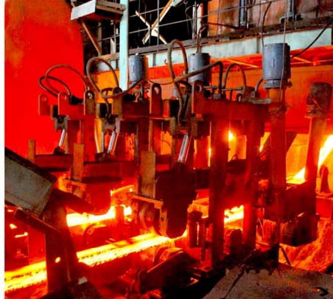
A continuous ingot steel maker.

▶ that in the course of this they came to have firmer confidence that self-reliance and self-development are the best choice.