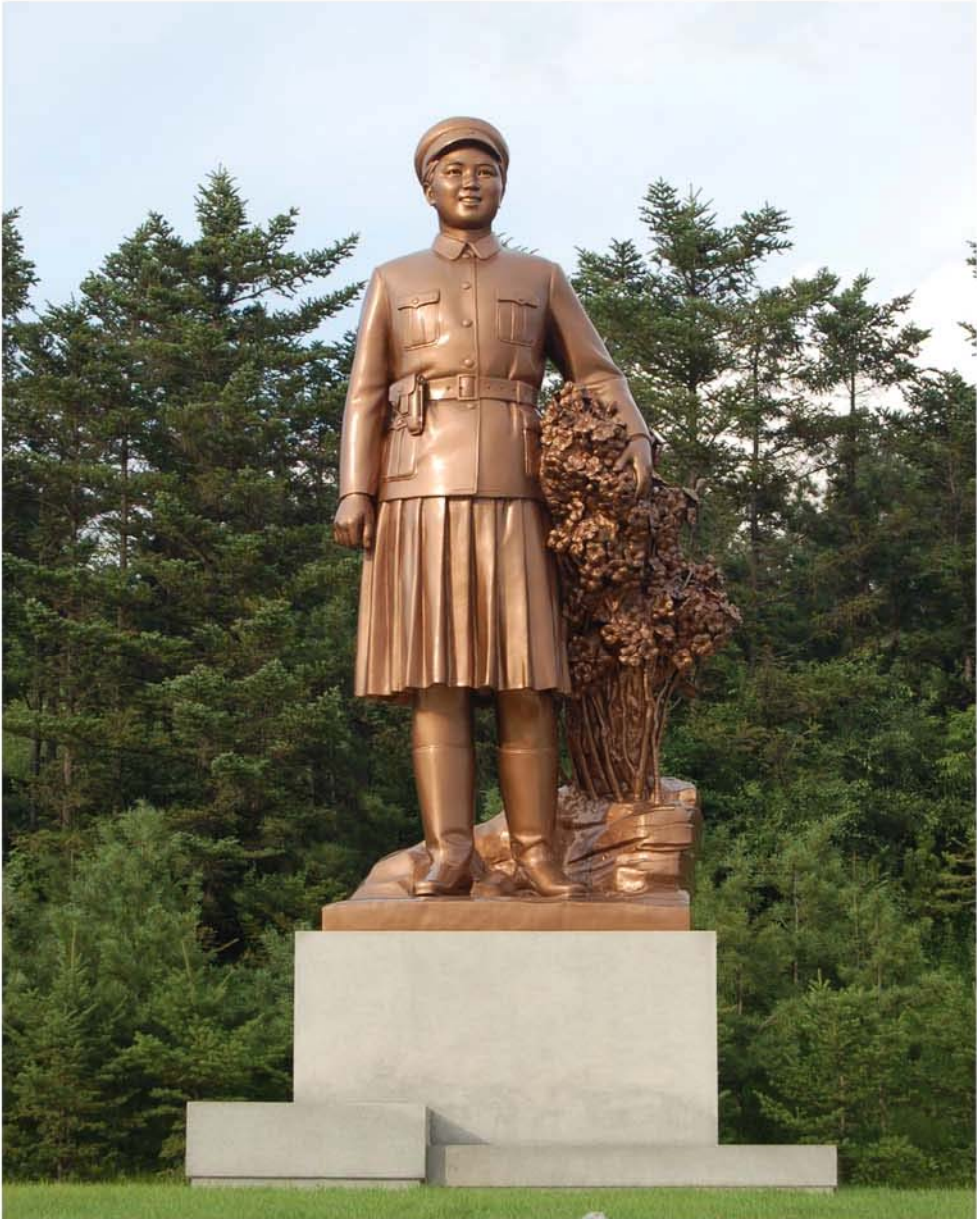
A bronze statue of the anti-Japanese war heroine Kim Jong Suk.

T HE ANTI-JAPANESE WAR heroine Kim Jong Suk was an indomitable revolutionary, commander of Paektu and versatile socio-political activist who