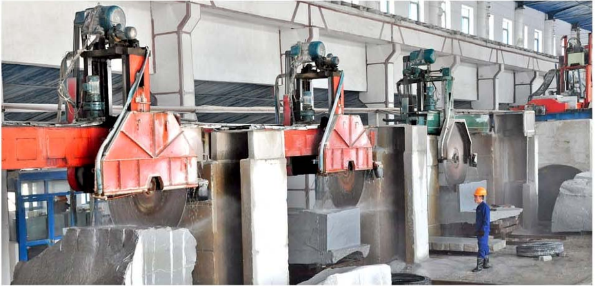
Medium-sized rough stone cutters.

Rough stone production is on the increase through timely solution of problems in operation of the self-propelled cutter.