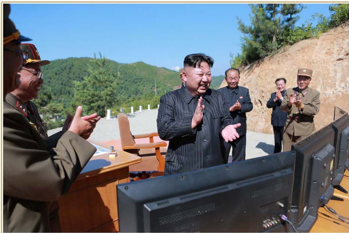
Supreme Leader Kim Jong Un gives guidance to the test fire of ICBM Hwasong 14 in July 2017.