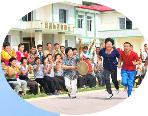
Holidaymakers enjoy themselves.

The rest homes each have welfare and medical service facilities, a library, a gym, an amusement hall and a cinema, and the compound of each of the homes is designed for elderly people to take a walk and have a meal outdoors. And the homes are characterized by rooms provided with underfloor heating systems or beds to the elderly's liking. Each of the homes also has a hydroponic greenhouse and a vegetable garden where they can raise vegetables to be used for their own meals. Foreigners can go there to see the elderly leading a happy life under the care of the State. □