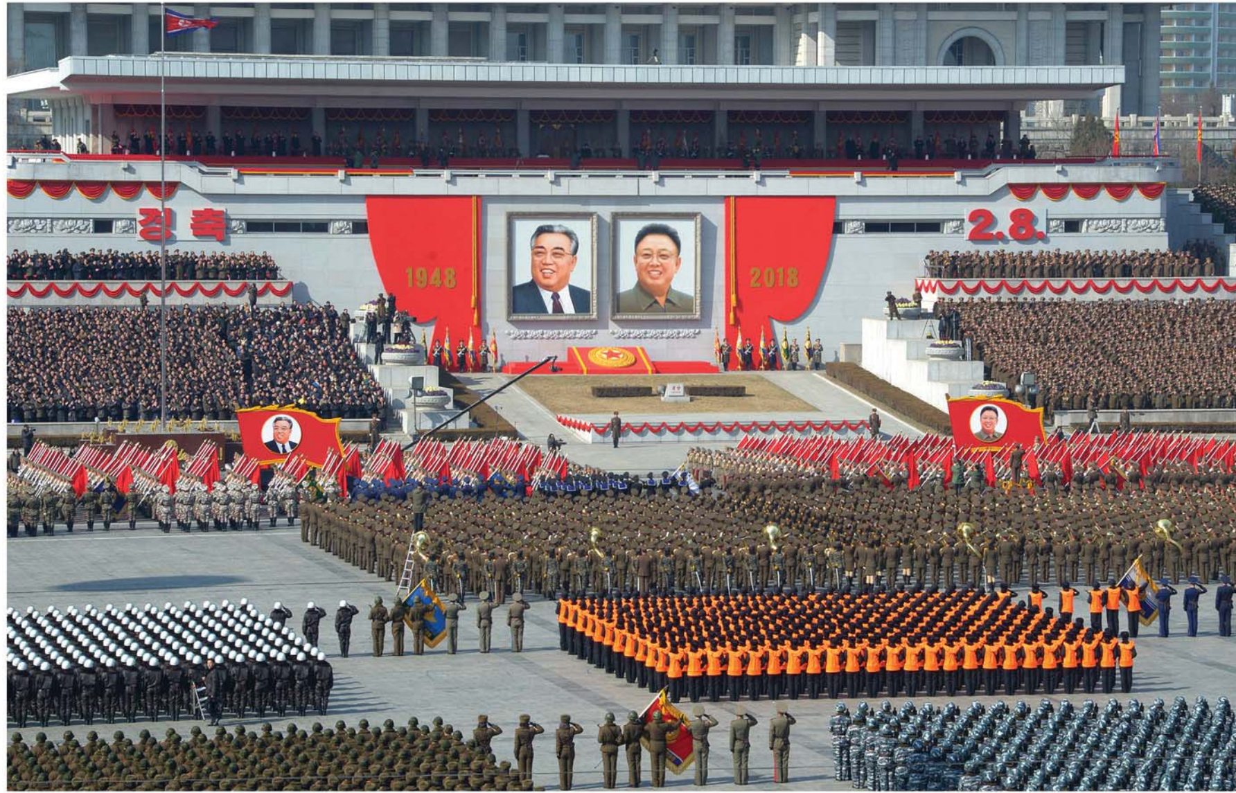
Flags bearing the beaming images of President Kim Il Sung and Chairman Kim Jong Il entering the square escorted by KPA officers