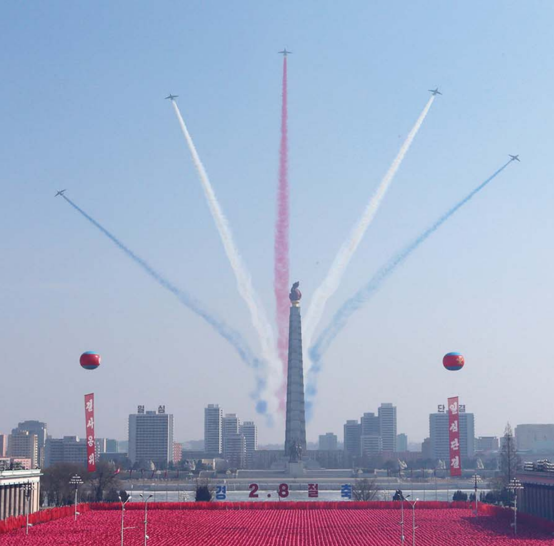
Fighters flying past, leaving colourful vapour trails over Kim Il Sung Square