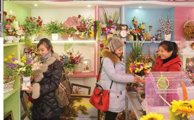
Flower shop, photo studio, chemist's, children's playing ground and restaurants are found in the mall