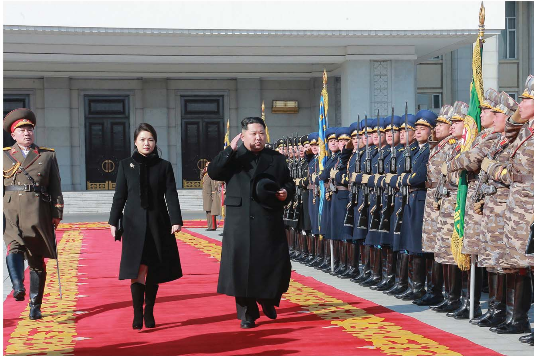
The respected Supreme Leader Kim Jong Un reviewing the honour guard of the KPA services [February Juche 107 (2018)]