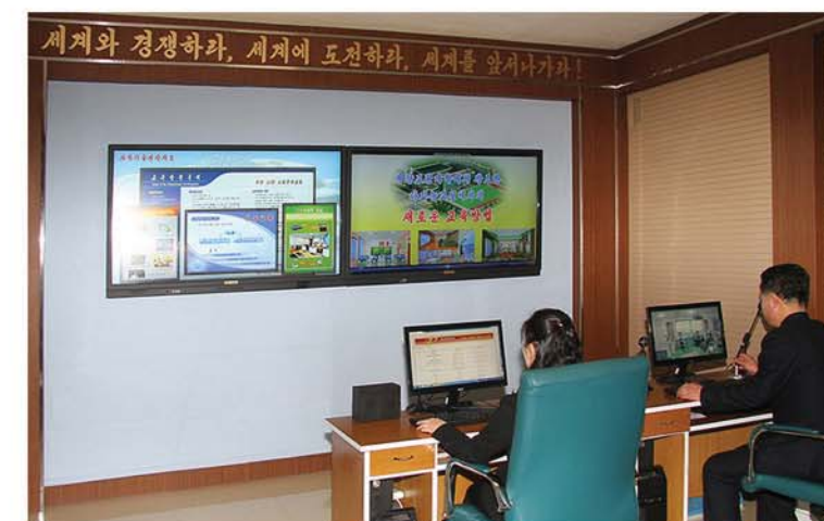
Overall educational and scientific affairs of the college are under supervision at the education control room

With a high sense of being responsible for educational work and becoming masters in bringing about a radical improvement in education in the new century, its lecturers are devoting their ardent patriotic enthusiasm and pure conscience to the work and pooling their wisdom and efforts to develop and introduce advanced teaching methods.