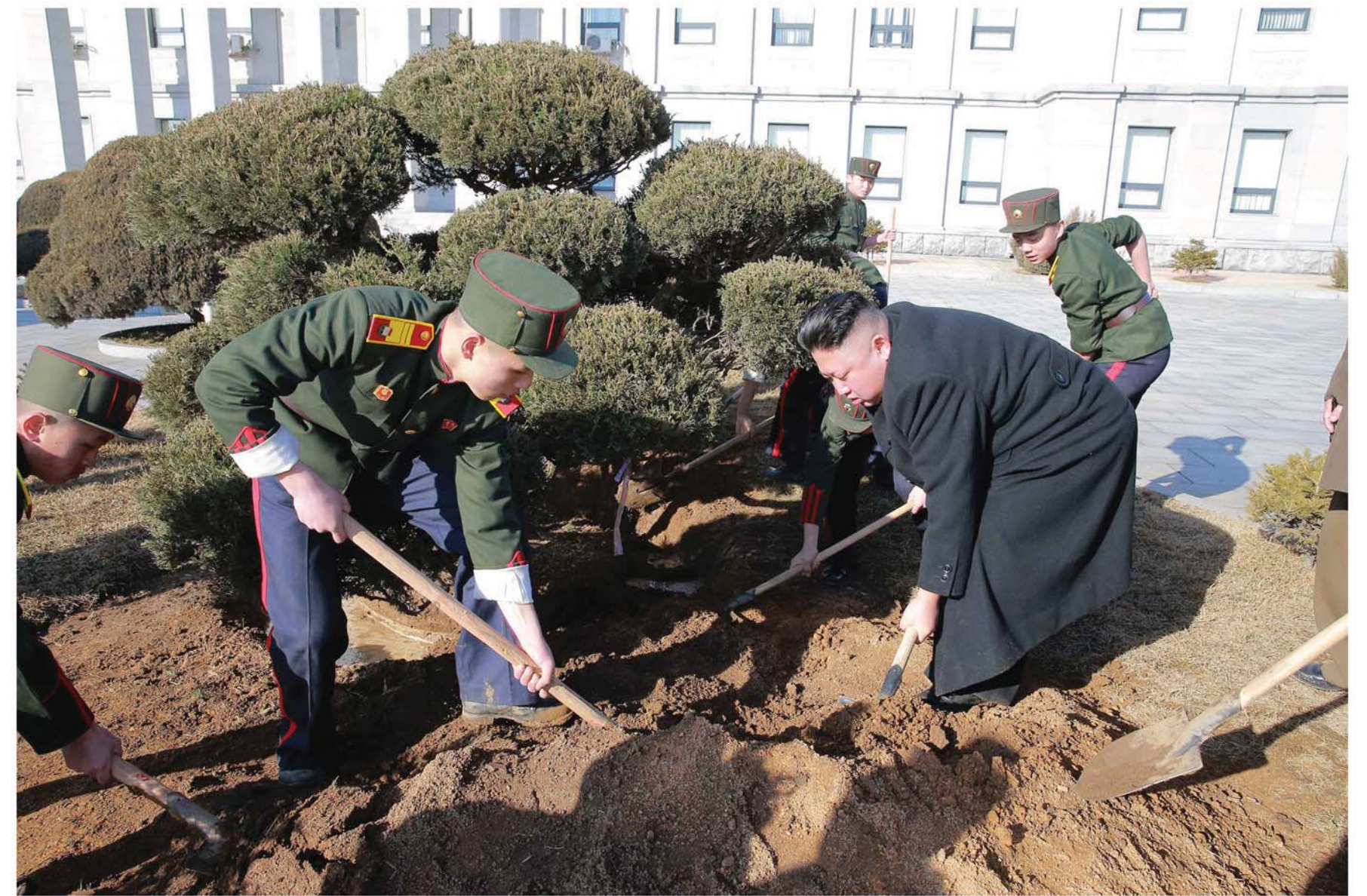
Supreme Leader Kim Jong Un planting trees on Tree-planting Day [March Juche 106 (2017)]

Within a few years trees were planted in the area of hundreds of thousands of hectares throughout the country, and many cities and counties overfulfilled their tree-planting assignments. Tree Nursery No. 122 of the Korean People’s Army has been built as the nursery in the 21st century in keeping with the requirements of the era of the knowledge economy, and other local tree nurseries have consolidated their material and technical foundations to expand