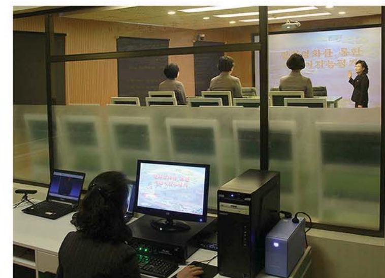
All the lecture rooms are furnished as multifunctional ones to conduct practical specialized training