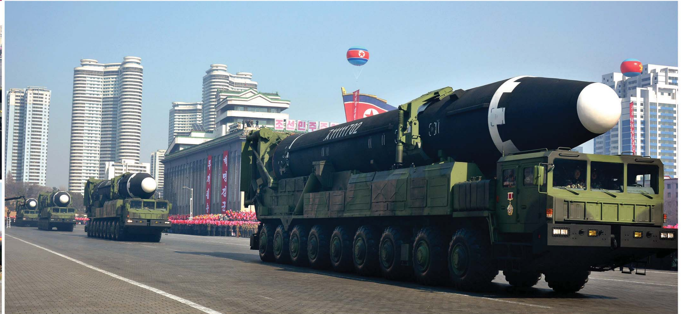
Columns of the KPA Strategic Force marching past, showing off the invincible might of the army