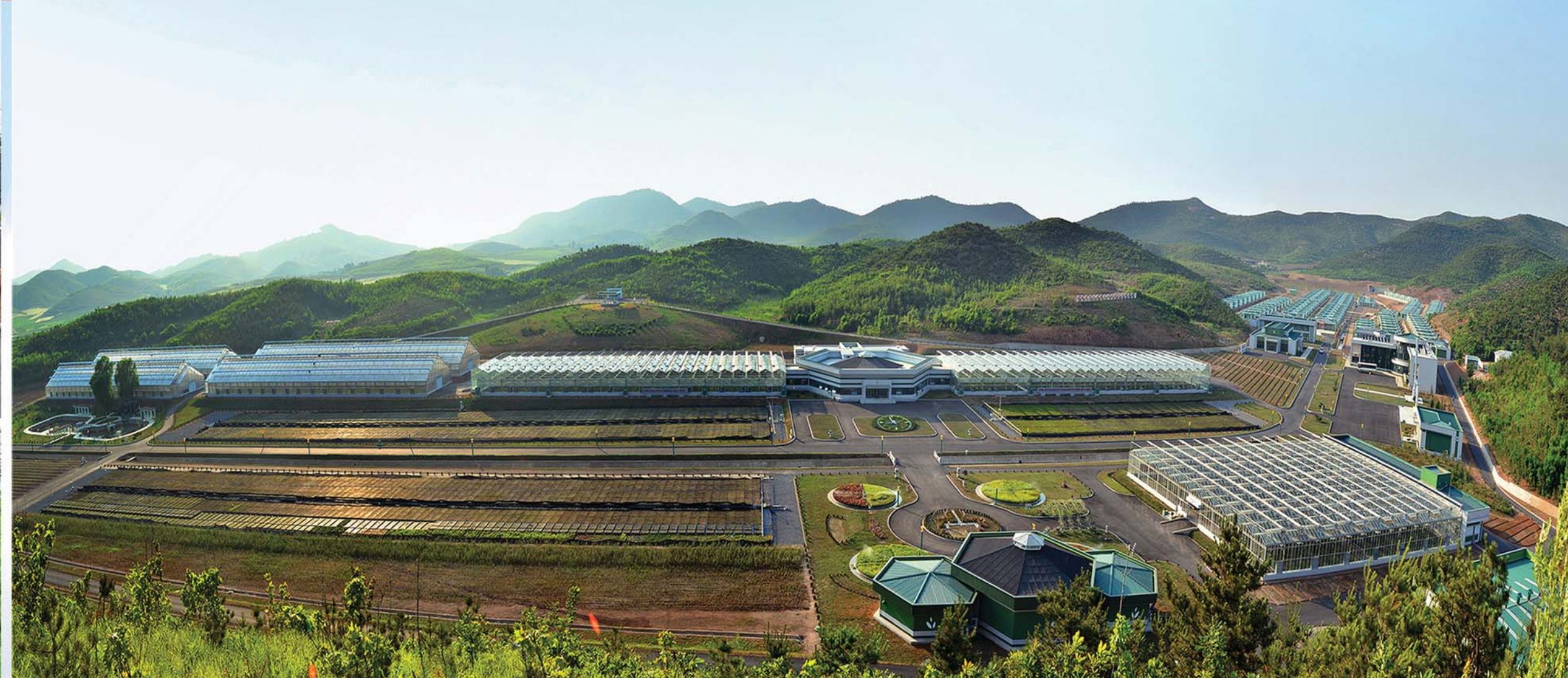
Tree Nursery No. 122 of the Korean People's Army and other tree nurseries built in all parts of the country ensure the solid material and technological foundations for sapling production