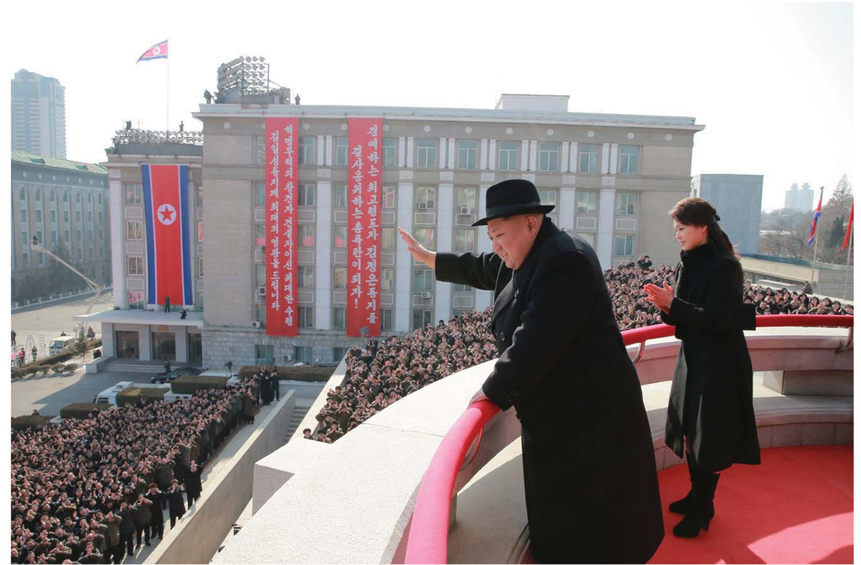
The respected Supreme Leader Kim Jong Un acknowledging the enthusiastic cheers of the crowds [February Juche 107 (2018)]