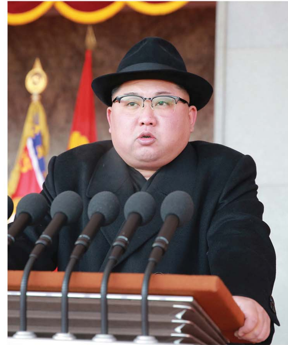
The respected Supreme Leader Kim Jong Un delivering a congratulatory speech [February Juche 107 (2018)]