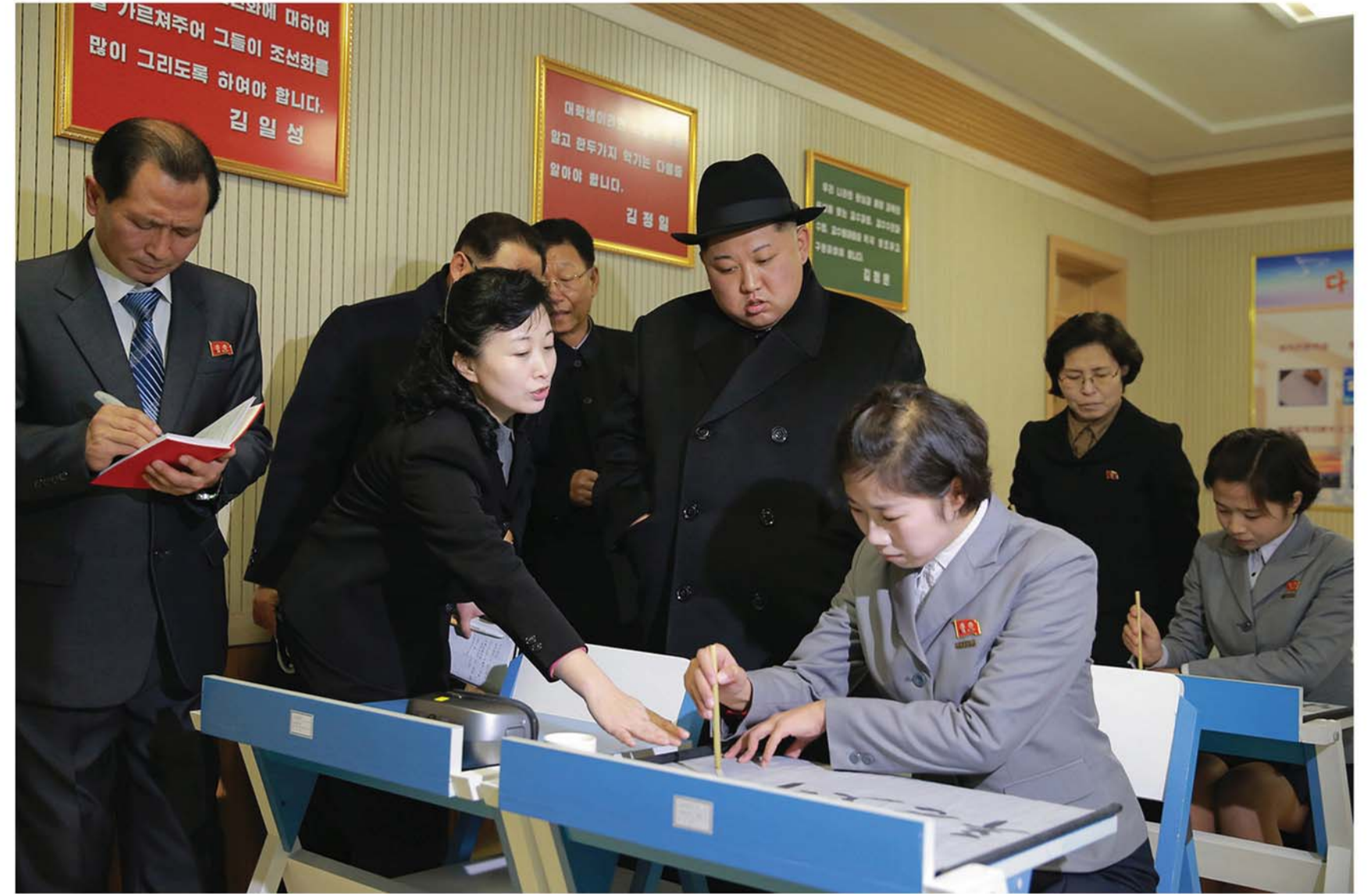
Supreme Leader Kim Jong Un visiting the reconstructed Pyongyang Teachers Training College [January Juche 107 (2018)]