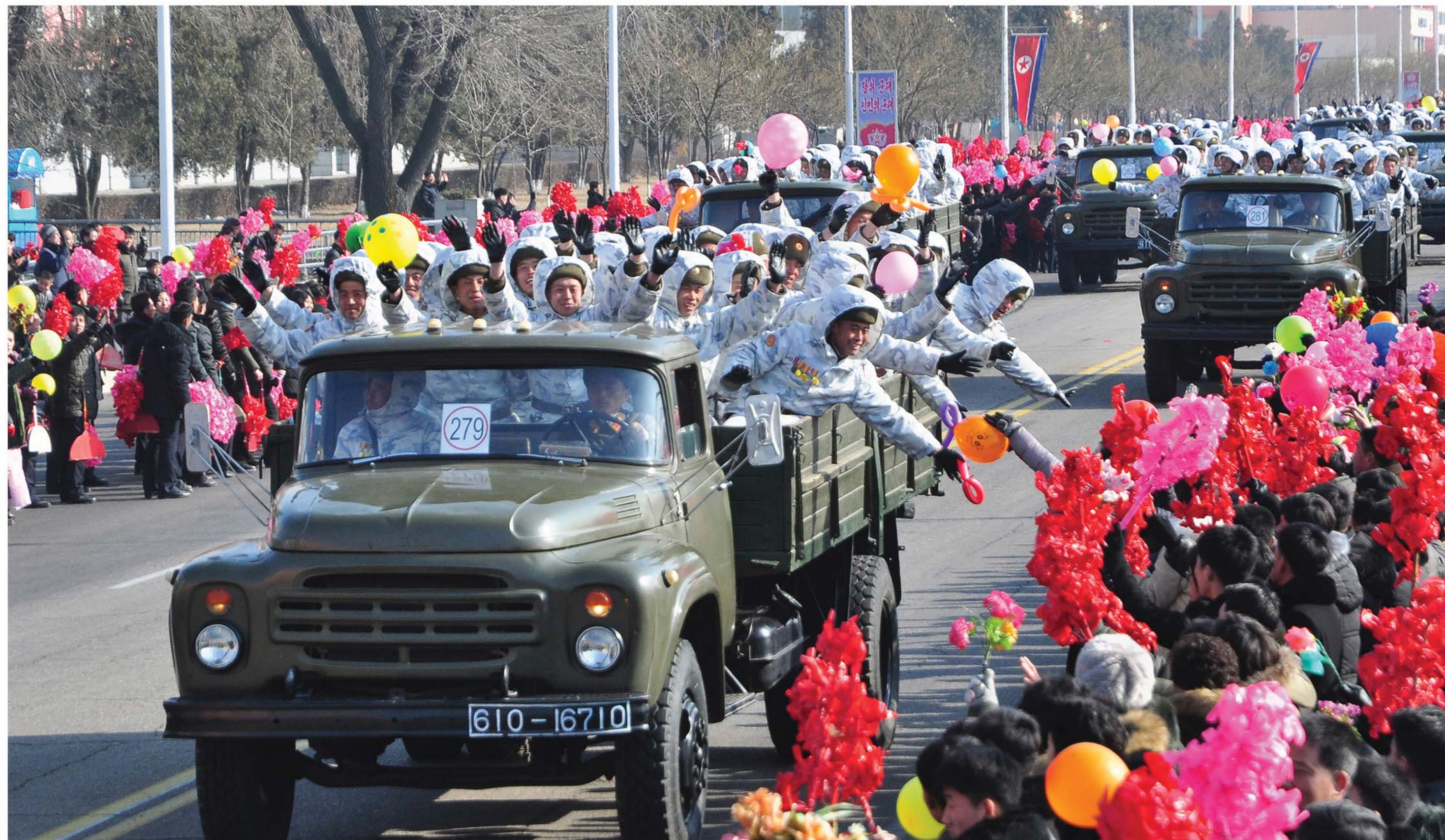
Pyongyang citizens warmly welcoming the military paraders passing through the streets