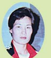
Kim Kyong Hui