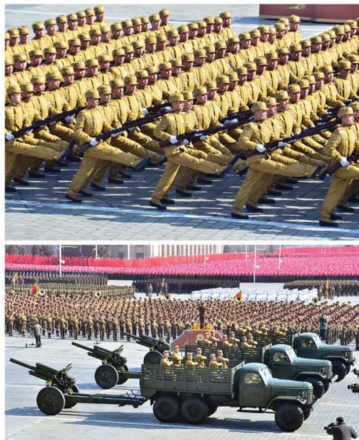
Columns symbolizing those in the initial period of the regular armed forces