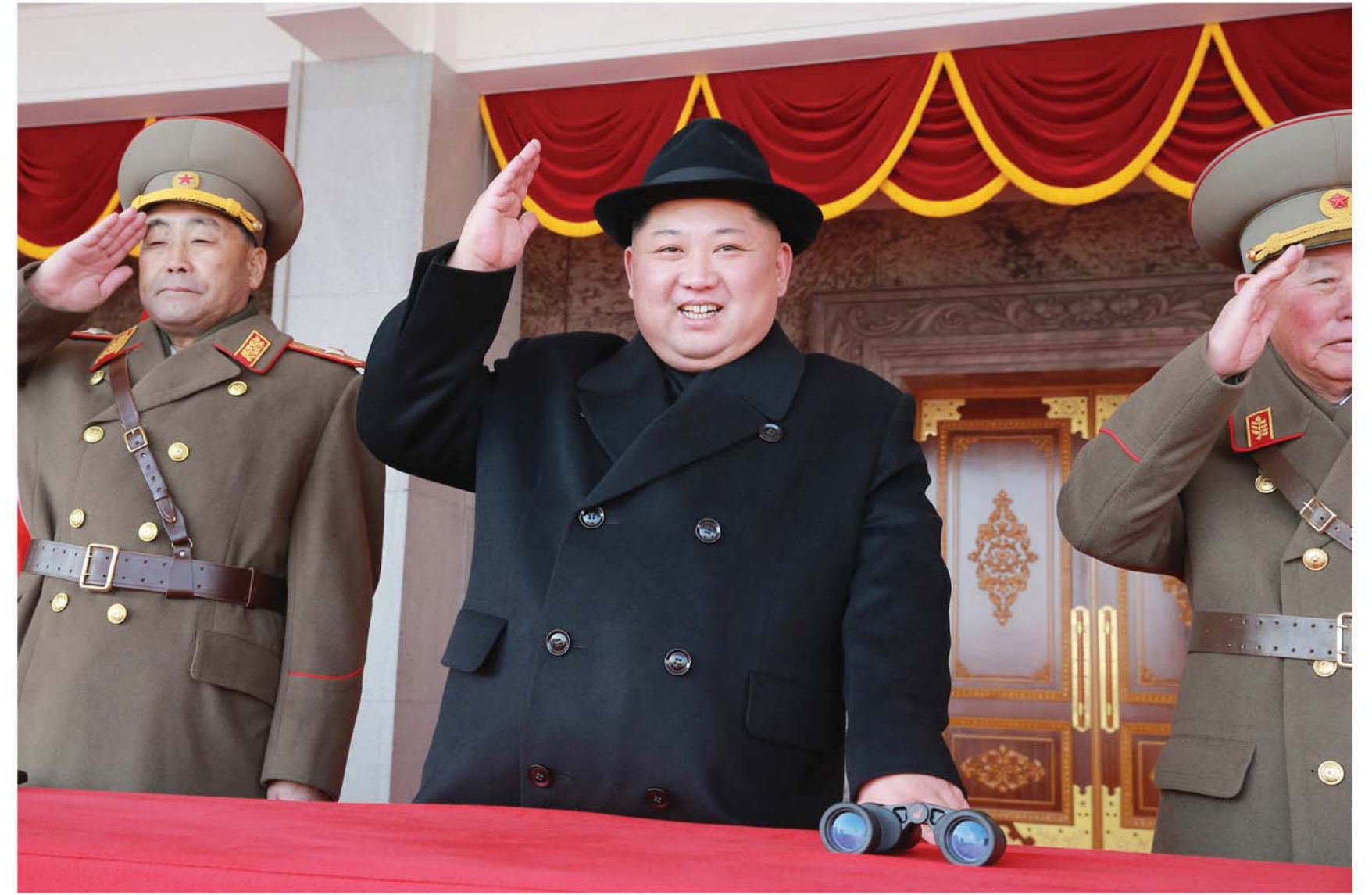
The respected Supreme Leader Kim Jong Un acknowledging the salute of the marching columns [February Juche 107 (2018)]