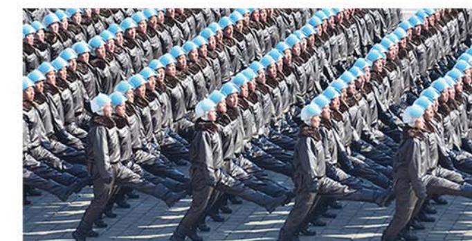
Columns marching past in a stately manner