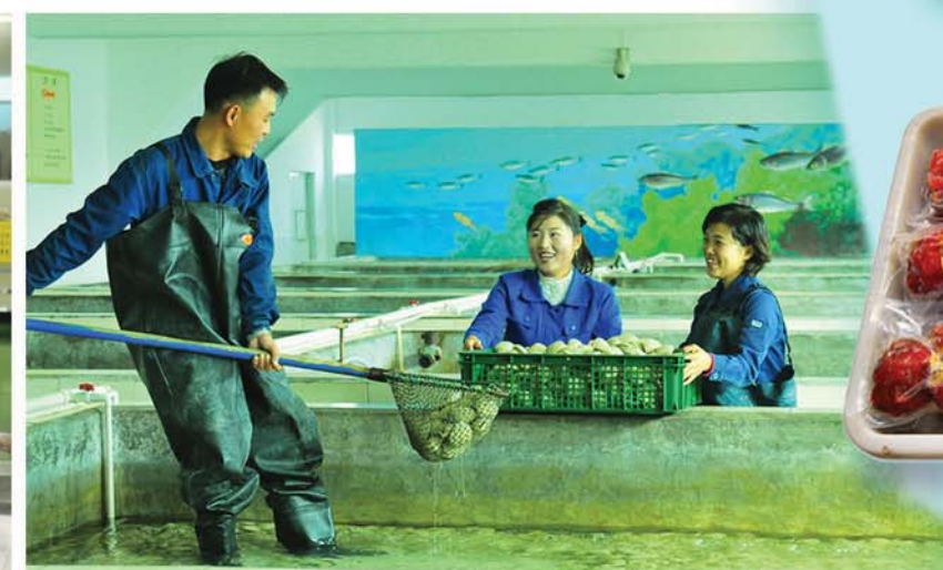
Proper arrangements for production are made to turn out quick-frozen, pickled and other various aquatic products