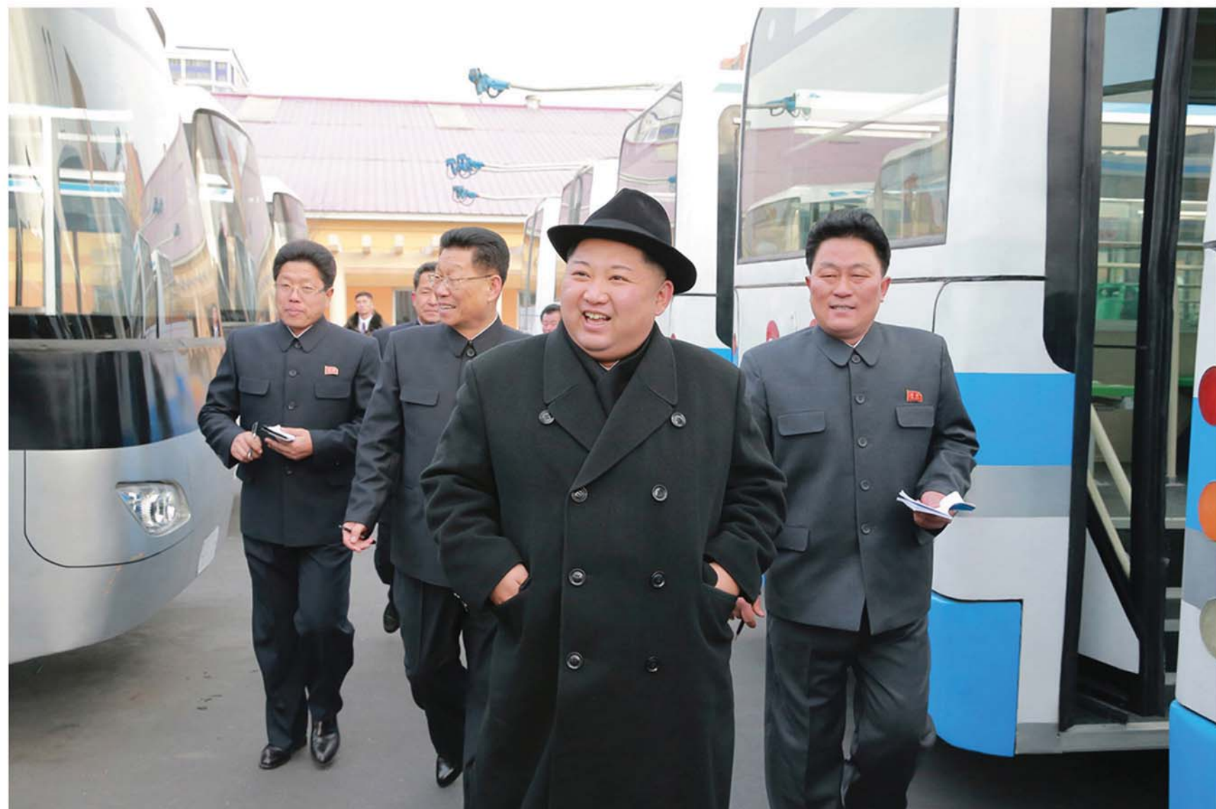
Supreme Leader Kim Jong Un visiting the renovated Pyongyang Trolley Bus Factory [January Juche 107 (2018)]

material foundation for giving full play to the advantages of the people-oriented health system of our country and one of major means in medical treatment and preventive work, and supply them to the people, the Pyongyang Pharmaceutical Factory should be renovated in a modern style, he set forth important tasks to that end.