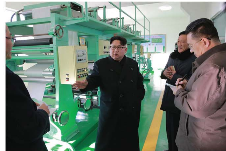
Supreme Leader Kim Jong Un visiting the Pyongyang Pharmaceutical Factory [January Juche 107 (2018)]

Educational conditions and environment serve as a valuable foundation for training talents, he said, adding that the colleges and schools should be furnished not only conveniently for the study and life of the students but also excellently in keeping with the pedagogical requirements and befitting the