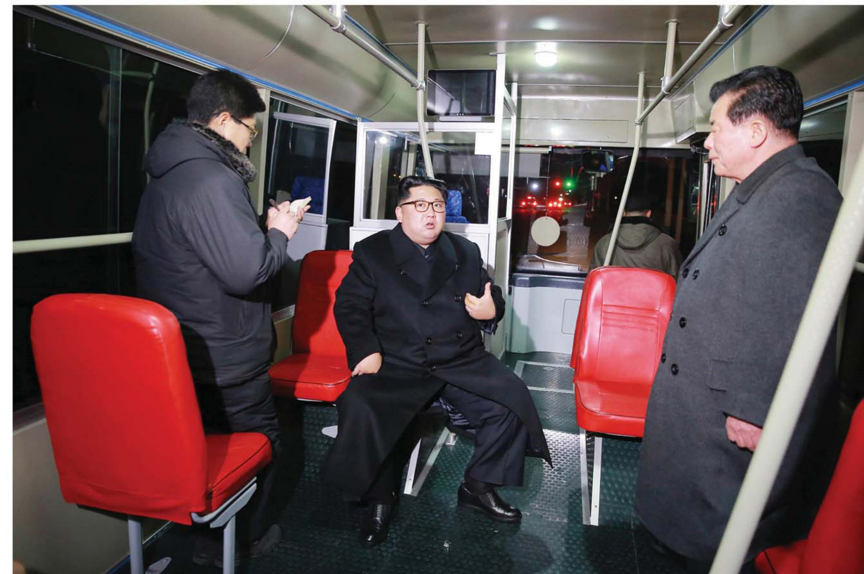
Supreme Leader Kim Jong Un riding in the trolley bus of a new model on its trial run [February Juche 107 (2018)]

Busy as he was with a tight schedule, the Supreme Leader found time to go round the capital city by the new trolley bus late at night, saying he could feel