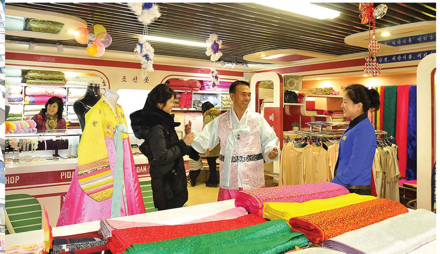
The Shopping Mall laid out on the corridor-type ground floors linking the 70-storey and 55-storey skyscrapers fully accommodates the convenience of the residents