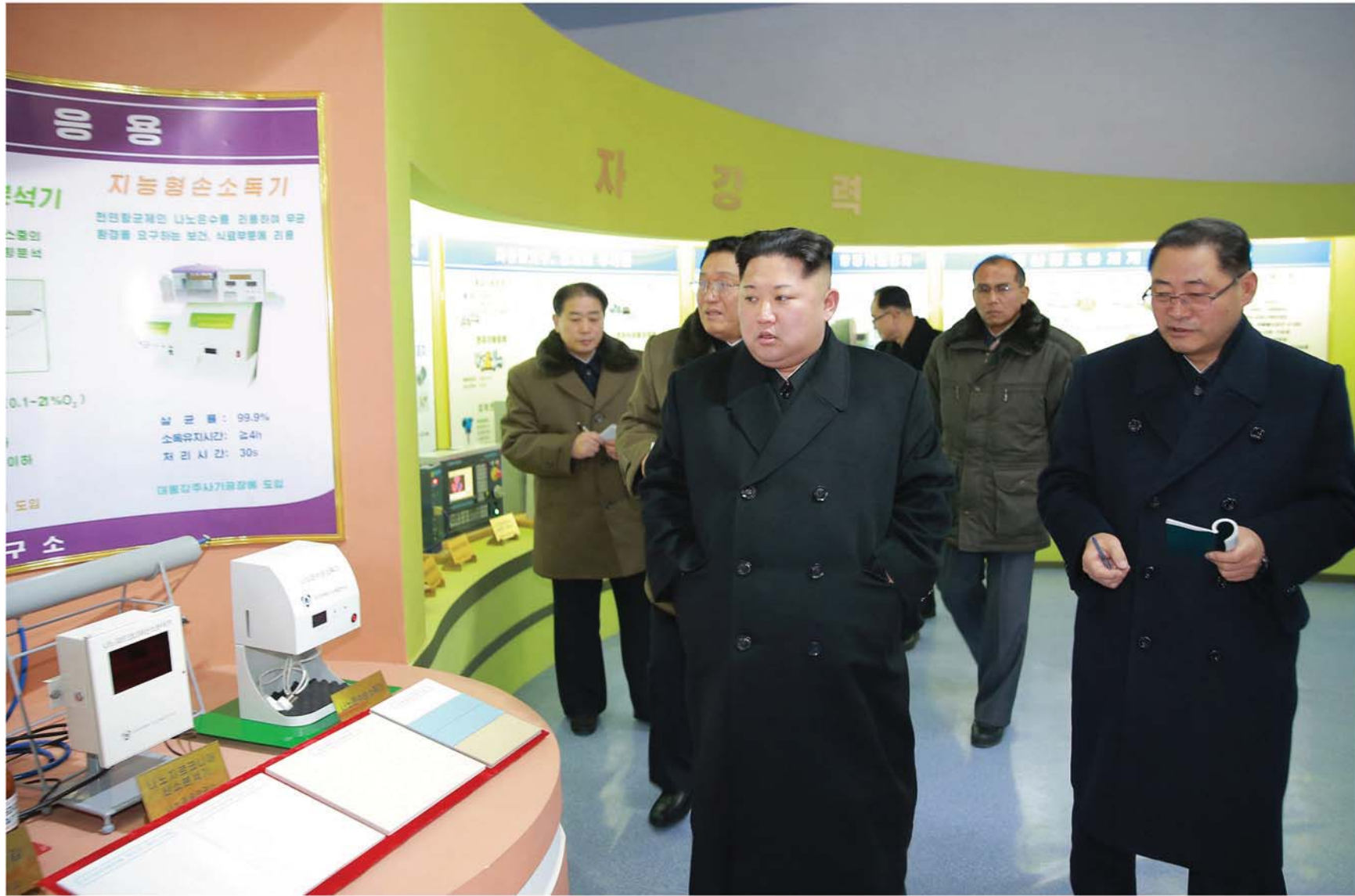
Supreme Leader Kim Jong Un visiting the State Academy of Sciences [January Juche 107 (2018)]