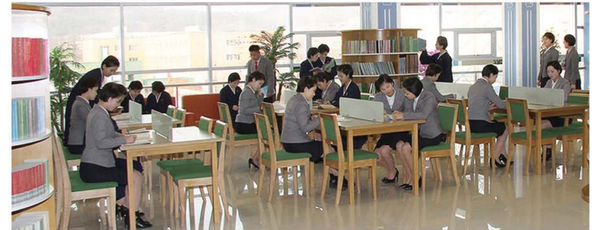
Students are preparing themselves as competent educators to bring up the future personnel of the country