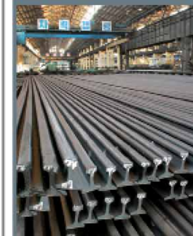
Hwanghae Iron and Steel Complex