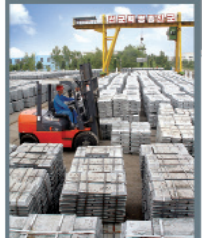
Shipment of zinc products