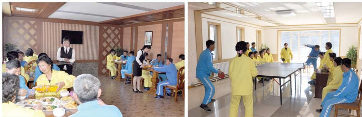
Holiday-makers are enjoying themselves.

Besides, if you eat 30 or 60 grams of chestnuts raw three times a day, it helps treat chronic laryngitis. In particular, chestnuts are good for the elderly, who usually have pains in the waist and legs, and are often afflicted with coronary artery diseases. Eating chestnuts can prevent the diseases. If the elderly eat 30 grams of roast chestnuts in the morning and evening, they can treat their bed-wetting. □