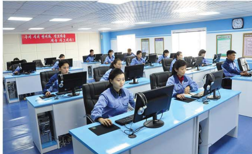
Distance education serves as an effective means

At present not only industrial workers but also university graduates are enrolling at the college out of their desire to be familiar with the trends in the development of modern science and technology. And leading officers of industrial establishments attend my college. But most of the students are industrial workers. At first the online education was given to over 40 workers of the Hwanghae Iron and Steel Complex, and now over 20 000 working people of over 4 000 factories and enterprises across the country are receiving the education. The workers can attend online lectures at sci-tech learning spaces of their workplaces or via the State computer network. And those who want to get the online