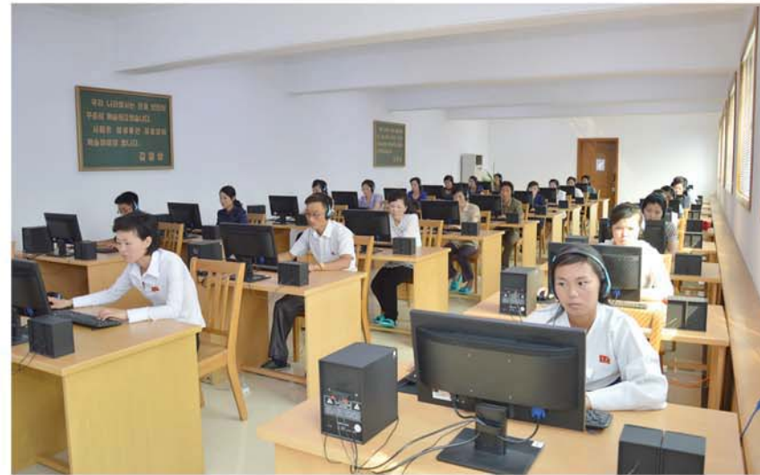
to train able people for sci-tech development.

country including the Hwanghae Iron and Steel Complex and the Osoksan Granite Mine. They are distinguishing themselves as