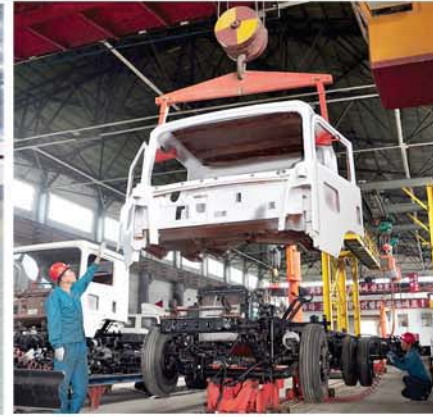
Production of trucks is accelerated.

▶ the speed of processing increased twice.