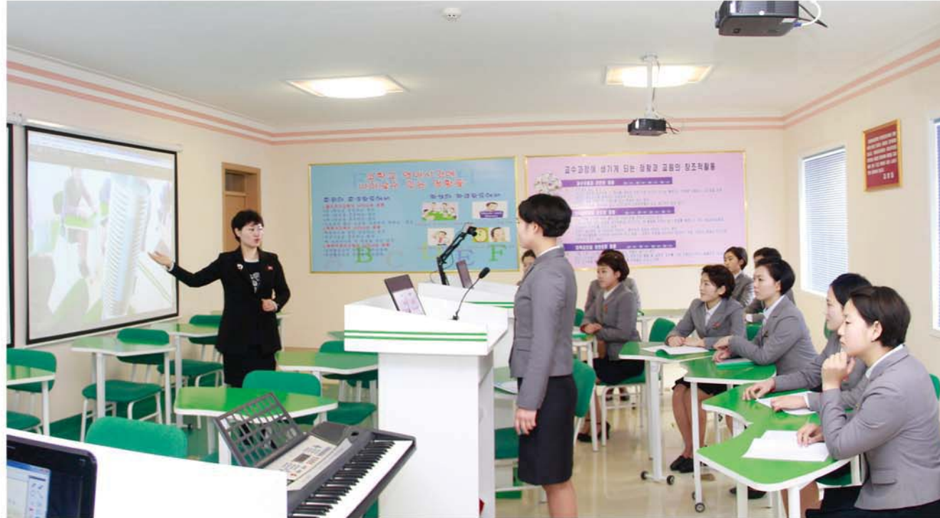
Future teachers with high qualities and qualifications are trained.

▶ electronic board, and the student looked just like a primary school teacher. The pupils displayed on the screen, I was told, were those of Kwangbok Primary School in Mangyongdae District. As an affiliated school of the college it is linked with the college through the State computer network, making it possible for the students to practise in teaching without having the trouble to go to the school.