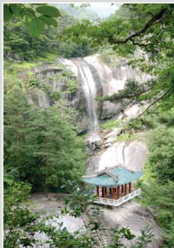
Back Cover: A pavilion in the Sangwon Ravine in Mt. Myohyang