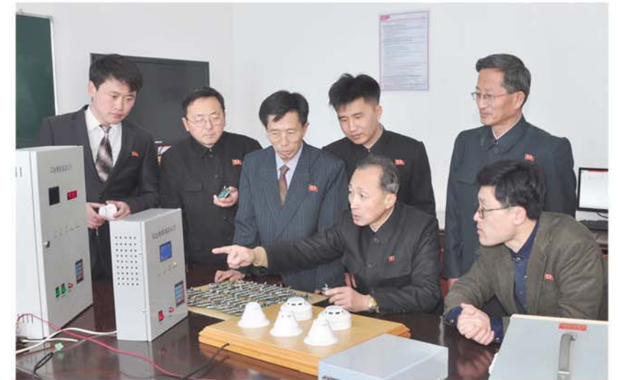
Researchers who have developed an intelligent fire monitoring system and the certificate of registered product of latest technology.

RESEARCHERS OF THE power electronics laboratory of the dynamics faculty of Kim Chaek University of Technology developed an intelligent double-wire fire monitoring system. The system is favourably commented upon by the users for high precision of its information analysis, its simple operation and management and its economic effectiveness.