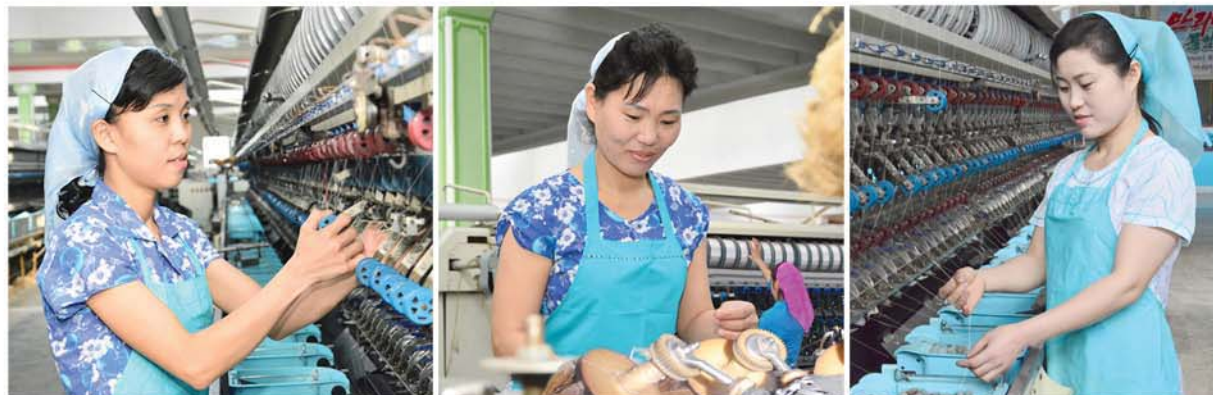
Silk thread production is on the increase.

▶ workteam fulfilled the day's production plan ahead of schedule.