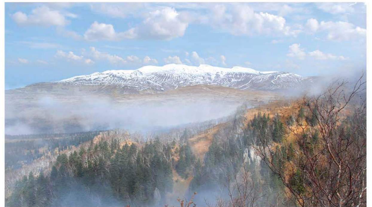
Mt. Paektu seen from Saja Peak.