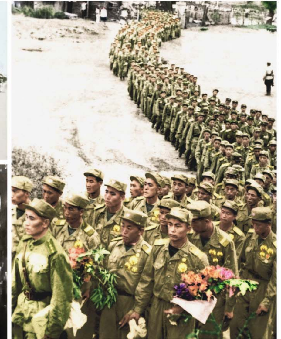
The Korean people achieved great victory in the Fatherland Liberation War against armed invasion of the imperialist forces by displaying mass heroism and the spirit of defending the country