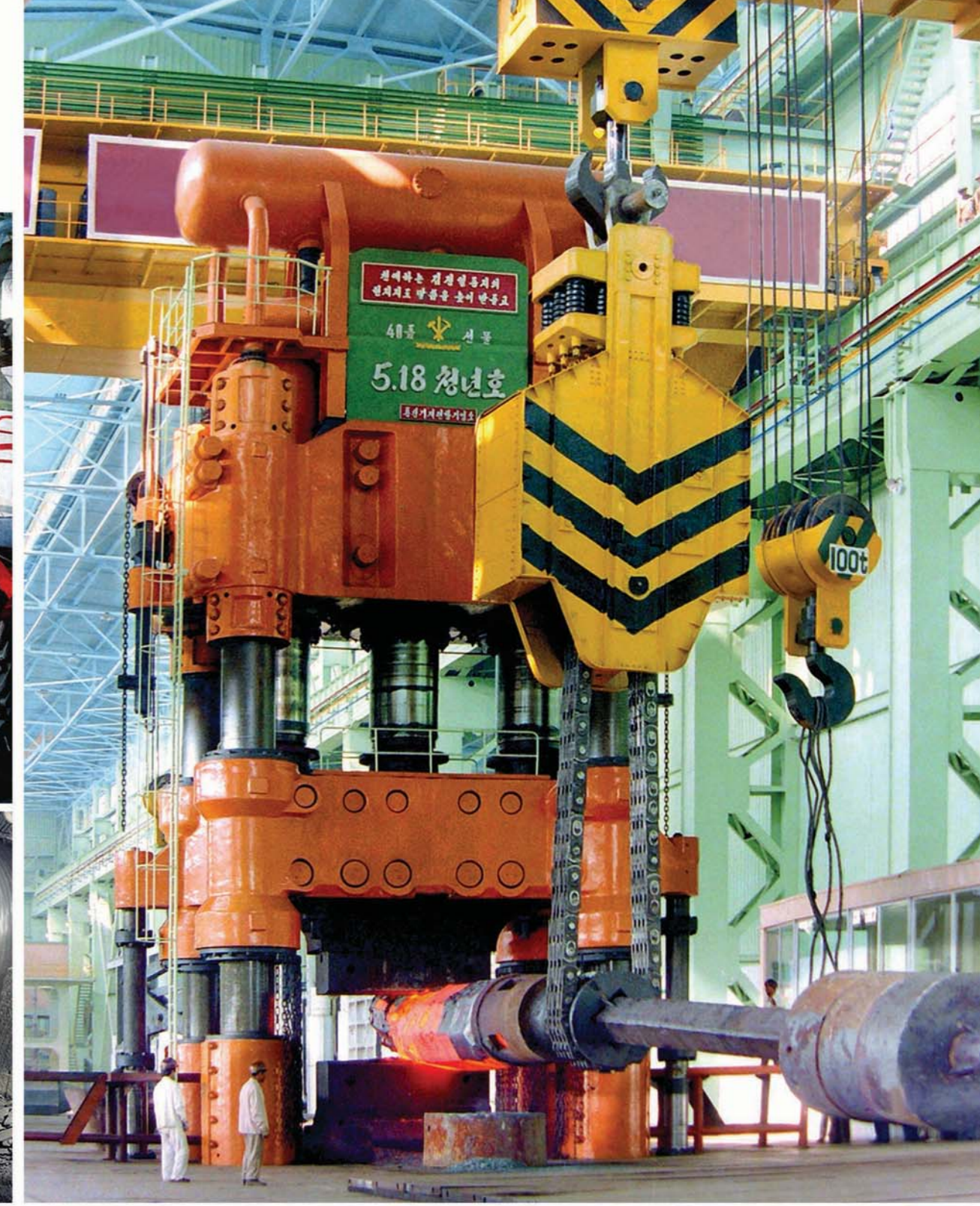
Material and technological foundations for socialism were laid in the heavy and light industries, agriculture and other sectors of the national economy