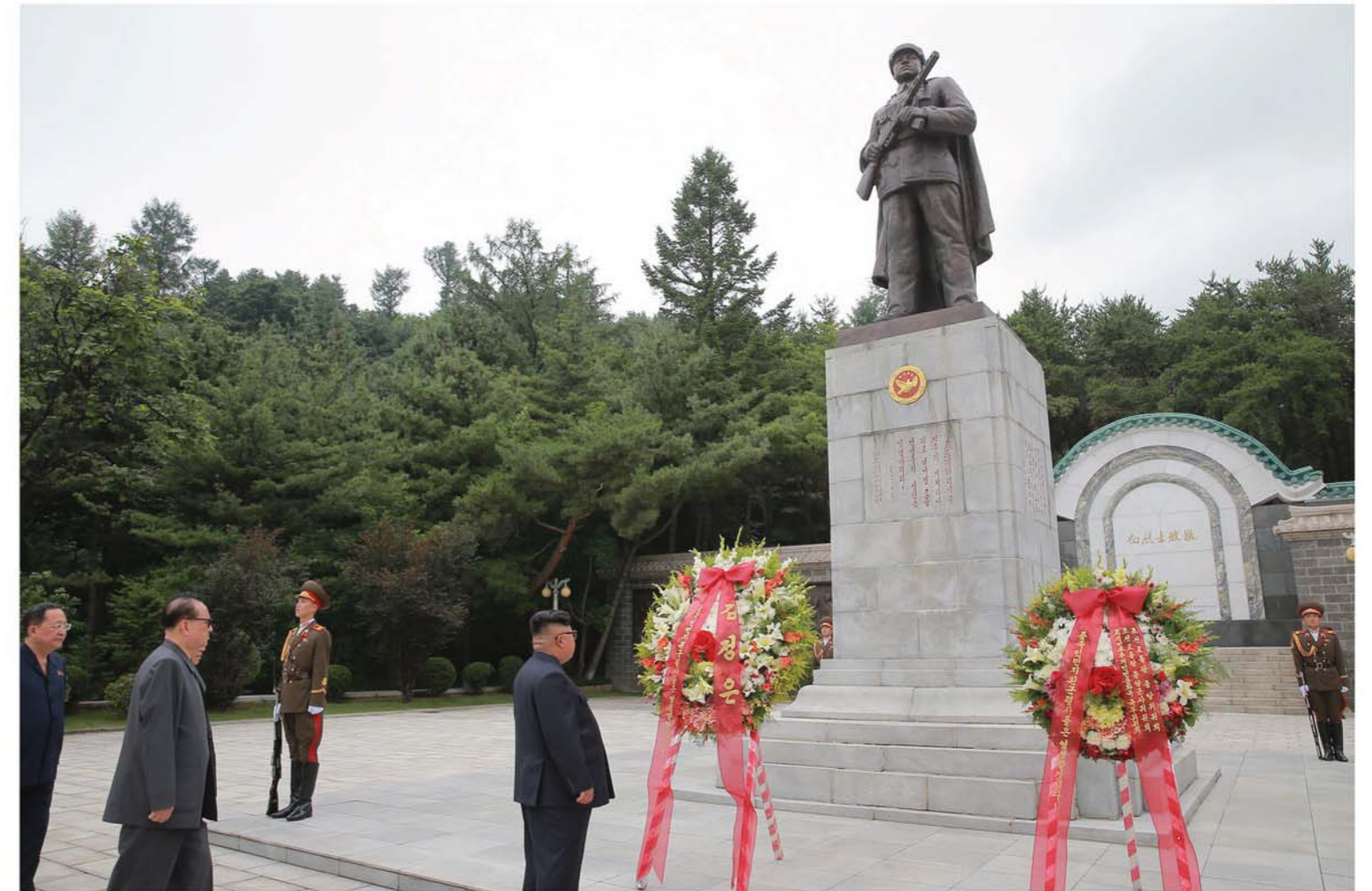
Supreme Leader Kim Jong Un laying the wreath at the Chinese People's Volunteers Martyrs Cemetery on the occasion of the 65th anniversary of the victory in the war [July Juche 107 (2018)]

martyr in the name of the Supreme Leader, which was followed by another wreath in the joint name of the WPK Central Committee, WPK Central Military Commission and the DPRK SAC. The Supreme Leader observed a moment's silence in memory of the CPV martyrs.