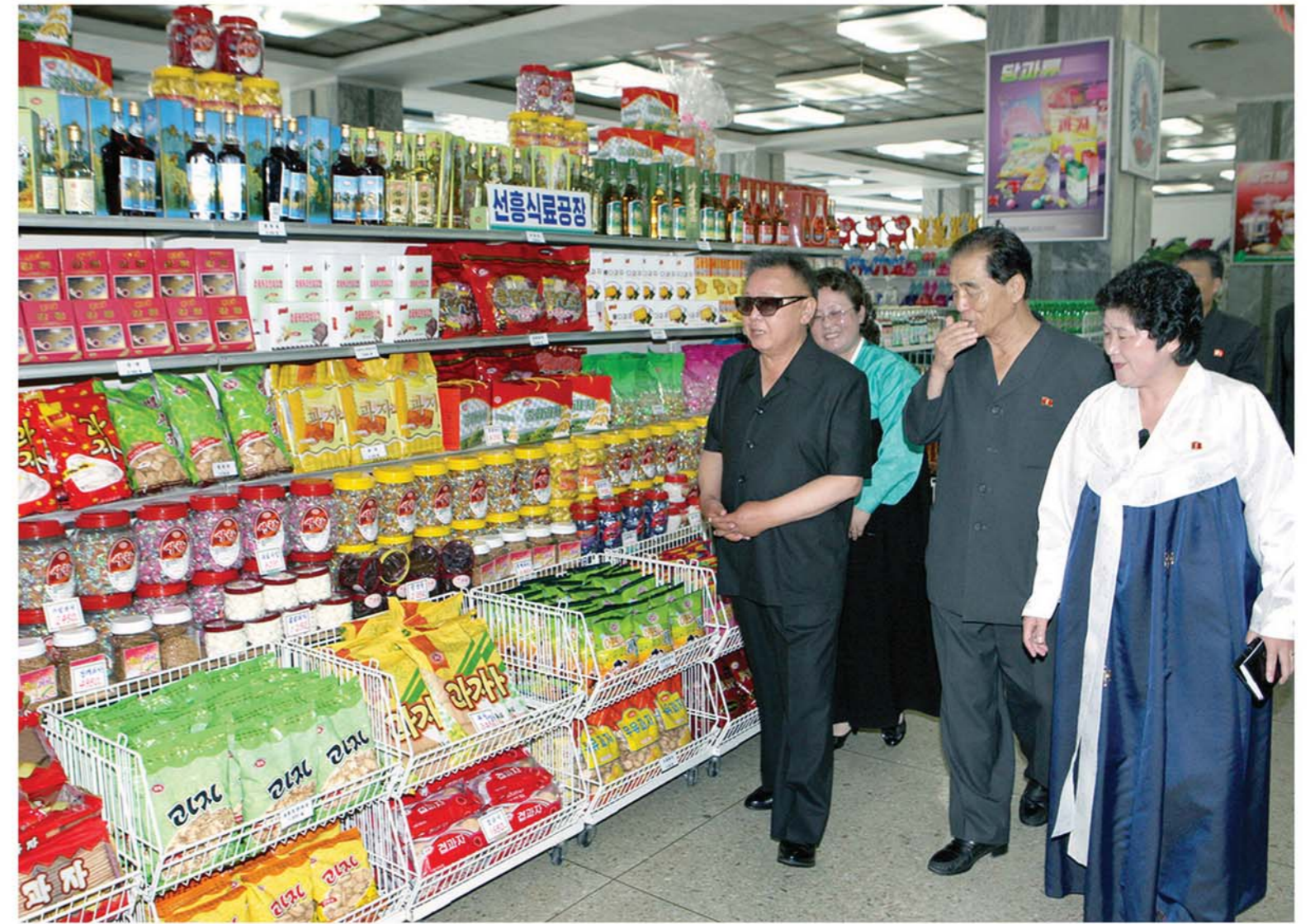
Kim Jong Il looking round the second goods show at Pyongyang Department Store No. 1 [July Juche 100 (2011)]