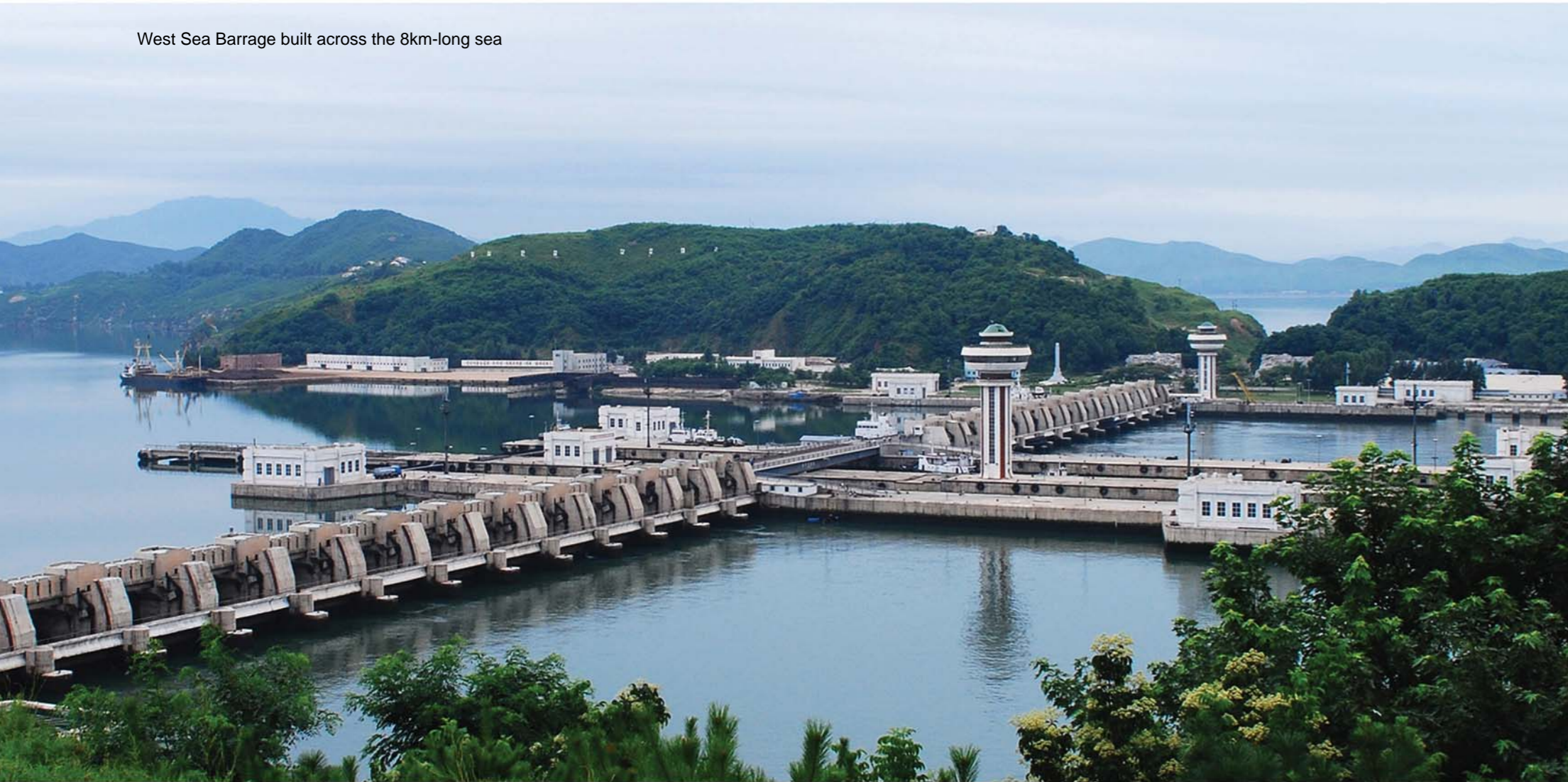
West Sea Barrage built across the 8km-long sea