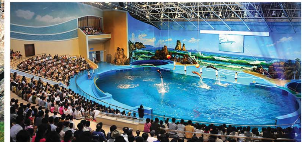
Bases for people's cultural and leisure activities are built splendidly