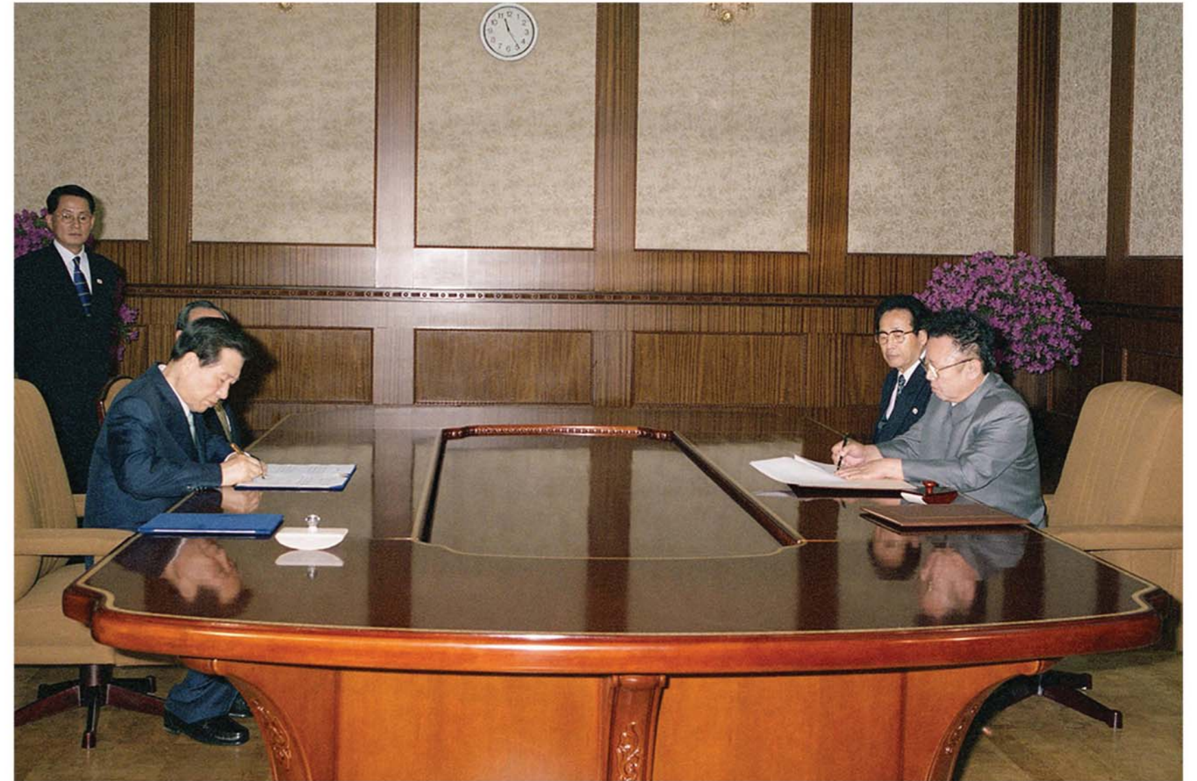
Kim Jong Il signing the North-South Joint Declaration [June Juche 89 (2000)]