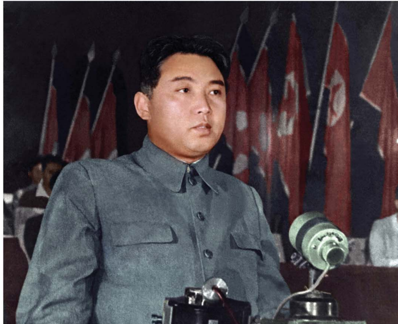
Kim Il Sung making public the political programme at the first session of the Supreme People's Assembly of the DPRK [September Juche 37 (1948)]

The name of the country, the Democratic People's Republic of Korea, clearly reflected its independent, democratic and people-oriented character, and its flag and emblem incorporated in them the symbols of the republic being a dignified, independent and sovereign state. The national anthem was also created to vividly depict the pride and dignity of the nation blessed with a beautiful country and sage fighting traditions.