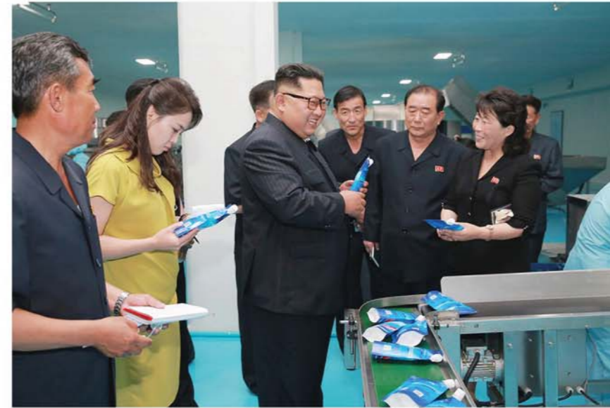
Supreme Leader Kim Jong Un looking round the Sinuiju Cosmetics Factory [June Juche 107 (2018)]

At the Samjiyon Potato Farina Factory the Supreme Leader looked round the production process of farina and set the task that the factory should be equipped with modern machines and facilities for producing delicious and nutritive processed potato products in large amounts.