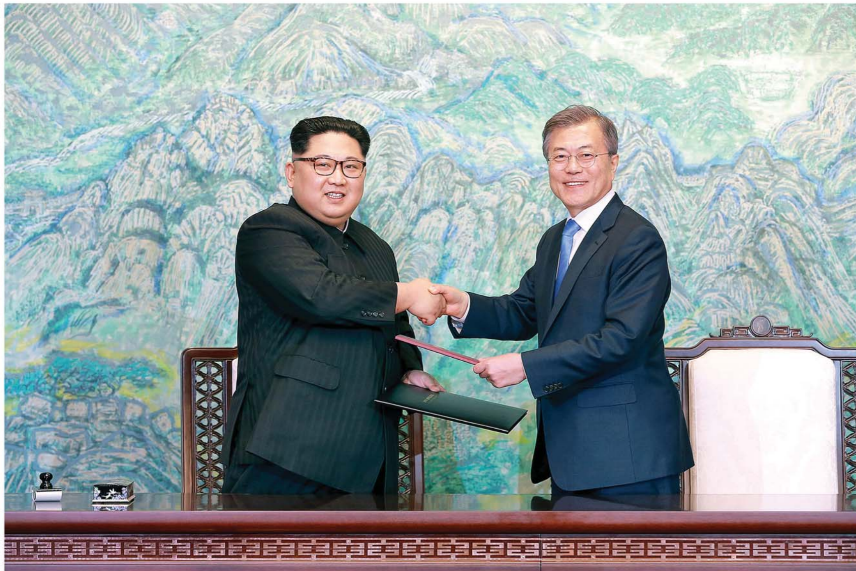
Supreme Leader Kim Jong Un signing the Panmunjom Declaration for Peace, Prosperity and Reunification of the Korean Peninsula and exchanging documents with President Moon Jae In [April Juche 107 (2018)]