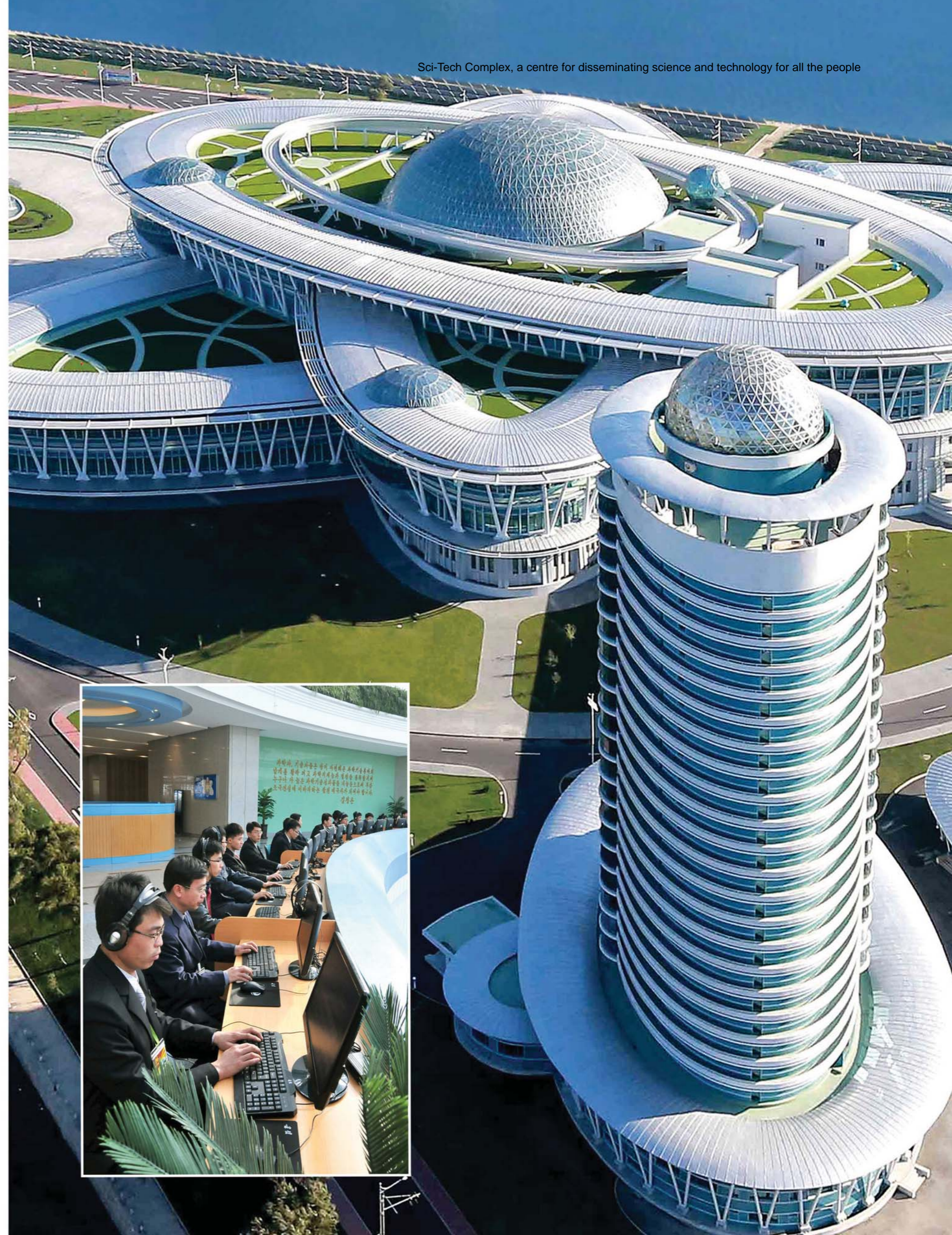
Sci-Tech Complex, a centre for disseminating science and technology for all the people