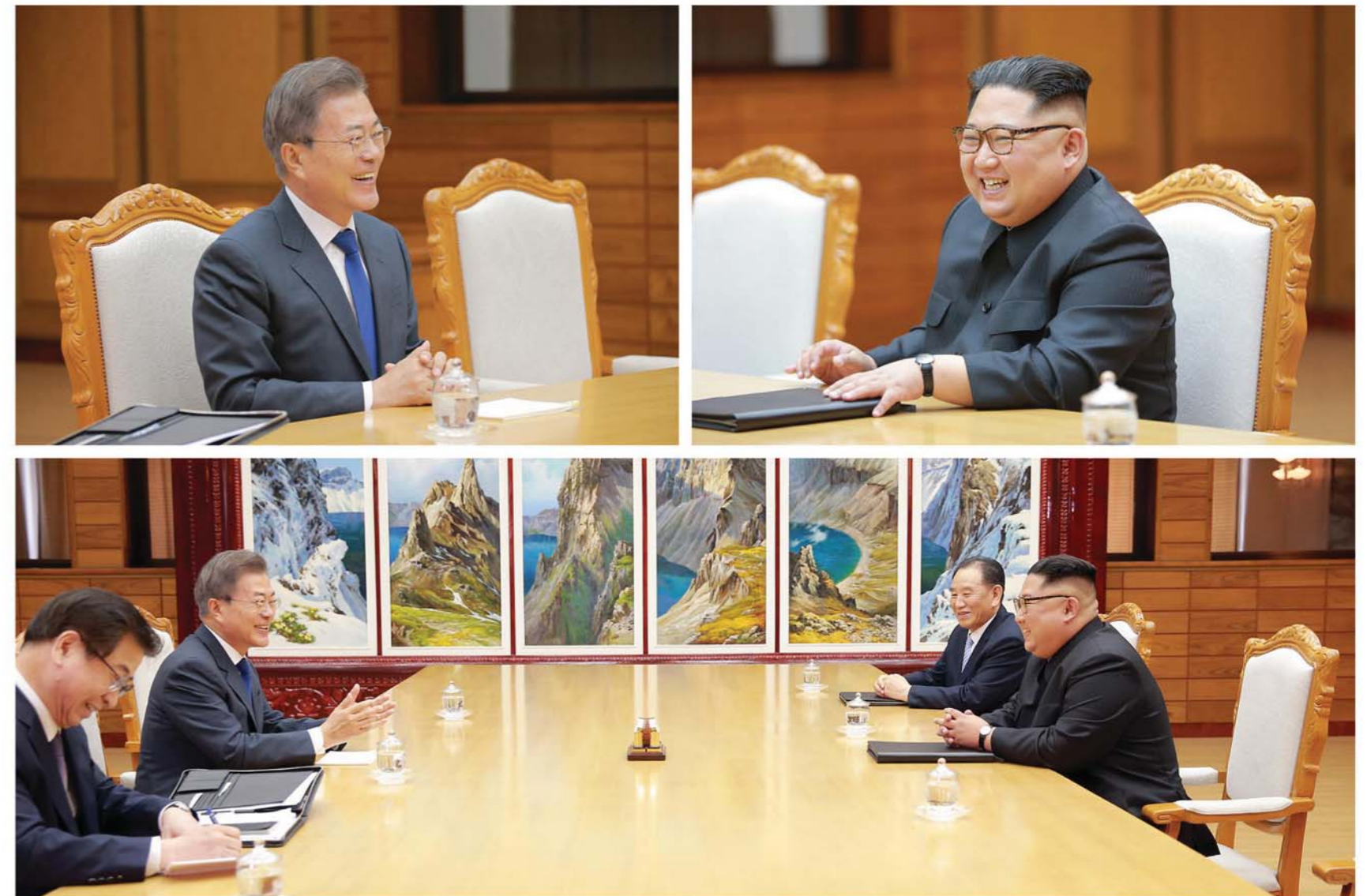
Supreme Leader Kim Jong Un meeting President Moon Jae In again and talking with him [May Juche 107 (2018)]

higher stage of development and accelerating the reunification movement.