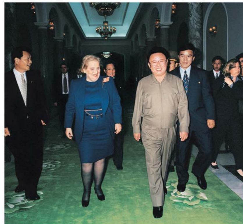
Kim Jong Il meeting Madeleine K. Albright, US State Secretary [October Juche 89 (2000)]