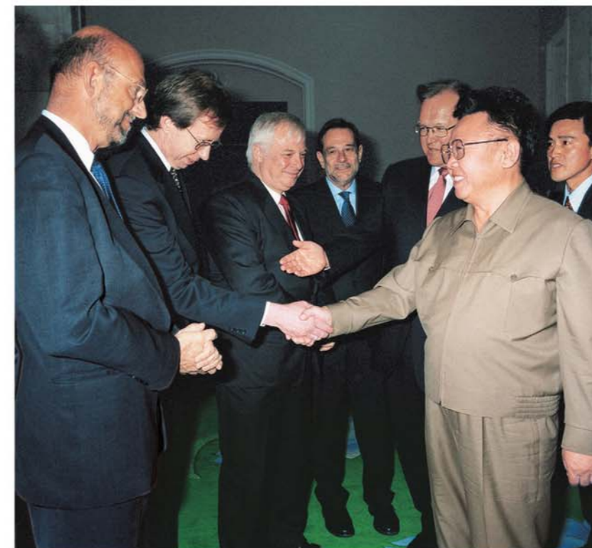
Kim Jong Il meeting EU's high-ranking officials' delegation [May Juche 90 (2001)]