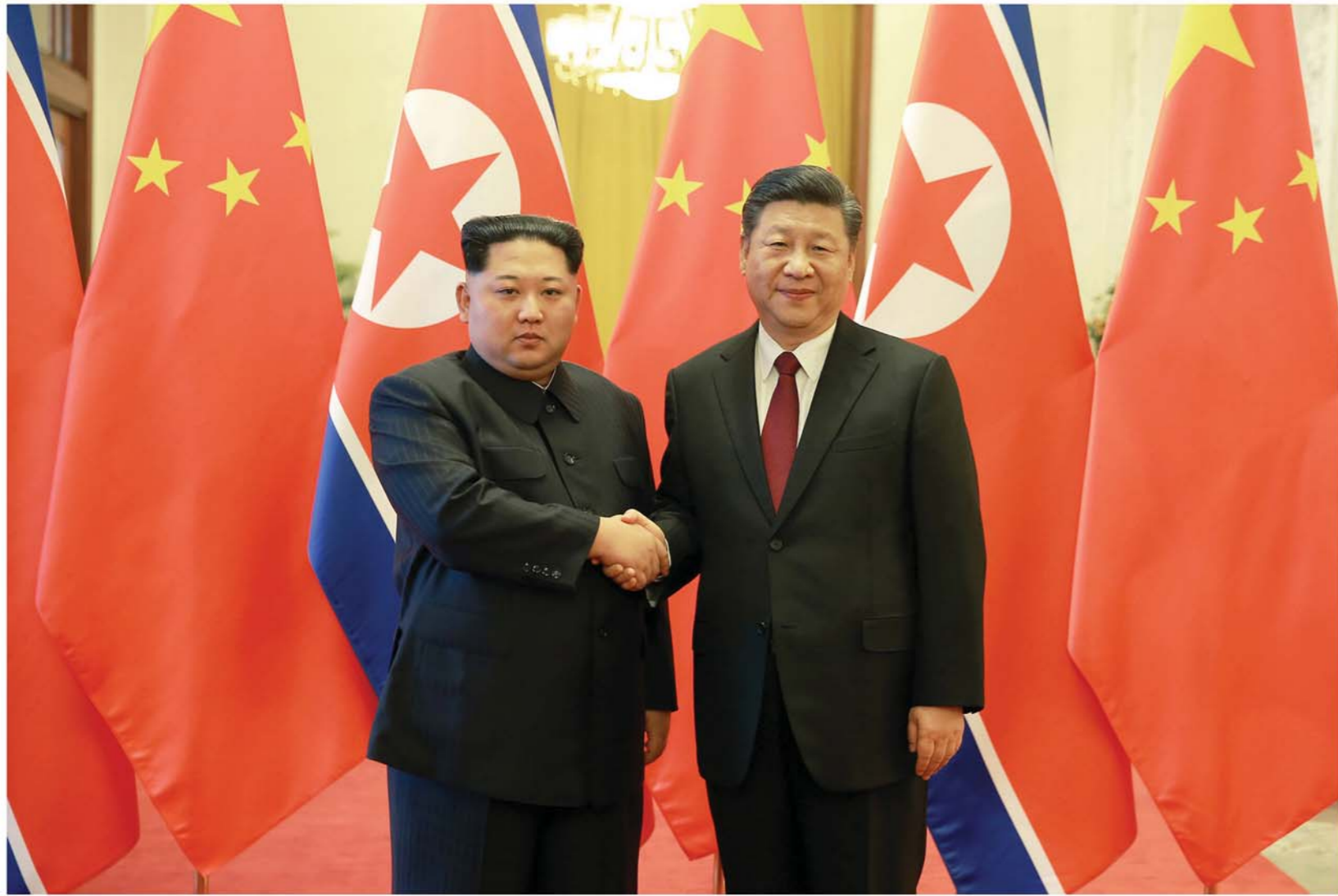
Kim Jong Un, Chairman of the State Affairs Commission of the DPRK, meeting and talking with Xi Jinping, President of the People's Republic of China [March Juche 107 (2018)]