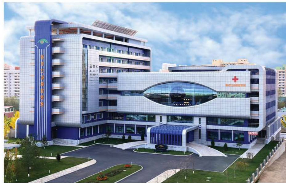
Medical establishments are built for the people to enjoy the benefits of free medical treatment