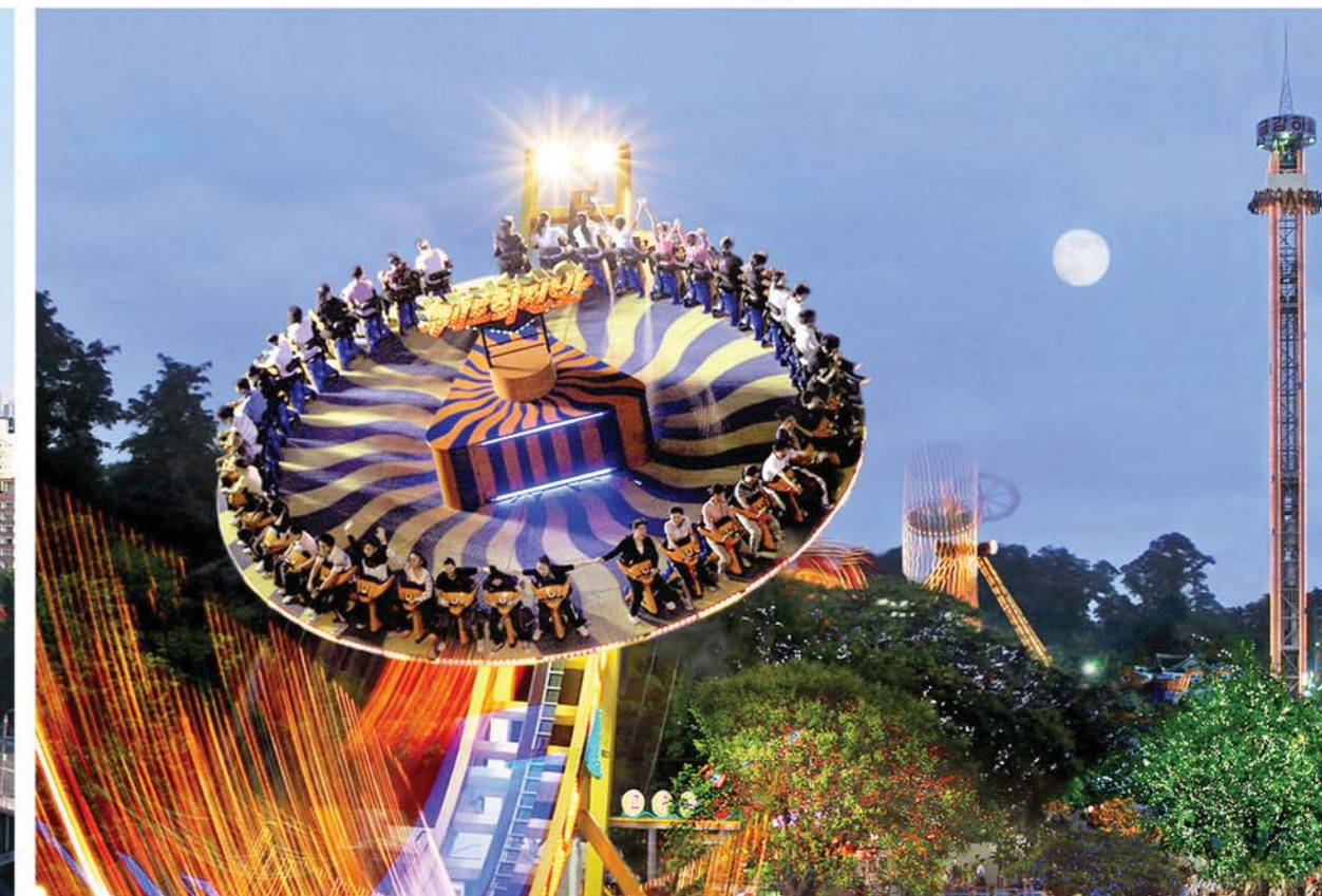
Thanks to the people-oriented policy of the DPRK government light industry factories, socialist streets, and bases for cultural and leisure activities are built all across the country to contribute to the people's material life and well-being