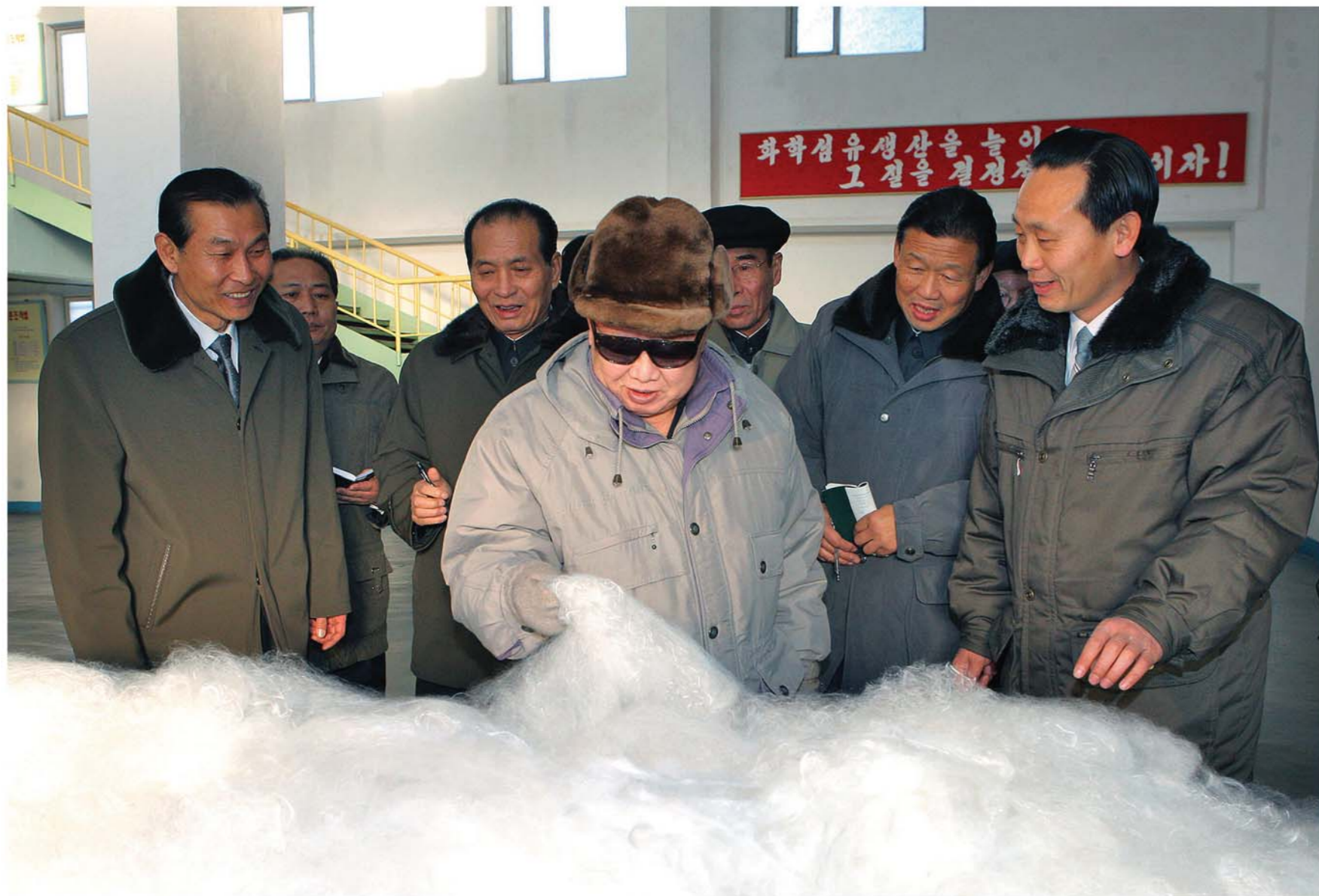
Kim Jong Il appreciating vinalon cotton at the February 8 Vinalon Complex [January Juche 100 (2011)]