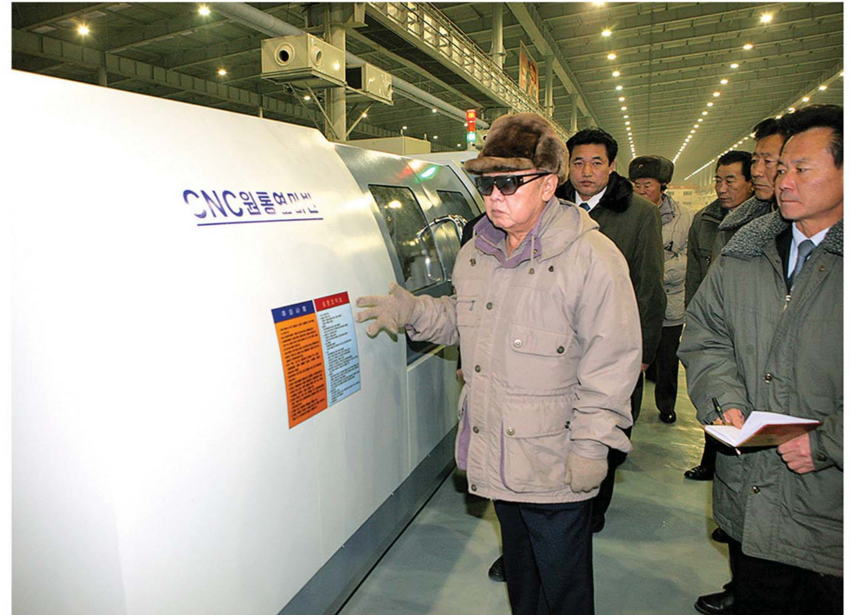
Kim Jong Il looking at new-type CNC machine tools [December Juche 99 (2010)]