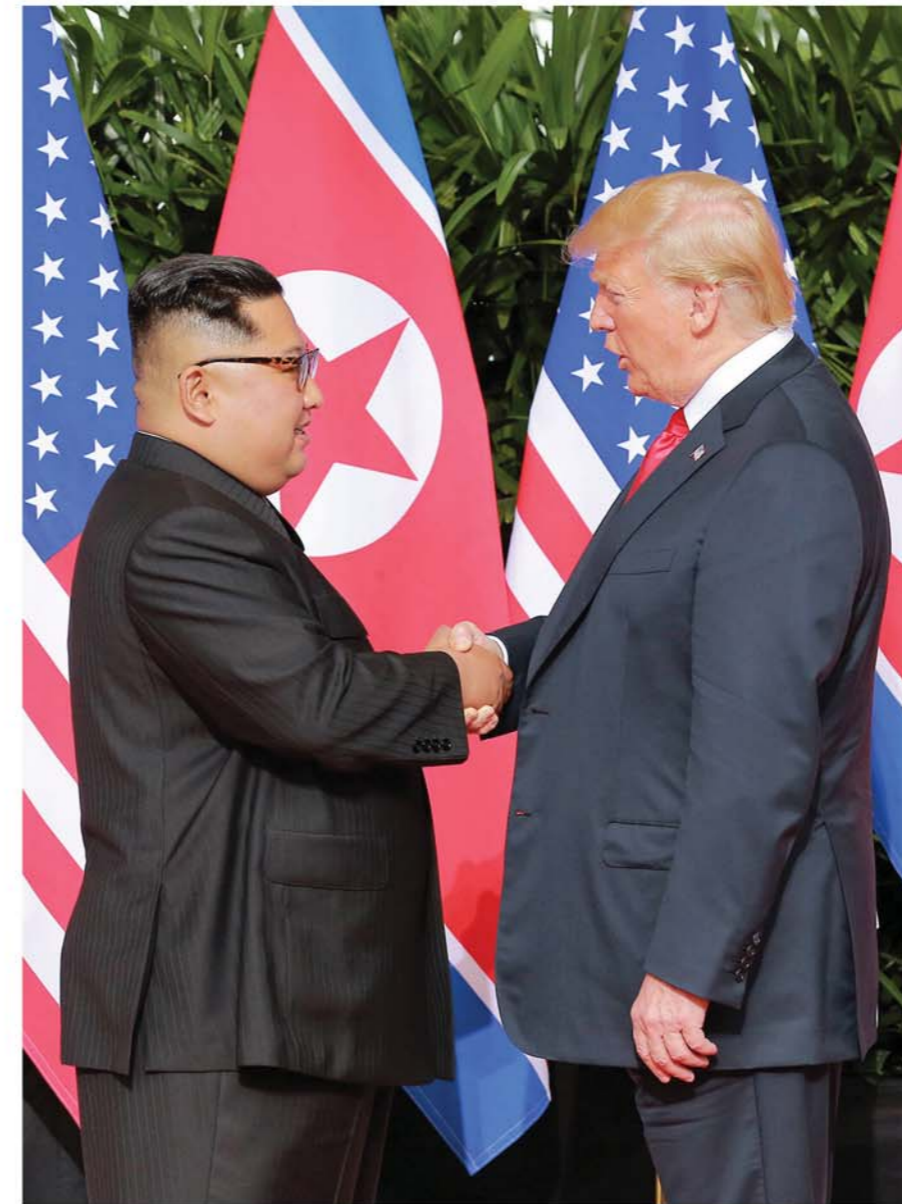
Kim Jong Un, Chairman of the State Affairs Commission of the DPRK, meeting and talking with Donald J. Trump, President of the United States of America [June Juche 107 (2018)]