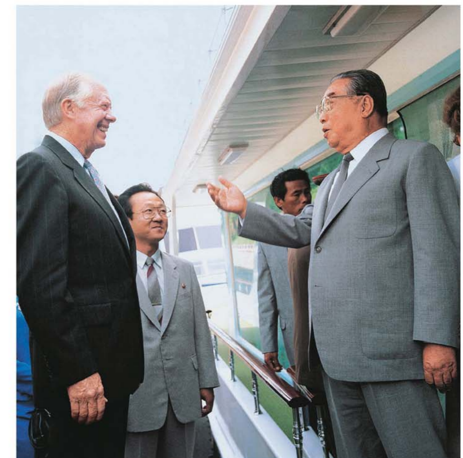
Kim Il Sung meeting Jimmy Carter, former President of the USA [June Juche 83 (1994)]