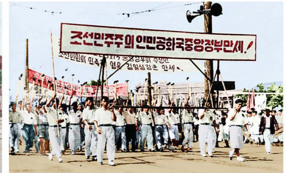
The DPRK's founding filled the people with great pride and delight in being masters of the government