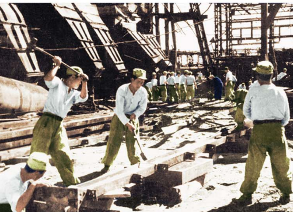
The Korean people waged vigorous campaigns for postwar reconstruction and socialist transformation of production relations