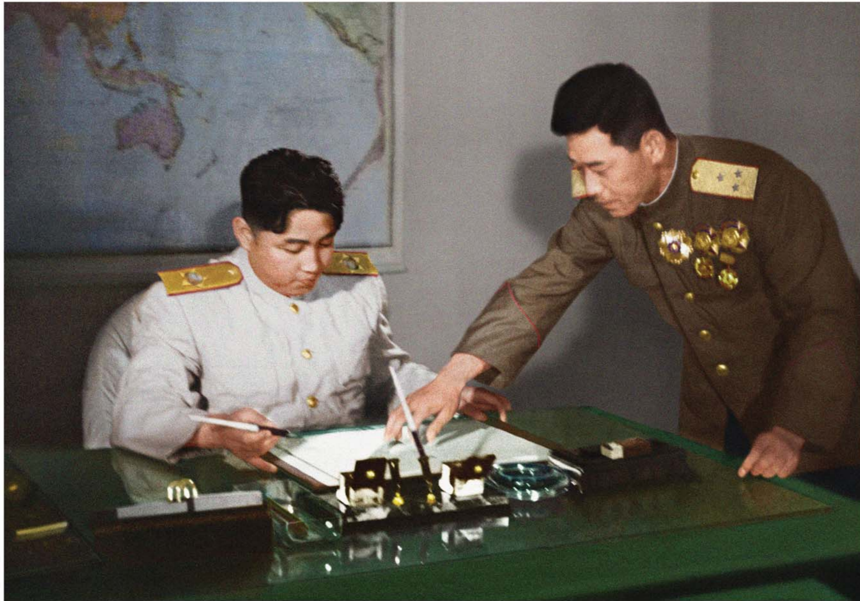
Kim Il Sung ratifying the Korean Armistice Agreement [July Juche 42 (1953)]