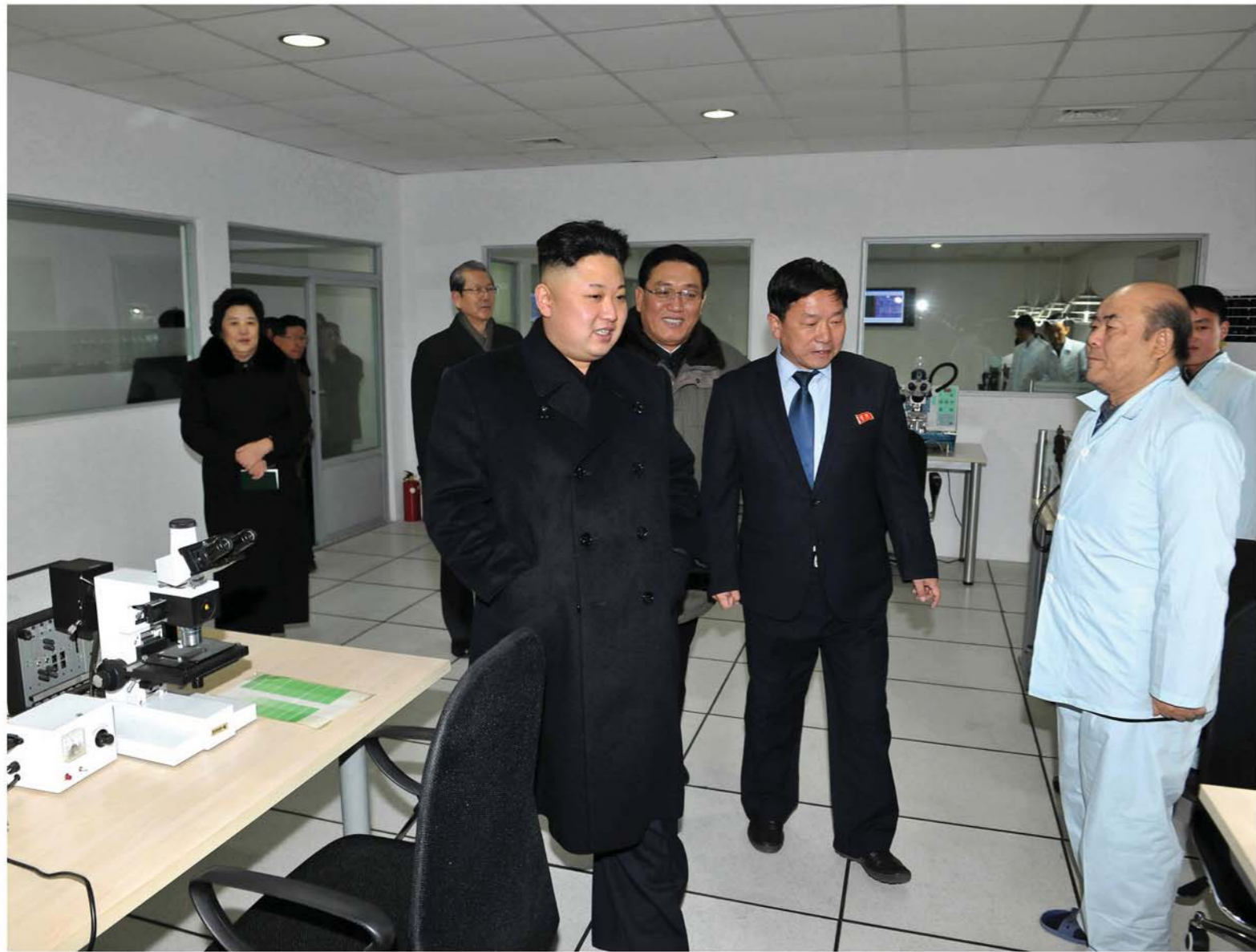
Kim Jong Un visiting the State Academy of Sciences [January Juche 103 (2014)]