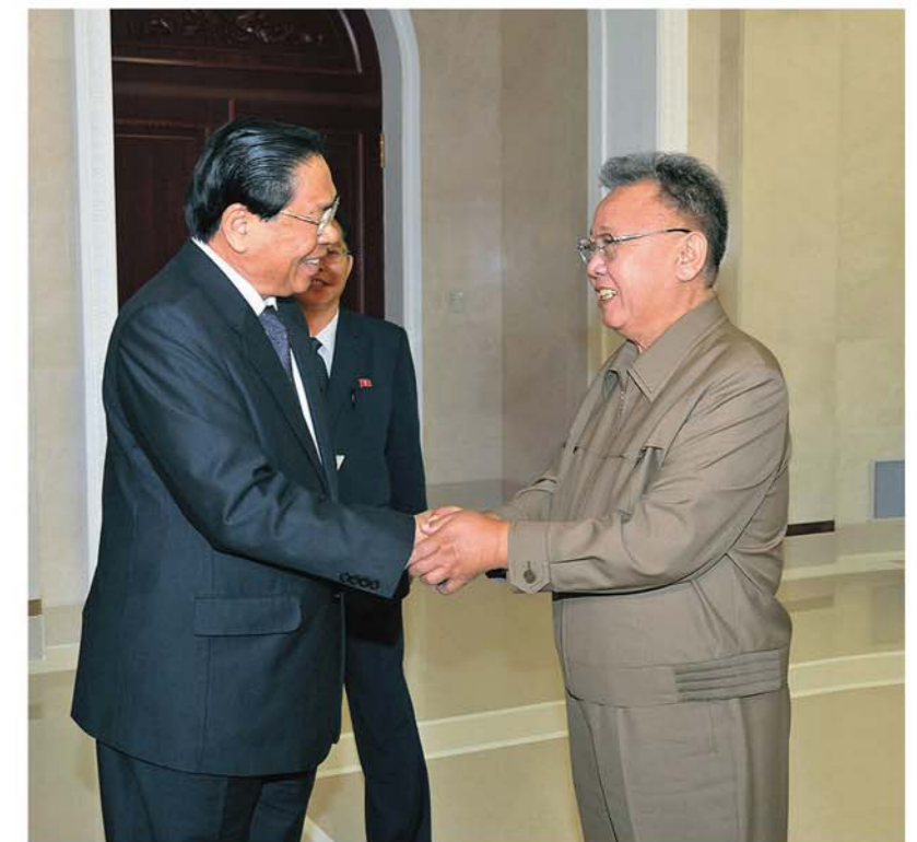
Kim Jong Il meeting President Choummaly Sayasone of the Lao People's Democratic Republic [September Juche 100 (2011)]