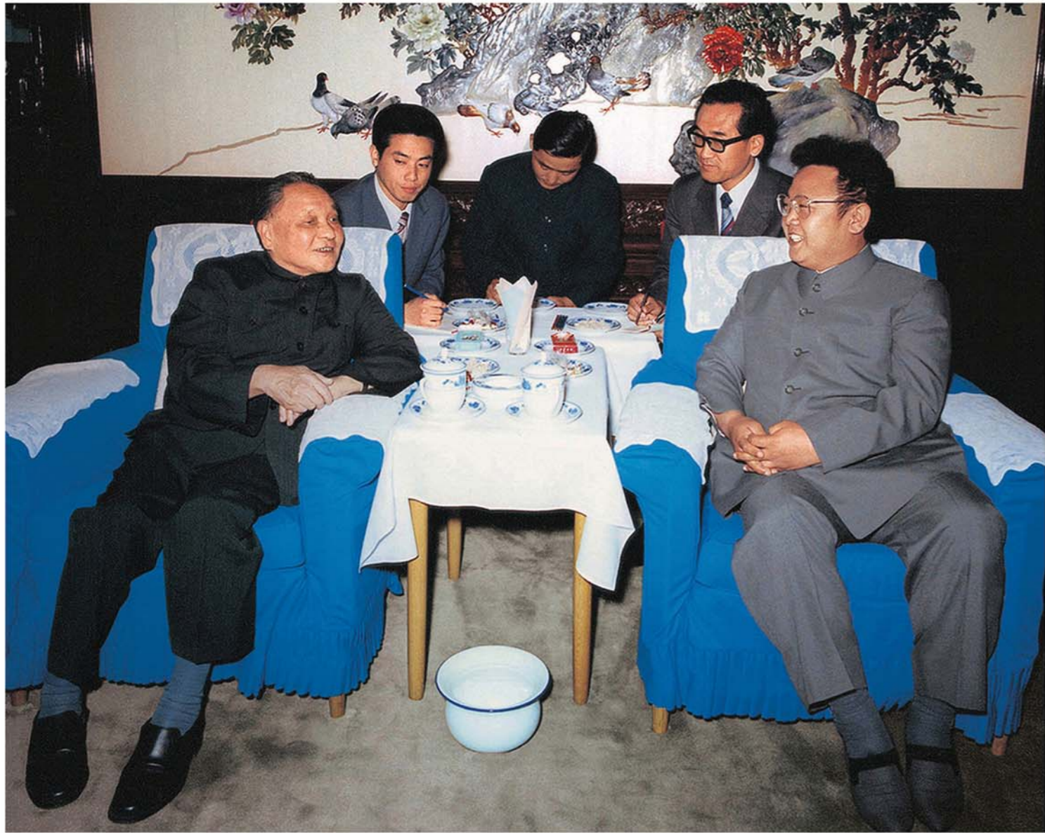
Kim Jong Il having an amicable talk with Deng Xiaoping, Chairman of the Central Advisory Commission of the Communist Party of China [June Juche 72 (1983)]