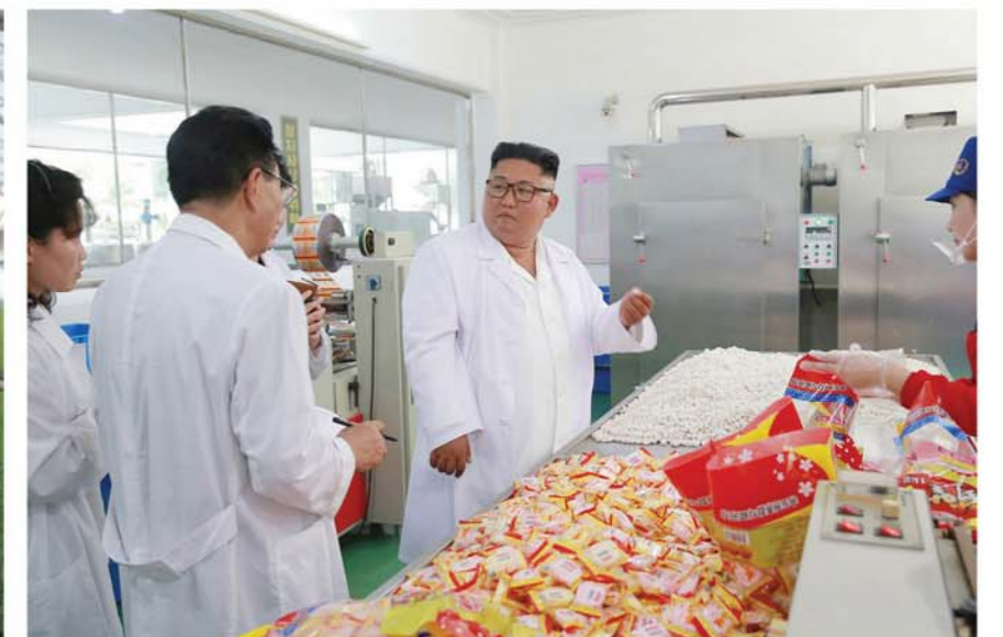
Supreme Leader Kim Jong Un visiting the Songdownon General Foodstuff Factory [July Juche 107 (2018)]

Supreme Leader Kim Jong Un provided field guidance in North Hamgyong Province, including the construction sites of the Orangchon Power Station and Yombunjin Hotel, Onpho Holiday Camp and Chongjin Bag Factory, and made a field survey of the site for a large-scale vegetable greenhouse farm in Jungphyong-ri of Kyongsong County.