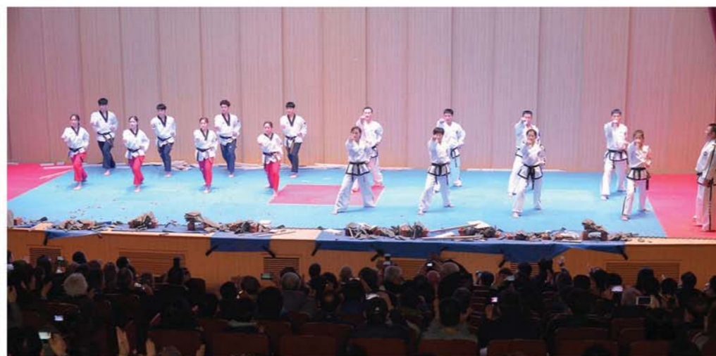
During the 23rd Winter Olympics held in south Korea the Samjiyon Orchestra gave an excellent performance reflecting the ardent wish of the people in the north, and Taekwon-Do practitioners of the north and the south staged a joint exhibition, displaying the mettle and courage of the Korean nation