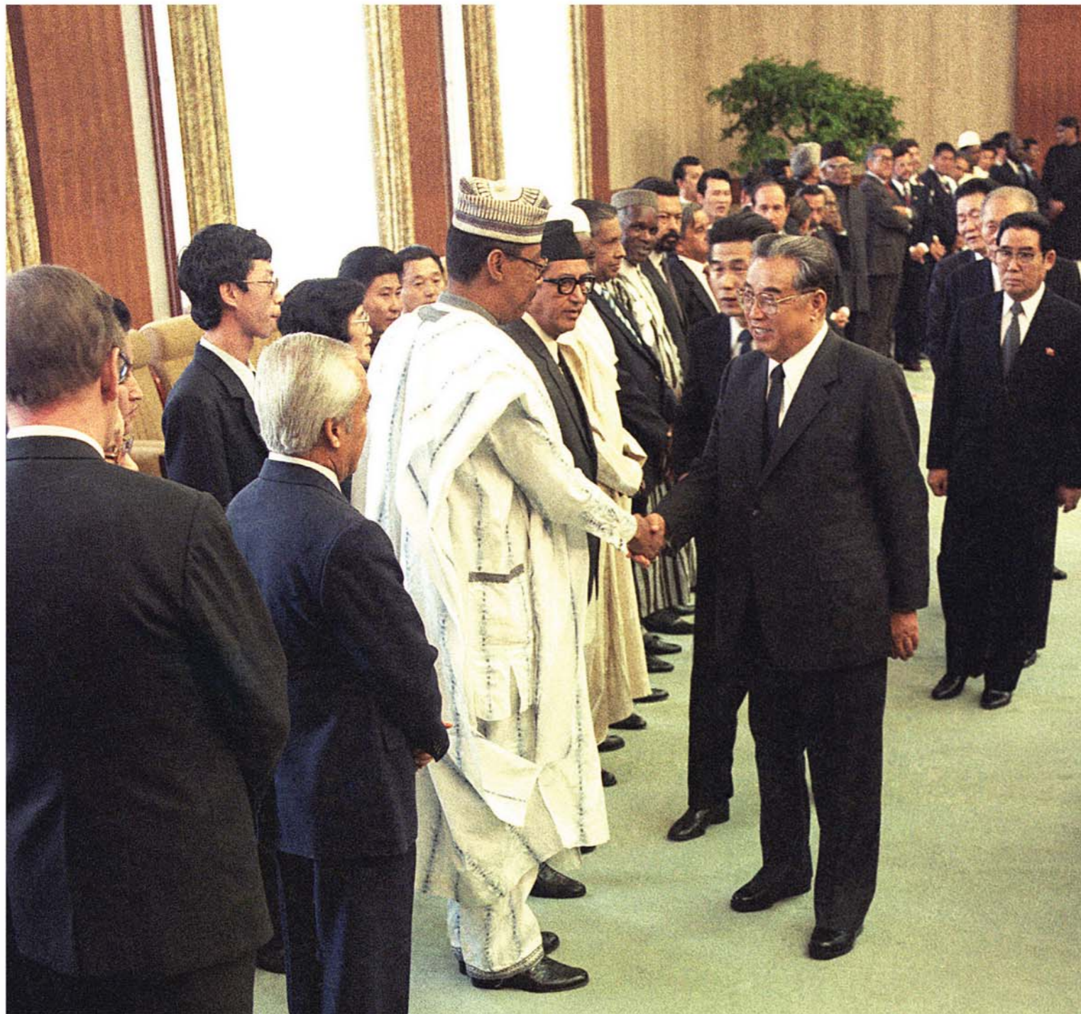
Kim Il Sung meeting heads of state and government and delegations of foreign countries [April Juche 76 (1987)]