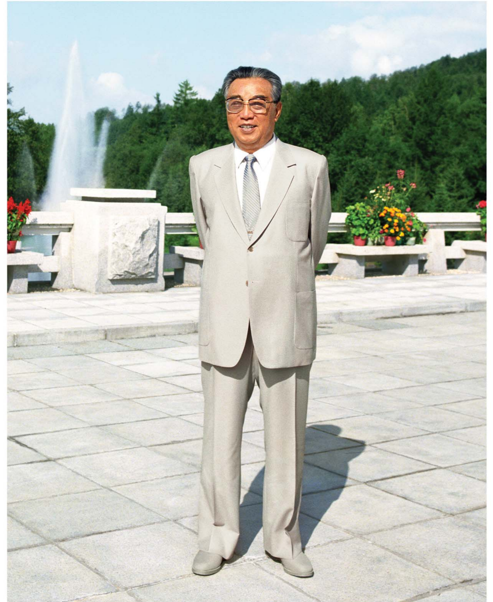
Kim Il Sung, founder of the Democratic People's Republic of Korea