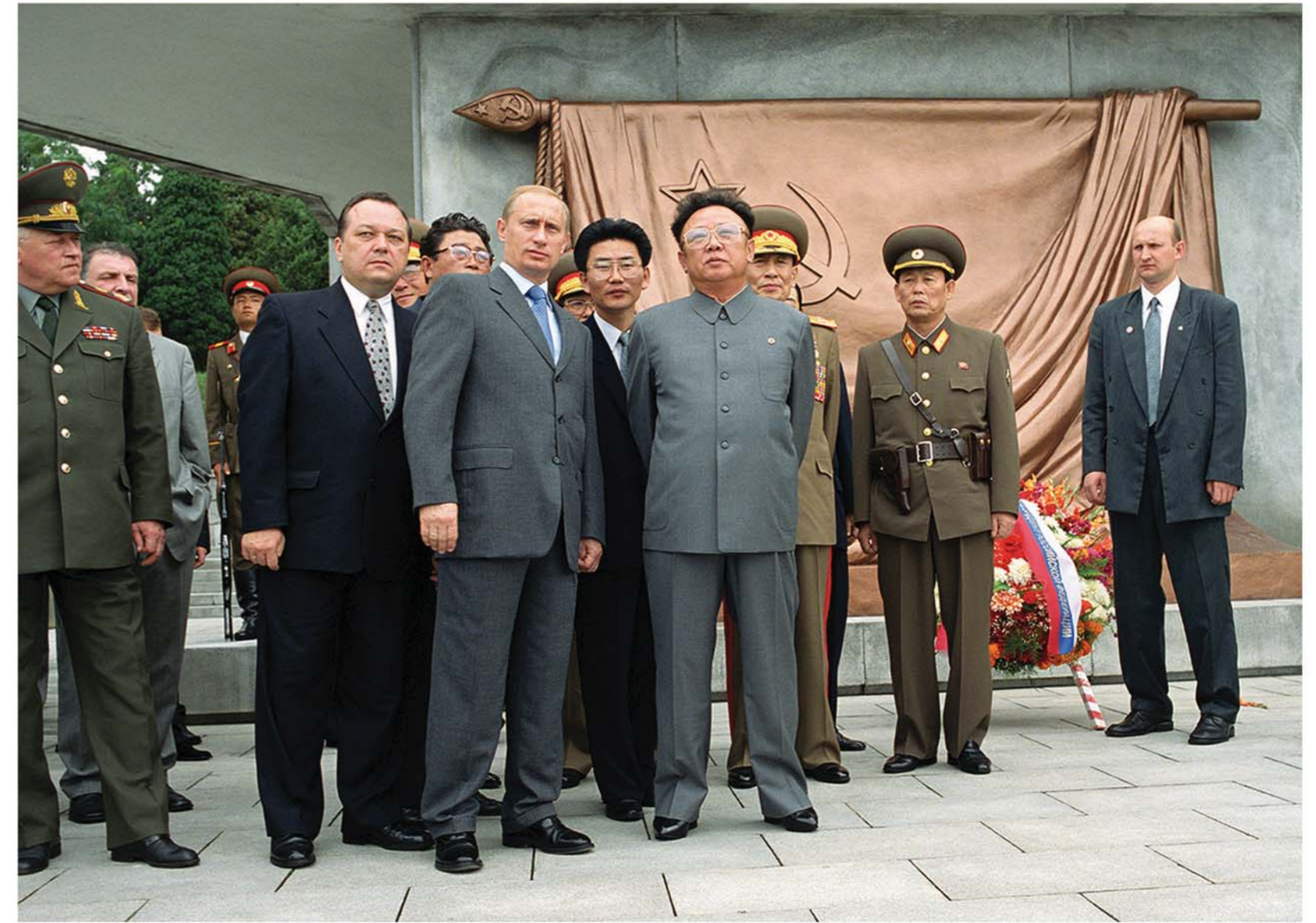
Kim Jong Il looking round the Tower of Liberation with President V. V. Putin of Russian Federation [July Juche 89 (2000)]

In the grim period when the international socialist movement was experiencing severe frustration the DPRK waged a powerful struggle to defend and advance the cause of socialism and thus encouraged the revolutionary peoples in their struggle to rebuild socialism.