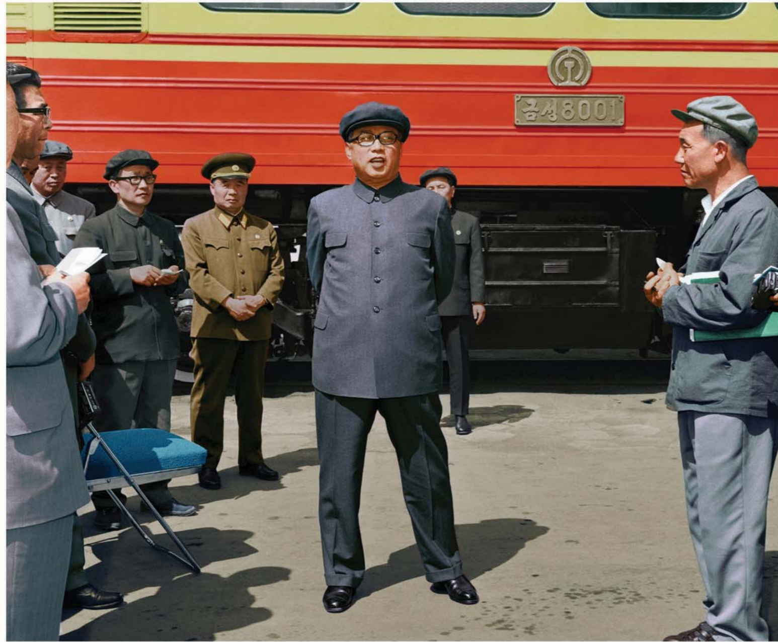
Kim Il Sung seeing Kumsong , a diesel locomotive engine newly manufactured at the Kim Jong Thae Electric Locomotive Factory [May Juche 64 (1975)]