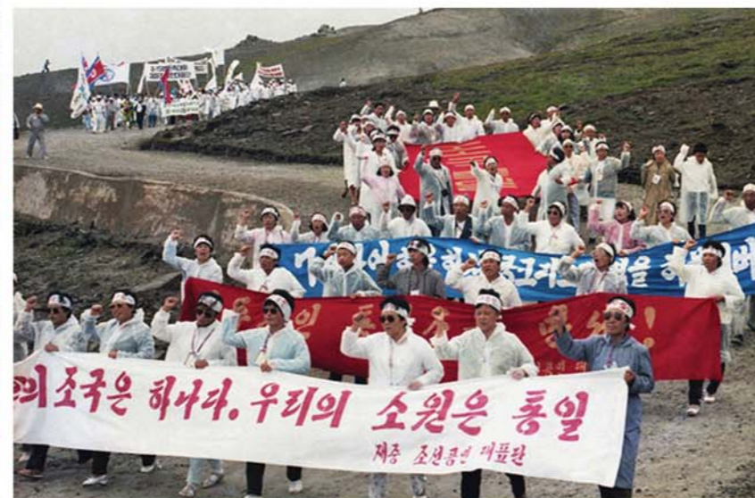
Nationwide movement was launched to put an end to national division by outside forces and achieve the country's reunification without fail

of all foreign troops from the country and the accomplishment of the country's reunification by the Korean nation's own efforts as a policy of the government. Afterwards, it put forth lines and policies for national reunification reflecting the nation's demand and desire for independence at every period and stage of its development and directed continuous efforts to carry them out.