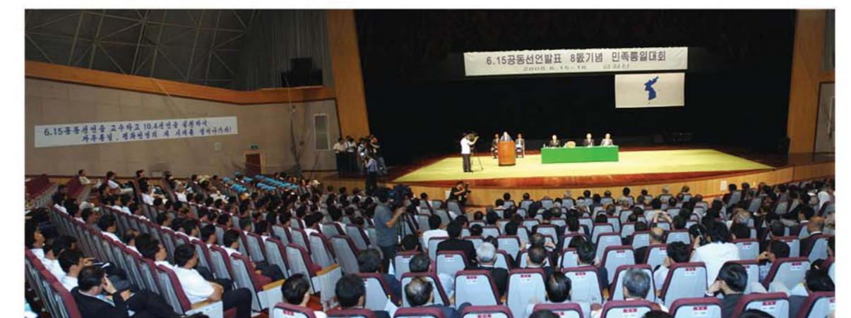
Vigorous struggle was conducted to defend the June 15 North-South Joint Declaration and implement the October 4 Declaration to open up a new era of independent reunification, peace and prosperity