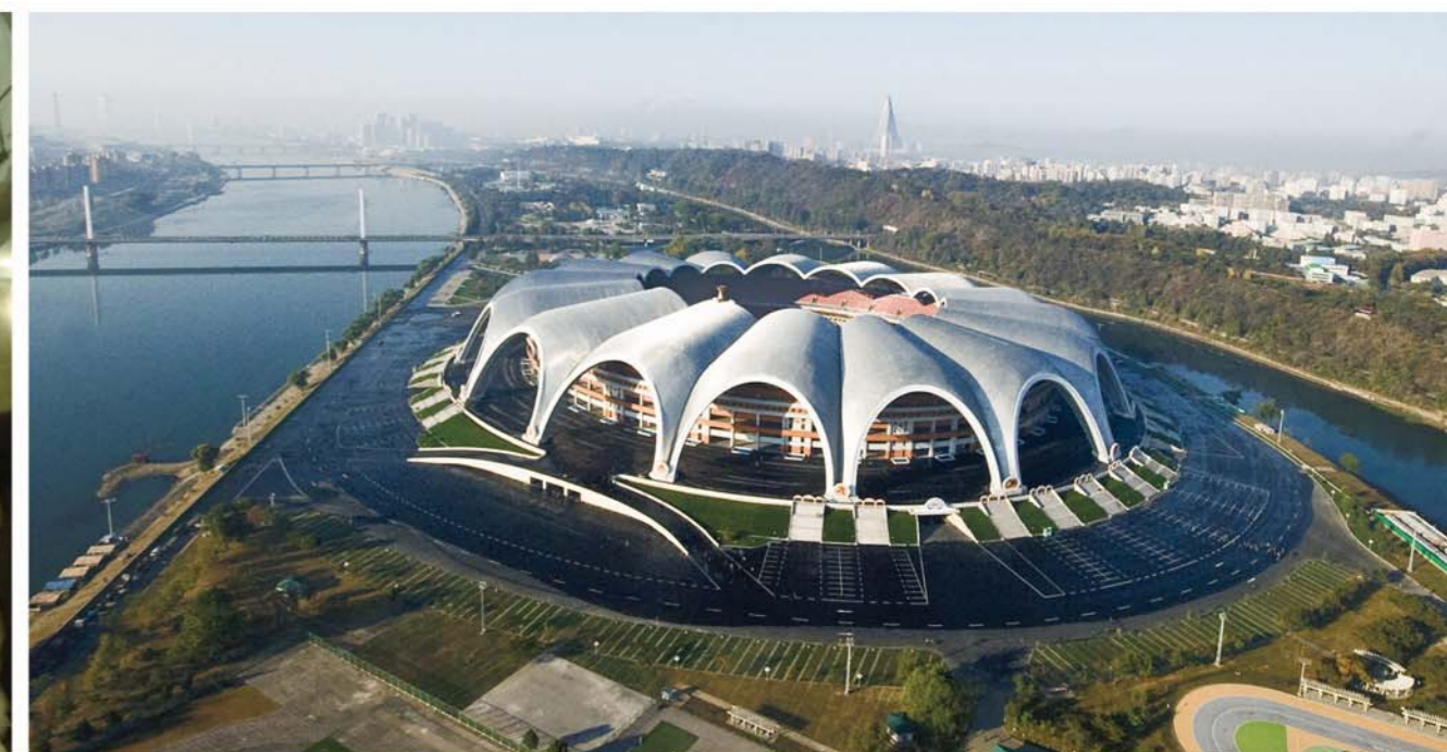
Such monumental edifices as the Kwangbok Street, Pyongyang Underground and May Day Stadium were built