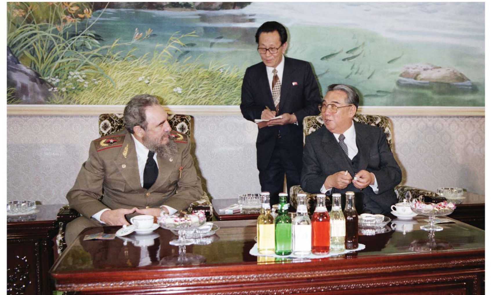
Kim Il Sung talking with Fidel Castro Ruz, President of the State Council of the Cuban Republic [March Juche 75 (1986)]

cope with them, the DPRK has consolidated its international profile and solidarity.