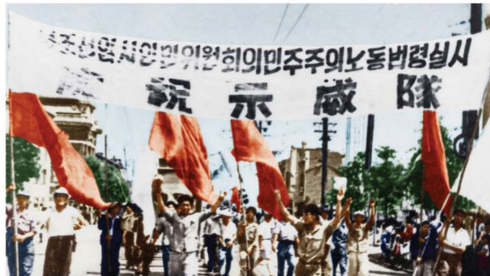
After Korea's liberation from Japanese military occupation such democratic reforms as the agrarian reform were carried out, making the working people masters of land and factories