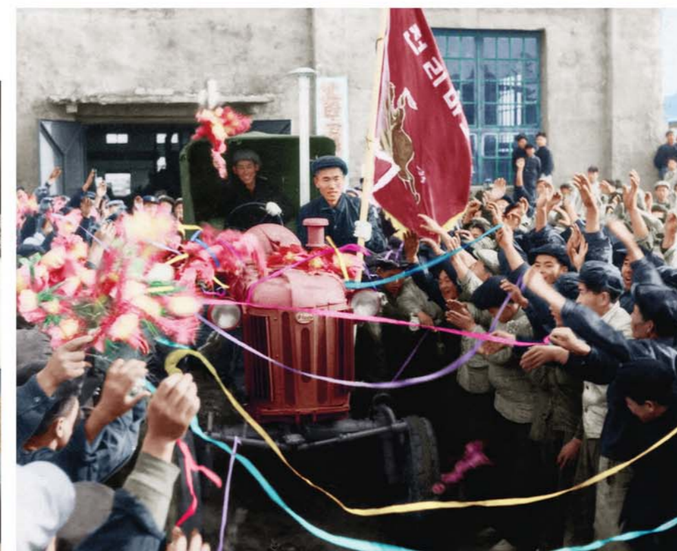
The Chollima era when victorious achievements of self-reliance were made