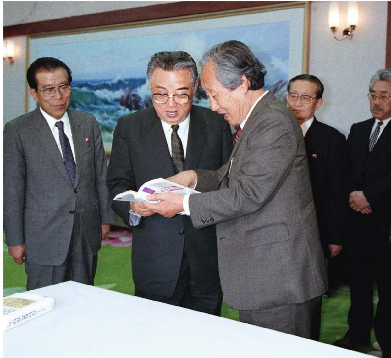
Kim Il Sung meeting with Rev. Moon Ik Hwan, advisor to the Coalition for the National Democratic Movement in south Korea [March Juche 78 (1989)]