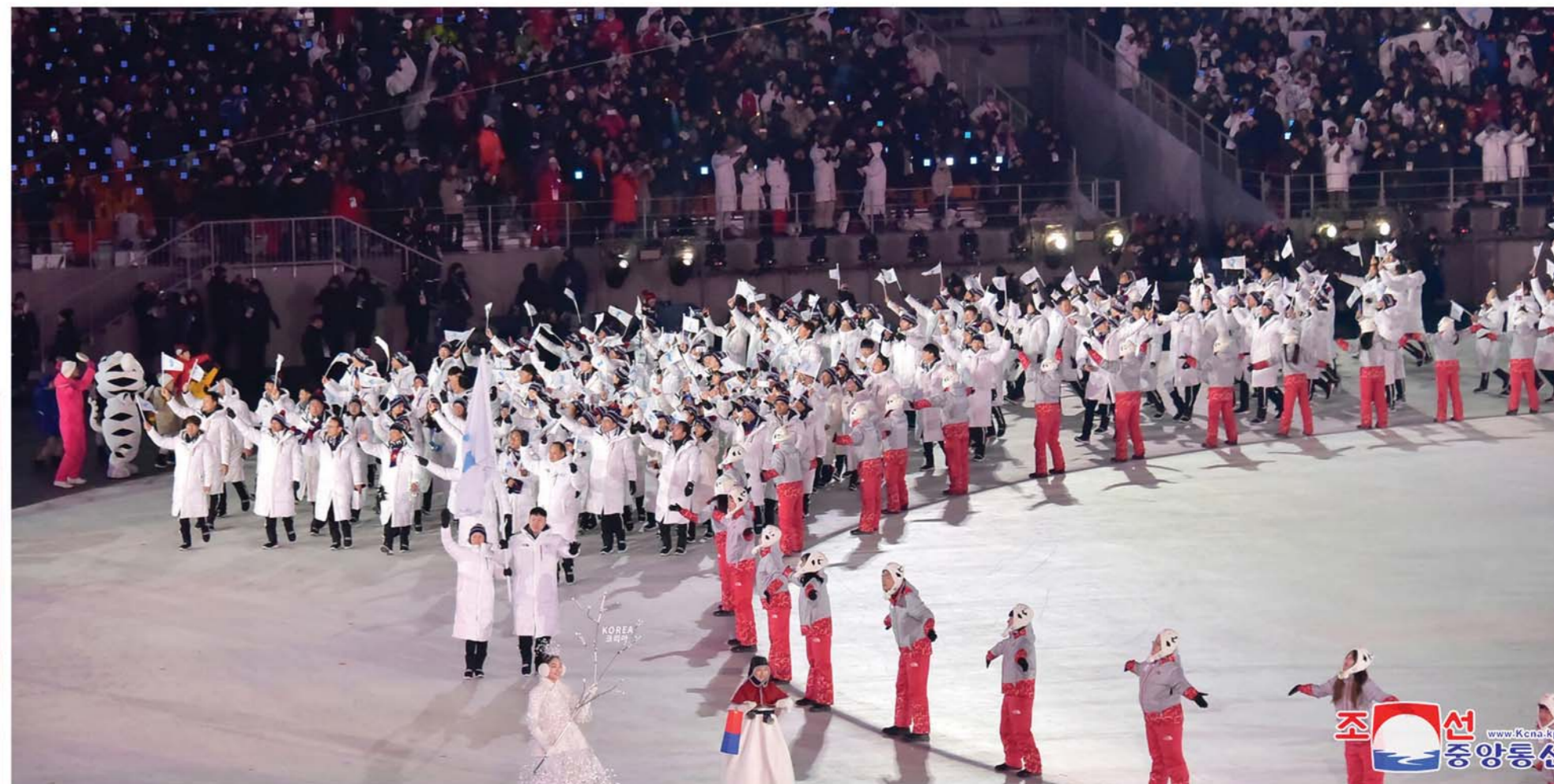
Sportspersons of the north and south of Korea jointly entering the opening ceremony of the 23rd Winter Olympics held in Pyongchang of south Korea, preceded by the One Korea flag