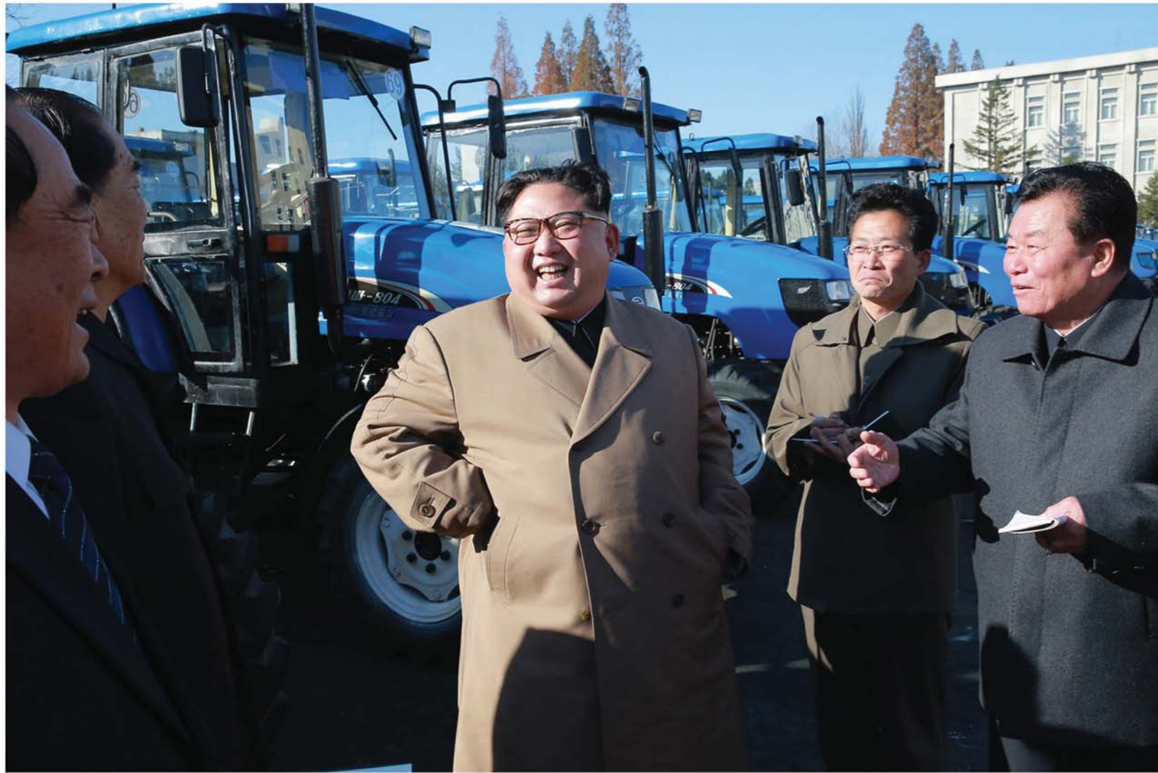
Kim Jong Un giving field guidance at Kumsong Tractor Factory [November Juche 106 (2017)]