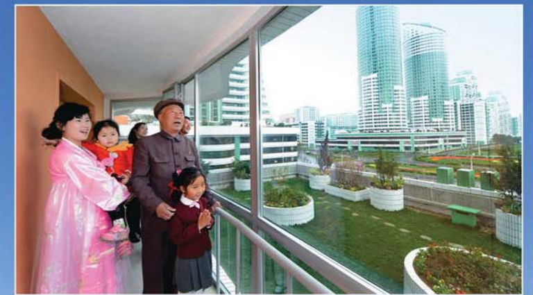
Dwelling houses are provided to people by state free of charge