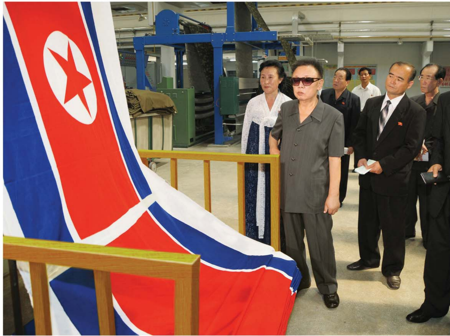
Kim Jong Il giving field guidance at the Pyongyang Textile Mill [July Juche 98 (2009)]