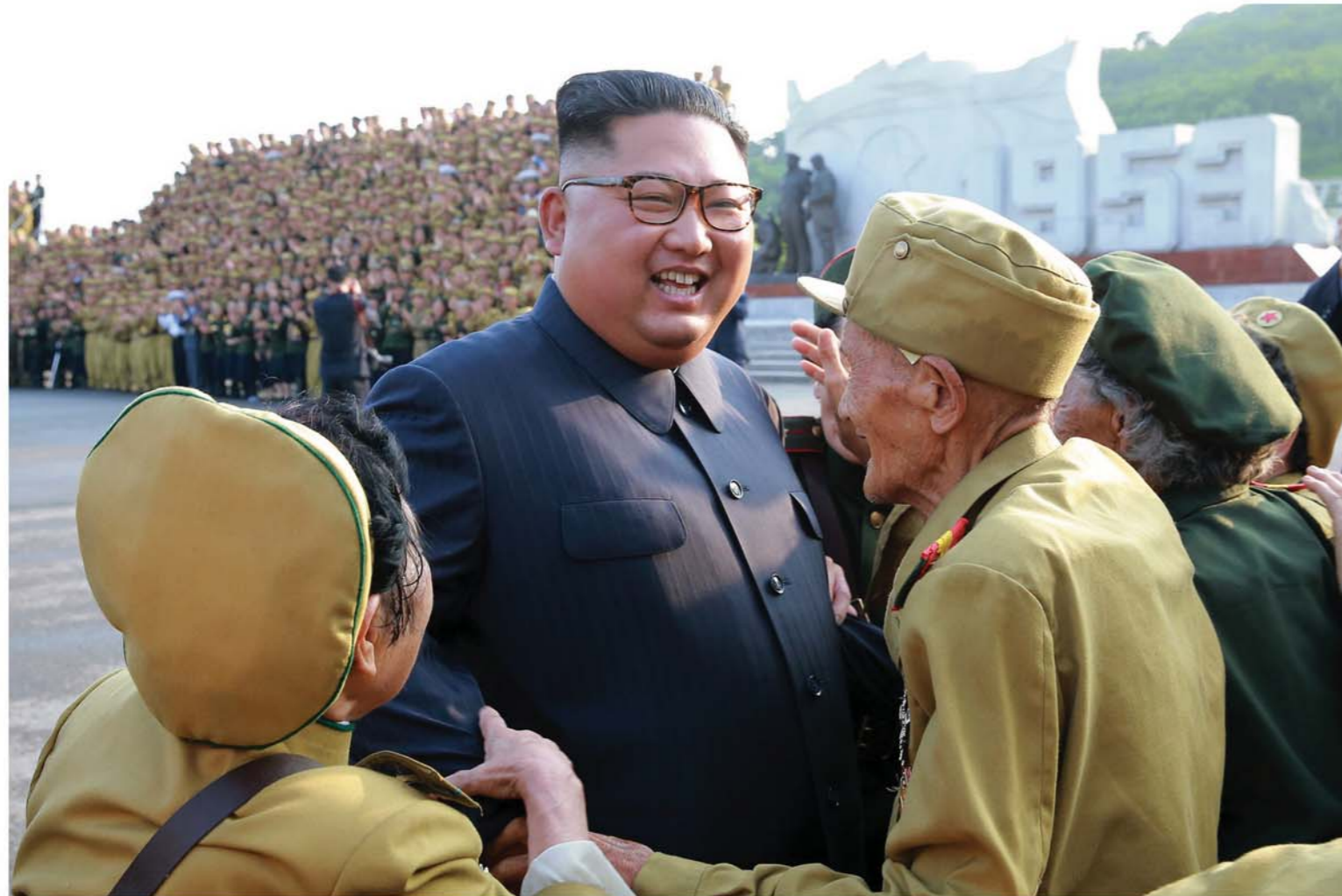
Supreme Leader Kim Jong Un meeting with the participants in the Fifth National Conference of War Veterans [July Juche 107 (2018)]