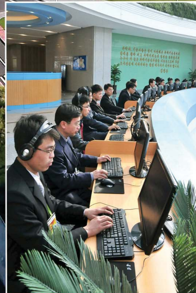
The universal 11-year compulsory education, the first of its kind in the world, was enforced in 1972 and the universal 12-year compulsory education in 2014. The DPRK is now arousing state interest in education and increasing investment in placing education on a scientific, IT and modern basis.