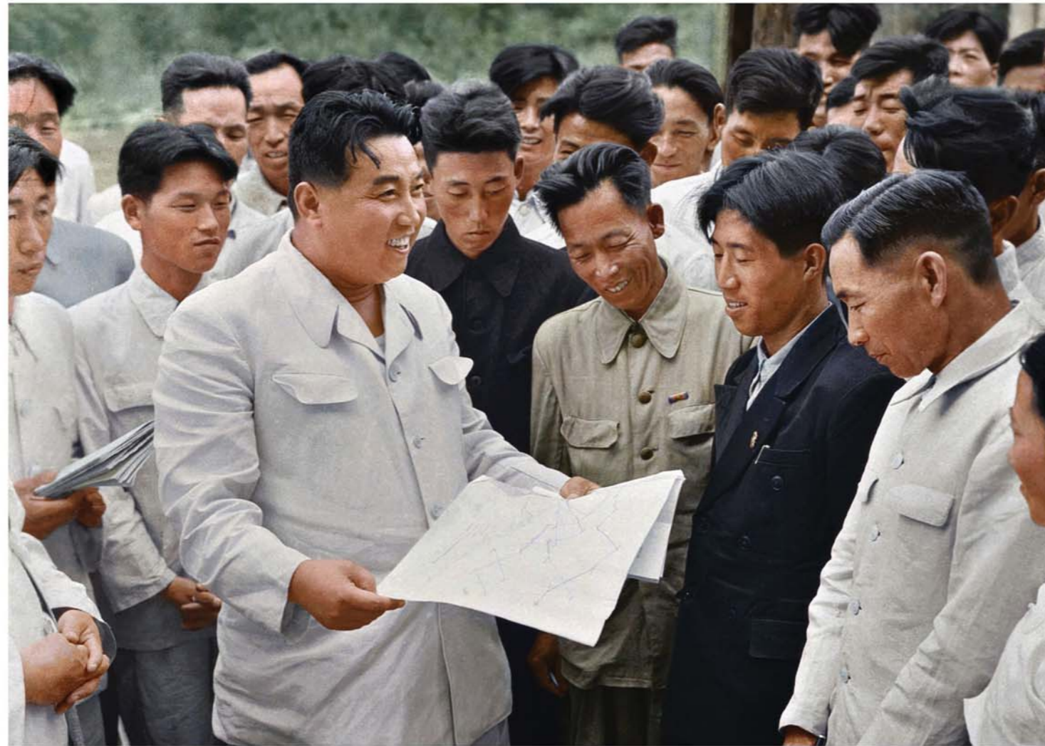
Kim Il Sung talking with workers of the Hwanghae Iron Works [September Juche 48 (1959)]

Seventy-year-long history of the Democratic People's Republic of Korea records the one of building a self-sufficient national economy from scratch.