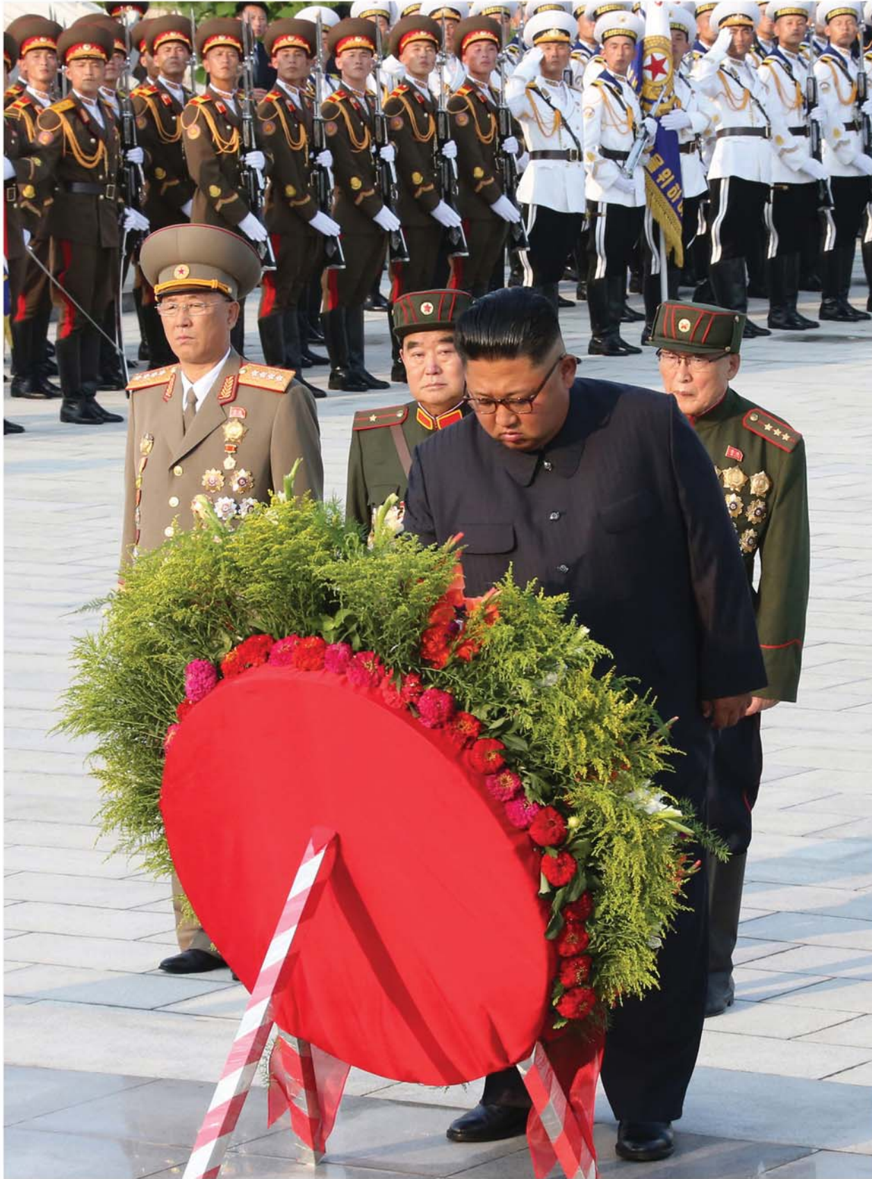
Supreme Leader Kim Jong Un visiting the Fatherland Liberation War Martyrs Cemetery to pay homage to the fallen soldiers of the KPA to mark the 65th anniversary of the victory in the war [July Juche 107 (2018)]

Kim Jong Un, Chairman of the Workers' Party of Korea, Chairman of the DPRK State Affairs Commission and Supreme Commander of the Korean People's Army, visited the Fatherland Liberation War Martyrs Cemetery to pay homage to the fallen soldiers of the KPA on July 26 to mark the 65th anniversary of the victory in the war.