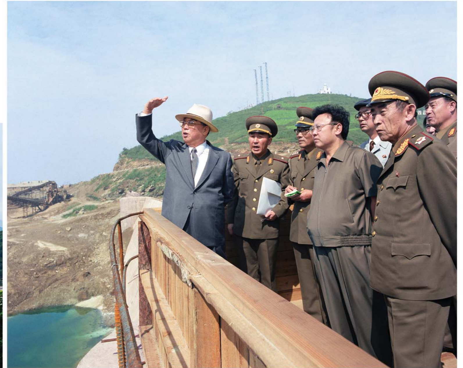
Kim Il Sung and Kim Jong Il visiting the construction site of the West Sea Barrage [September Juche 74 (1985)]