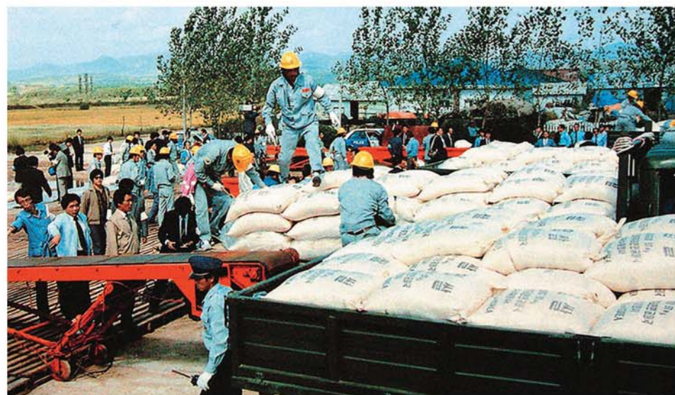
The DPRK government sent relief materials to flood victims in south Korea in Juche 73 (1984)

When it was founded in September Juche 37 (1948), the DPRK made public the withdrawal