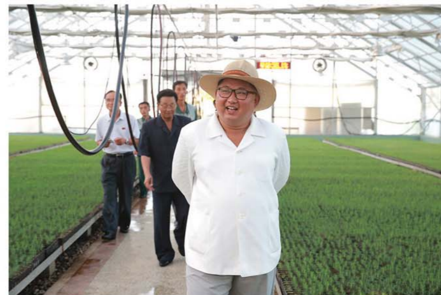
Supreme Leader Kim Jong Un visiting the Kangwon Provincial Tree Nursery [July Juche 107 (2018)]