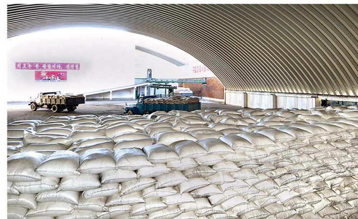
By consolidating independence and Juche character of the national economy in the face of the imperialist manoeuvres to isolate and stifle it, the DPRK laid solid foundations for producing Juche iron, vinalon and fertilizer