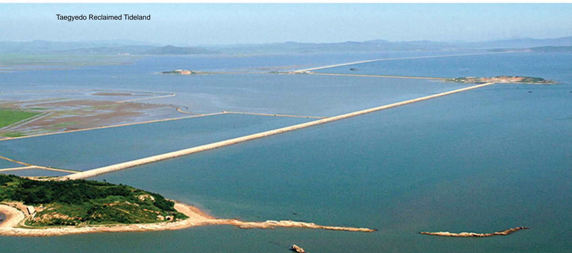
Taegyedo Reclaimed Tideland