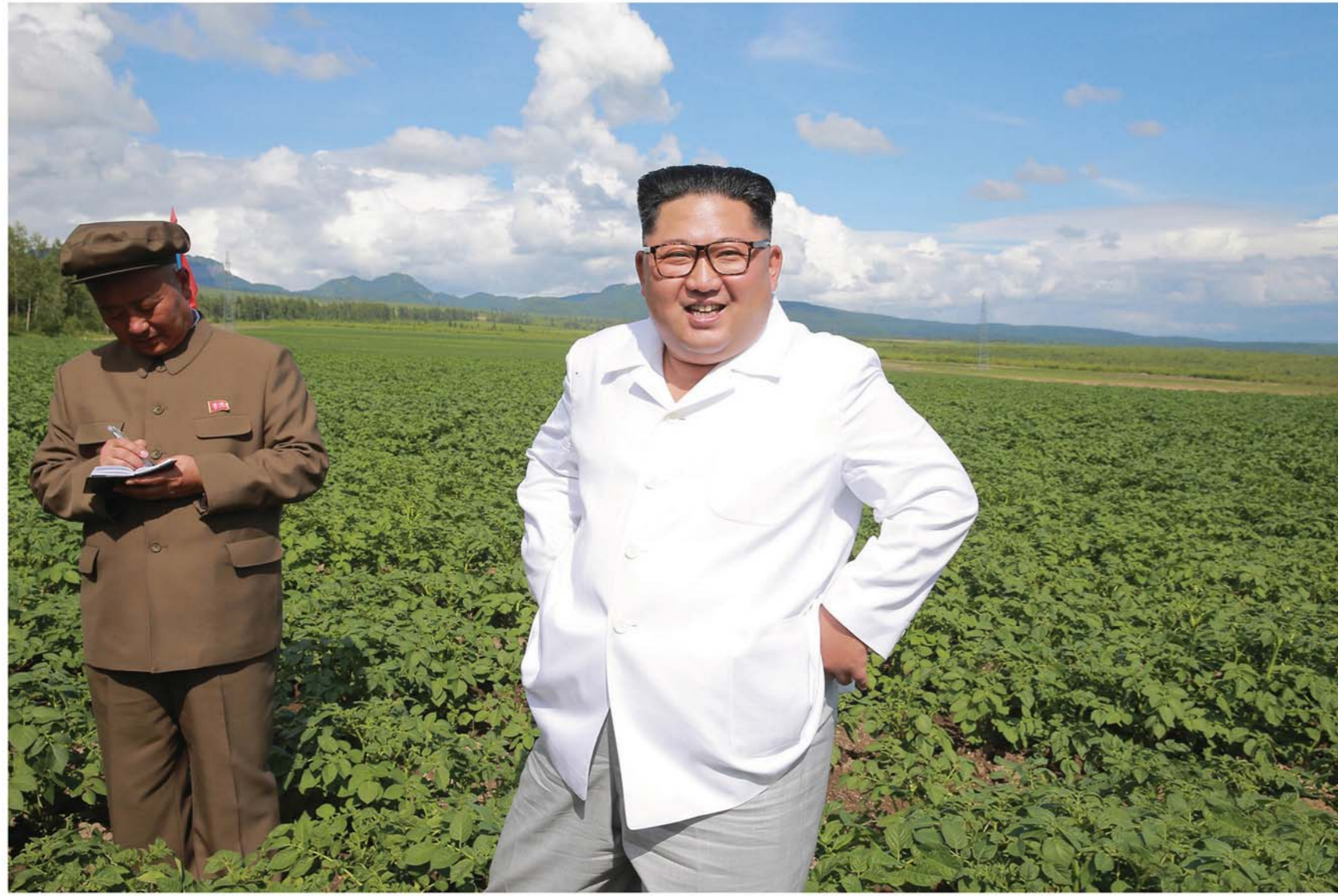
Supreme Leader Kim Jong Un visiting the Junghung Farm in Samjiyon County [July Juche 107 (2018)]