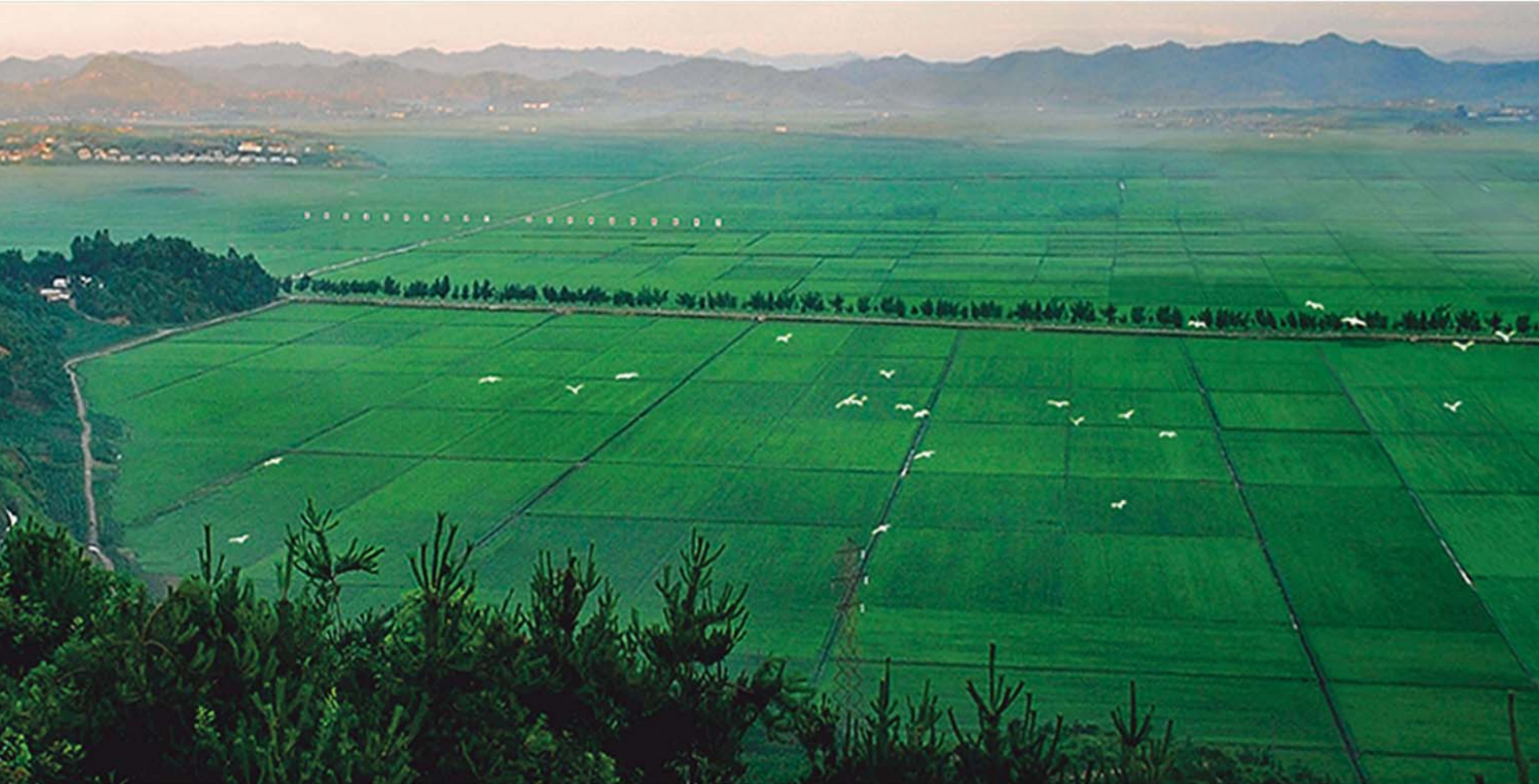
Land realignment project was carried out to turn the fields of the country into standardized ones