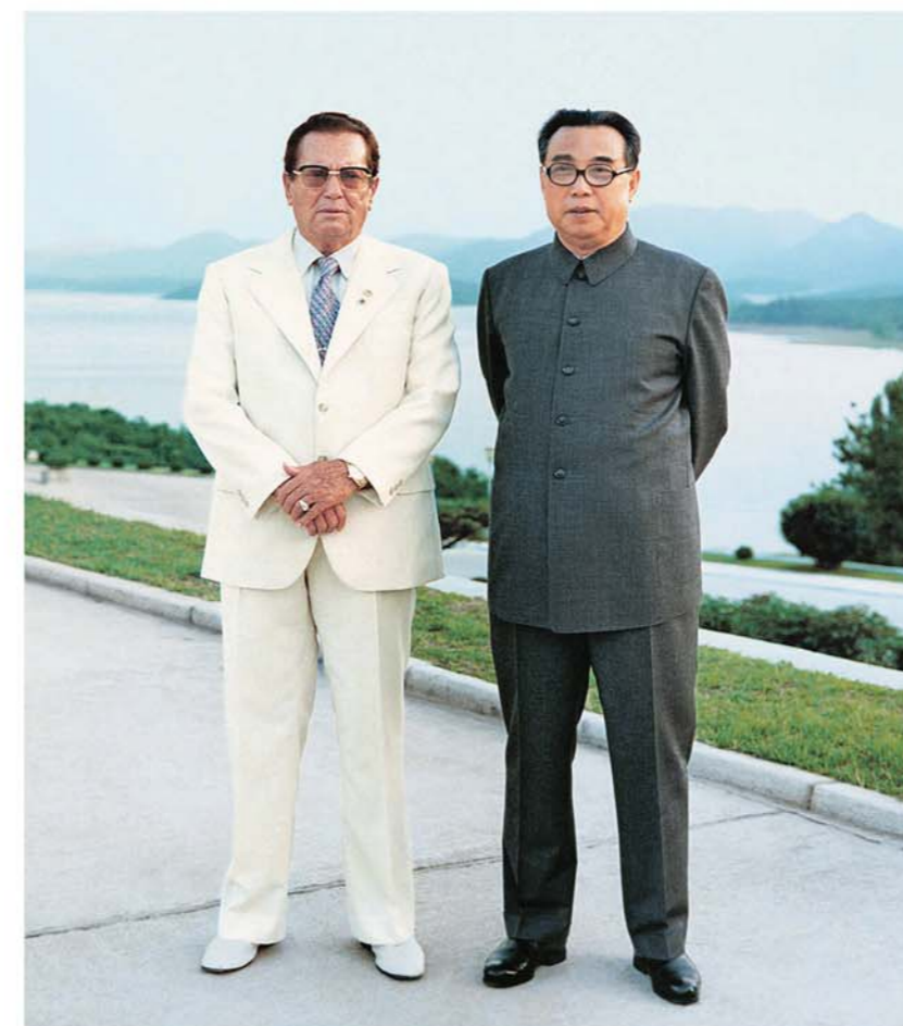
Kim Il Sung posing for a photo with Josip Broz Tito, President of the Socialist Federal Republic of Yugoslavia [August Juche 66 (1977)]

As it maintains independence in working out external policies and settling international issues, never tolerates any attempts to either violate or infringe upon the country's sovereignty, however trifle they may be, and resolutely