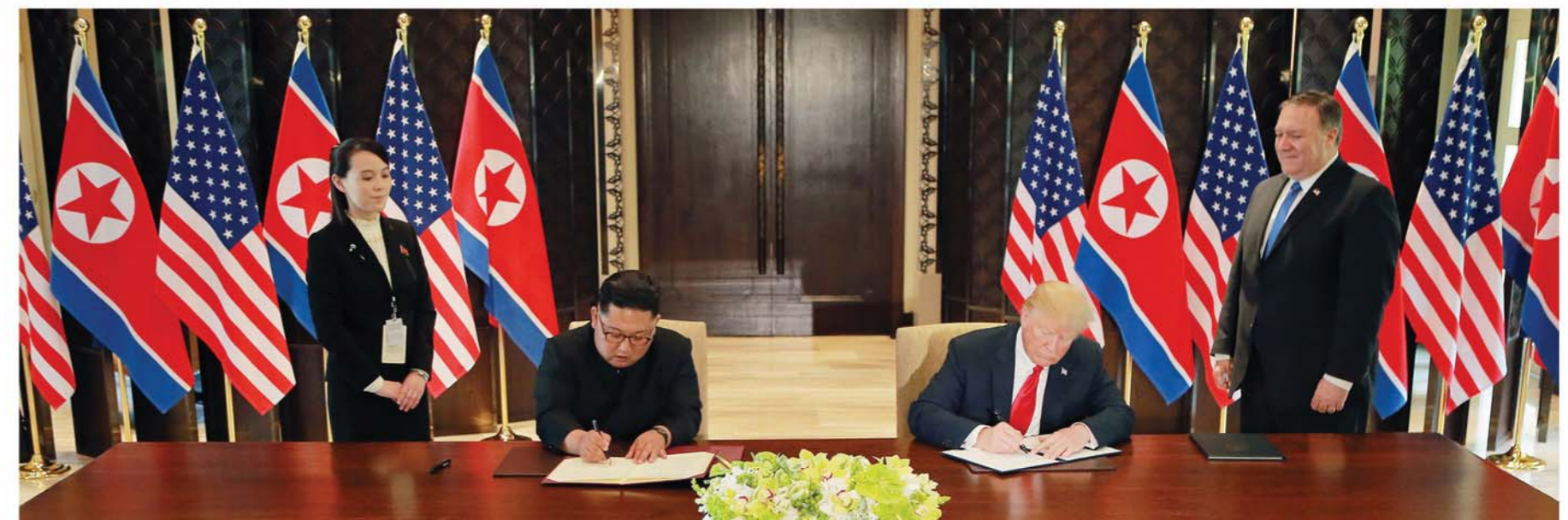
Chairman Kim Jong Un and President Donald J. Trump signing the joint statement of the Singapore summit [June Juche 107 (2018)]