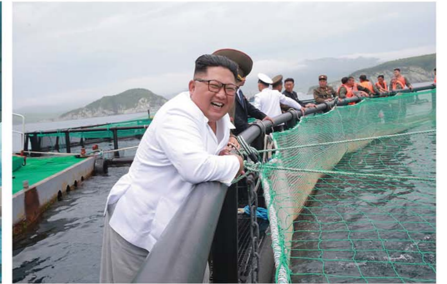
Supreme Leader Kim Jong Un visiting the Atlantic Salmon Pedigree Farm [July Juche 107 (2018)]