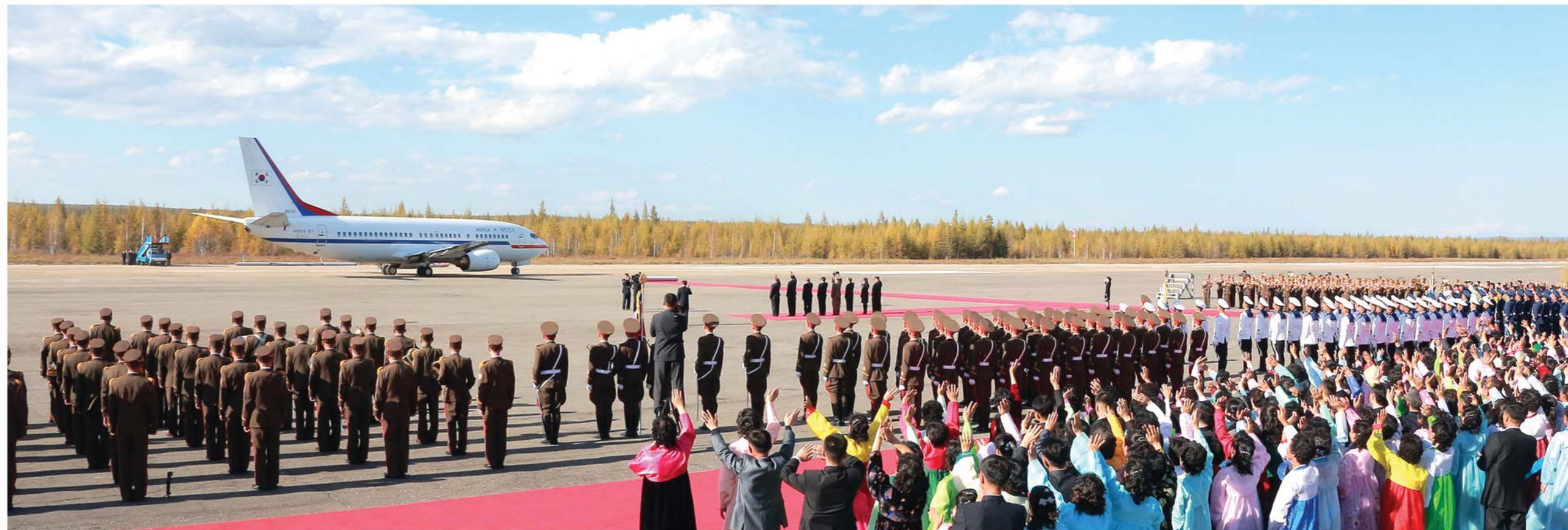
Supreme Leader Kim Jong Un and his wife Ri Sol Ju warmly seeing off south Korean President Moon Jae In and his wife Kim Jung Sook [September Juche 107 (2018)]