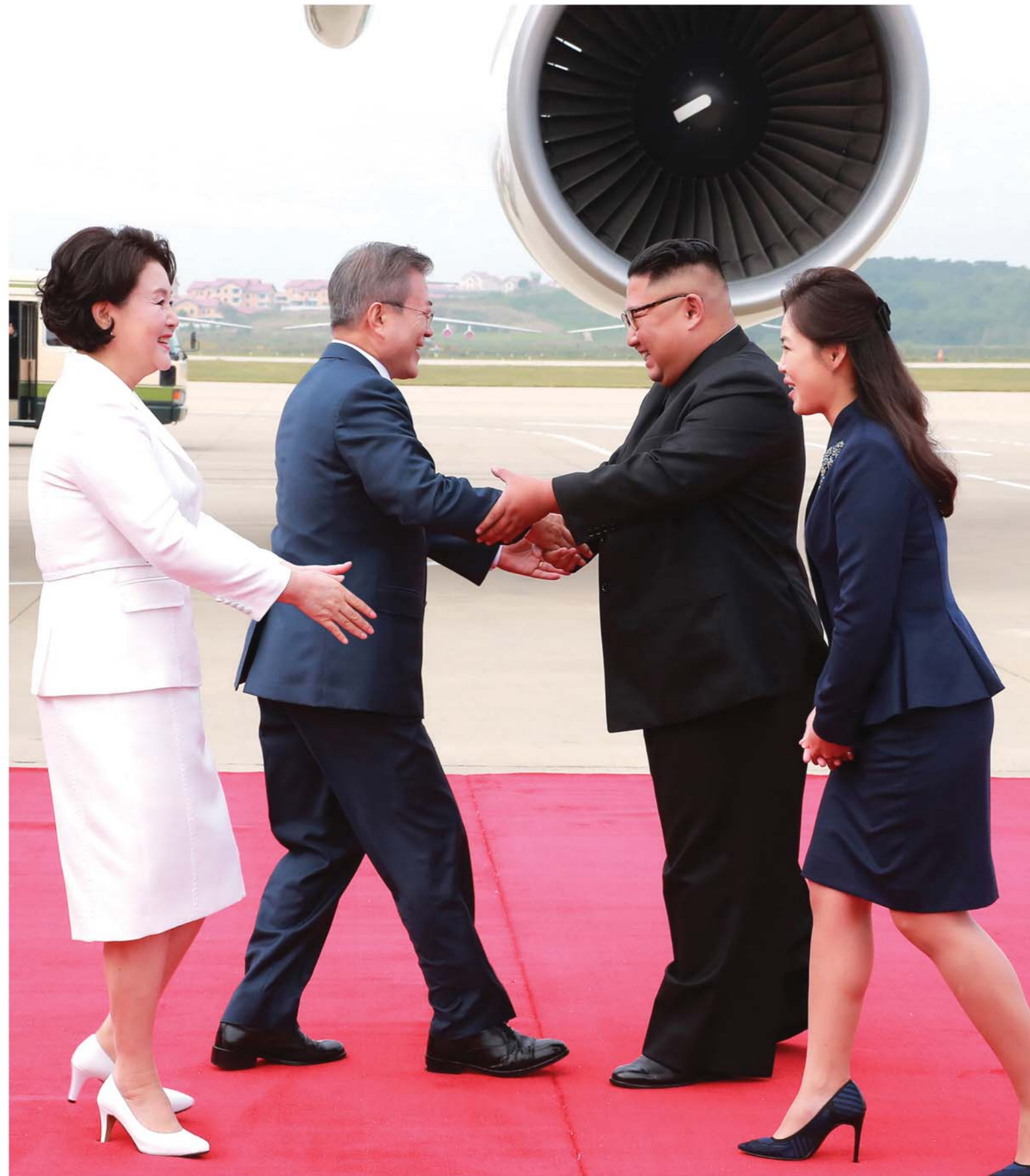
Supreme Leader Kim Jong Un and his wife Ri Sol Ju welcoming south Korean President Moon Jae In and his wife Kim Jung Sook to Pyongyang [September Juche 107 (2018)]