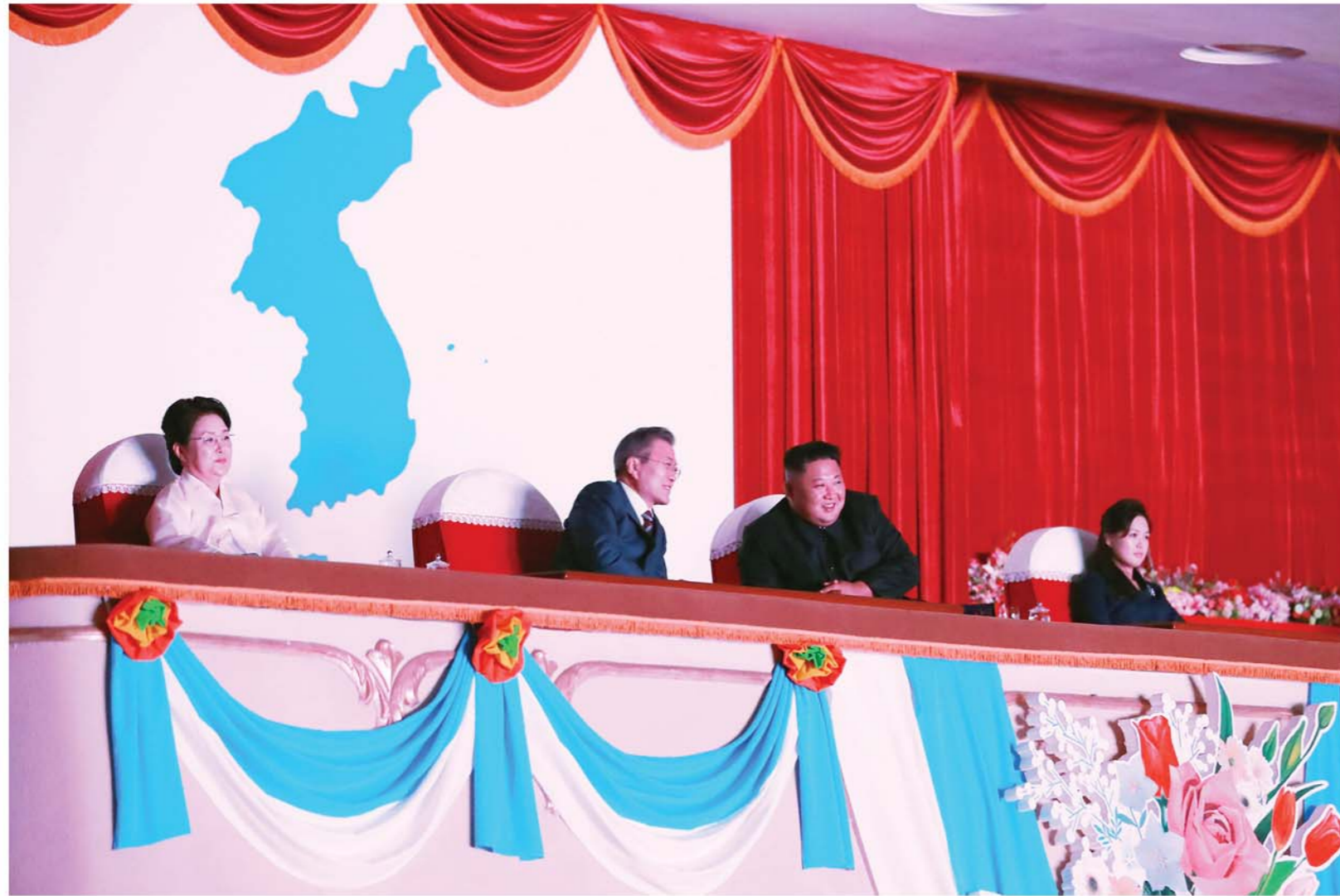
Kim Jong Un and his wife Ri Sol Ju seeing an artistic performance together with Moon Jae In and his wife Kim Jung Sook [September Juche 107 (2018)]