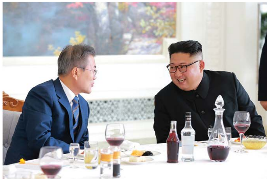
Supreme Leader Kim Jong Un and south Korean President Moon Jae In having a luncheon [September Juche 107 (2018)]