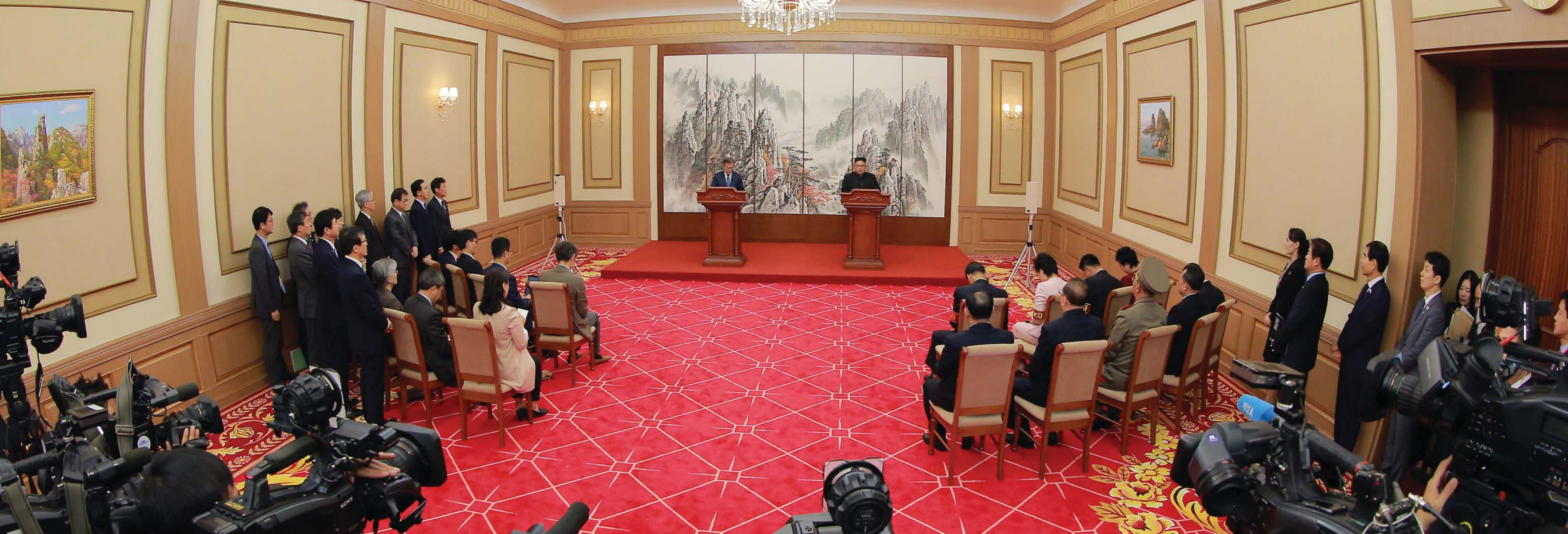
Supreme Leader Kim Jong Un and south Korean President Moon Jae In making joint statements on the September Pyongyang Joint Declaration [September Juche 107 (2018)]