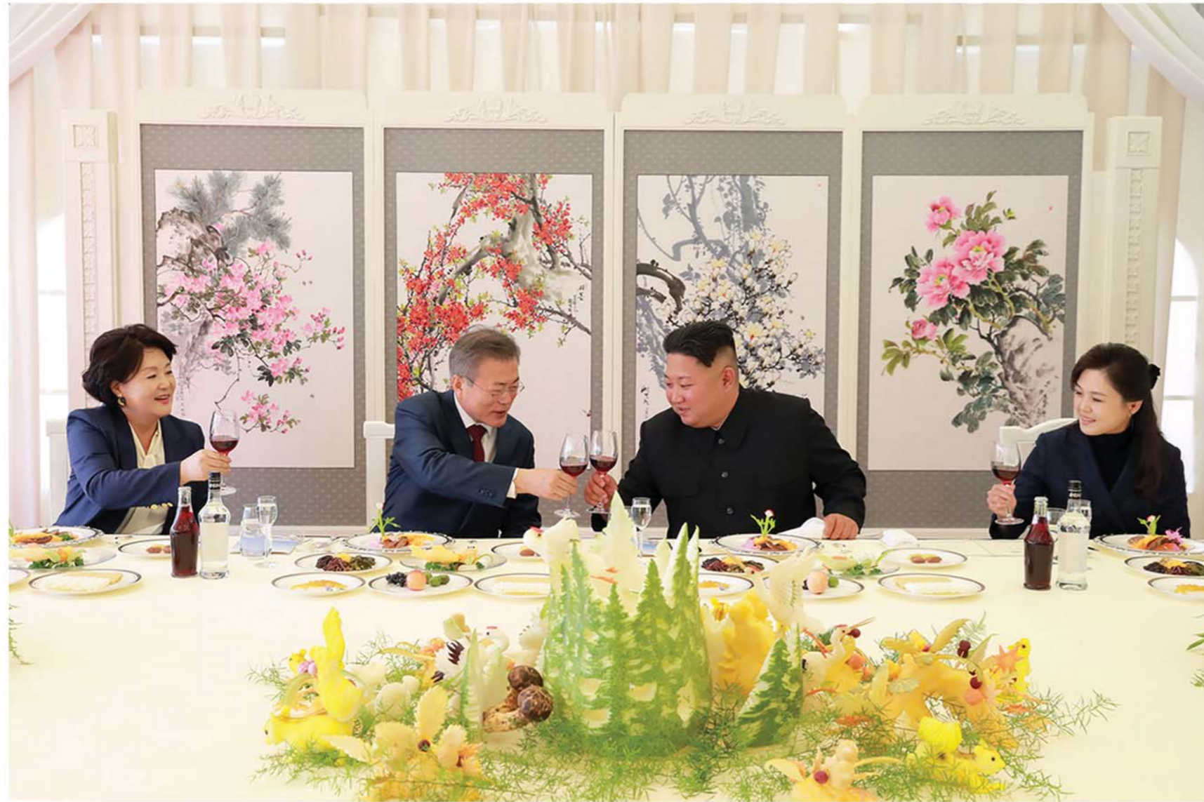
Supreme Leader Kim Jong Un hosting luncheon for south Korean President Moon Jae In at Samjiyon [September Juche 107 (2018)]