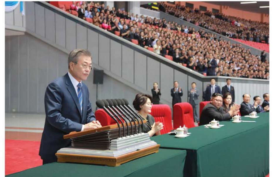
Supreme Leader Kim Jong Un and south Korean President Moon Jae In seeing a grand mass gymnastics and artistic performance [September Juche 107 (2018)]

The top leaders and their wives had a photo taken together in memory of the historic moment of being on top of Mt Paektu together. They went down to Lake Chon and exchanged impressions of climbing the mountain, walking along the shores of the lake. They had another photo taken together on the lakeside. Kim Jong Un exchanged warm farewells with Moon Jae In making his way home after the successful historic north-south summit meeting and talks.