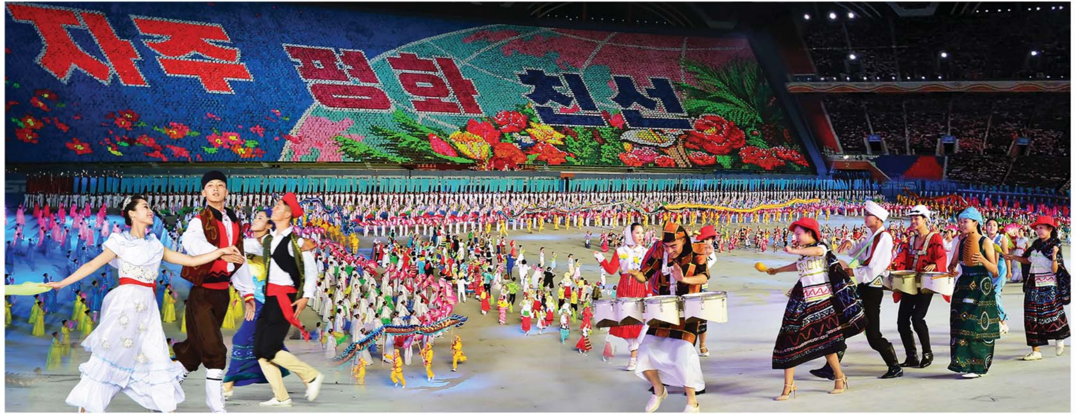
The performance vividly presents the founding, defence and development of the DPRK through well-harmonized music, dance, gymnastics, acrobatics, large-scale background, illumination and stage setting