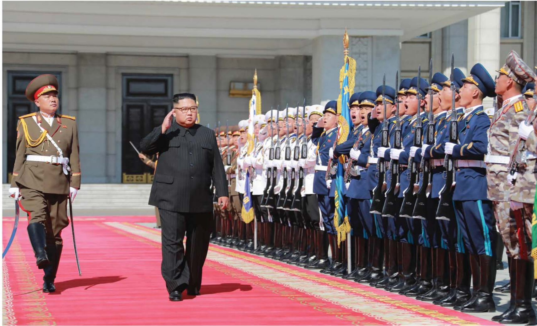
Kim Jong Un, chairman of the Workers' Party of Korea, chairman of the State Affairs Commission of the DPRK and supreme commander of the Korean People's Army, reviews the honour guard of the KPA services [September Juche 107 (2018)]

The Korean people, who are making efforts to bring a bright future closer by creating a great history along the victorious road indicated by the Workers' Party of Korea, celebrated the 70th anniversary of their country, the Democratic People's Republic of Korea.