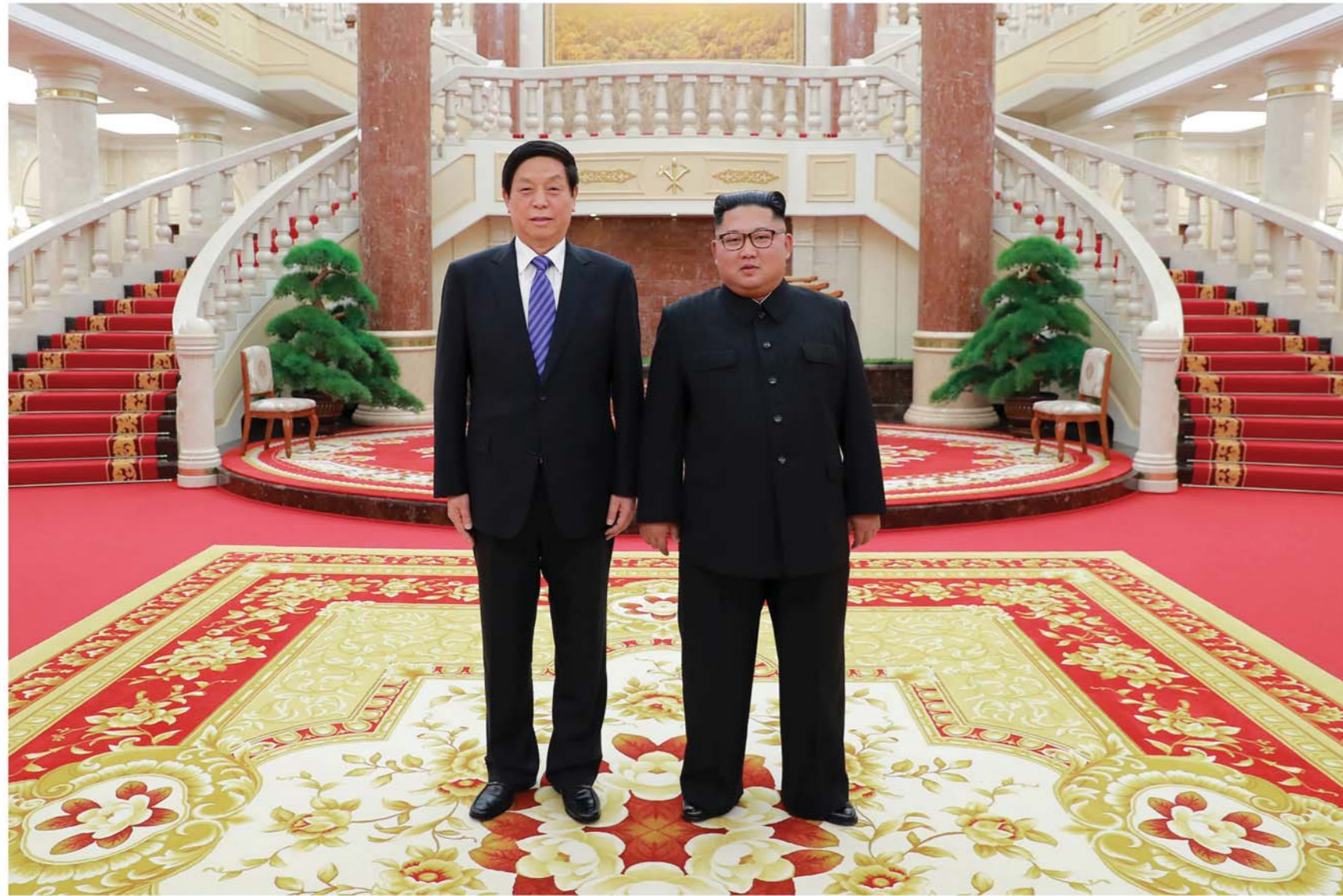
Supreme Leader Kim Jong Un meets and has a talk with Li Zhanshu, special envoy of Xi Jinping, general secretary of the Central Committee of the Communist Party of China and president of the People's Republic of China [September Juche 107 (2018)]