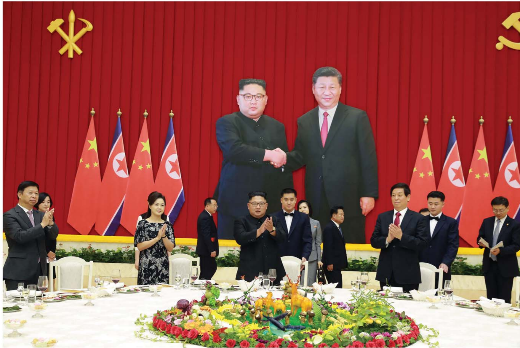
Supreme Leader Kim Jong Un hosts a banquet for the Chinese Party and government delegation [September Juche 107 (2018)]

precious common treasure of the two countries, he expressed his will to further boost high-level visits and deepen the strategic mutual understanding as already agreed with Xi Jinping in order to more firmly and profoundly develop the special and solid DPRK-China relations which no one can hurt.