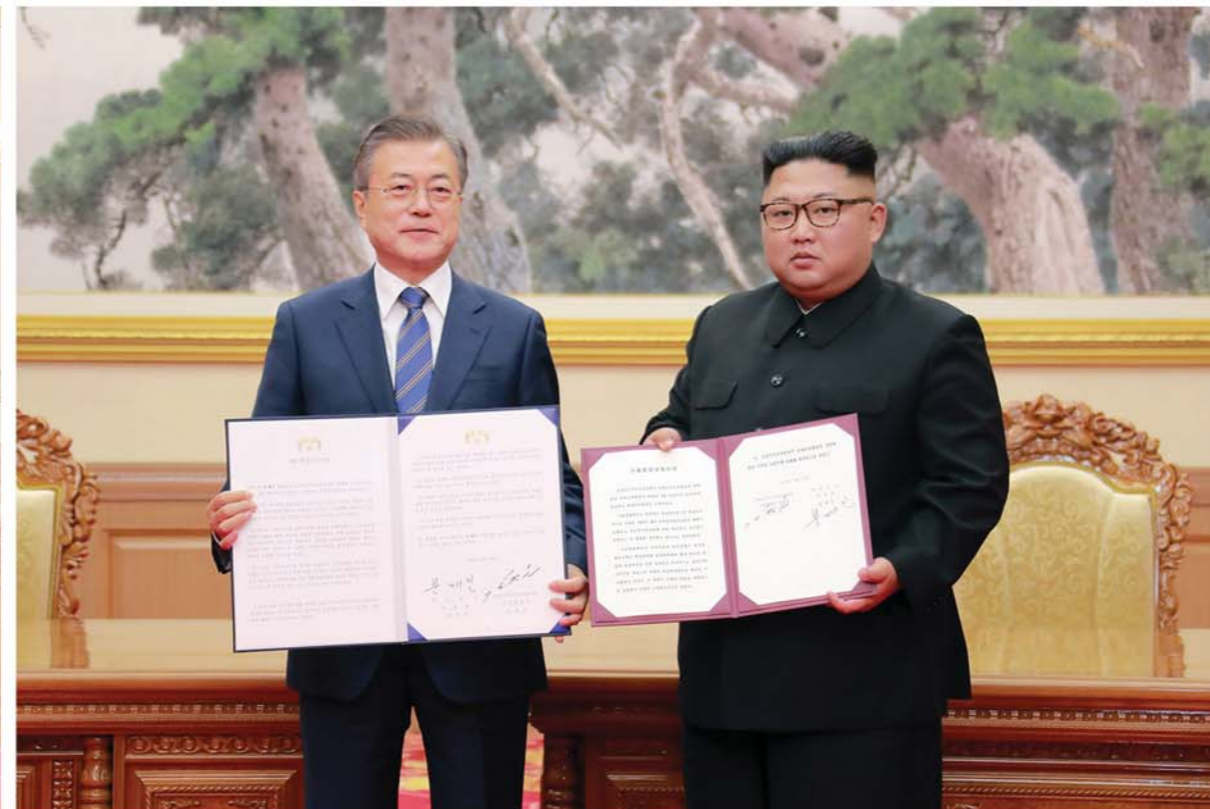
Supreme Leader Kim Jong Un and south Korean President Moon Jae In in the signing ceremony of the September Pyongyang Joint Declaration [September Juche 107 (2018)]