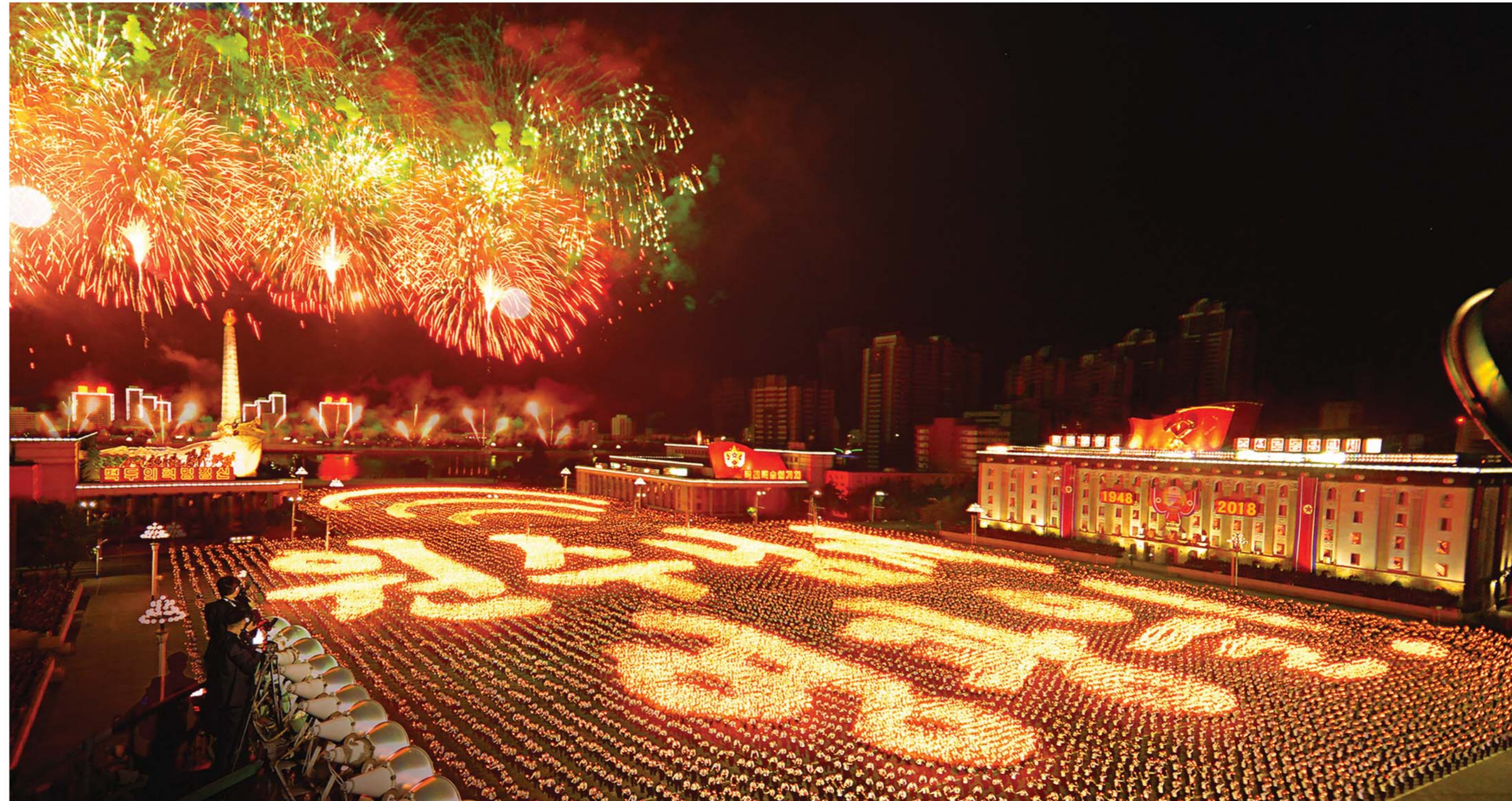
Young people display their stout mettle with which they have marched along the road for building a prosperous country and their will to continue to march straight ahead in support of the Workers' Party of Korea, flying high the red flag of the revolution