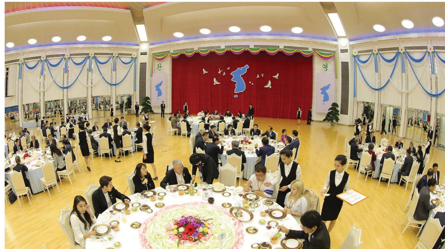
Supreme Leader Kim Jong Un hosts a banquet for south Korean President Moon Jae In visiting Pyongyang [September Juche 107 (2018)]