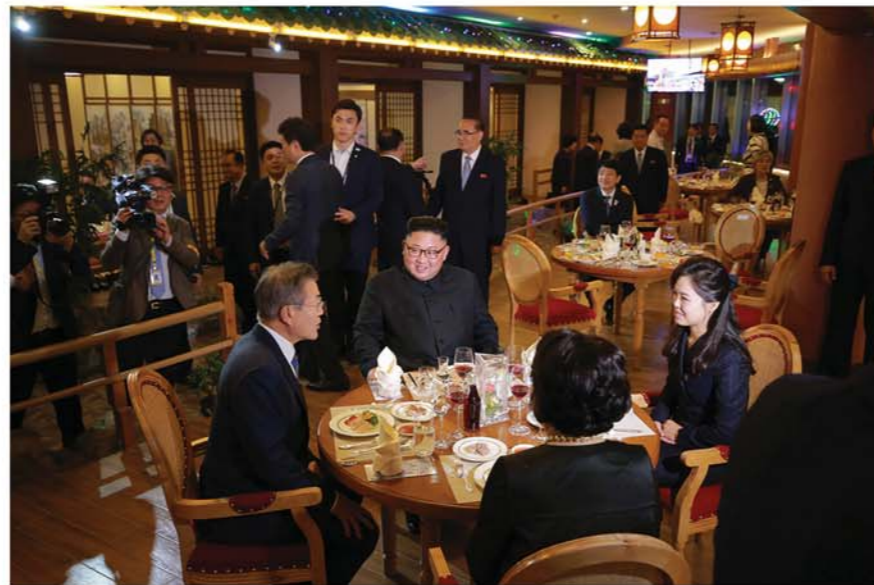
Supreme Leader Kim Jong Un and south Korean President Moon Jae In having a dinner [September Juche 107 (2018)]