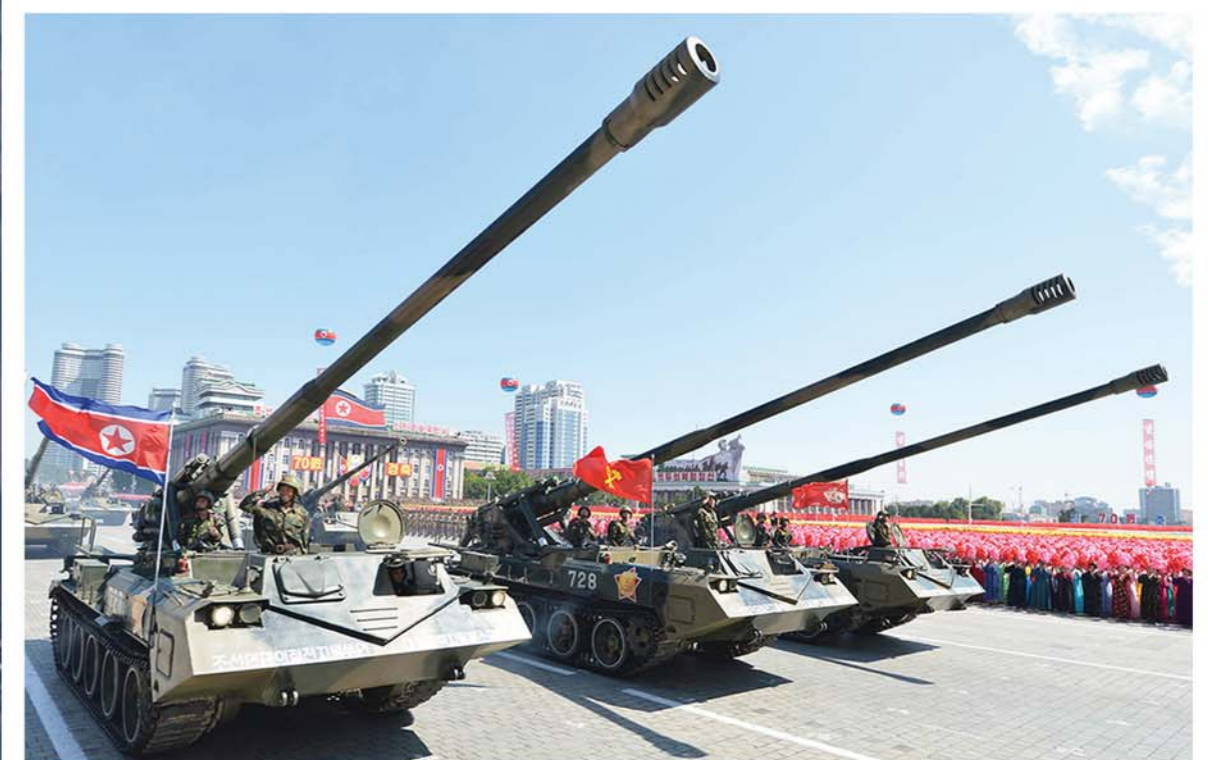
Columns of mechanized units are filled with a determination to perform with credit the honourable mission of defending the country, the revolution and the people