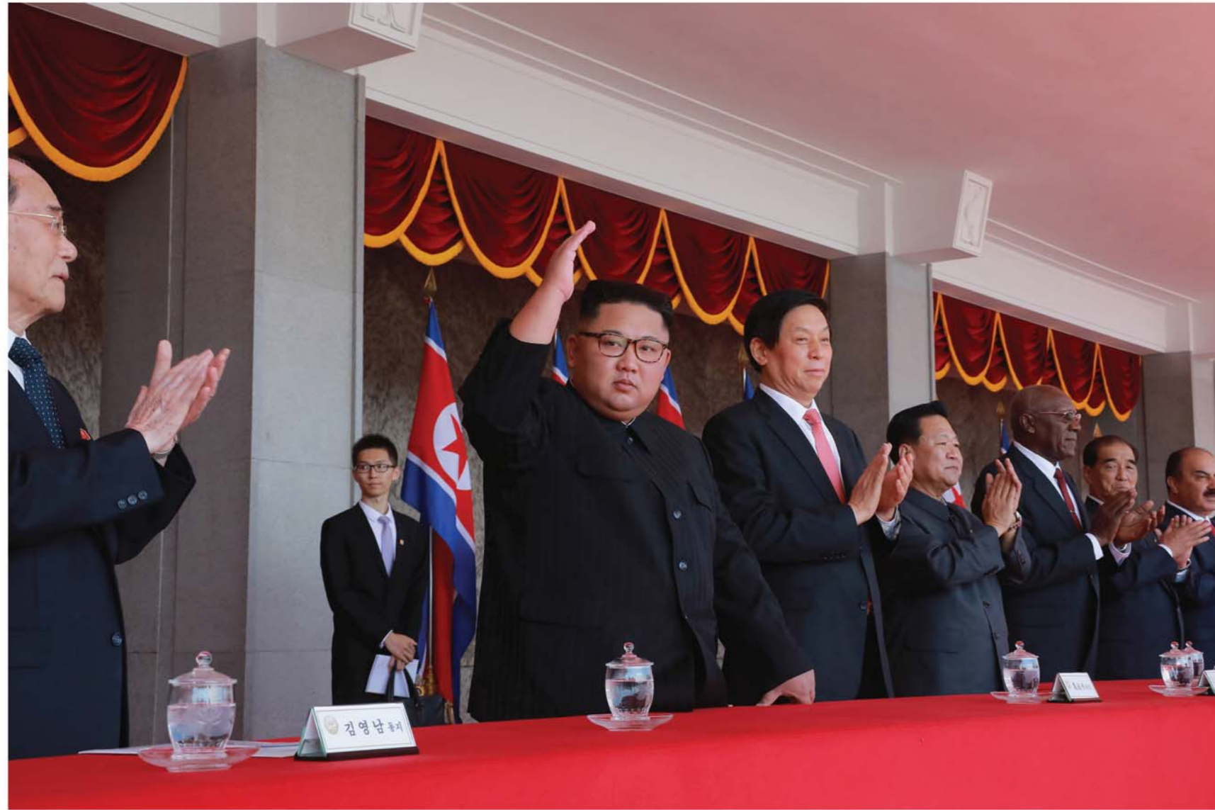
Supreme Leader Kim Jong Un acknowledges the cheering crowds [September Juche 107 (2018)]

The column in the shape of the national flag went past the square amid the playing of the songs The Glorious Motherland and Ode to the Motherland , while the civilian participants on the square depicted the letters Celebration September 9 .