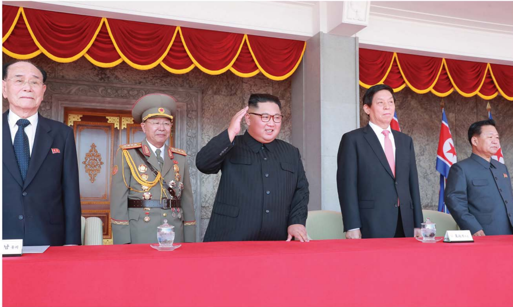
Supreme Leader Kim Jong Un salutes the parading columns [September Juche 107 (2018)]