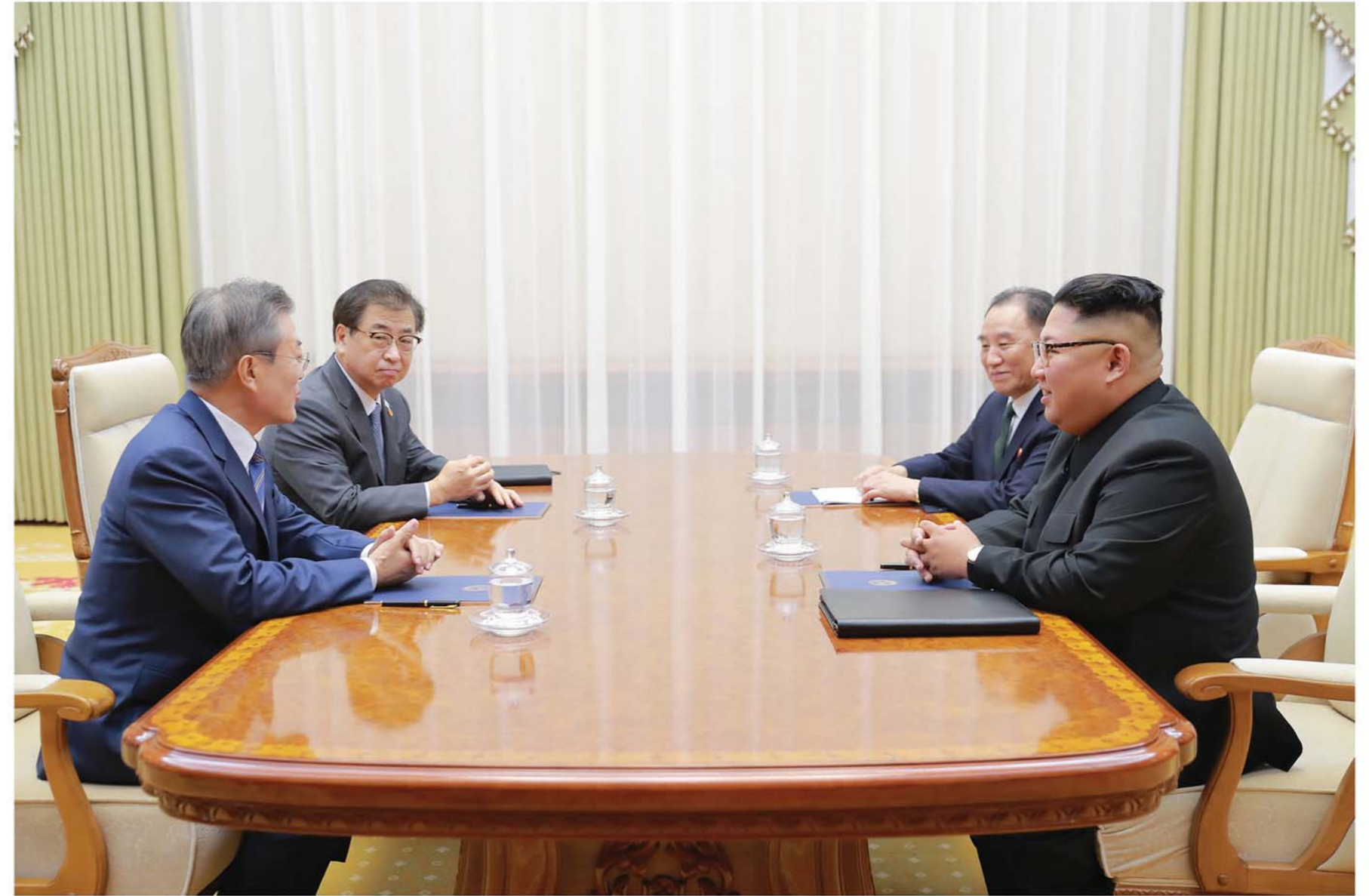
Supreme Leader Kim Jong Un visiting the guest house where south Korean President Moon Jae In is staying and having second-day talks with him [September Juche 107 (2018)]

their eyes on the beautiful and magnificent peaks, spectacular view of the limpid and blue Lake Chon and the wavy sea of foliage extending far reminding one of the blood vein of the nation.