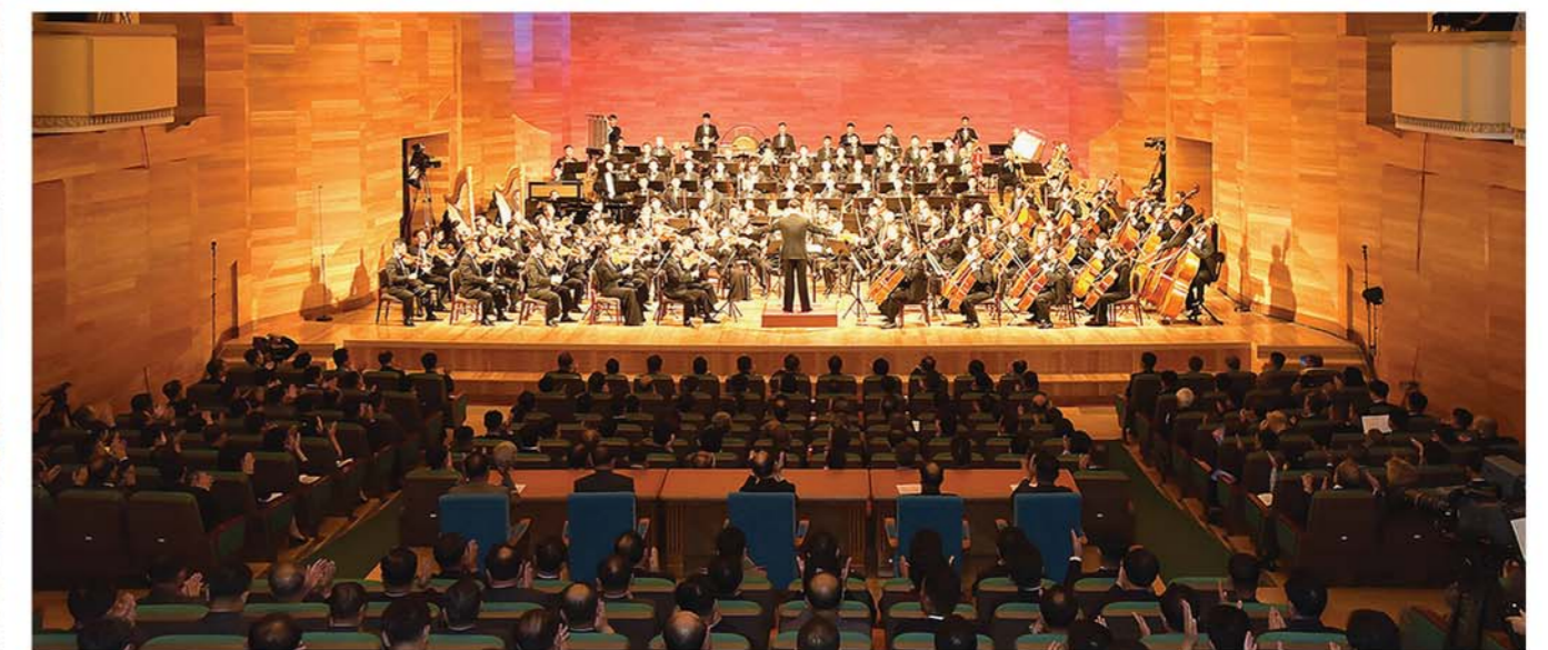
Central Photo Exhibition 70 Years of Victory and Glory, National Book Exhibition, performance by the National Symphony Orchestra Symphony of Socialism and other functions in celebration of the 70th anniversary of the DPRK

With delight and pride in opening a new era of overall revitalization of their socialist country, rallied firmly around the Workers' Party of Korea, all the people across the country greeted the 70th anniversary of the Democratic People's Republic of Korea with splendour.