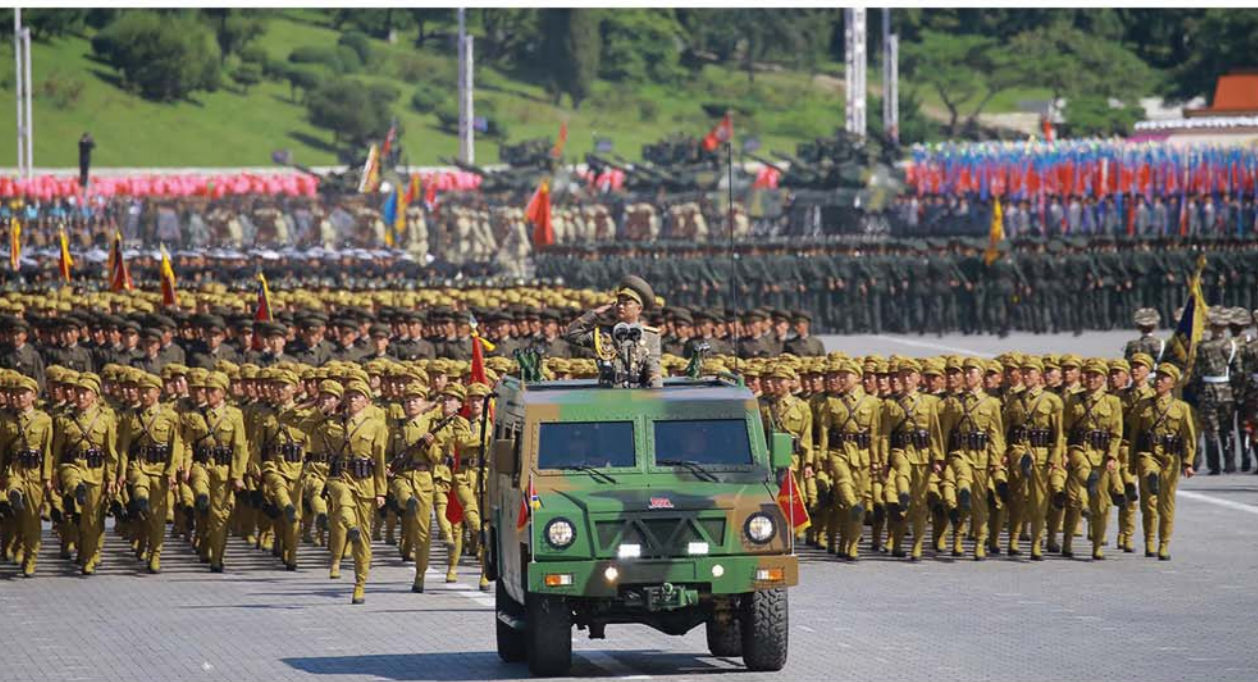
Column of officers of the Korean People's Revolutionary Army marches with the car of the commander of the paraders in front, representing the proud traditions of the Juche-oriented revolutionary armed forces

The military parade started off with the column of officers of the Korean People's Revolutionary Army, demonstrating the proud traditions of the Juche-oriented revolutionary armed forces.