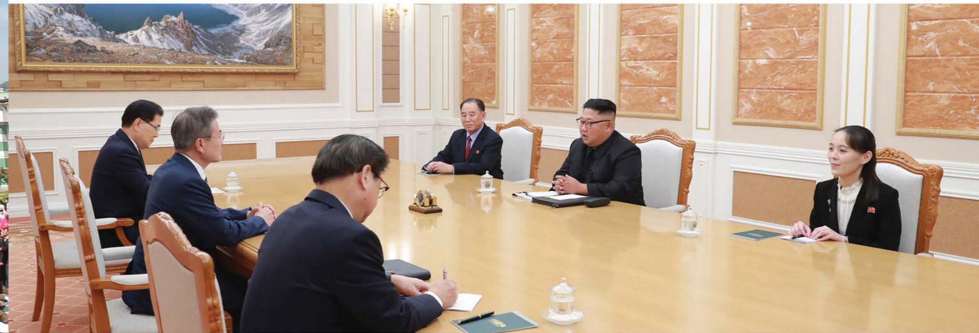
Talks between Kim Jong Un and Moon Jae In [September Juche 107 (2018)]