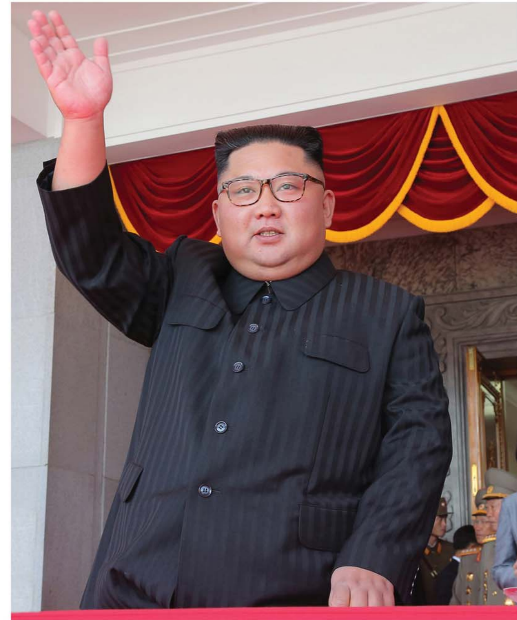
Supreme Leader Kim Jong Un waves his hand to the participants in the military parade and Pyongyang citizens [September Juche 107 (2018)]