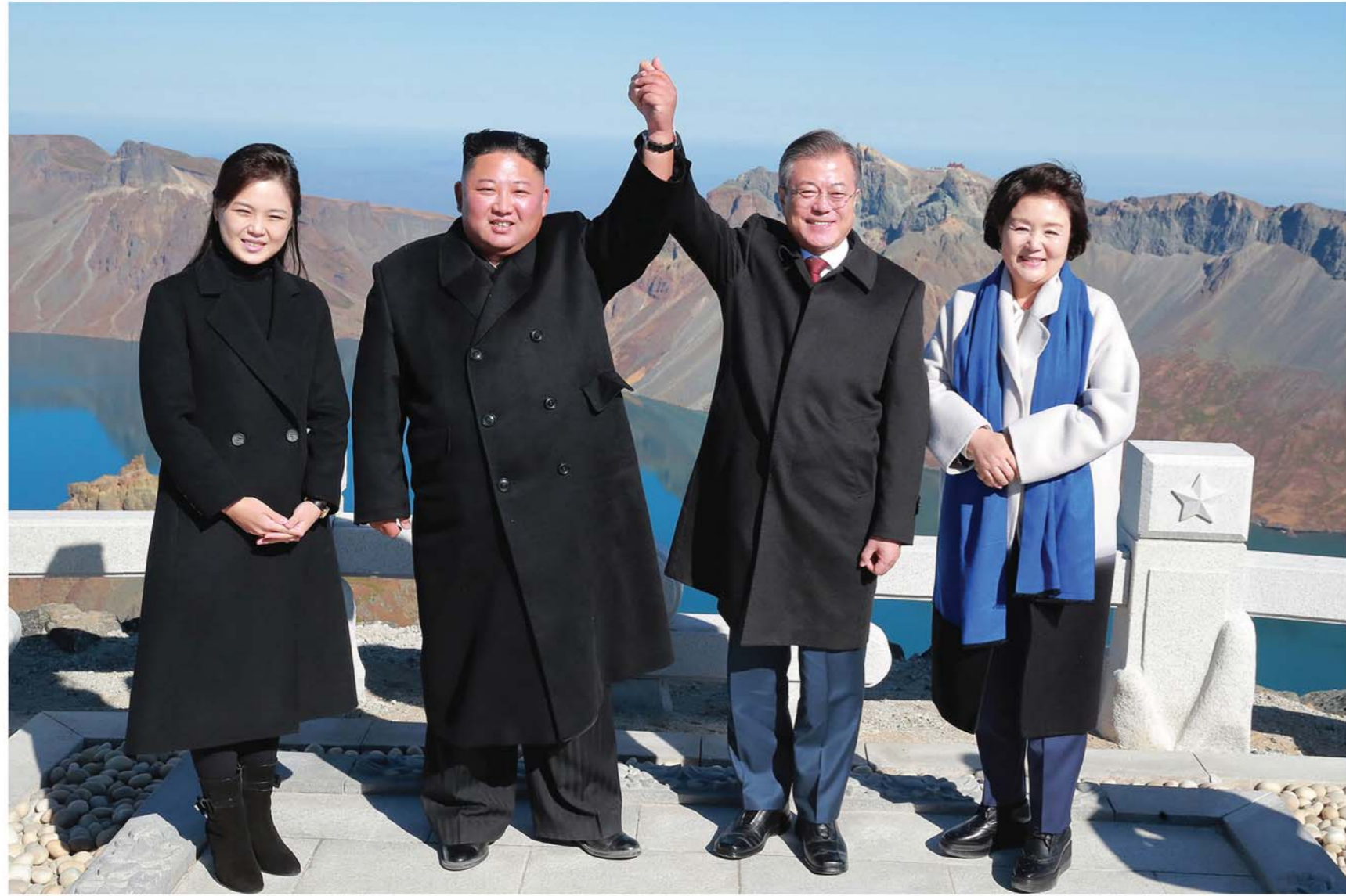
Supreme Leader Kim Jong Un and his wife Ri Sol Ju having a photo taken with south Korean President Moon Jae In and his wife Kim Jung Sook on Mt Paektu [September Juche 107 (2018)]