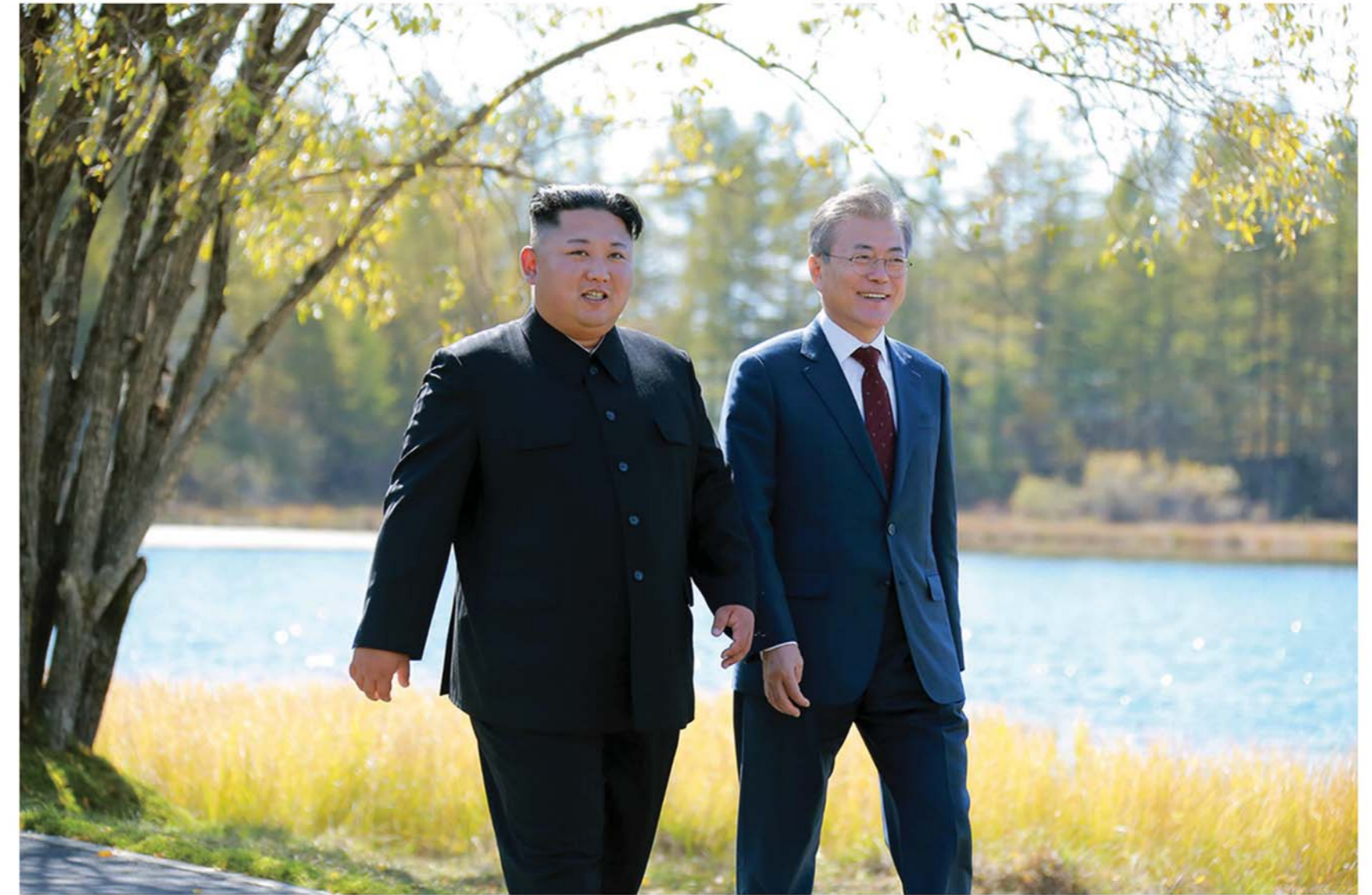
Supreme Leader Kim Jong Un and south Korean President Moon Jae In having a pleasant chat while walking on the shores of the lake commanding a view of Mt Paektu [September Juche 107 (2018)]