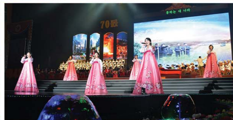
Music and dance performance in celebration of the 70th anniversary of the DPRK