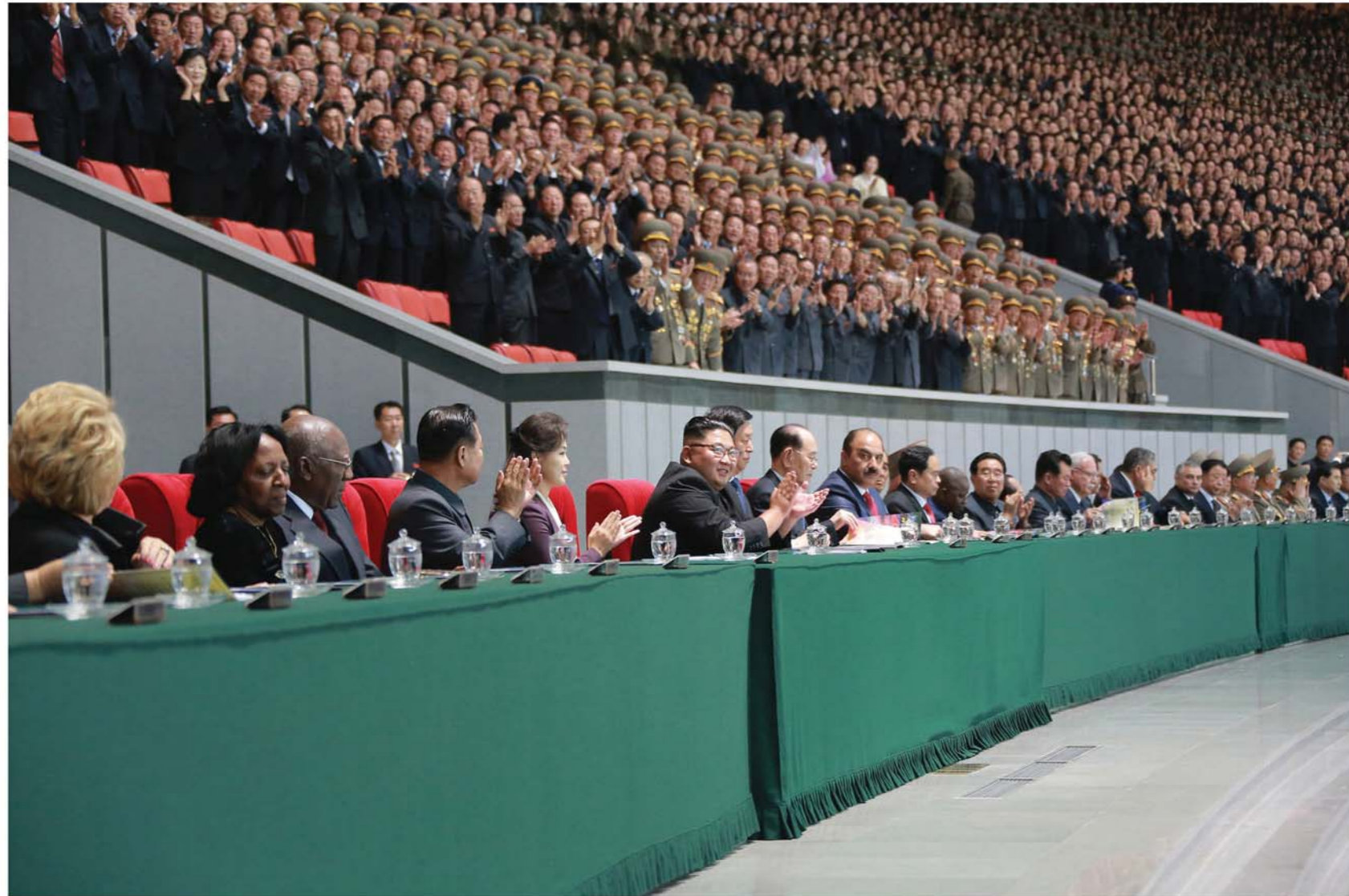
Supreme Leader Kim Jong Un sees the grand mass gymnastics and artistic performance The Glorious Country held to celebrate the 70th anniversary of the DPRK [September Juche 107 (2018)]