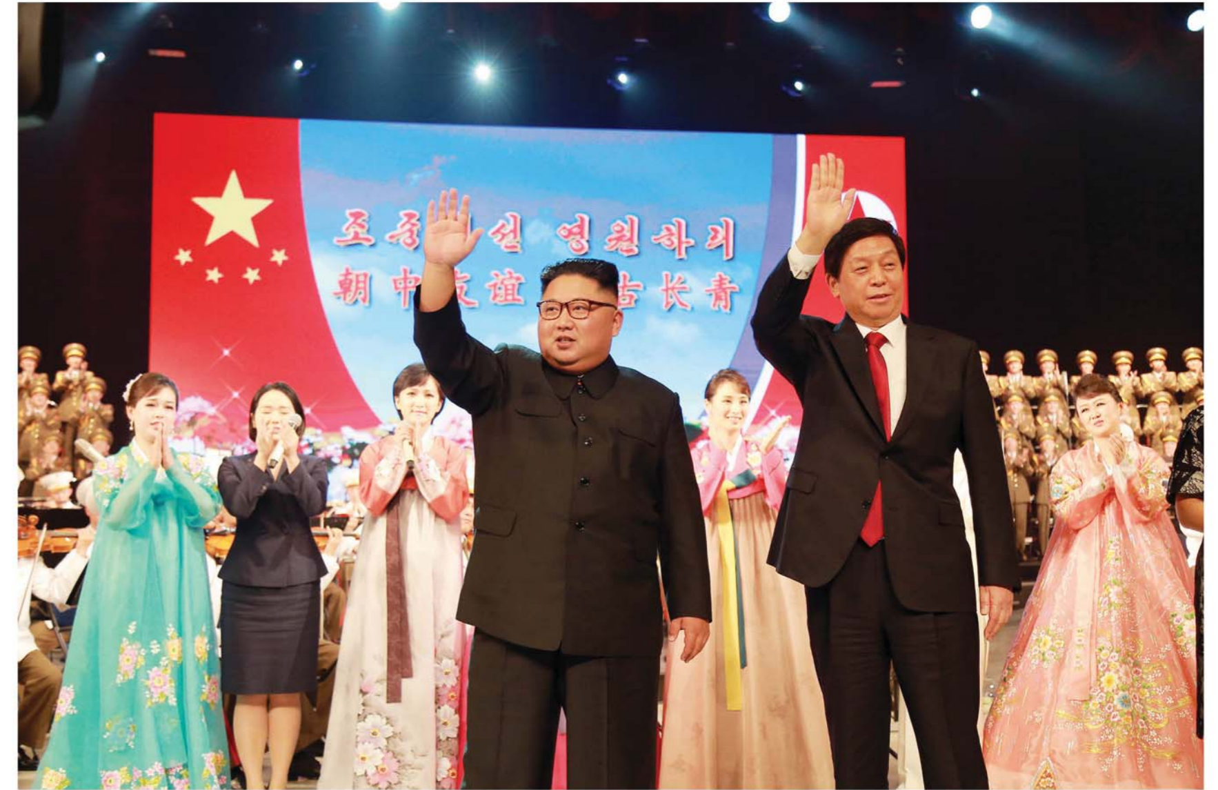
Supreme Leader Kim Jong Un, together with Li Zhanshu, mounts the stage to congratulate the artistes for their wonderful performance [September Juche 107 (2018)]