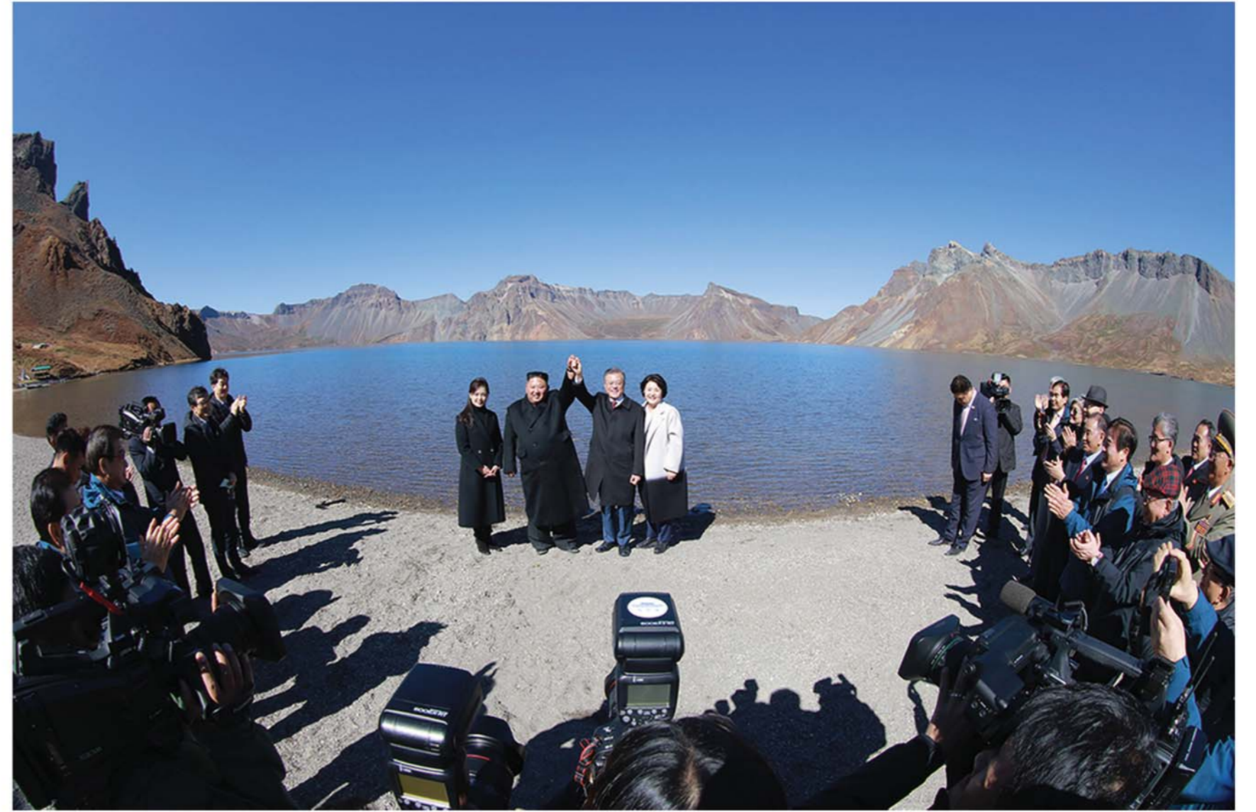
Supreme Leader Kim Jong Un and his wife Ri Sol Ju having another photo taken with south Korean President Moon Jae In and his wife Kim Jung Sook by Lake Chon [September Juche 107 (2018)]