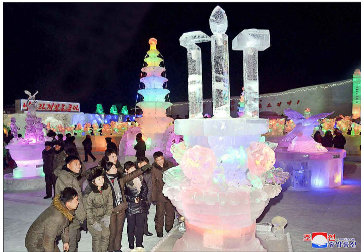
The ice sculpture makes the national holiday eventful.