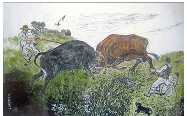
Coloured woodblock print "Bull Fight".