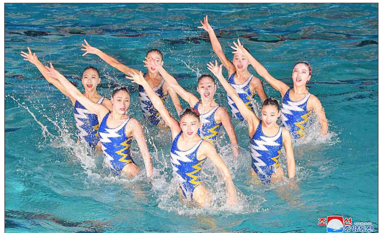
The synchronized swimming performance gives delight to the audience.