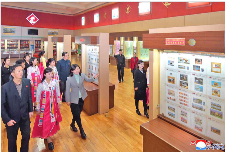
A stamp show is one of the celebration events.