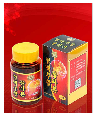
Health food: blood vessel restoring flavone.