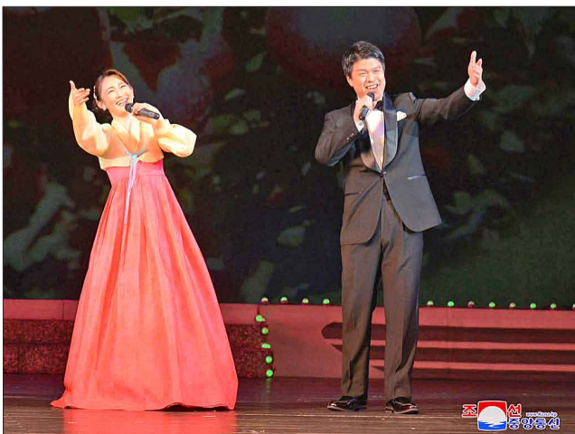
Korean entertainers from Japan present a performance in Pyongyang.