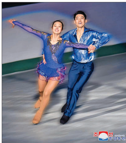
The figure skating festival is a major event.