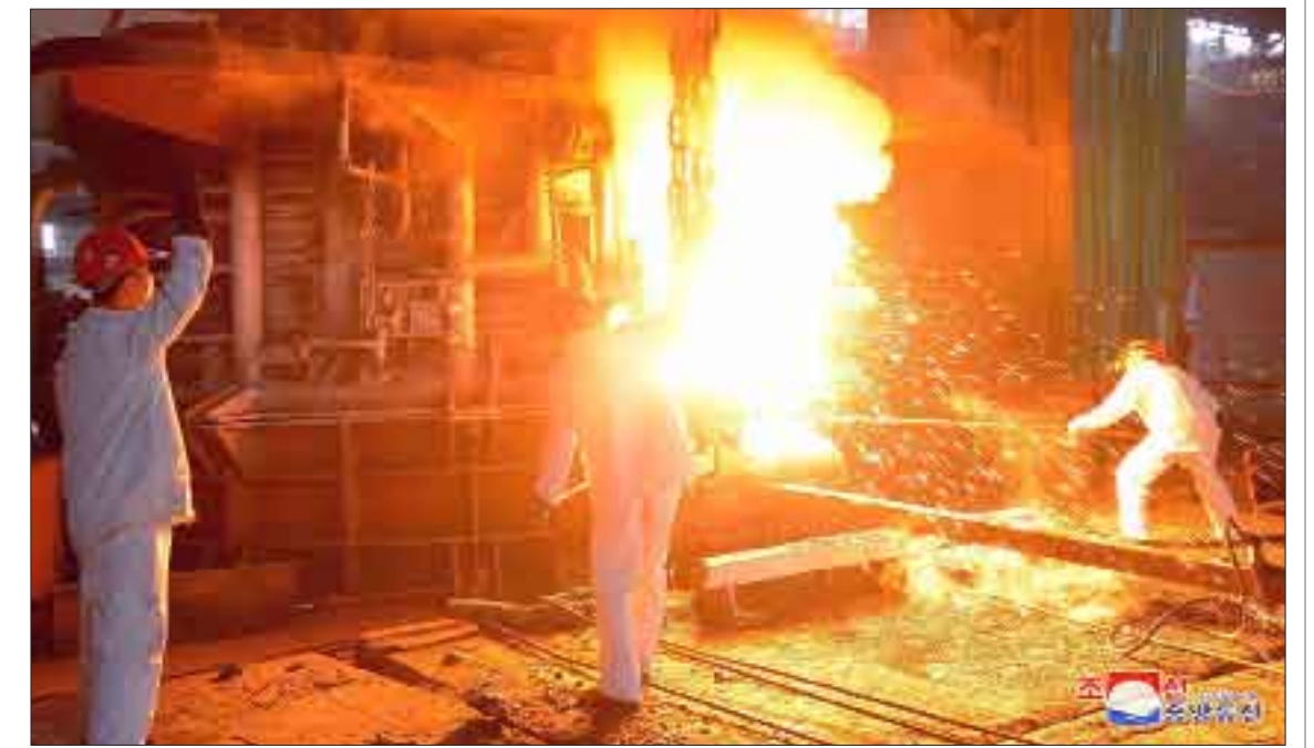
The Chollima Steel Complex increases steel production.

The Chongchongang Thermal Power Station is generating more power than planned in March.