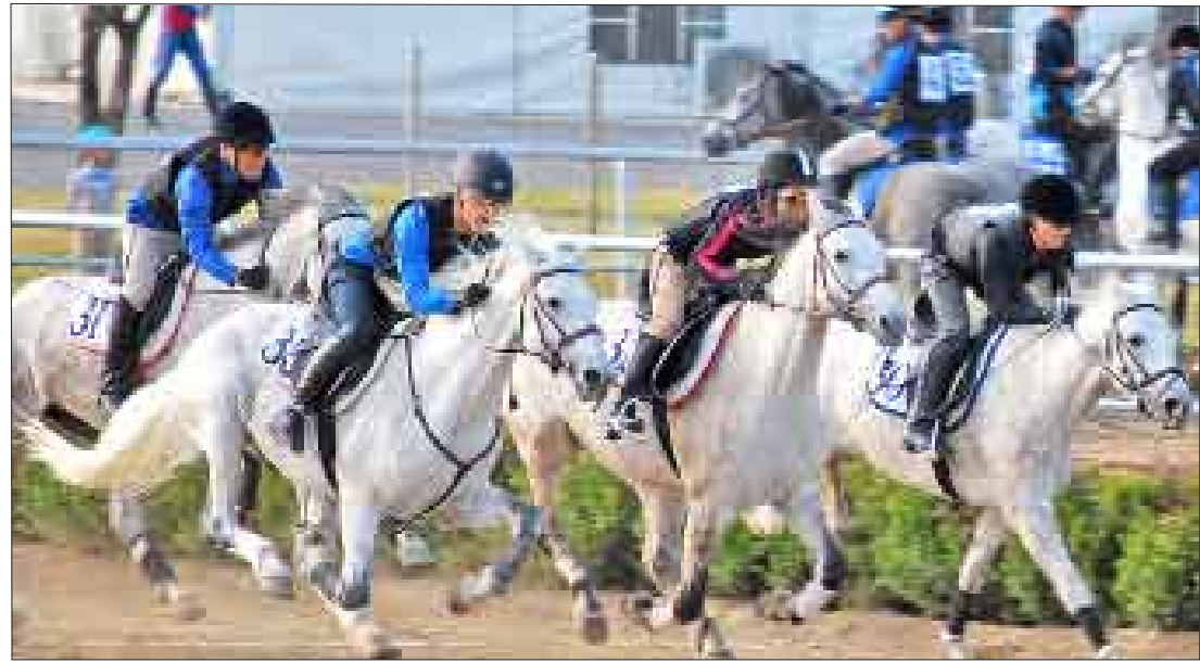
Amateur riders compete at the Mirim Riding Club.