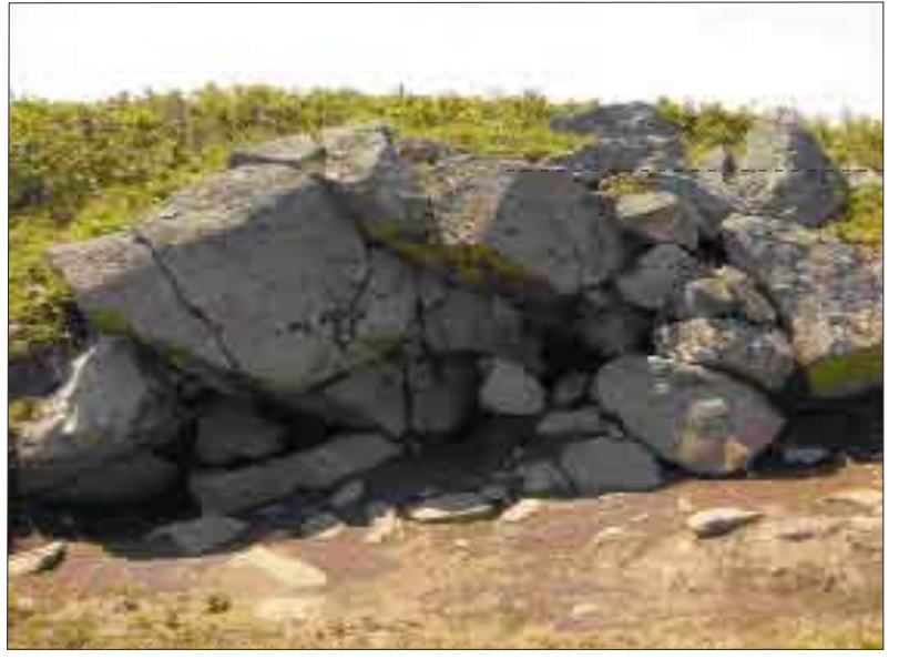
Shadow-casting rock in Ungsang-dong in Sonbong area, Rason.