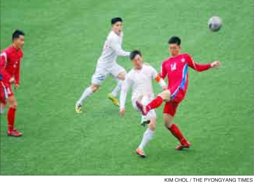
A match is played between Sobaeksu and Wolmido as part of the 2017-18 DPRK Premier League.