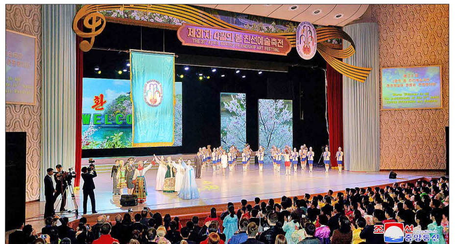
The 31st April Spring Friendship Art Festival opens at the East Pyongyang Grand Theatre.