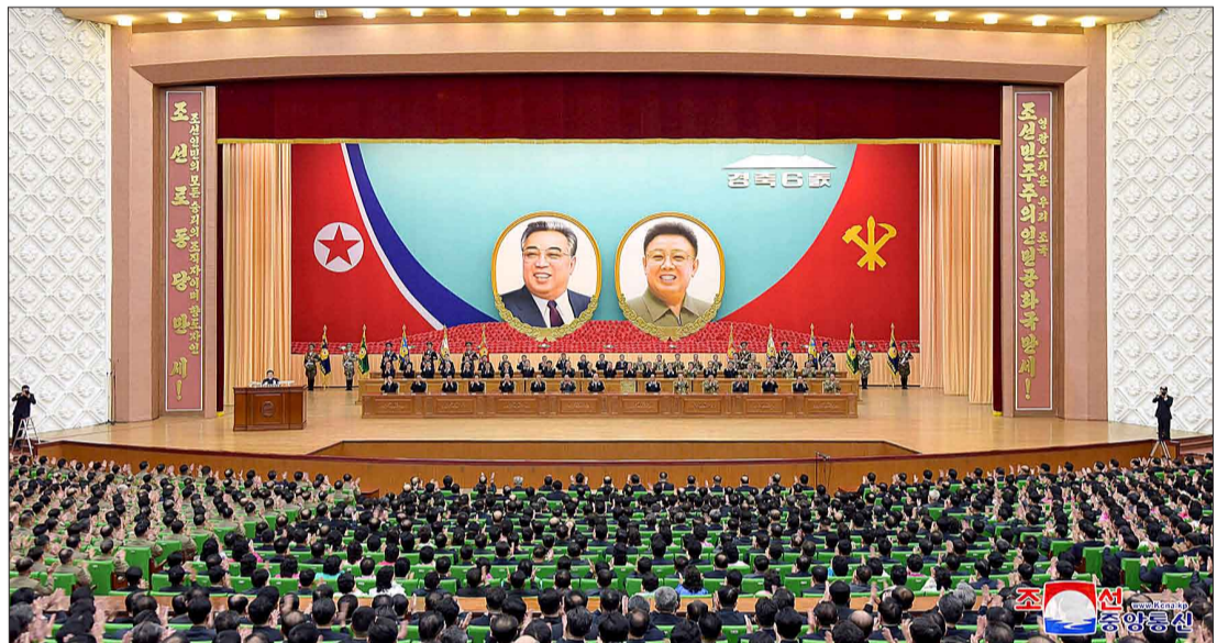
A national meeting is held in Pyongyang in celebration of the 6th anniversary of Supreme Leader Kim Jong Un's election to the top posts of the Workers' Party of Korea and the state.