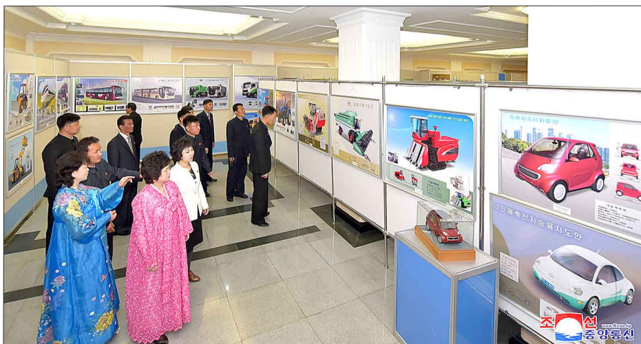
A national industrial design show runs at the National Industrial Design Exhibition Hall.