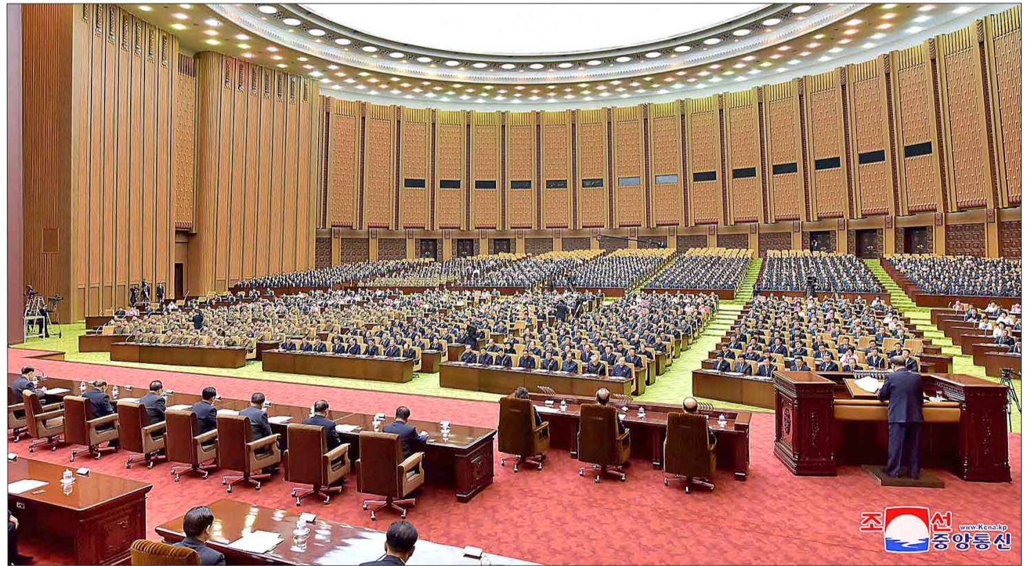
The Sixth Session of the 13th Supreme People's Assembly of the DPRK is held at the Mansudae Assembly Hall.

Speakers on the first and second agenda items said that the Cabinet's work and implementation of the state