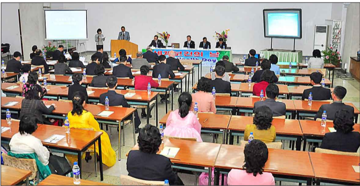
KIM CHOL / THE PYONGYANG TIMES