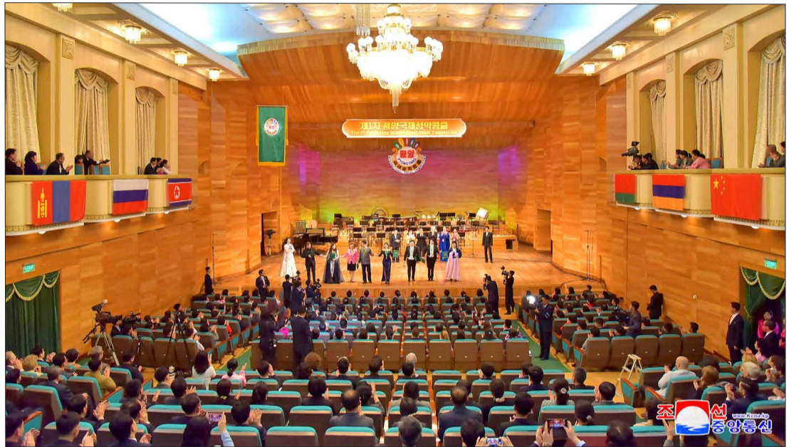
The First Pyongyang International Vocal Competition takes place at the Moranbong Theatre in Pyongyang.