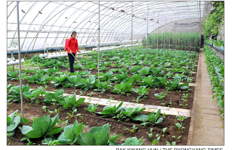
woman sprays agrochemical onto cabbages at the Mangyongdae District vegetable greenhouse.

growing of cucumbers and tomatoes, which are known as mutually exclusive, in the same building.