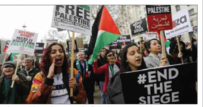
An anti-Israel protest in Britain.

Police were immediately mobilized to crack down on them, spreading tear gas and firing water cannon to disperse them, and finally arrested 200 of the