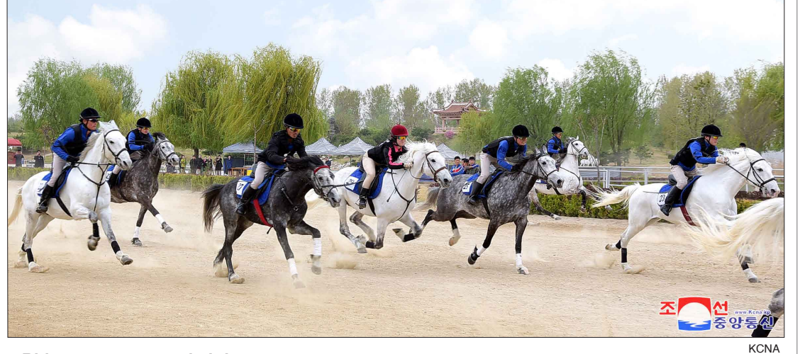
Riders put spurs to their horses.

The institute is now working on further improving technical specifications of their recent developments and provides active technical service to introduce them into more units.