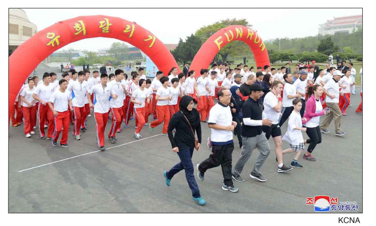
The fun run of the 18th Asian Games is held in front of the Weightlifting Gymnasium in Chongchun Street.

After speeches were made, there was a run.