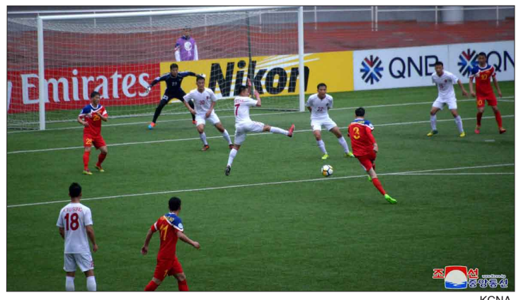
April 25 beats Hwaeppul 2-0 in Group I preliminaries for the 2018 AFC Cup finals.

The matches of Group I (East Asian region) for the 2018 AFC Cup have become fiercer with the approach of their closure.