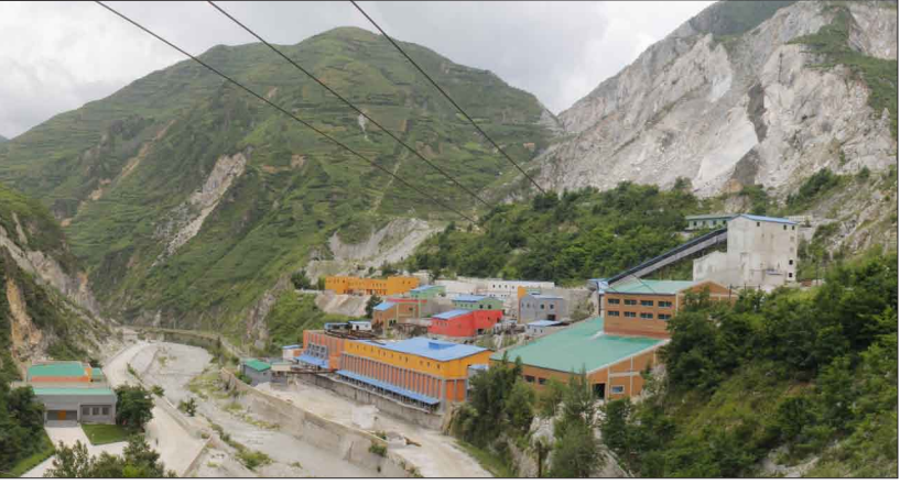
UN KWANG HYOK