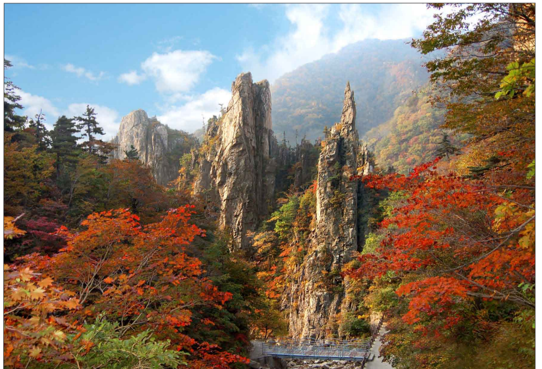
Samson Rocks on Mt Kumgang.