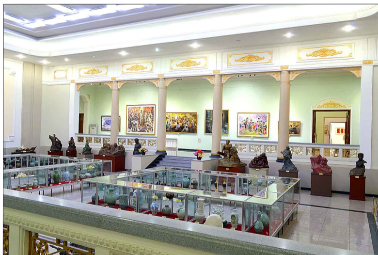
The interior of the museum.