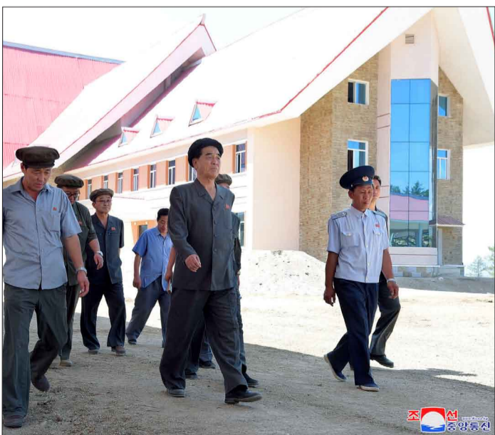
Premier Pak Pong Ju (middle) inspects a construction site of Samjiyon County.

Premier Pak Pong Ju inspected Samjiyon County and the construction site of the Tanchon Power Station.