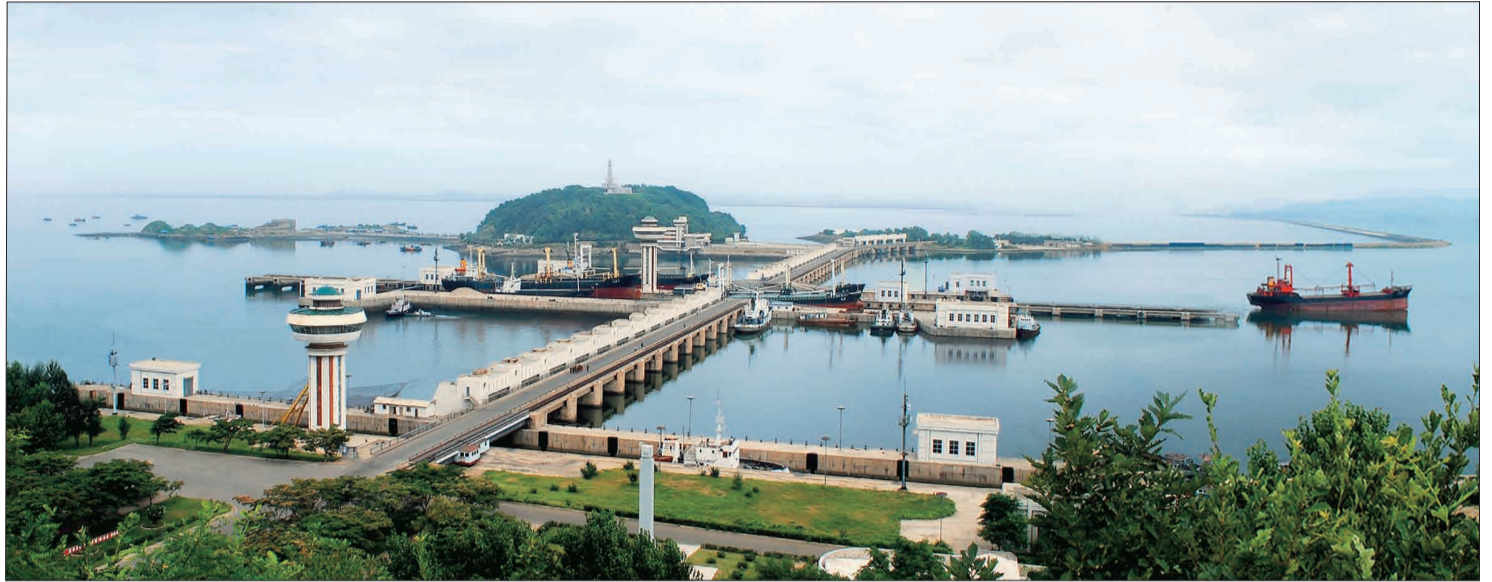
The 8-km-long West Sea Barrage built in a matter of five years was completed in 1986.

With new records exceeding the previous norm created at blast furnaces, electric furnaces and rolling mills, the workers of the Kim Chaek Iron Works produced well over 30 000 tons of pig iron, 40 000 tons of steel and well over 40 000 tons of rolled steel more than the previous year in 1985 while saving 60 000 tons of fuel.