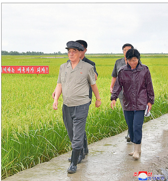
Premier Pak Pong Ju (first from left) inspects the Unha Cooperative Farm in Onchon County.