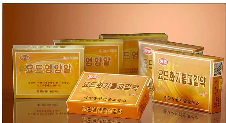
Popular iodine products.

They are natural health medicines and foods, called iodide oil capsule and iodine nourishing pill.