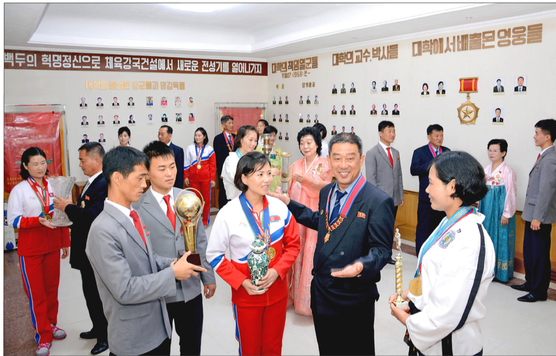
Lecturers and students of Korea University of Physical Education look back on its 60 years with great pride.