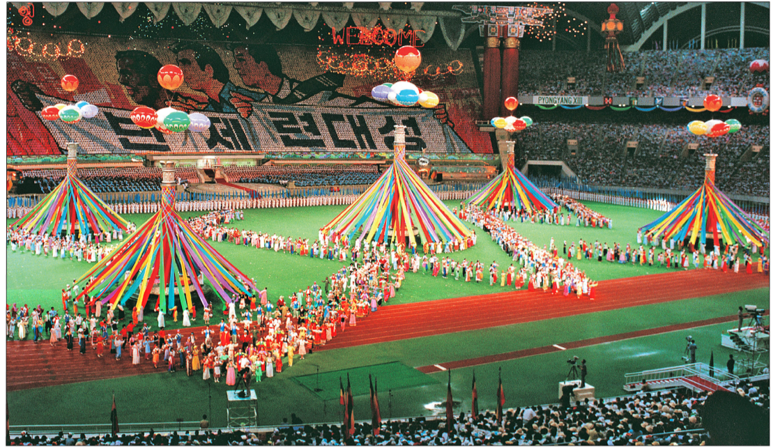
The opening ceremony of the 13th World Festival of Youth and Students held at Pyongyang's May Day Stadium in July 1989.

It worked hard to boost the movement, calling on all member nations to defend the unique tradition and characters of the movement and steadily maintain independence without being lured by foreign dominationist forces' "aid" or duped by their tricks to alienate and divide them, to settle disputes through negotiations out of the desire for unity, to fight against the moves of dominationist forces to aggression and interference with the strategy of unity by forming a united front embracing broader segments of people on the principle of noninterference in other's internal affairs and to strive to establish a new international economic order