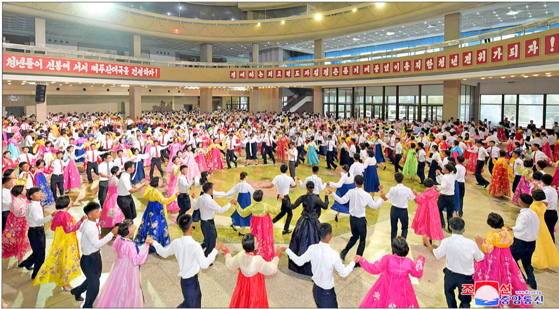
Young people get together to celebrate Youth Day.