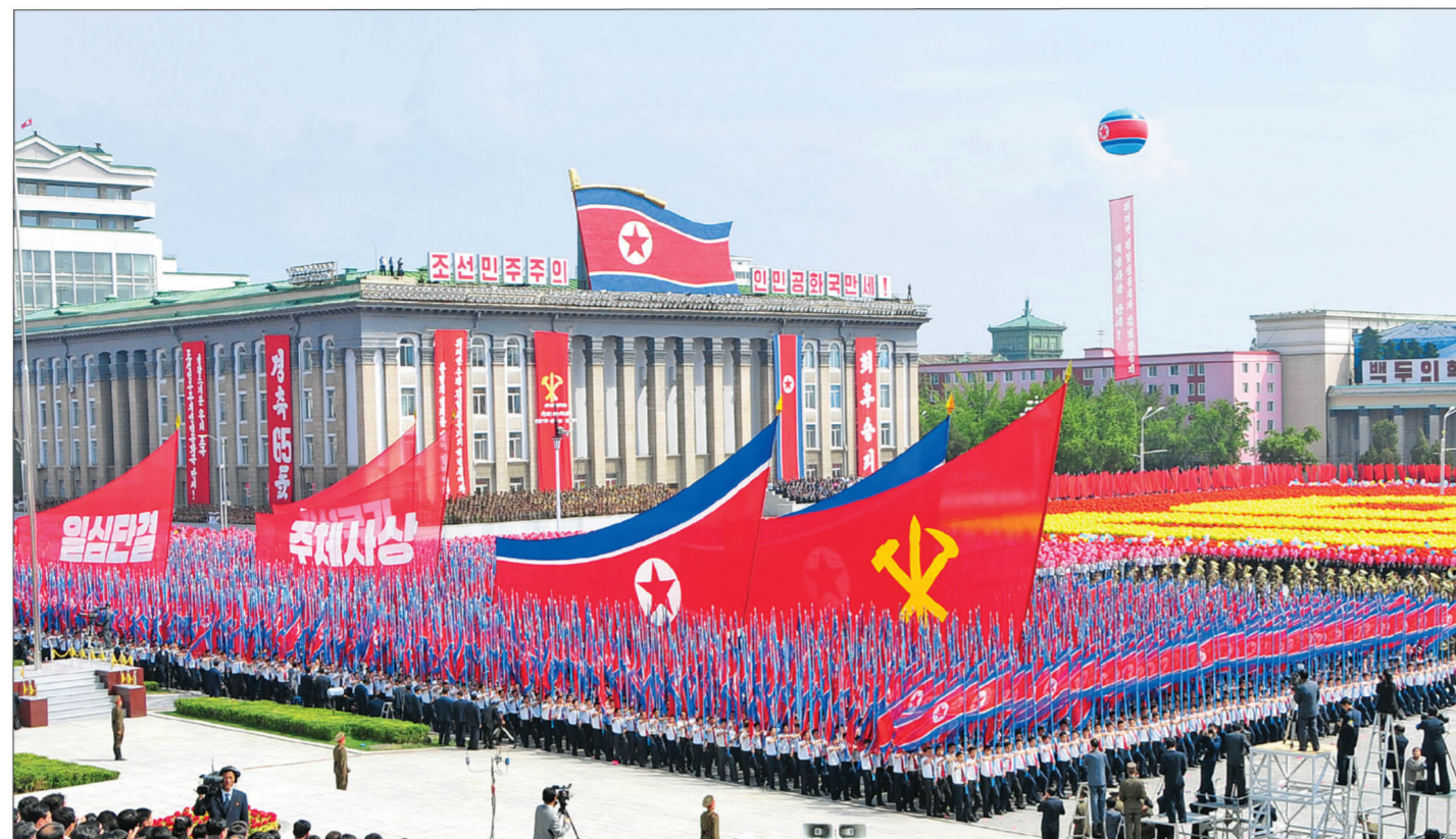
A mass rally showcases the single-hearted unity of the Korean people rallied behind the Party and leader.