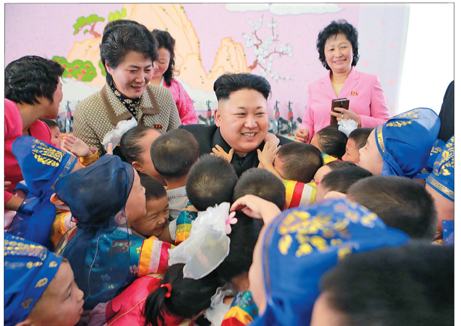
Blessing the parentless children to mark the new year in January 2015.