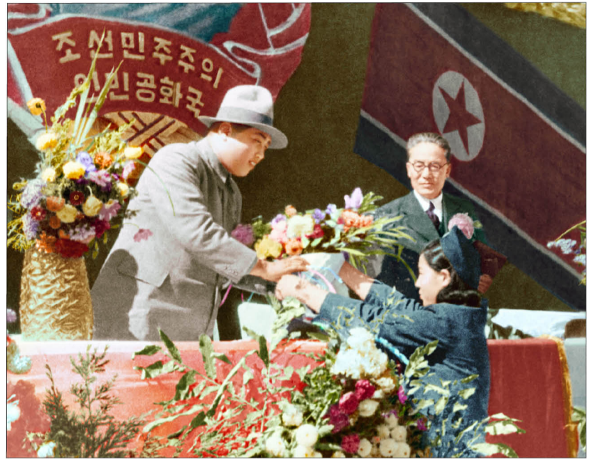
Attending the inaugural ceremony of a new building of Kim Il Sung University in October 1948. (right)