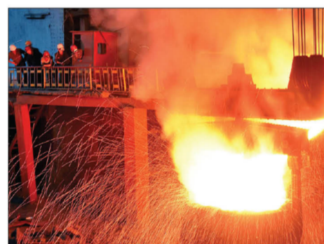
Molten iron is locally produced.