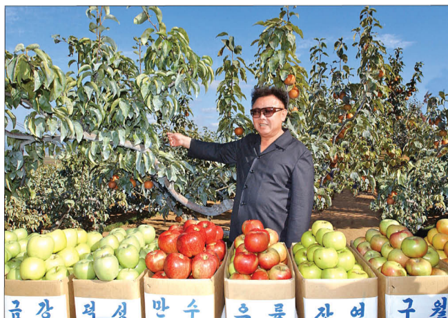
On his inspection of Kwail County, South Hwanghae Province, in September 2001.