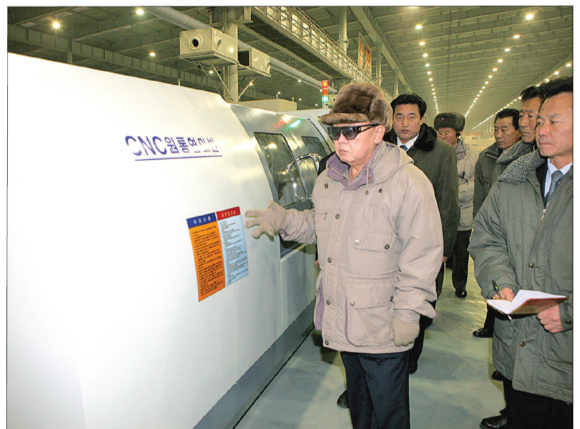
Kim Jong Il seeing CNC machine tools in December 2010. (right)