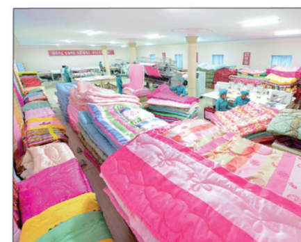
Production of silk quilts.