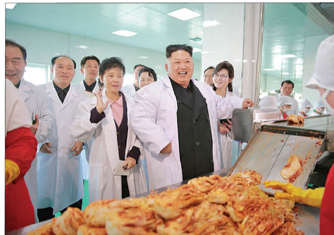
At the Ryugyong Kimchi Factory in January 2017. (left)