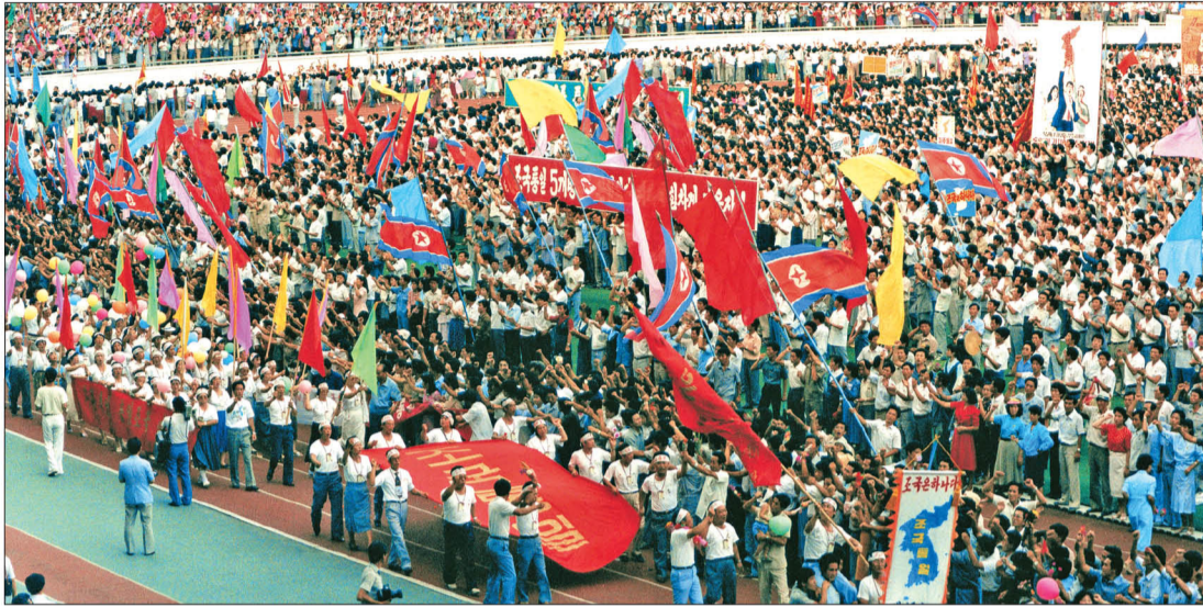
The zeal for reunification sweeps the venue of a reunification-oriented event in August 1990.

After the Korean war, it demanded the south side hold a political meeting at Panmunjom