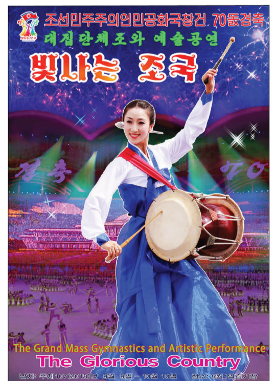
A poster of The Glorious Country , a grand mass gymnastics and artistic performance, which is to be held in Pyongyang.