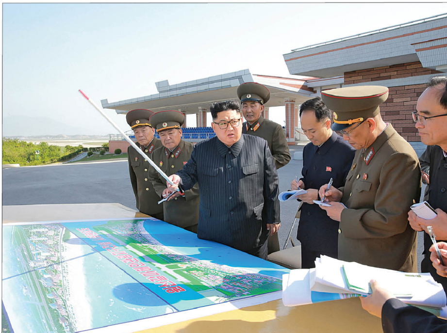
At the construction site of the Wonsan-Kalma coastal tourist area in May 2018.