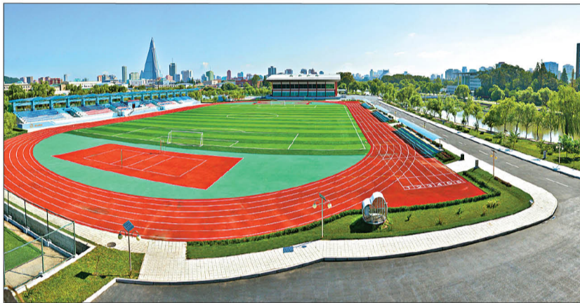
BYON KWANG NAM