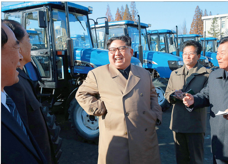
At the Kumsong Tractor Factory in November 2017.