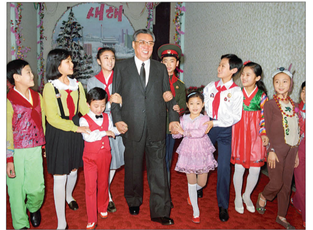
Attending the New Year celebration in December 1986.