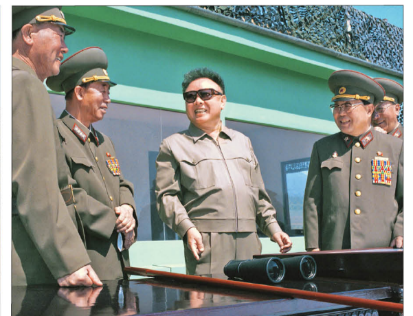
Giving important instructions for the buildup of the Korean People's Army in May 2005.