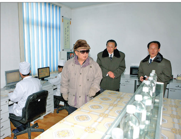
At the Bioengineering Branch of the State Academy of Sciences in January 2011.