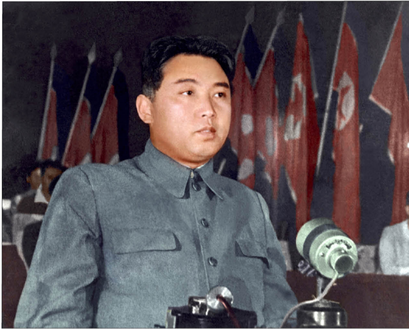
Kim Il Sung announcing the political programme of the government at the First Session of the DPRK Supreme People's Assembly in September 1948. (left)