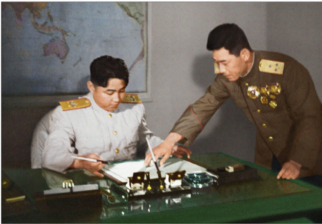
Ratifying the document related to the Korean Armistice Agreement in July 1953.