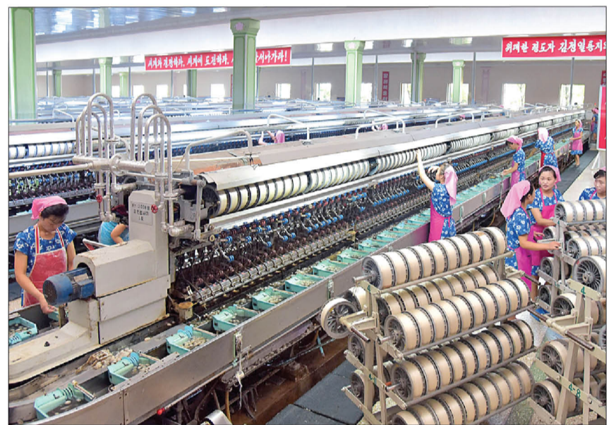
The Pyongyang Kim Jong Suk Silk Mill makes innovations in production.