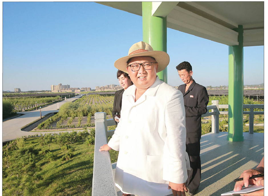
At the Kangwon Provincial Tree Nursery in July 2018.