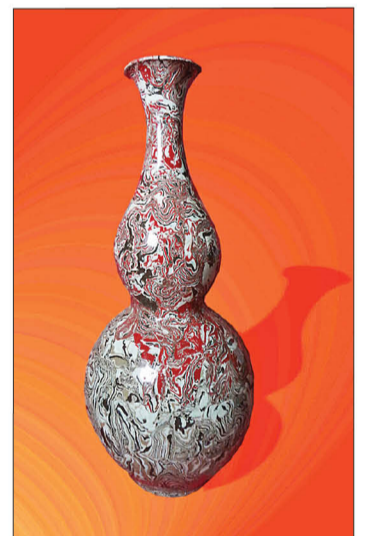
A streaky porcelain.

The porcelain enjoys popularity for the delicate rhythm in formative artistic representation, fantastic designs and streaky patterns consisting of the shapes