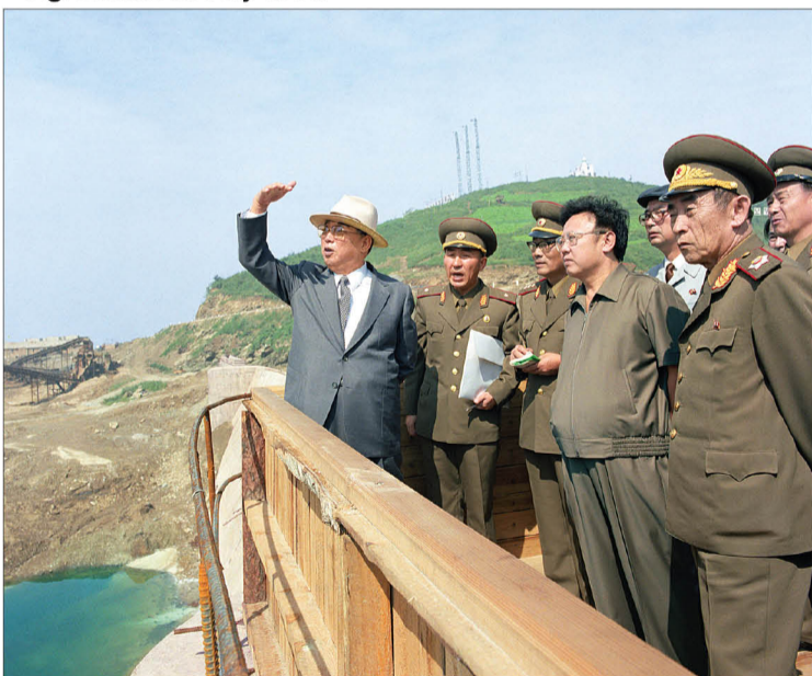
Kim Il Sung and Kim Jong Il looking round the construction site of the West Sea Barrage in September 1985. (left)