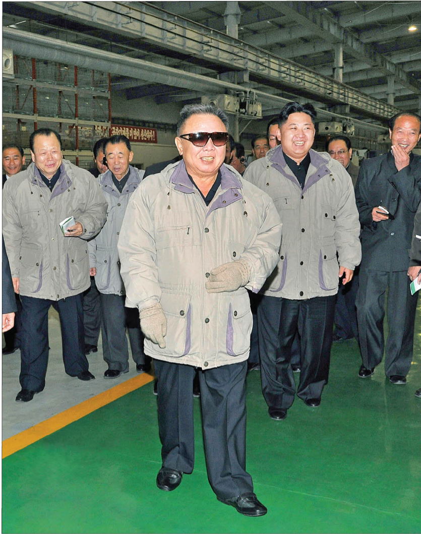
Kim Jong Il and Kim Jong Un together on an inspection tour in October 2011.