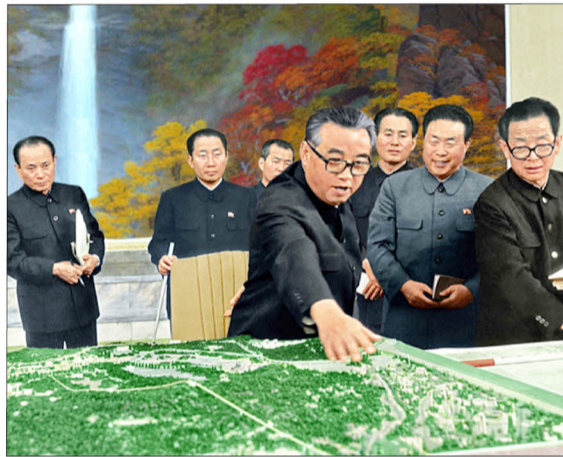
Unveiling a far-reaching plan for capital construction in November 1982.