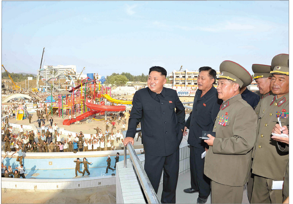
Kim Jong Un inspecting the construction site of the Munsu Water Park which was near to completion in September 2013. (above)