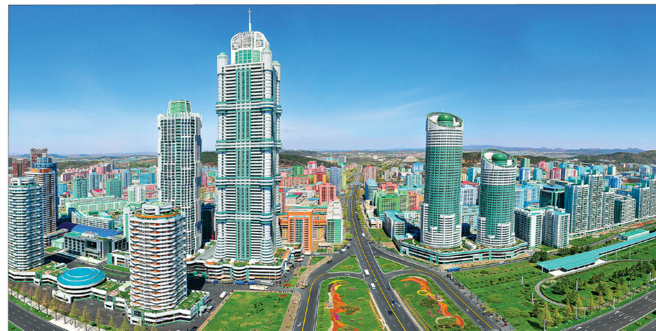
A partial view of iconic Ryomyong Street in Pyongyang.