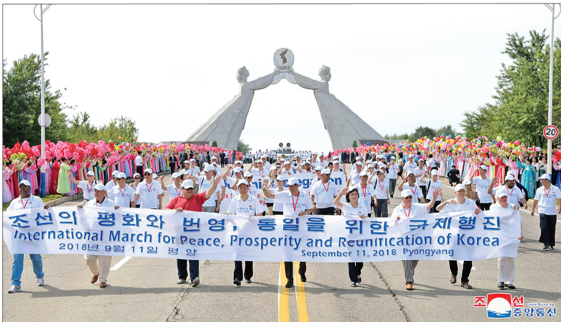
Marchers parade holding a placard which reads "International march for peace, prosperity and reunification of Korea".