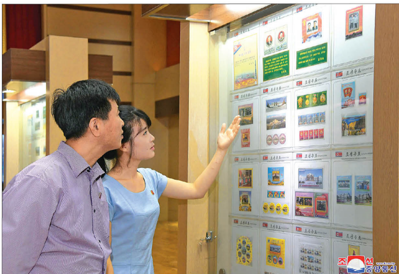
Visitors look on in a celebration event that showcases Korean stamps.