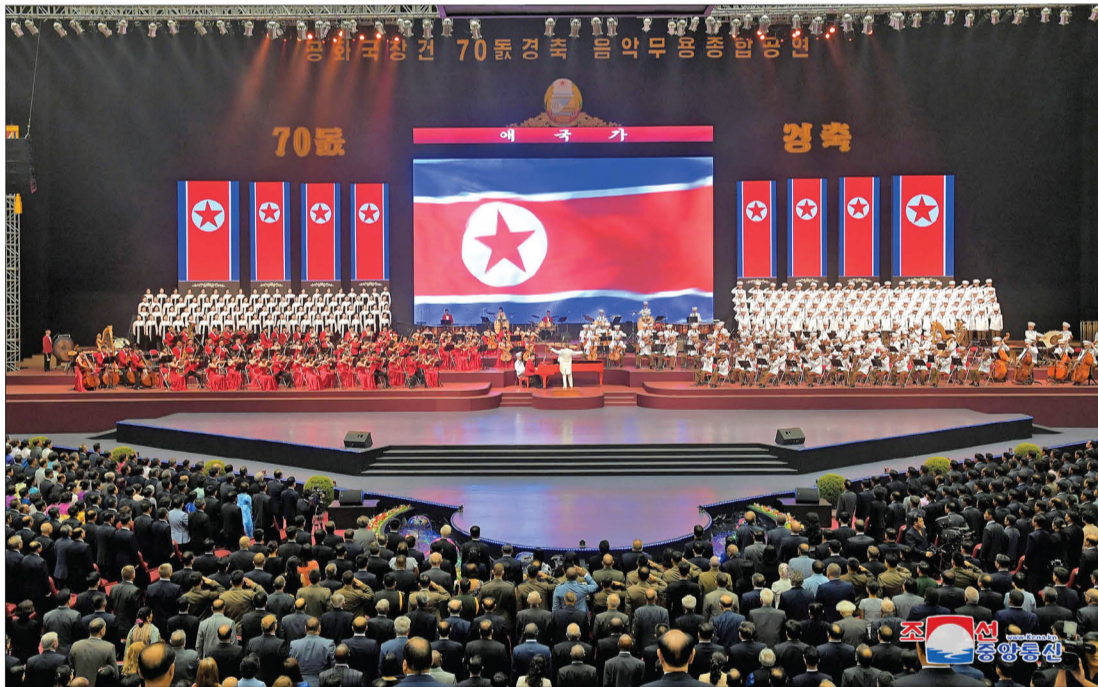
A music and dance performance held on the eve of the DPRK's 70th anniversary.