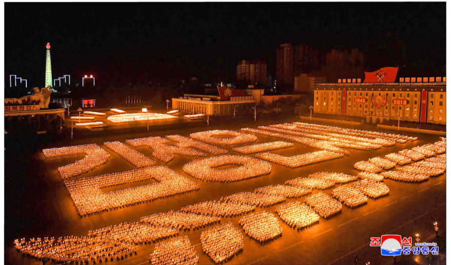
Torches depict the words "Era of Kim Jong Un".