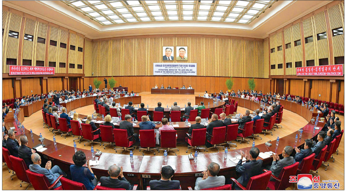
An international seminar on the Juche idea and 70 years of the DPRK is held at the People's Palace of Culture in Pyongyang.

The speakers gave in-depth explanations about the proud 70-year history of the DPRK that has demonstrated its invincible might as a socialist country which is independent, self-supporting and self-reliant in defence and the issues arising in waging a dynamic struggle for building a new society, independent and prosperous, under the banner of the Juche idea.