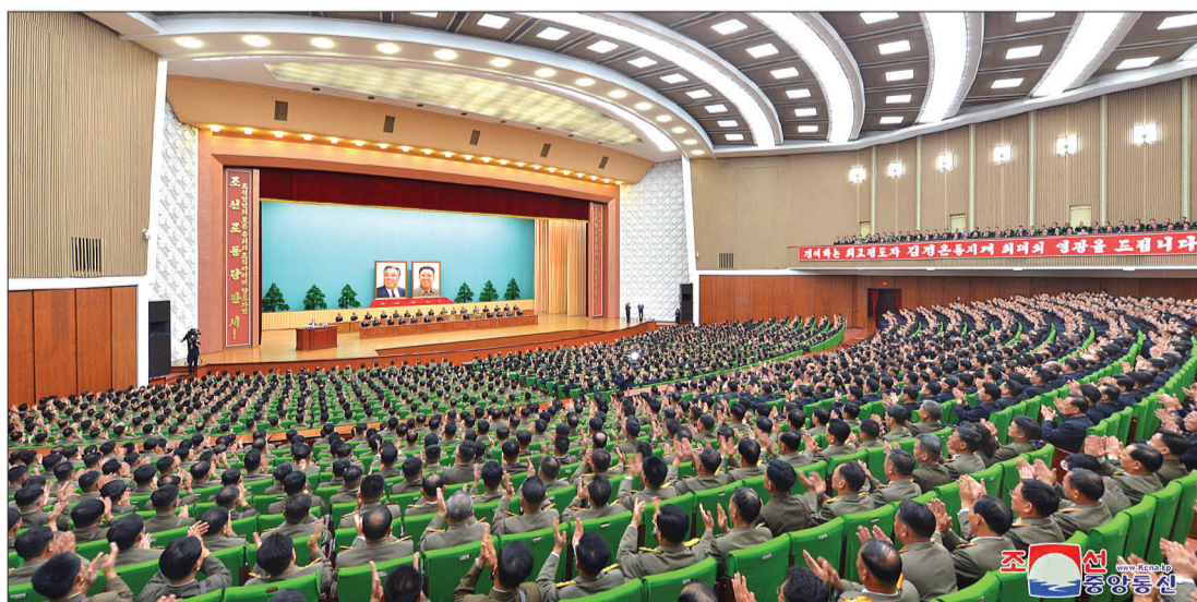
A meeting takes place to adopt a joint message to congratulate Supreme Leader Kim Jong Un on the 70th anniversary of the DPRK.

It also brought together officials from Party and government organs, the Cabinet, working people's organizations, ministries and national agencies, officers and men of the Korean People's Army and