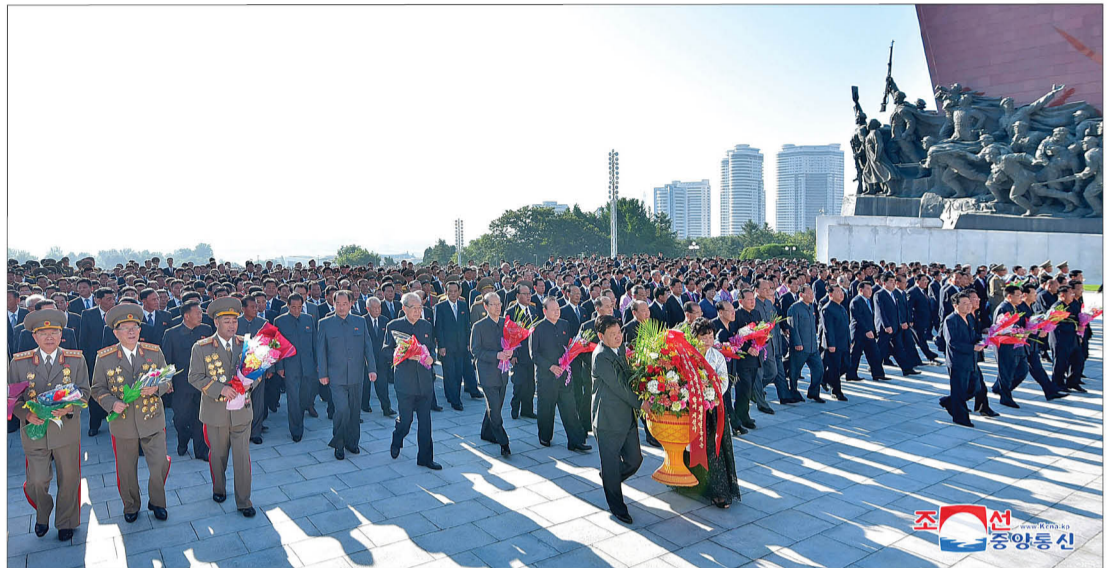
Senior Party, government and military officials and working people present baskets of flowers and bouquets at the statues of President Kim Il Sung and Chairman Kim Jong Il on Mansu Hill in Pyongyang.