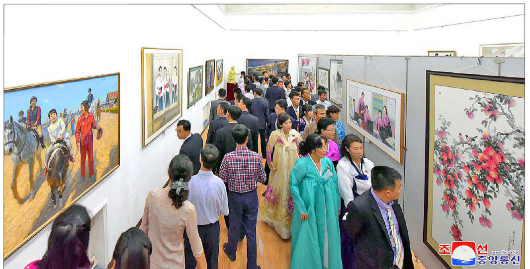
The national fine art show draws many people as part of events that are held to mark the 70th birthday of the DPRK.