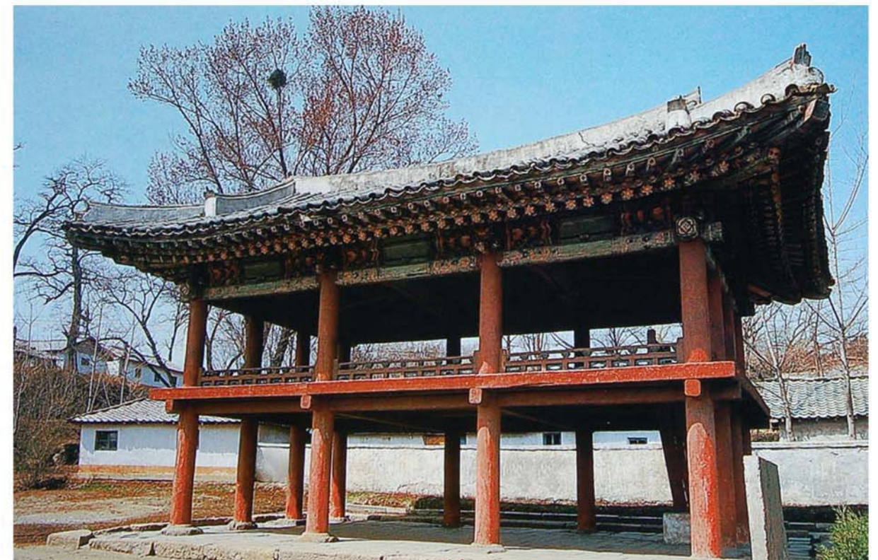
A general view of the Jewol Pavilion.