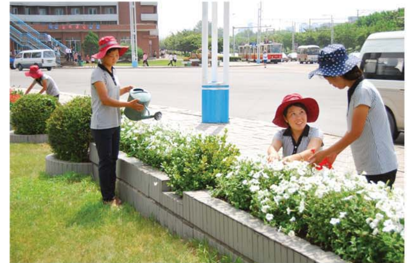
Streets are decorated with beautiful and fragrant flowers.

Now they are expanding the flower bed, making it possible to improve the quality of the river water.