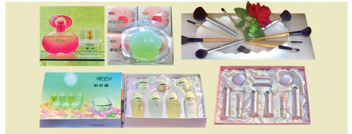
Some of Pomhyanggi cosmetics.

▶ the better we could understand their spirit of self-reliance and self-development.