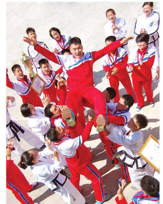
Athletes are full of delight at their win.