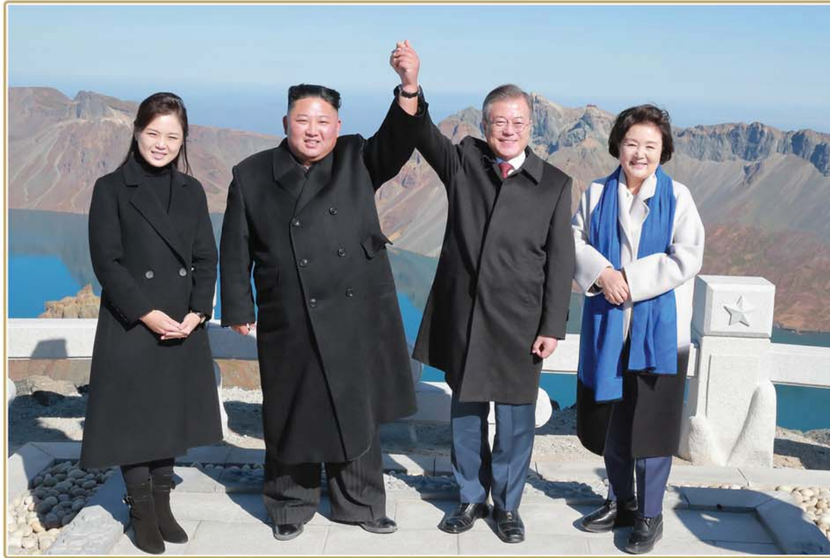
Kim Jong Un and his wife Ri Sol Ju, together with Moon Jae In and his wife, pose for a photograph on Mt Paektu in September 2018.

► permanent shutdown of the Nyongbyon nuclear facility if the United States takes corresponding steps in line with the spirit of the June 12 DPRK-US joint statement.