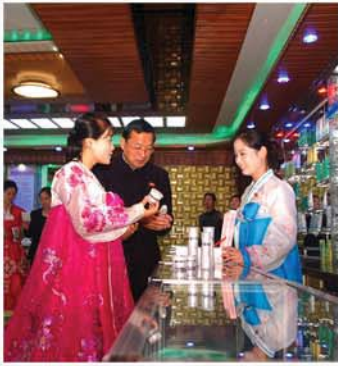
Front Cover: At a Pomhyanggi Cosmetics Exhibition