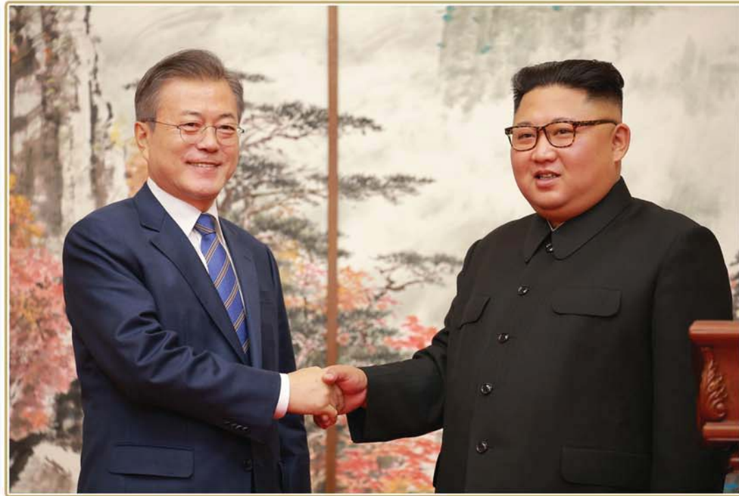
Kim Jong Un and Moon Jae In make joint statements relating to the September Pyongyang Joint Declaration in September 2018.

► to accomplish the desire of the Koreans who have been eager to meet a new era of unity, reunification, peace and prosperity of the whole nation.