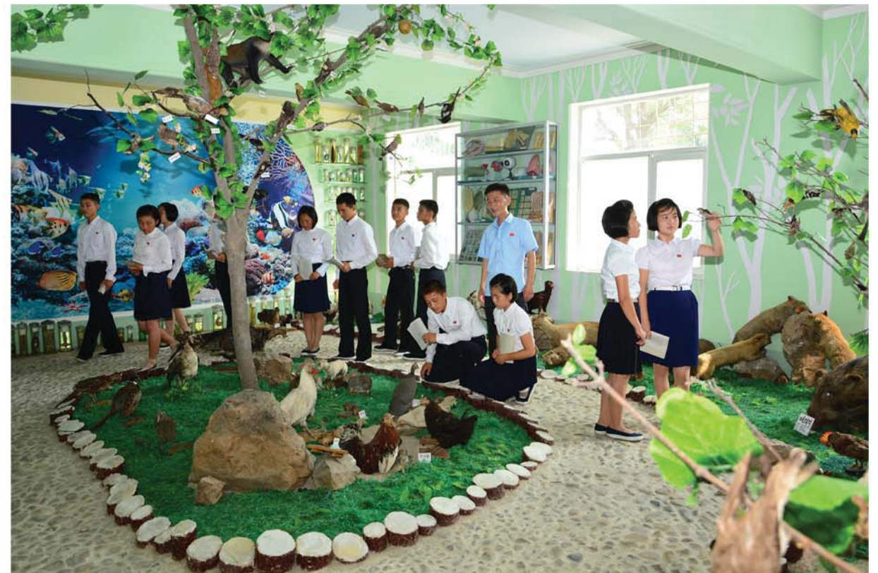
At a specimen room.

We looked round the foreign language, physical and chemical laboratories, and then proceeded to the biological specimen room. A rock covered with lichen, a bear sitting like a door-keeper, birds on