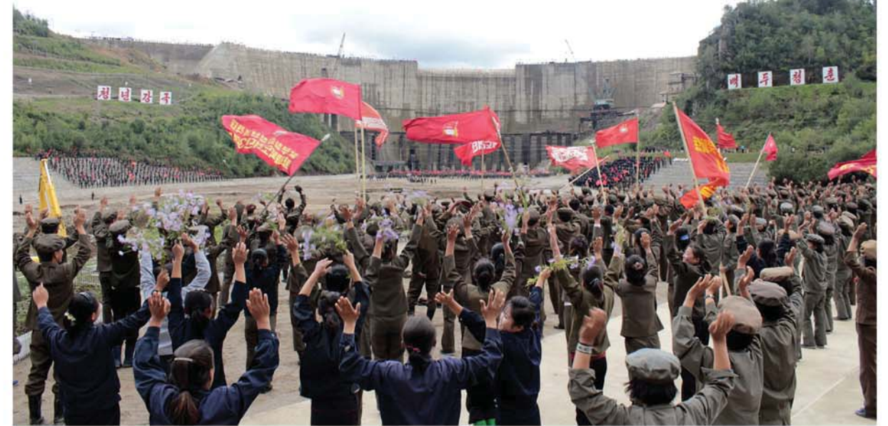
Young builders perform miracles in the construction of the Paektusan Hero Youth Power Station (August 2015).

The young builders engaged in the project unsparingly devoted the strength and passion of their precious youth in the deep, rugged mountain valleys. ▶