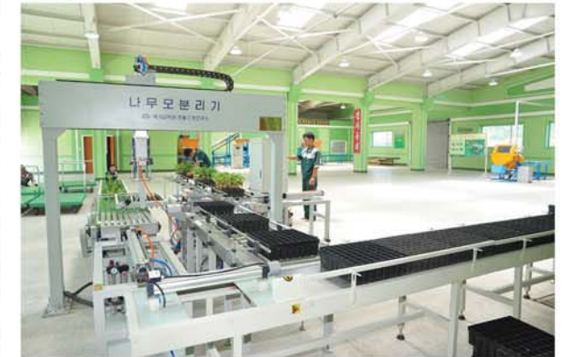
Sapling production is getting on a more scientific footing.

of test acclimatization, are transferred to the general control room via the integrated control system. Based on this, appropriate conditions are provided for the growth of saplings.