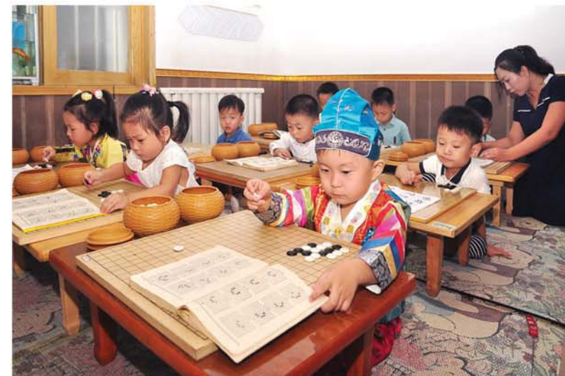
Children are learning knowledge and techniques of paduk .