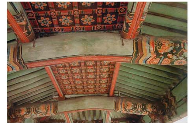
The ceiling of the pavilion.