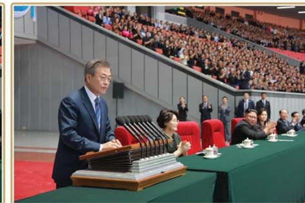
Kim Jong Un makes a meaningful speech after seeing a grand mass gymnastics and artistic performance together with Moon Jae In in September 2018.