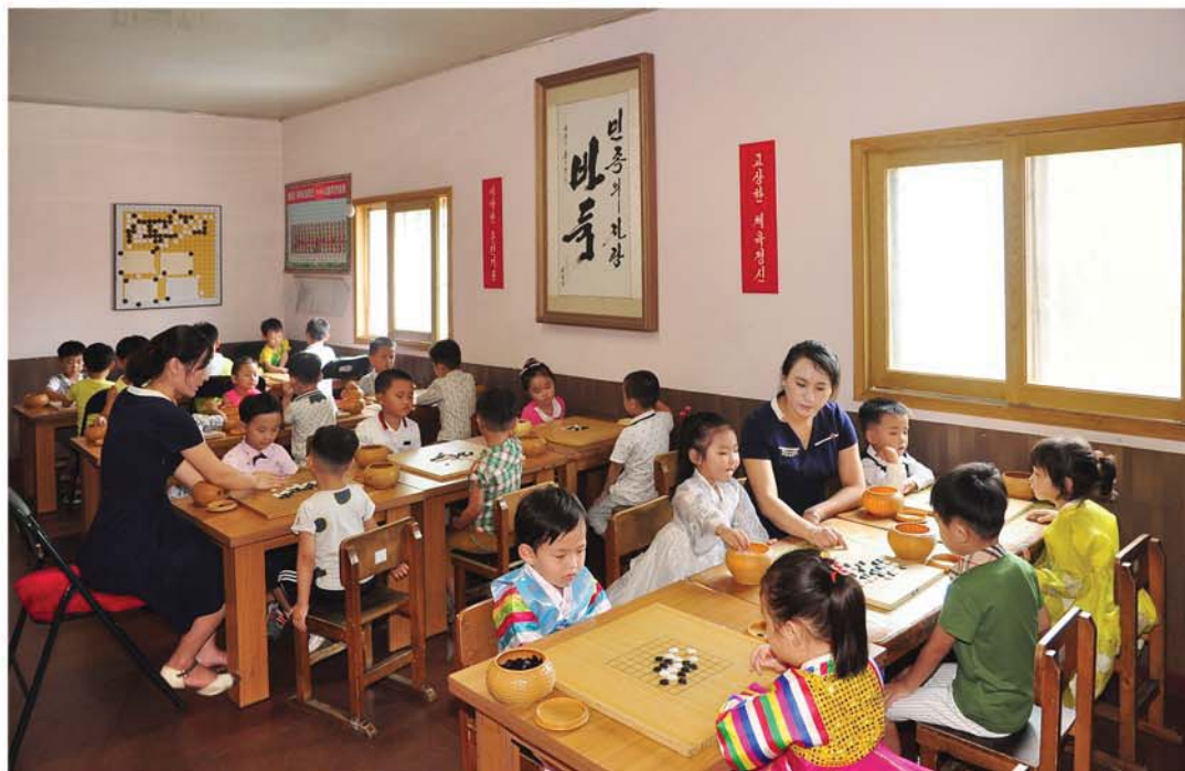
In a training room of the Paduk House.