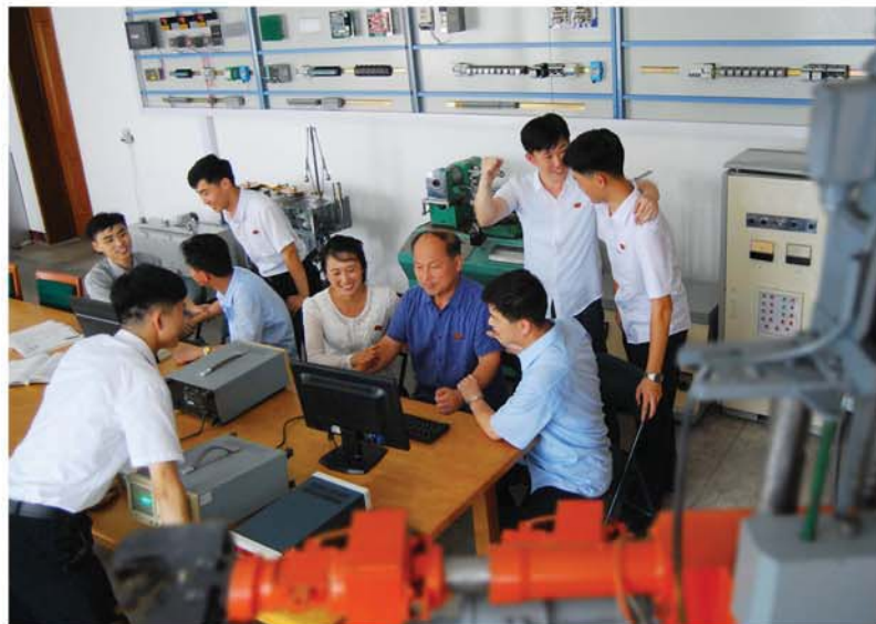
Researchers are full of joy over their successful project.