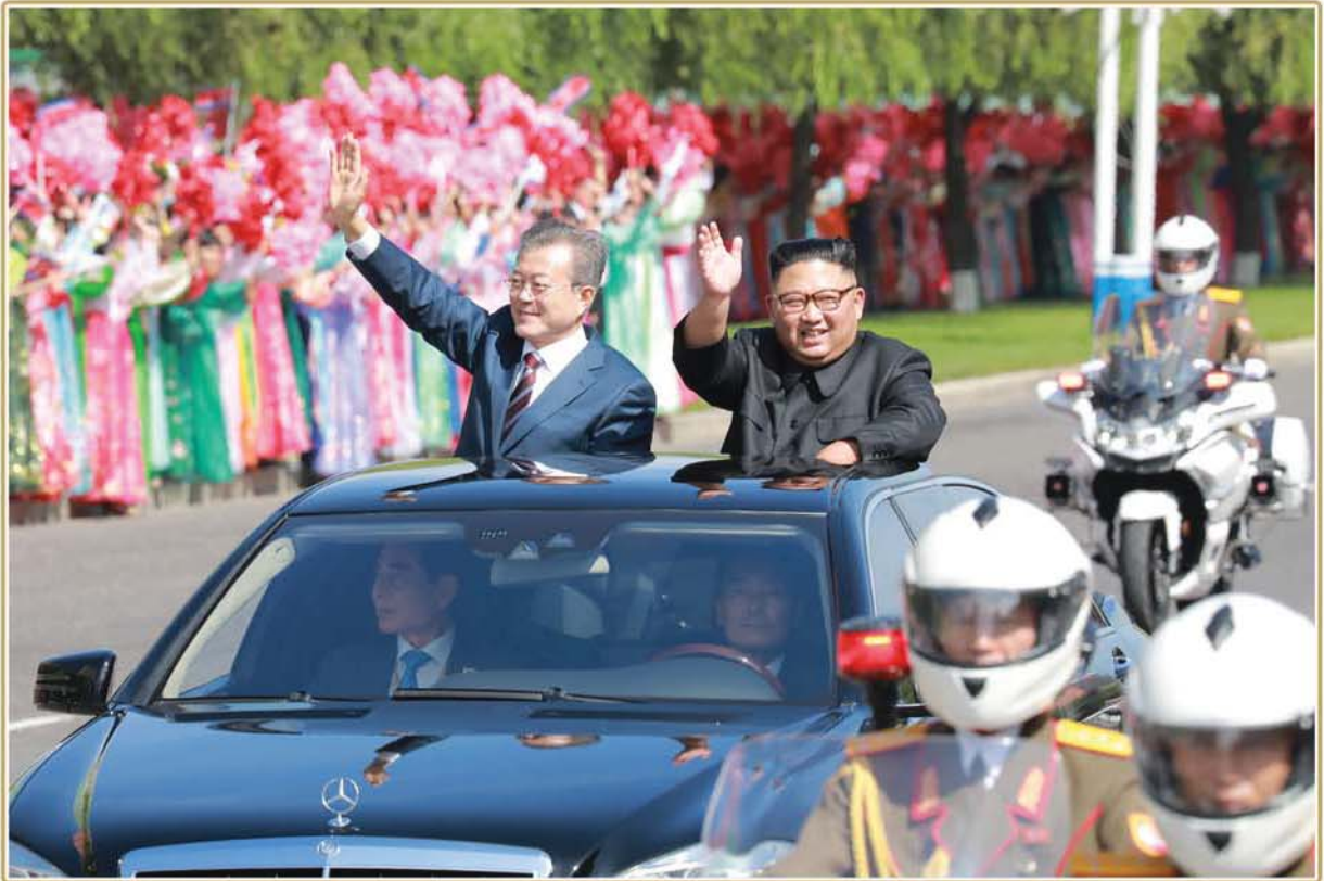
Supreme Leader Kim Jong Un, together with President Moon Jae In, acknowledges cheers of the crowds in September 2018.