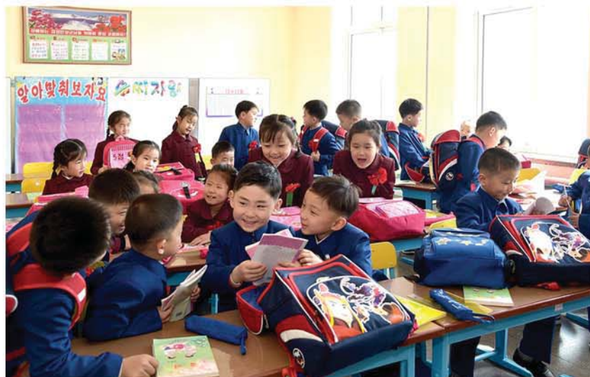
Children greatly benefit from free education and free medical care.