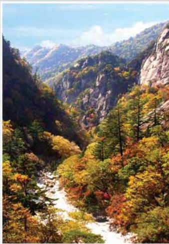
Back Cover: Manphok Ravine in Mt Kumgang in autumn