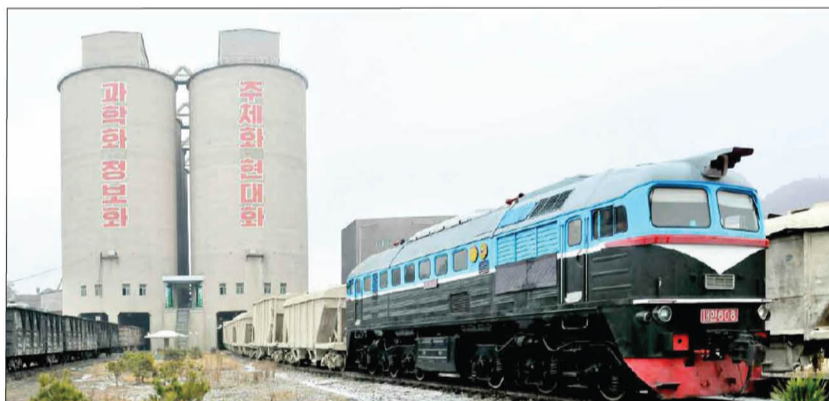
Production picks up at the Sangwon Cement Complex.