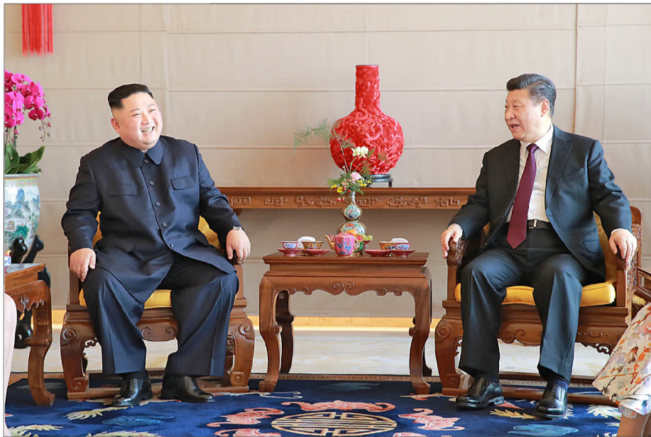
FROM PAGE 3

the auspicious and beautiful time of greeting the new year in order to open up a prelude to the development of Sino-DPRK relations, and warmly welcomed them.