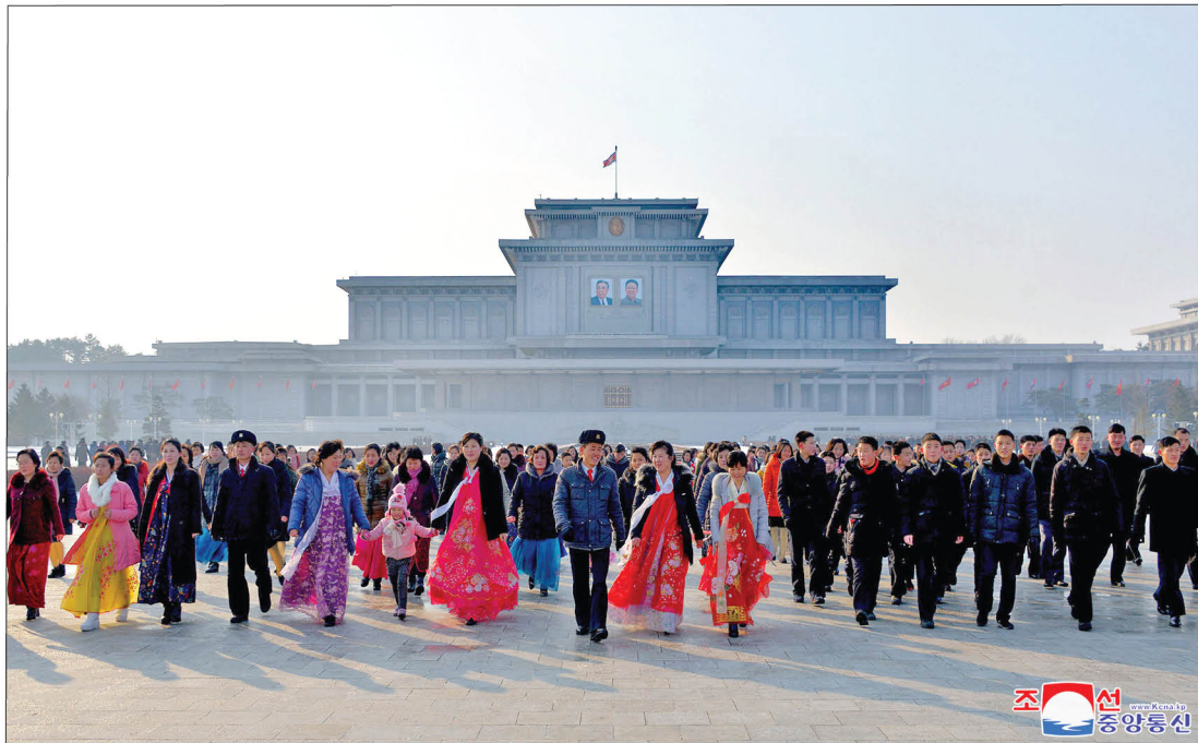
Crowds of people visit the Kumsusan Palace of the Sun to pay tribute to Chairman Kim Jong II.