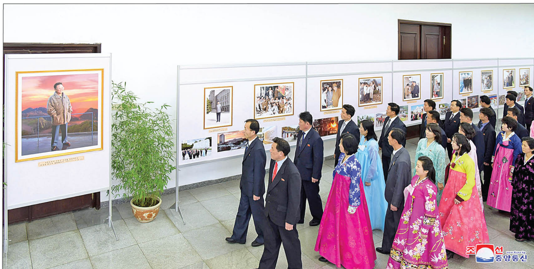
People look on in the central photo exhibition dedicated to Chairman Kim Jong II.