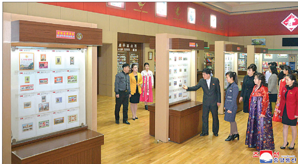
Visitors show keen interest in Korean stamps which are on display as part of the celebration events.

The Korean people significantly celebrated the Day of the Shining Star, Chairman Kim Jong II's birth anniversary.