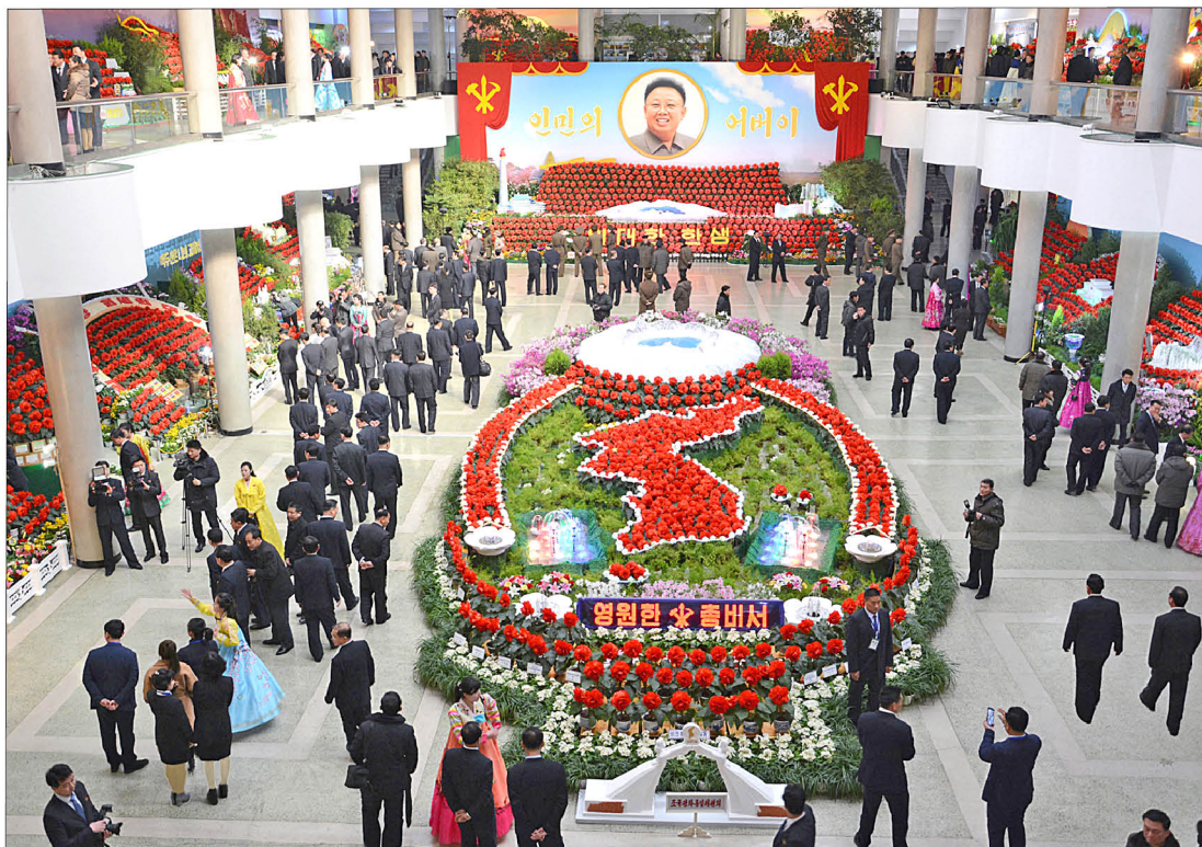
The 23rd Kimjongilia Festival is held on a larger scale in the run-up to the Day of the Shining Star.

Speakers at the events highly praised Chairman Kim Jong Il for having devoted his all to provide his people with a better and happier life.