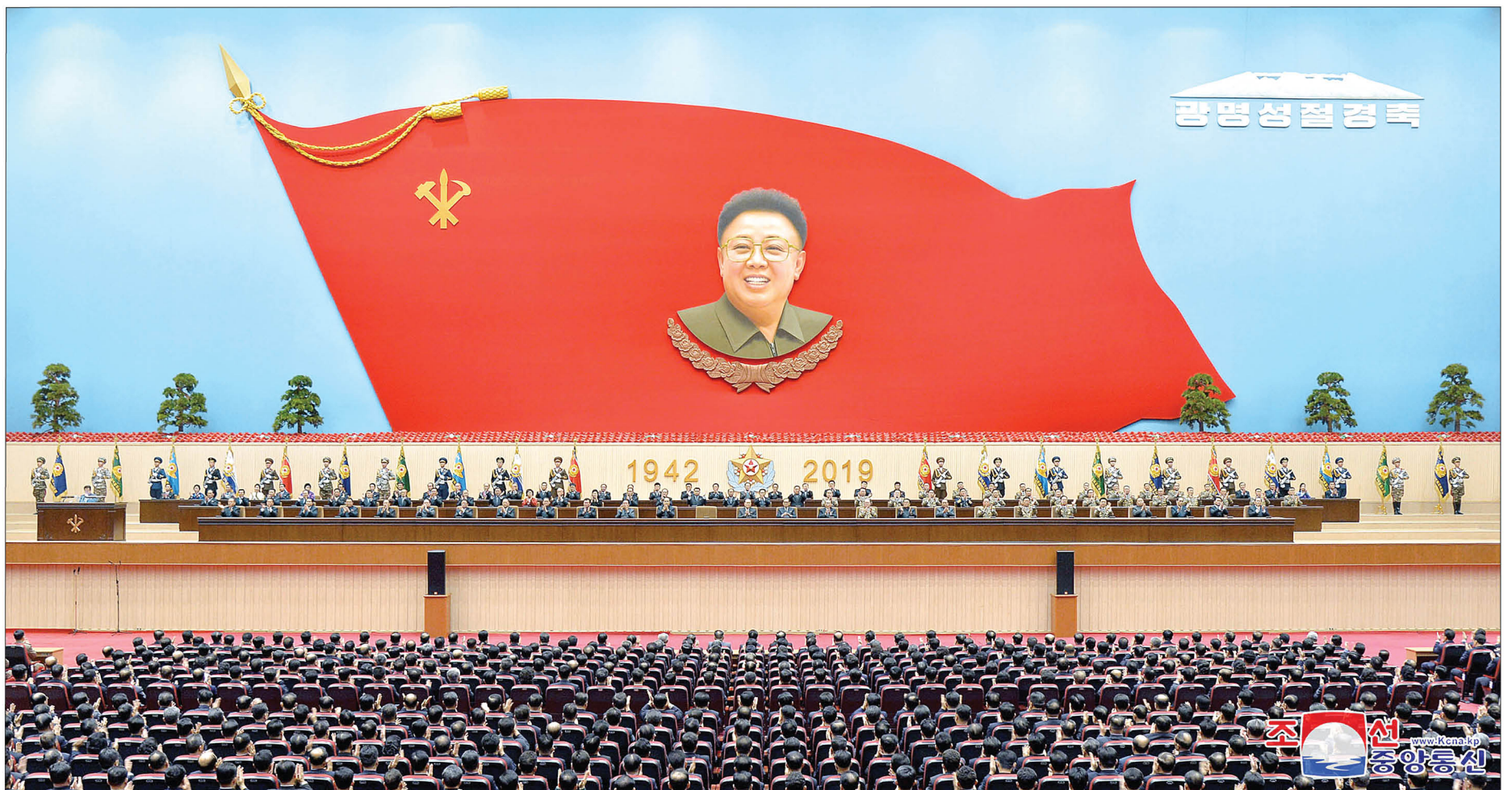
A national meeting takes place at the Pyongyang Indoor Stadium to celebrate the 77th birthday of Chairman Kim Jong Il.

A national meeting took place at the Pyongyang Indoor Stadium in Pyongyang on February 15 to celebrate the 77th birth anniversary of Chairman Kim Jong Il.