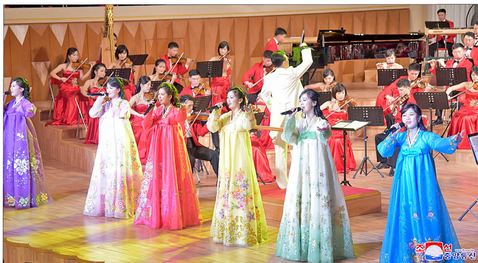
A Korean art troupe from Japan gives a music and dance performance at the Pyongyang Grand Theatre.