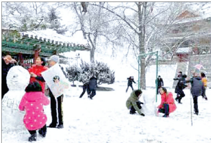
People across the DPRK celebrate Jongwoldaeborum , the first full-moon day in lunar January.

Family members living in a high-rise apartment building on Mirae Scientists Street view the first full moon in lunar January.