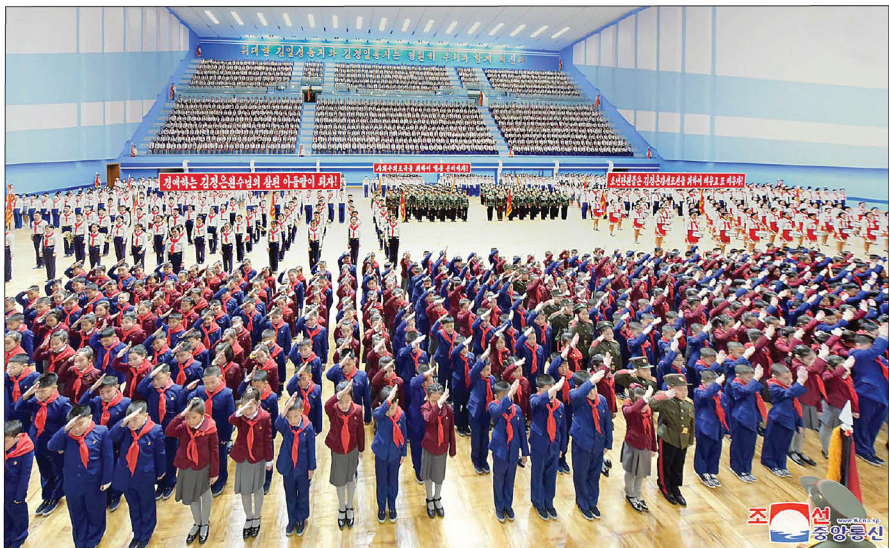
A contingent of new entrants salute in a joint national meeting of the Korean Children's Union organizations held to mark the Day of the Shining Star.