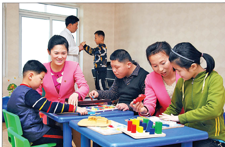
Children with mental impairment are under training at the Korea Rehabilitation Centre for Children with Disabilities.