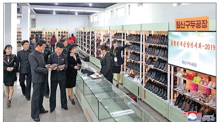
Visitors appreciate leather shoes at the Spring National Footwear Exhibition-2019.