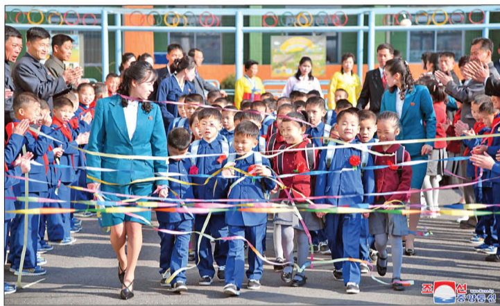
New pupils enter Pyongyang Primary School for Orphans as they are congratulated by well-wishers.