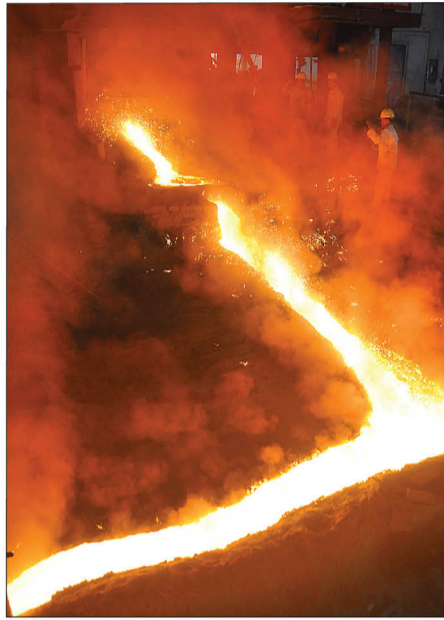
Juche-based iron production is on the rise at the Hwanghae Iron and Steel Complex.