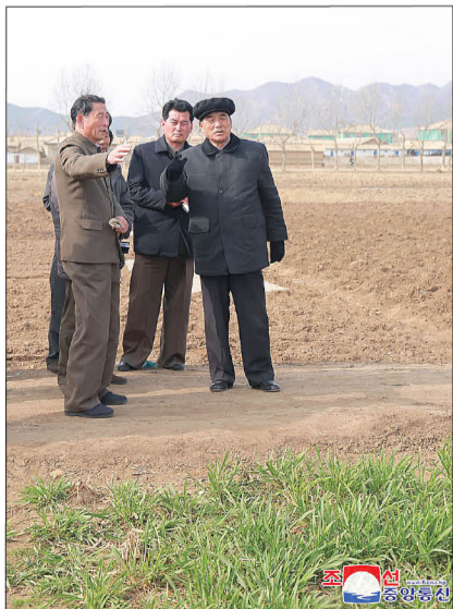
Premier Pak Pong Ju (first from right) visits a cooperative farm in South Hwanghae Province.