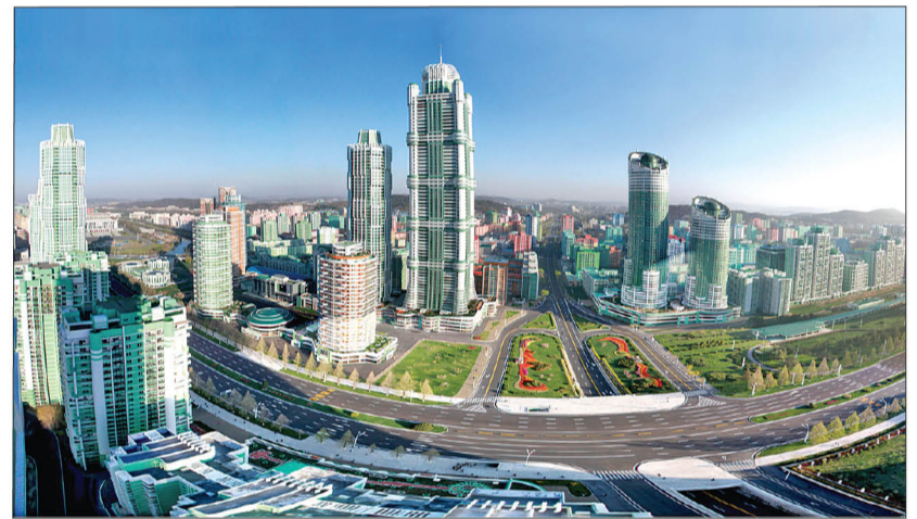
A panoramic view of Pyongyang's Ryomyong Street, which was built under the meticulous guidance of Supreme Leader Kim Jong Un.