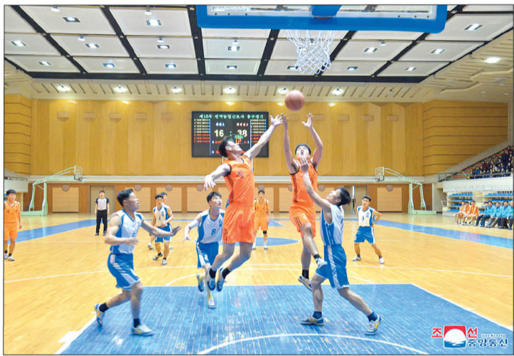
A scene of a match of the 13th national agricultural workers basketball tournament.

The players showed thrilling scenes with resolute fighting spirit and perseverance.