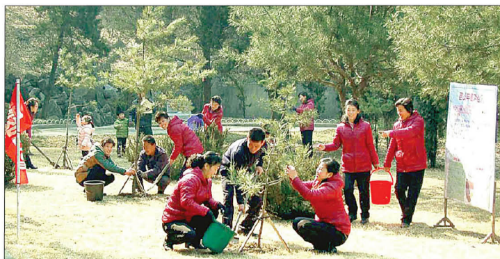
People plant saplings during the nationwide spring tree-planting campaign.