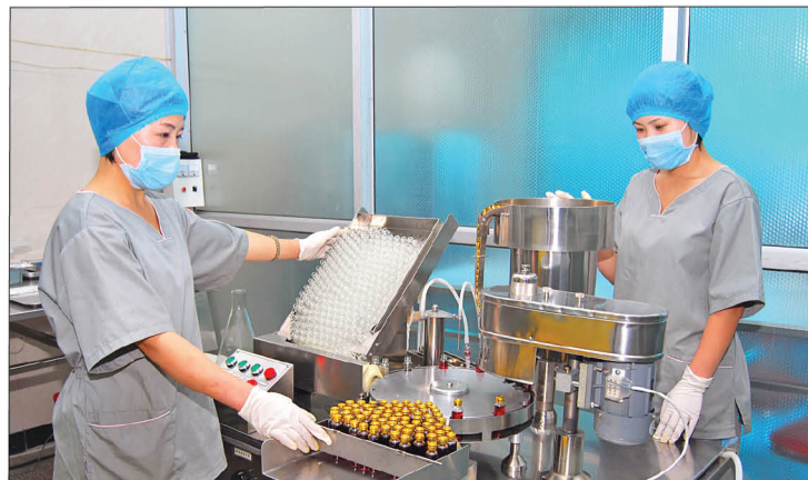
Medicines are produced by using marine products at the Songchongang Pharmaceutical Company.