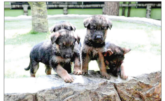
Four German Shepherd puppies play at the Central Zoo in Pyongyang.