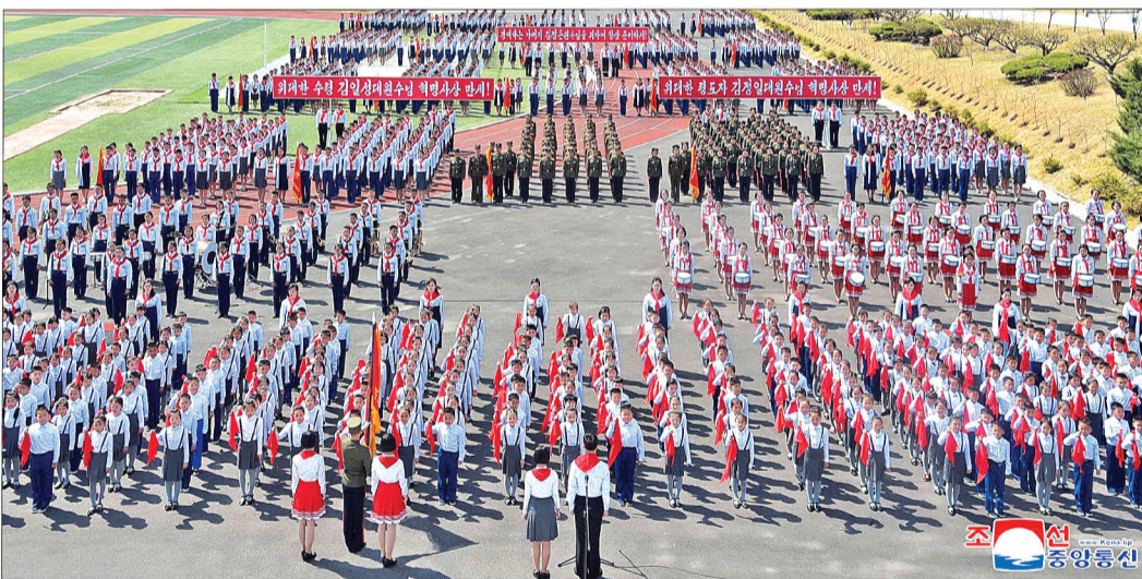
A joint national meeting of the Korean Children's Union organizations takes place at Mangyongdae Revolutionary School.