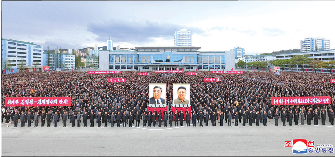
Local people get together in Wonsan, Kangwon Province, to pledge themselves to bring about a great upsurge in all fields of socialist construction.

Working people of Kangwon Province got together in Wonsan on April 18 to pledge themselves to bring about a great upsurge in all fields of socialist construction with self-reliance as the treasured sword for prosperity in hearty response to the historic policy speech of Supreme Leader Kim Jong Un and the spirit of the Fourth Plenary Meeting of the Seventh Central Committee of the Workers' Party of Korea.