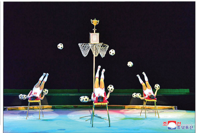
An acrobatic performance is given by the National Circus.