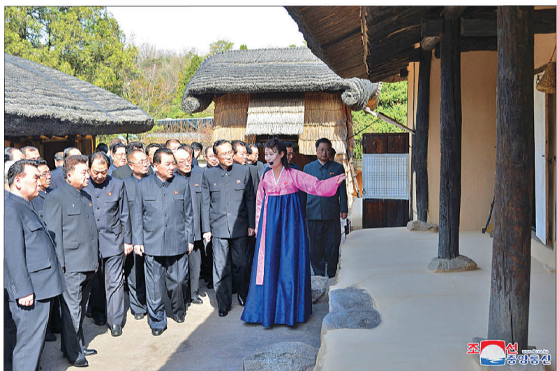
Senior Party and government officials are on a visit to President Kim Il Sung's birthplace at Mangyongdae.