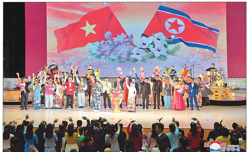
The audience give a standing ovation to the Vietnamese performers.