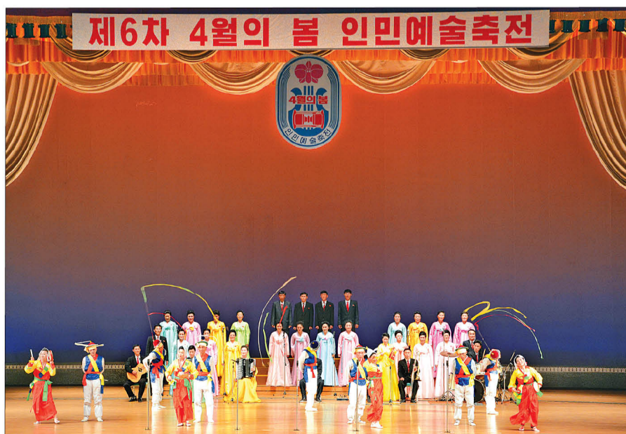
A performance of the Sixth April Spring People's Art Festival.