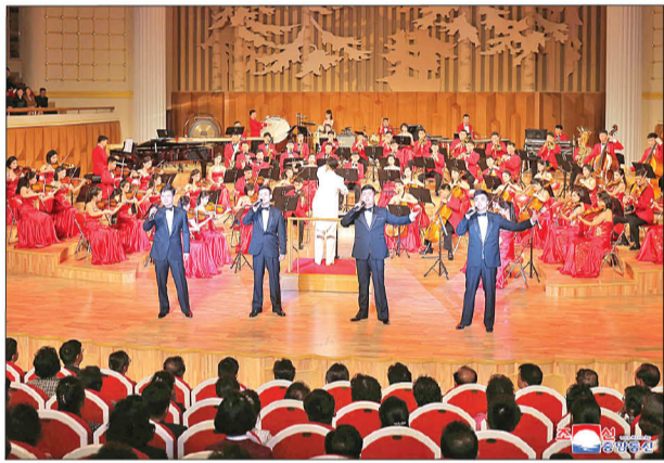
The Samjiyon Orchestra stages a concert to mark the Day of the Sun.