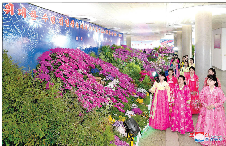
Visitors look round the displayed flowers named after President Kim Il Sung at the annual Kimilsungia Festival.