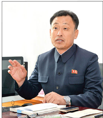
Kim Myong Chol, chief of the General Forest Bureau.

Thanks to the state measures taken to prevent damage from wildfires last year, over 100 km-long firebreaks were newly created in over 300 hectares of forests and 130-odd-km-long stone barriers and 870 catchment sites built or repaired. A nationwide wildfire monitoring, notifying