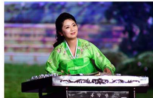
National identity-showing performances are put on the stage.