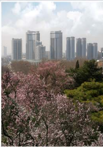
Back Cover: Moran Hill in spring