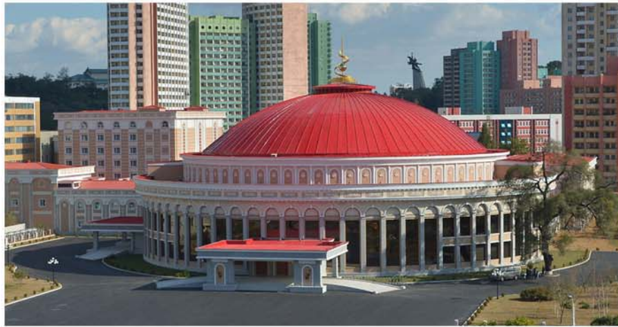
The Samjiyon Orchestra Theatre.

► the banner of self-reliance as required by the idea.