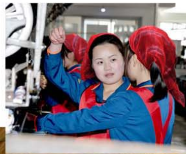
A process of silk thread production from raw cocoons.