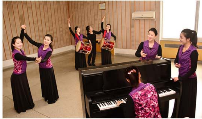
Efforts are made to create new singing and dancing programmes.