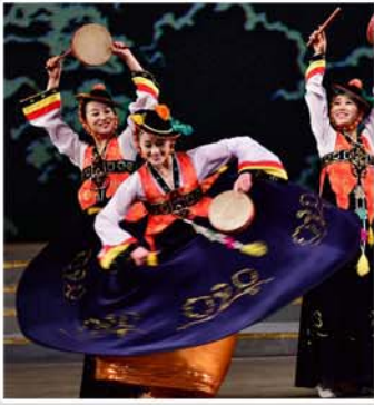
Front Cover: A scene from the National Folk Art Troupe's performance