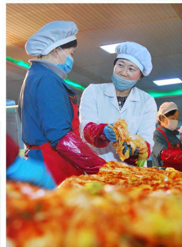
Different kinds of kimchi are produced to be supplied to local residents.