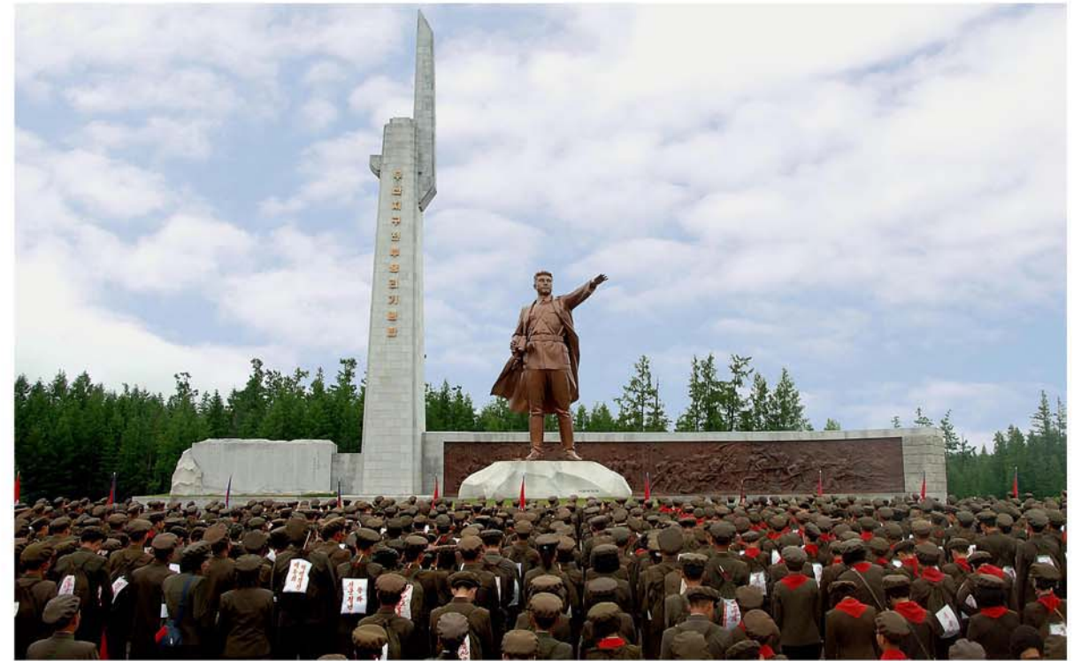
The Monument to the Victorious Battle of the Musan Area.

From President Kim Il Sung’s reminiscences “With the Century”