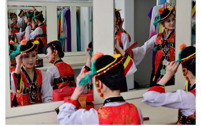
At the dressing room.