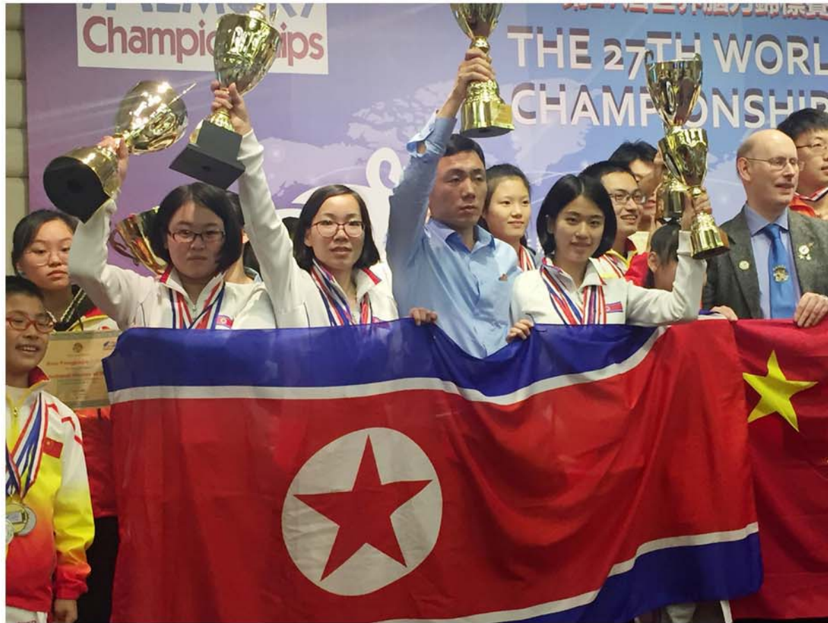
Kim Hyong Jik University of Education students win the title of the International Grandmaster of Memory in the 27 th World Memory Championships.