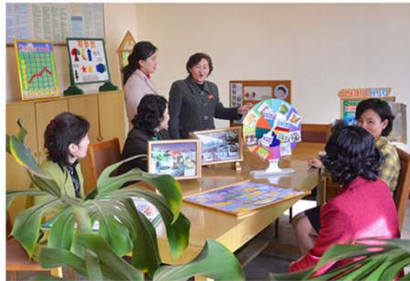
Emphasis is put on improving the teaching ability.

SOME TIME AGO I VISITED THE TAEBO Primary School in Pothonggang District, Pyongyang.