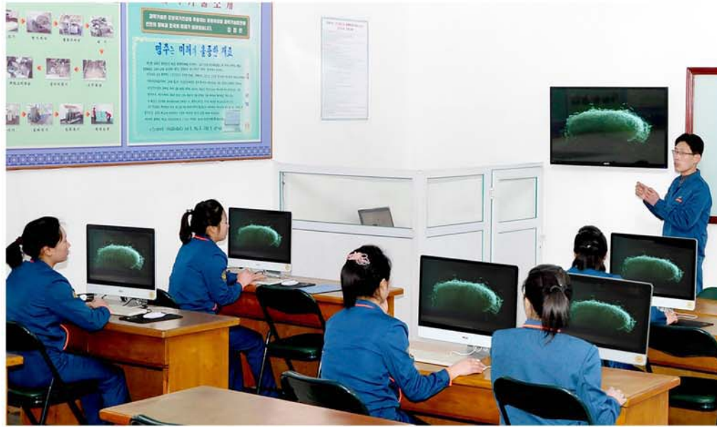
At the sci-tech learning space.