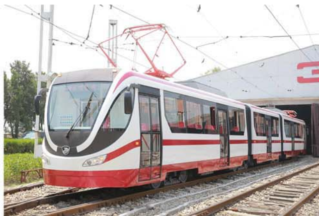
New models of a tramcar and a trolley bus.