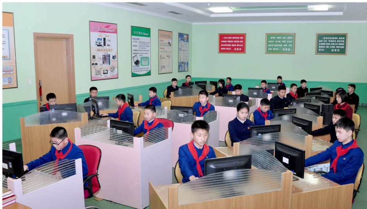
The IT circle members are engrossed in extracurricular studies.

ways decided the correct way to solve problems, and O was very quick in programming. If the three boys pool their wisdom it will bear greater fruit. With this thought the young instructor oriented everything towards having them develop a cooperative spirit. He led them to cultivate the attitude whereby to understand, help and value one another in and out of study, and saw to it that the attitude was directly displayed in their study: he inspired them to candidly exchange their opinions and knowledge in all aspects such as analysis and judgment of problems, deciding of the way to solve problems and programming. As a result, the three boys won the programming contest of the 21 st national schoolchildren's festival of loyalty held in April 2018.