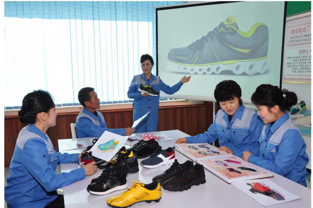
A discussion on new products.

► sci-tech festival and a district sci-tech festival.