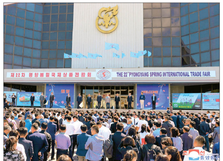
The 22nd Pyongyang Spring International Trade Fair opens at the Three-Revolution Exhibition House.