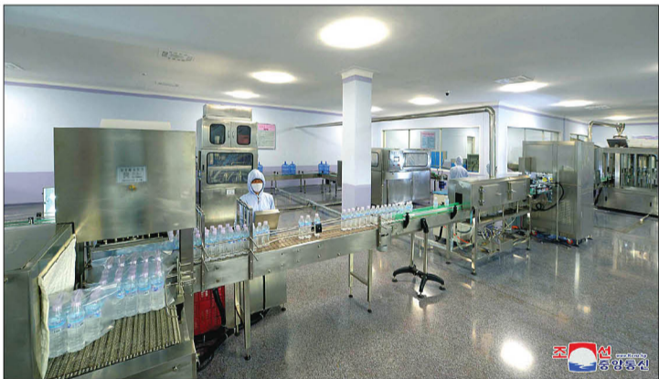
An inside view of the newly-built Taesongsan Spring Water Factory.

A modern spring water factory has been built in the Mt Taesong area in Pyongyang.