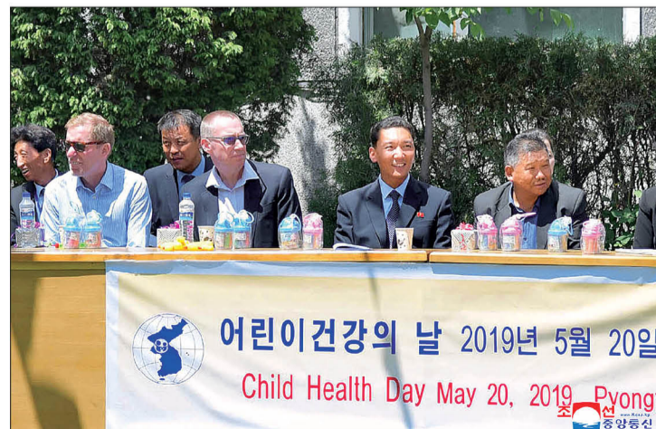
An event takes place at the Taedongmun Kindergarten in Pyongyang on May 21 to mark Child Health Day.