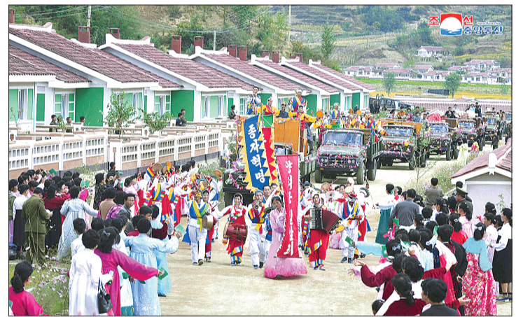
Locals celebrate move into new homes at a farm village in the hot spring resort area in Yangdok County, South Phyongan Province, the DPRK.