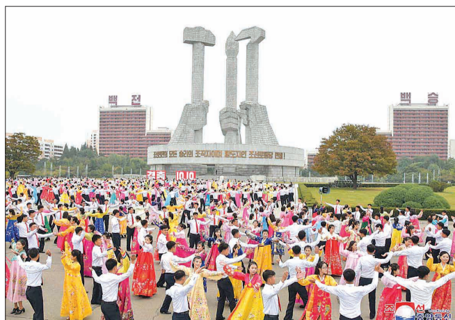
Young people dance in celebration of the WPK anniversary in front of the Monument to Party Founding in Pyongyang.