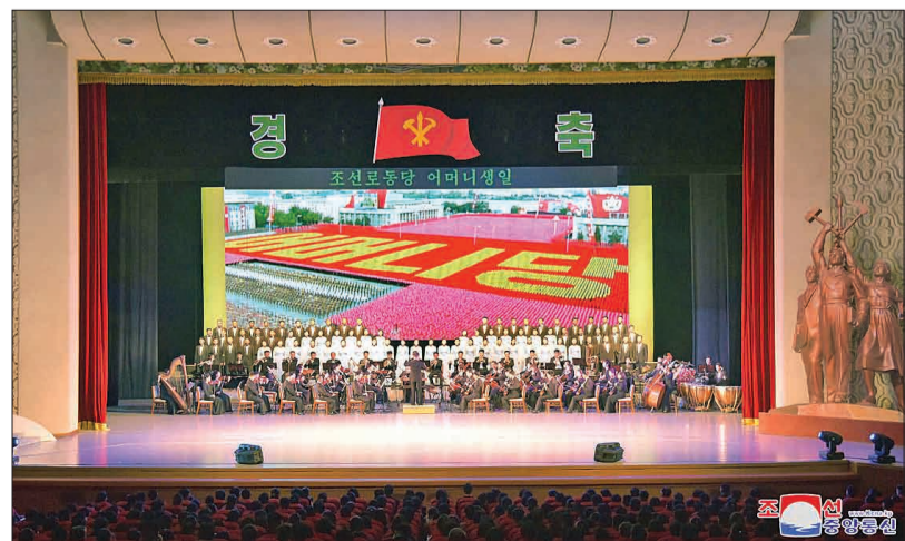
An art performance is given on Thursday in Pyongyang to mark the 74th anniversary of the Workers' Party of Korea.