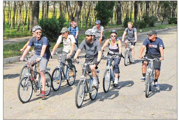
Foreigners travel around Pyongyang by bicycle.

The DPRK, in which mountains account for over 80 percent of its territory, has many