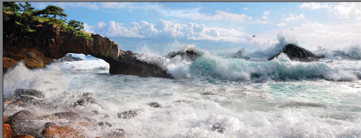
Waves of Sea Chilbo