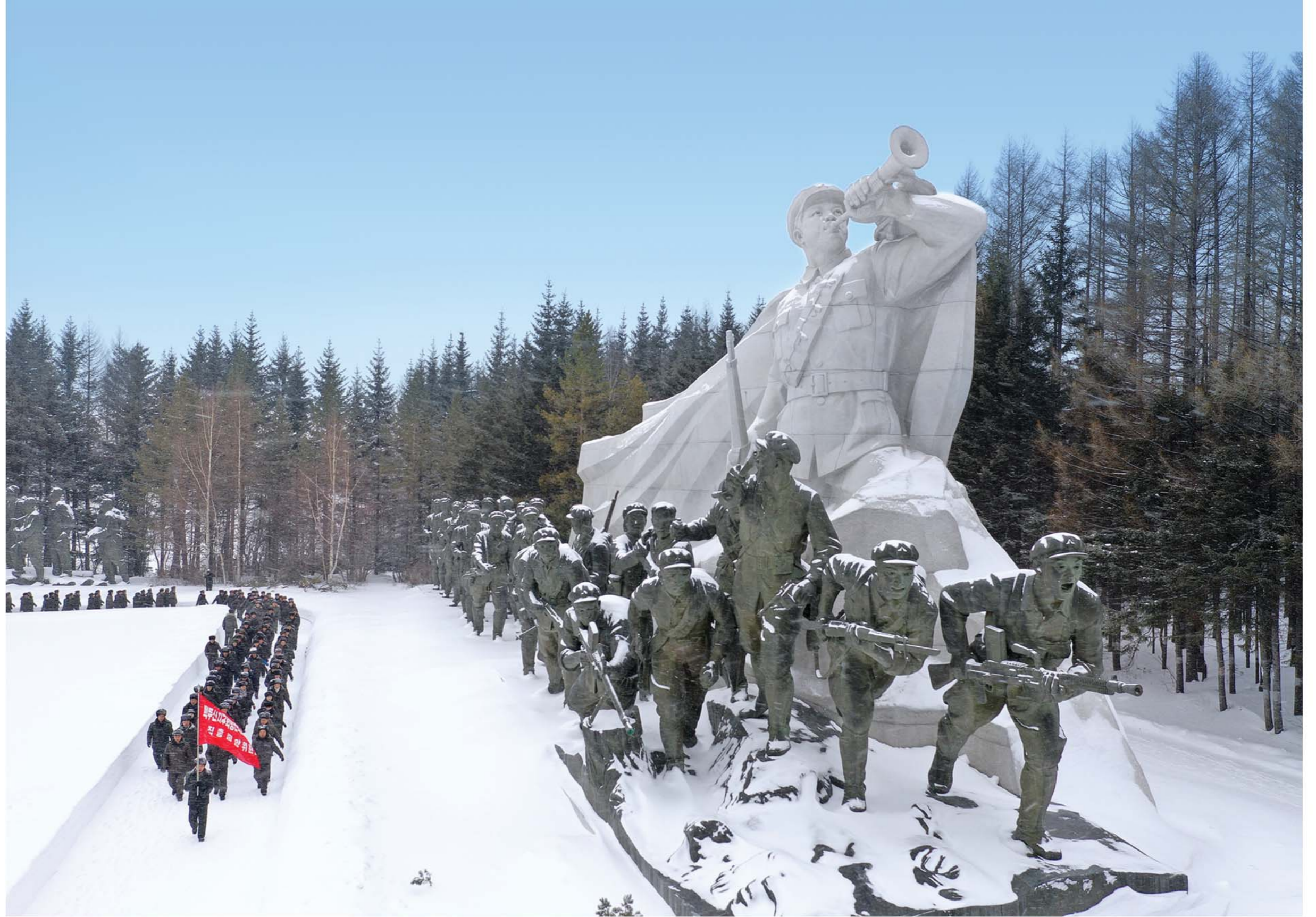
People cherish the revolutionary spirit of Paektu, the spirit of blizzards of Paektu, through their study tour of revolutionary battle sites in the area of Mt Paektu