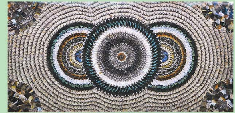
Butterfly-wing mosaic Sun from Andre Kolingba, president of the Military Committee of National Redressment and head of state of the Central African Republic, in February 1993