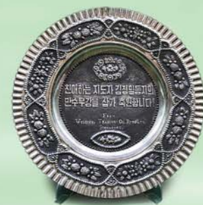
Silverwork Best Wishes for Long Life from the Welcome Trading Co. Pte. Ltd., Singapore, in April 1988