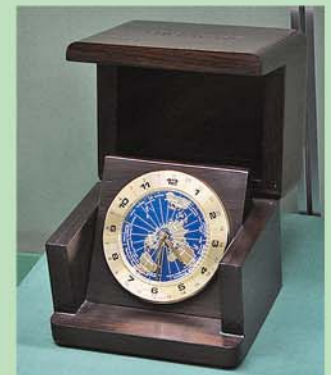
Table clock from President of the ABC of the USA in April 1995