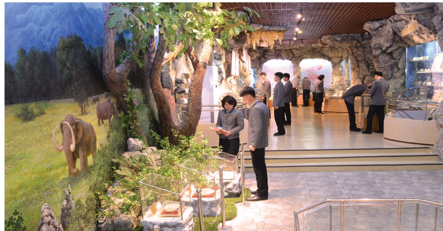
Hall of extinct plants and animals