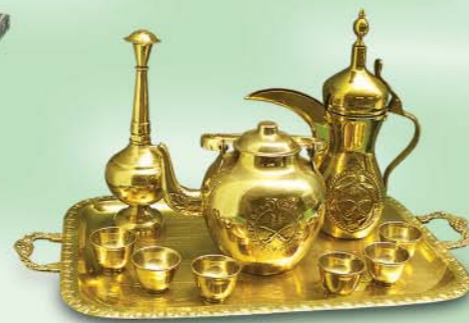
Gilded coffee service from the Managing Director of the Shahnoor Tanneries Mill, Lahore, Pakistan, in February 1982