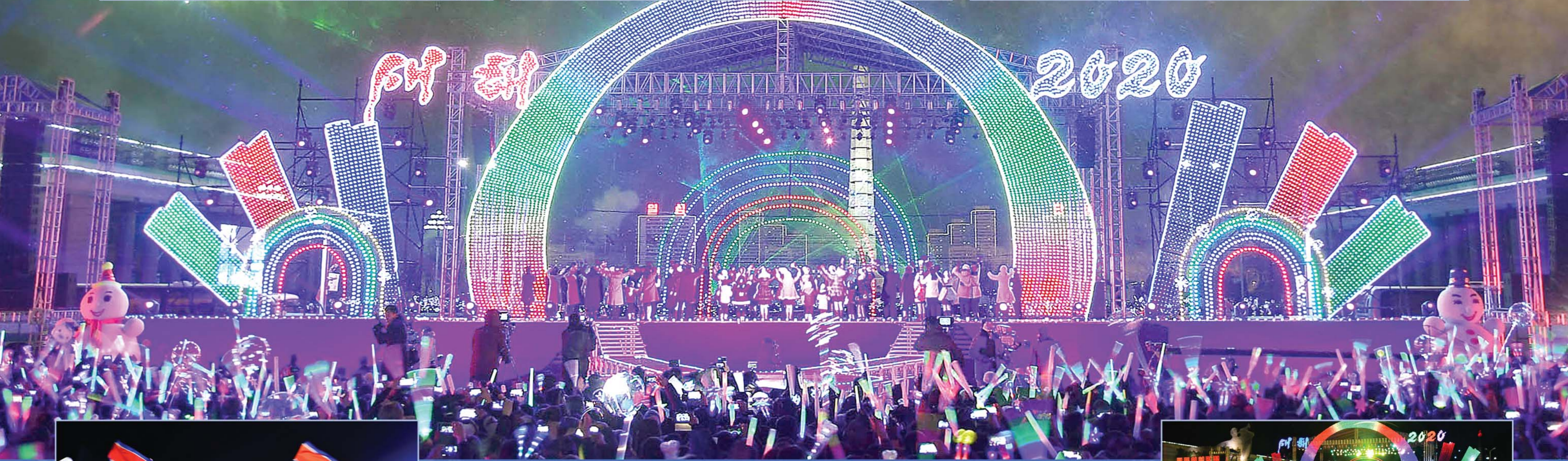
A gala performance took place at Kim Il Sung Square on December 31, 2019.