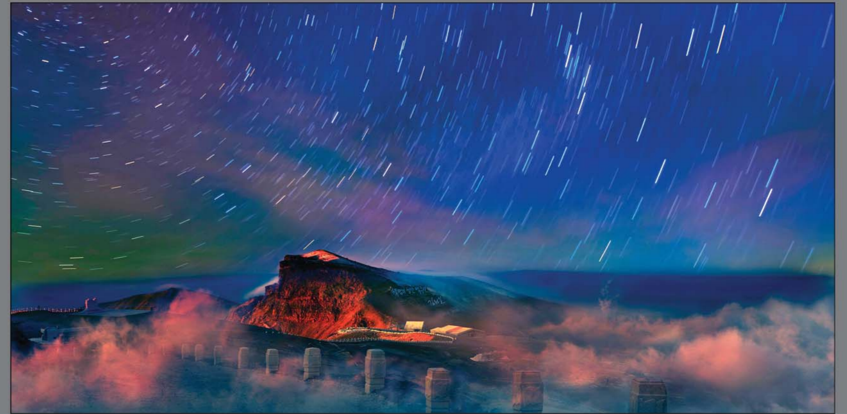
Star cluster over Hyangdo Peak