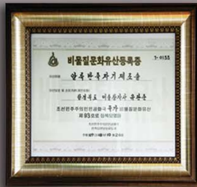
The manufacturing technique of marbled porcelain is inscribed as a national intangible cultural heritage element of the DPRK.

Marbled porcelain, along with Koryo celadon, black porcelain and cinnabar-coloured inlaid celadon, was a typical ceramic ware of the Koryo dynasty (918-1392), but it faded away with the lapse of time.