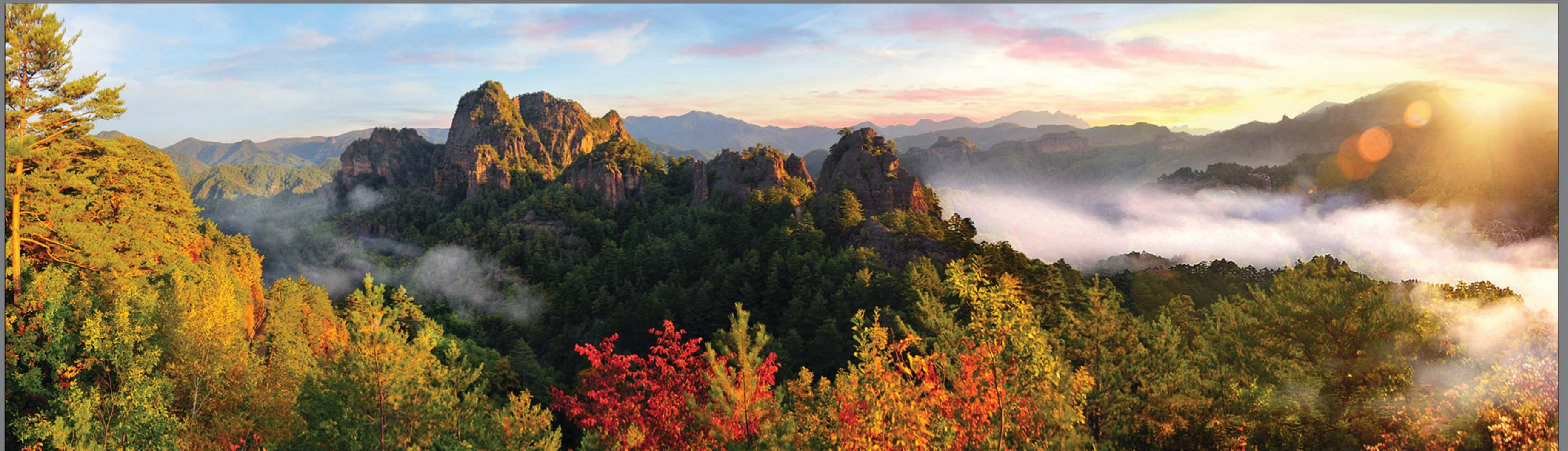
Mt Chilbo in autumn