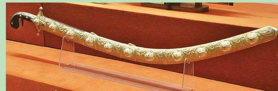
Sword from Bashar al-Assad, president of the Syrian Arab Republic, in December 2006