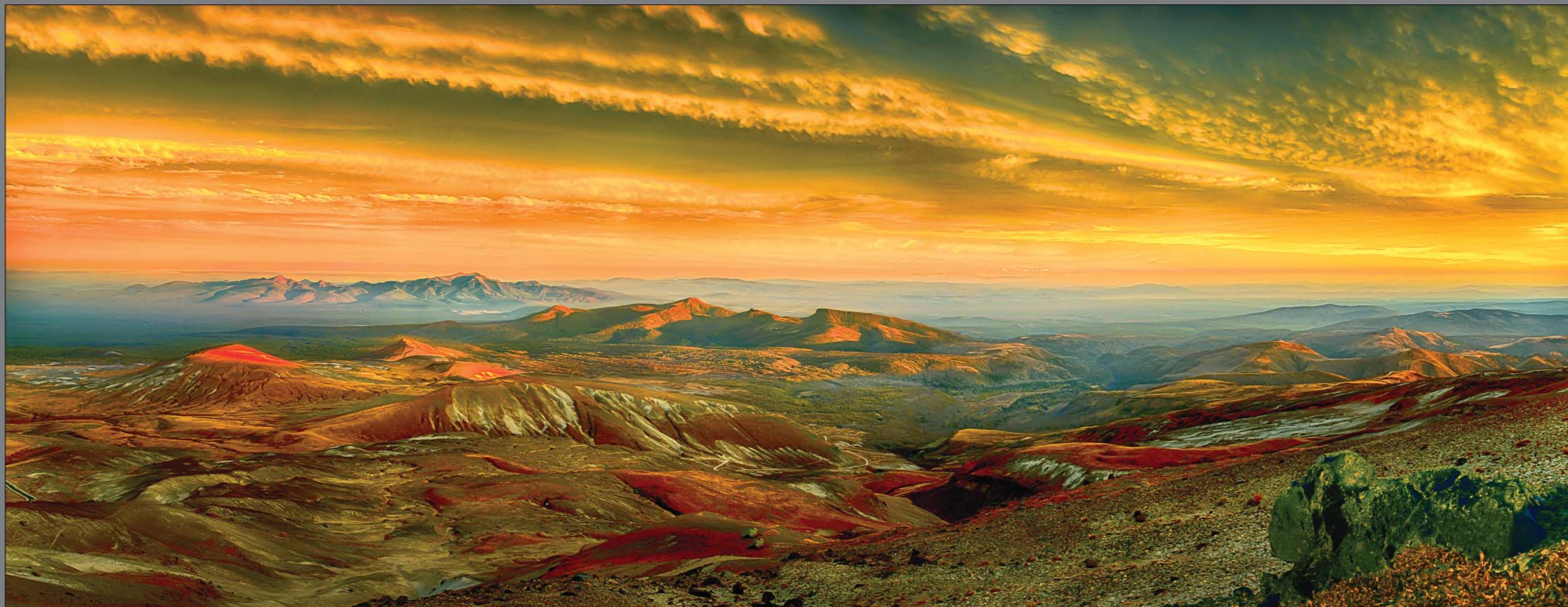
Mountain chains seen from the summit of Mt Paektu