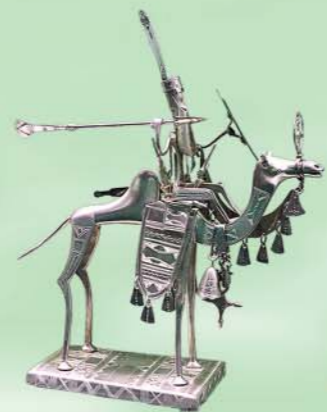
Silverwork Warrior on Camelback from Seyni Kountche, president of the Supreme Military Council and head of state of the Republic of Niger, in September 1986