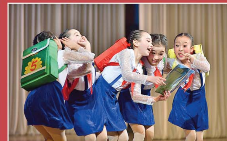
A performance Snow Falls on New Year's Day with the Blessings of Mt Paektu was given by schoolchildren at the Mangyongdae Schoolchildren's Palace.