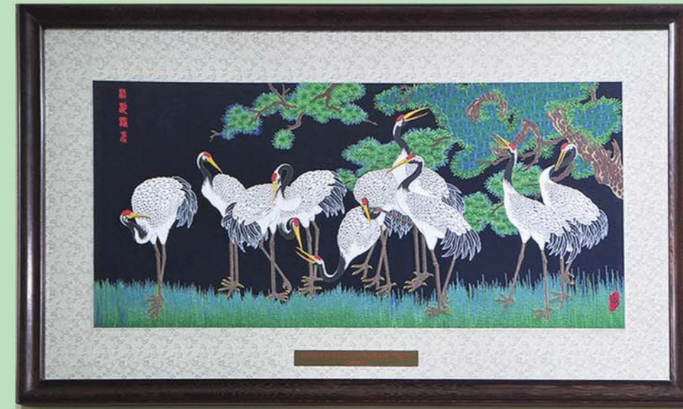
Textilework Cranes and a Pine Tree from Wen Jiabao, member of the Standing Committee of the Political Bureau of the CC of the CPC and premier of the State Council of the PRC, in October 2009