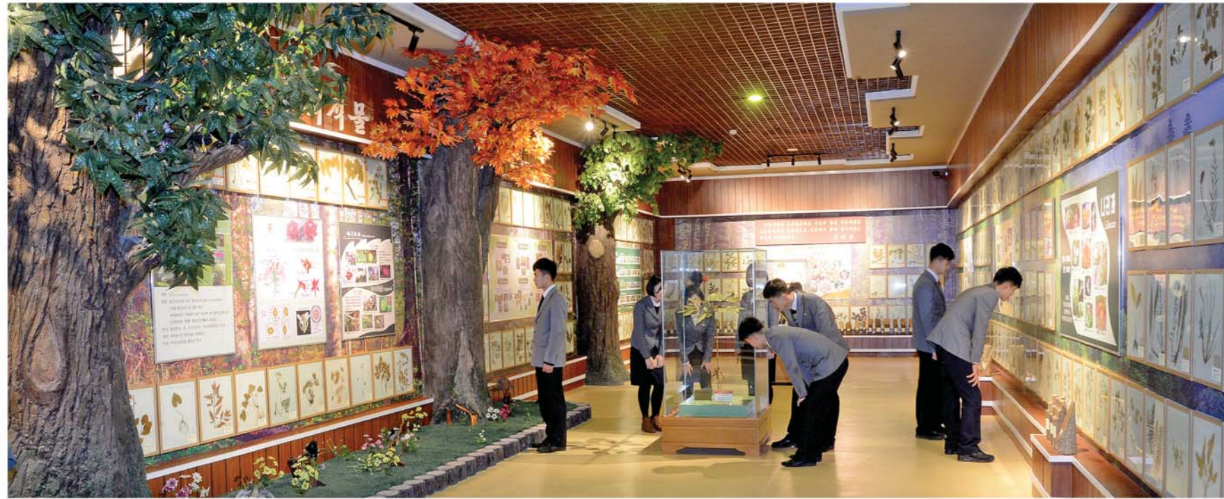
Hall of landscape plants