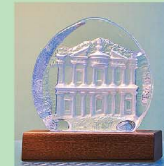
Crystalwork Monument of Petra from Hussein I, king of the Hashemite Kingdom of Jordan, in June 1994