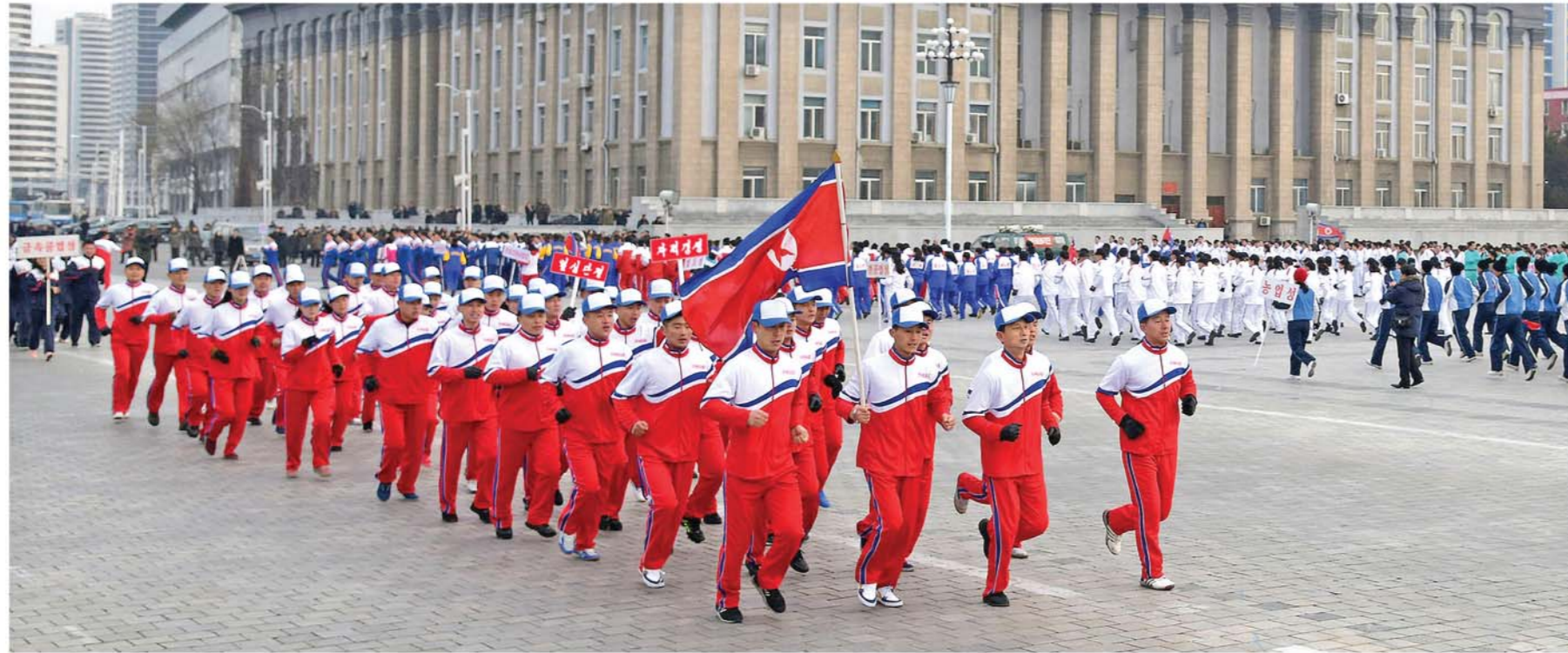
The first sports day of the year 2020 was observed on January 12 with diverse sporting events. Civil servants of commissions, ministries and national agencies did group running at Kim Il Sung Square. And a variety of sports games, including volleyball and basketball, were held in Pyongyang and provinces.