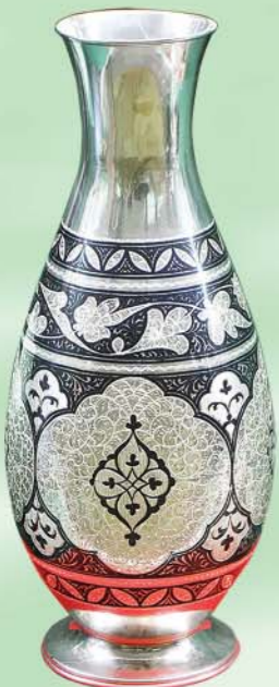
Silver vase from V. V. Putin, president of the Russian Federation, in February 2007