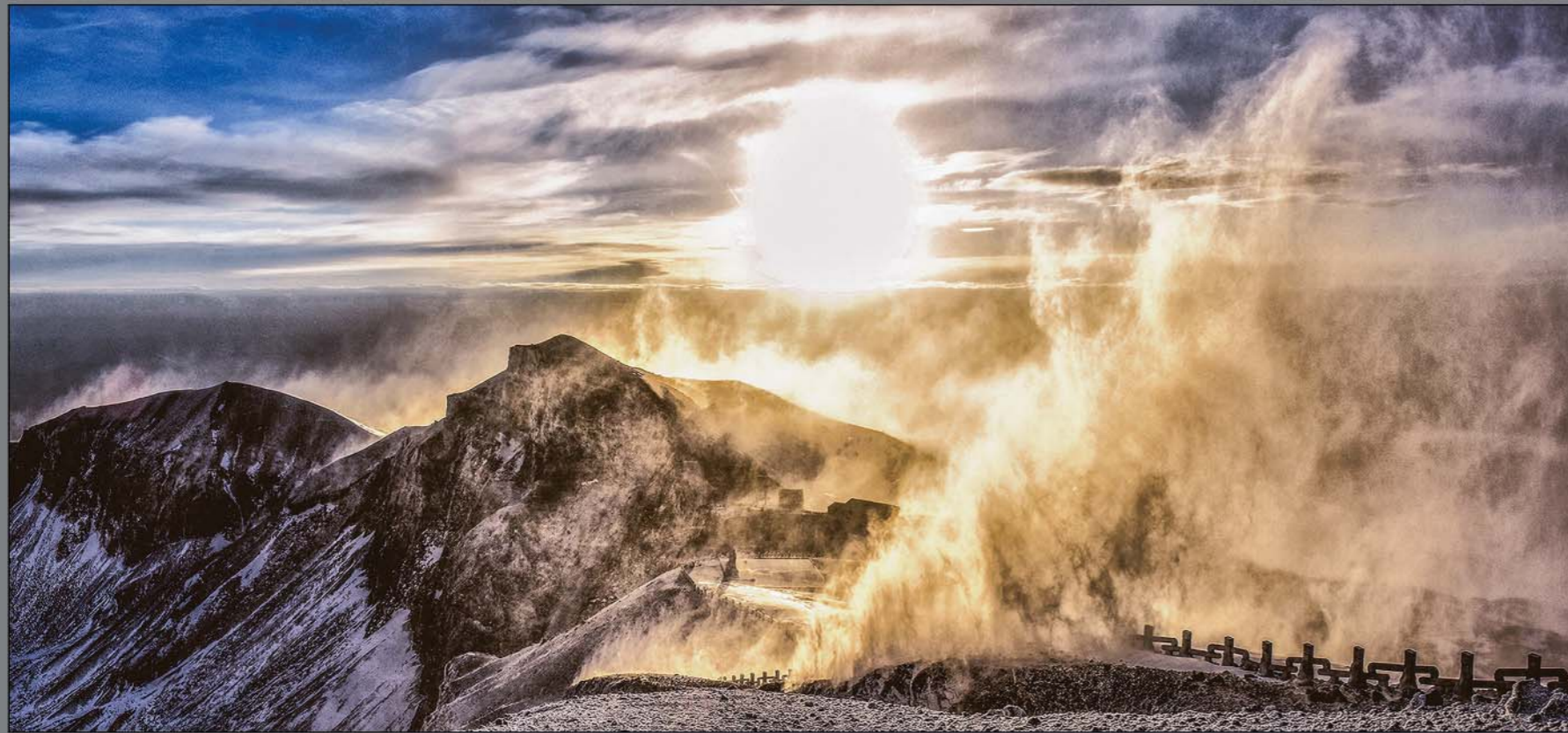
Blizzards of Mt Paektu