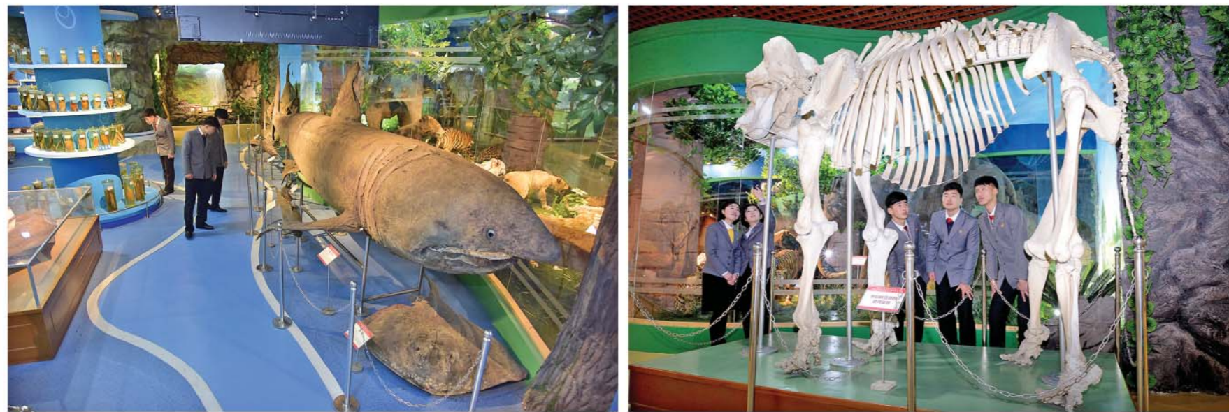
Halls of fishes and mammals