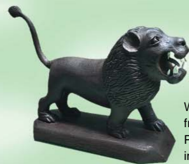
Wooden sculpture Lion from a delegation of the Mali People's Democratic Union in October 1980