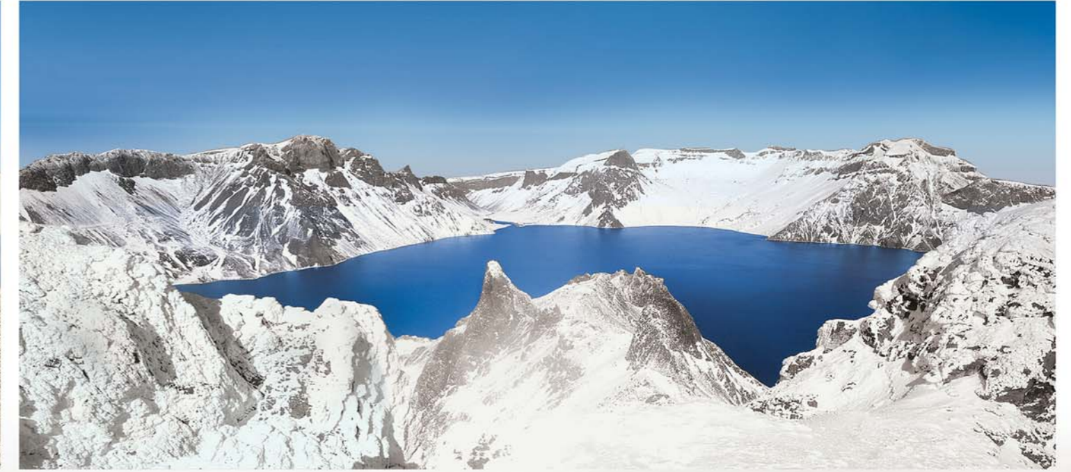
On the summit of Mt Paektu, the sacred mountain of the revolution