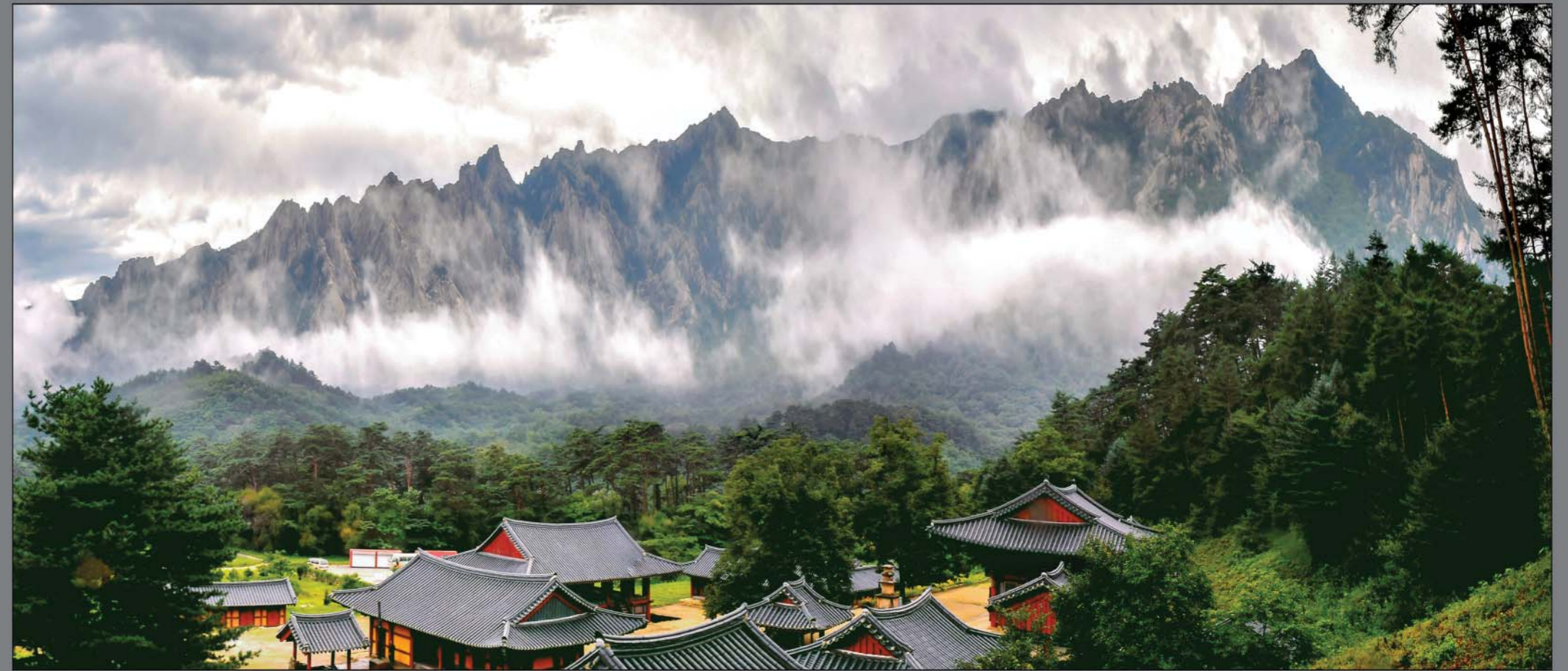
Mt Kumgang's Jipson Peak shrouded in clouds