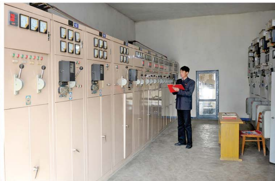
Electricity is generated by means of solar energy, and methane and rice-chaff gasification.