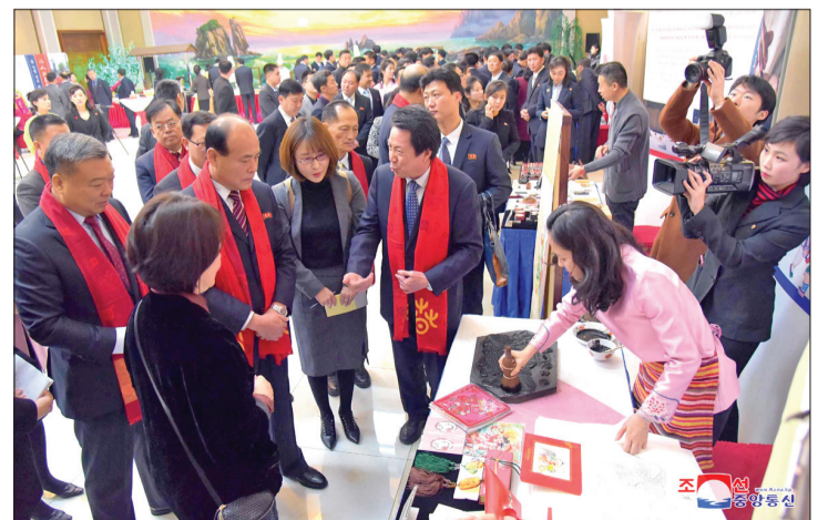
A friendship meeting takes place at the Taedonggang Diplomatic Club in Pyongyang on Tuesday to celebrate the 2020 Lunar New Year's Day.