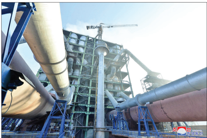
Rotary kilns are working at full capacity at the Sangwon Cement Complex in North Hwanghae Province.

The Hwanghae Iron and Steel Complex fulfilled its economic plan at 120 percent, while the February 8 Vinalon Complex overfulfilled Juche vinalon and carbide production assignments by 68 and 6 percent respectively.