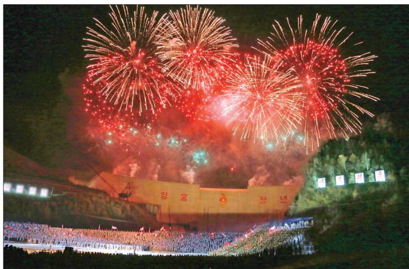
Young builders celebrate the completion of the Paektusan Hero Youth Power Station.