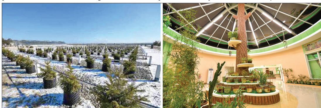
The outdoor cultivation ground (left) and sapling exhibition hall of the North Hamgyong provincial tree nursery.