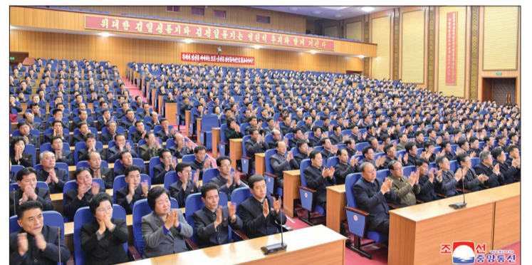
A meeting is held to vow to carry out the tasks set forth at the Fifth Plenary Meeting of the Seventh Central Committee of the Workers' Party of Korea.