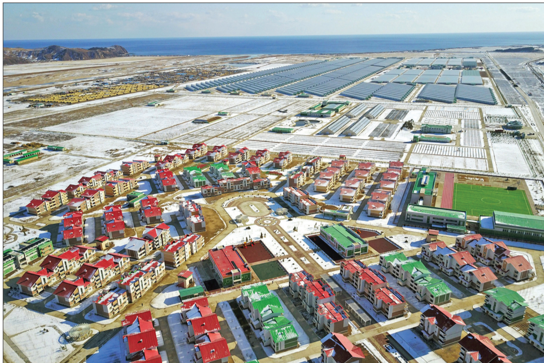
A vegetable greenhouse farm and village built in Jungphyong, North Hamgyong Province, as models of socialist rural community.

Nutrients are supplied to the roots of vegetables in substrates through a regular grid of tubes, and all the processes of management and cultivation are