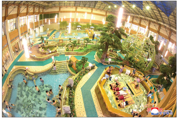
Vacationing at the Yangdok Hot Spring Resort that has started service is all the rage in the DPRK. The most sought-after is the two night and three day schedule.