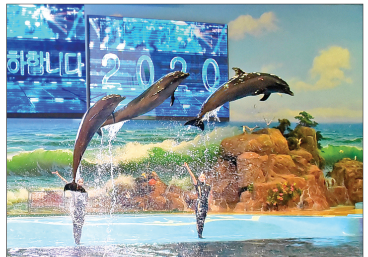
Dolphins perform a synchronous jump to amuse spectators at the Rungna Dolphinarium.

The dried flower craftworks were one of the most sought-after goods among the New