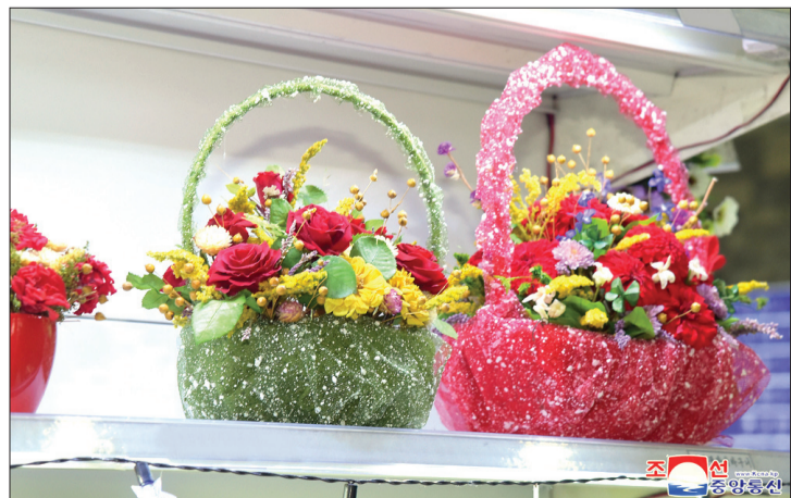
Dried flower baskets are on sale at the flower stall of Pyongyang Department Store No. 1.