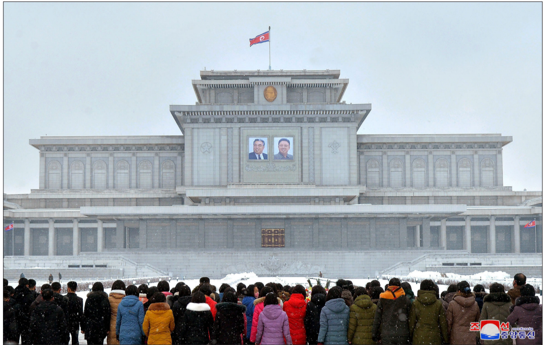
People from all walks of life visit the plaza of the Kumsusan Palace of the Sun to mark the Day of the Shining Star (February 16).

Songs in praise of the Chairman were put on stage at the ministries and national agencies including the Ministry of Agriculture, the Ministry of Physical Culture and Sports and the Ministry of Land and Maritime Transport, and at scientific and educational institutions including the State Academy of Sciences, Kim Chaek University of Technology and Kim Chol Ju University of