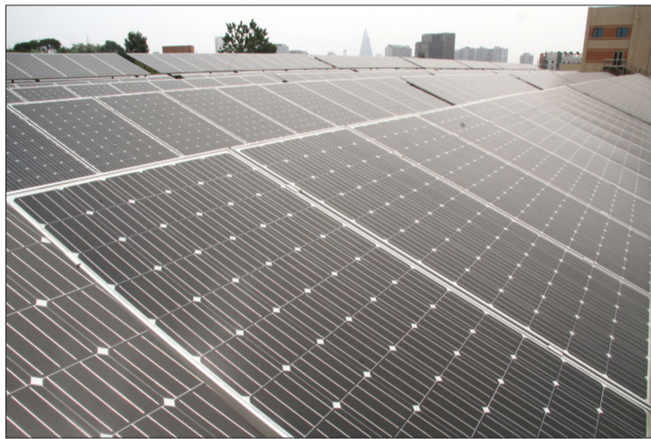
Rooftop solar panels at the Ryuwon Footwear Factory in Pyongyang.