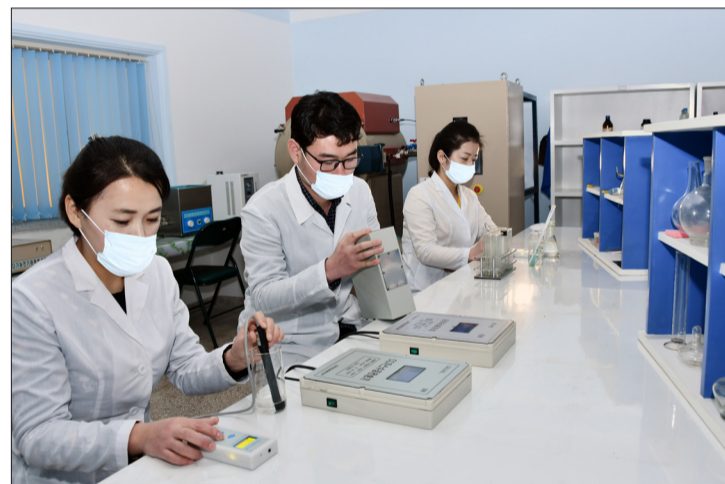
Researchers check the precision of newly developed measuring instruments.