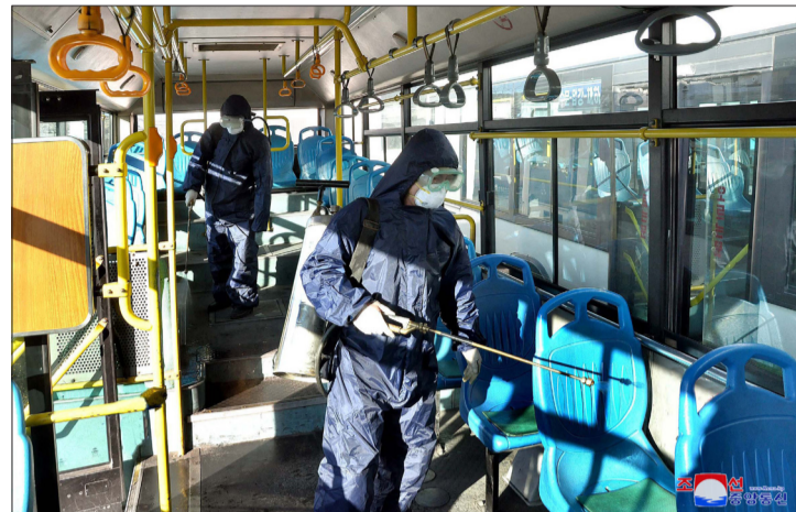
Personnel from the prevention centre spray the seats of a passenger bus with disinfectant.

The campaign to prevent COVID-19 is being stepped up all across the DPRK.