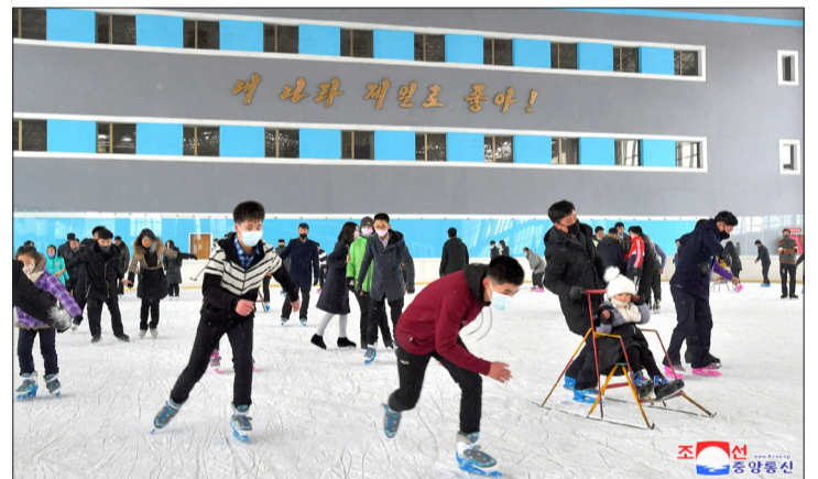
The People's Open-air Ice Rink in Pyongyang bustles with skaters.