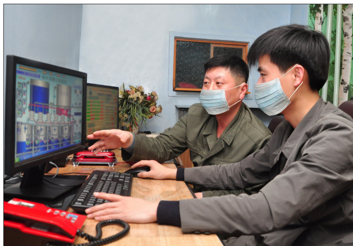
Engineers monitor the real-time equipment automatic control system at the Changgwang Health Complex in Pyongyang.