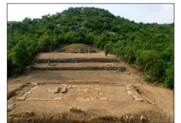
The site of Mausoleum of Hyejong, the second king of Koryo

Researchers corroborated that it was the tomb of King Hyejong also by dint of data.