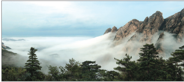
Jipson Peak shrouded in clouds.

All surrounding mountains glittered in the colour of diamond and a waterfall rent heaven and earth as if it fell to the ground from the sky, and a bright rainbow formed due to fine sprays of cascading waterfall. Full-blown azalea, royal azalea and lily blossoms