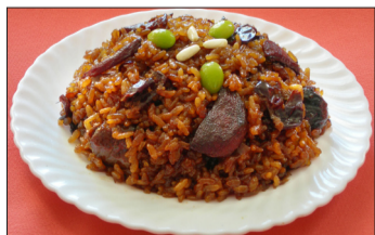
Yakpap (sweet rice dish), a national food.