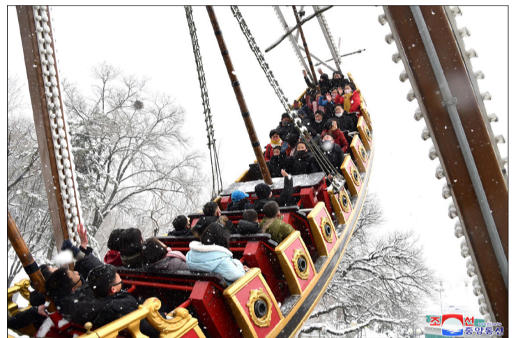
People have a good time on holiday enjoying Pirate at the Kaeson Youth Amusement Park in Pyongyang.