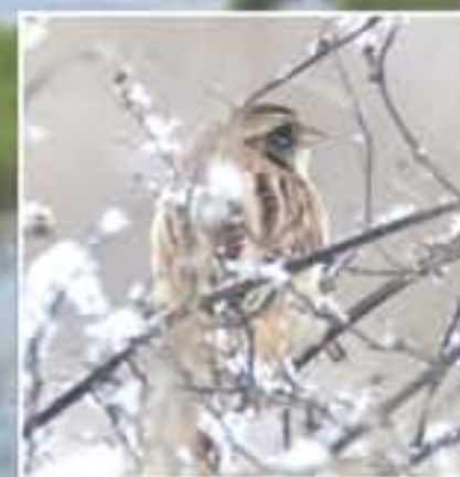
Common reed Bunting(NT)