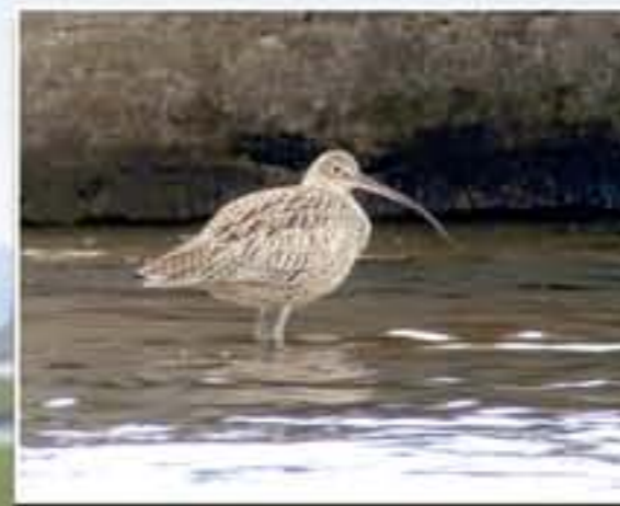
Far Eastern Curlew(EU)