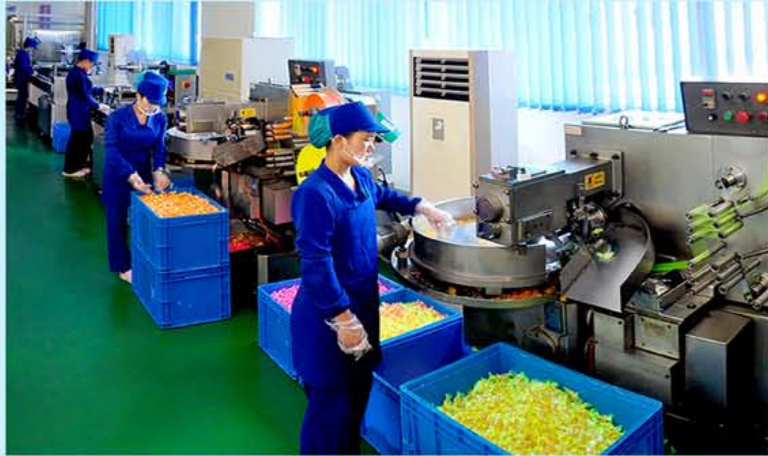
Songdown General Foodstuff Factory relies on locally available materials in production