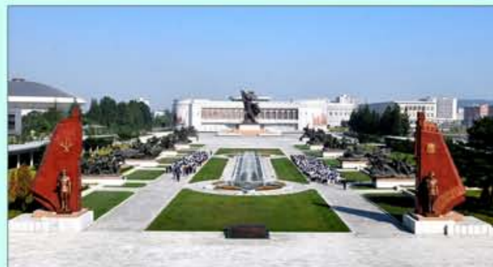
Victorious Fatherland Liberation War Museum