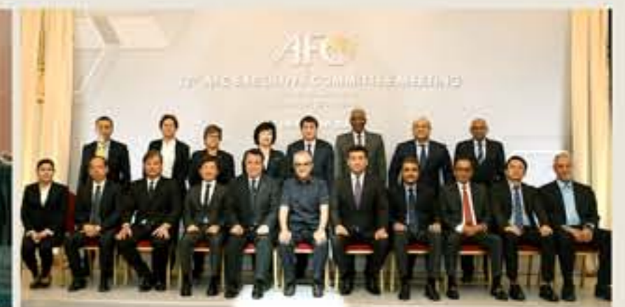
At the Executive Committee Meeting of the AFC held in Uzbekistan in September 2018