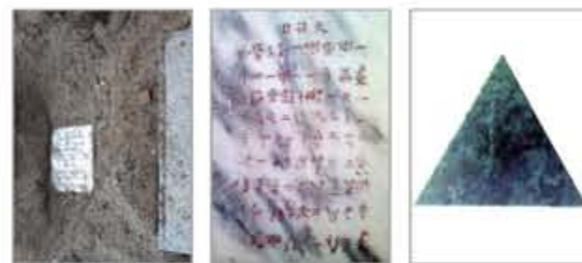
Stone slab inscribed with "Chonbugyong" and a triangular jade slab symbolic of Tangun in the religion

Recently a slab of marble and a regular triangular slab of gemstone inscribed with letters were unearthed on top of Janggun Peak in Mt Paektu.