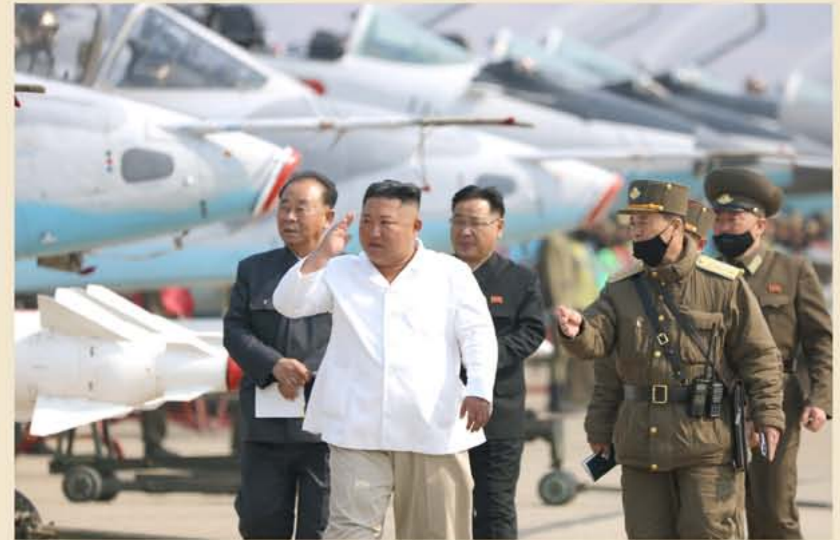
Kim Jong Un inspecting a pursuit assault plane regiment under the Air and Anti-Aircraft Division in the western area in April 2020