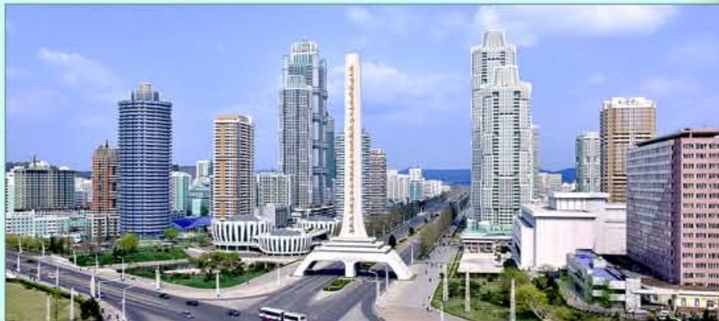
Ryomyong Street built in 2017