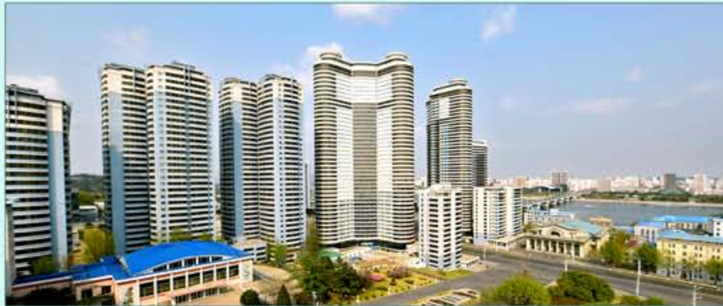
Changjon Street built in 2012