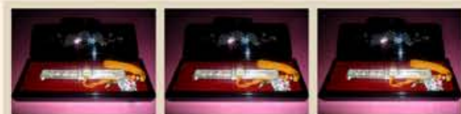
Ornamental silver daggers for the triplets (June 2013)