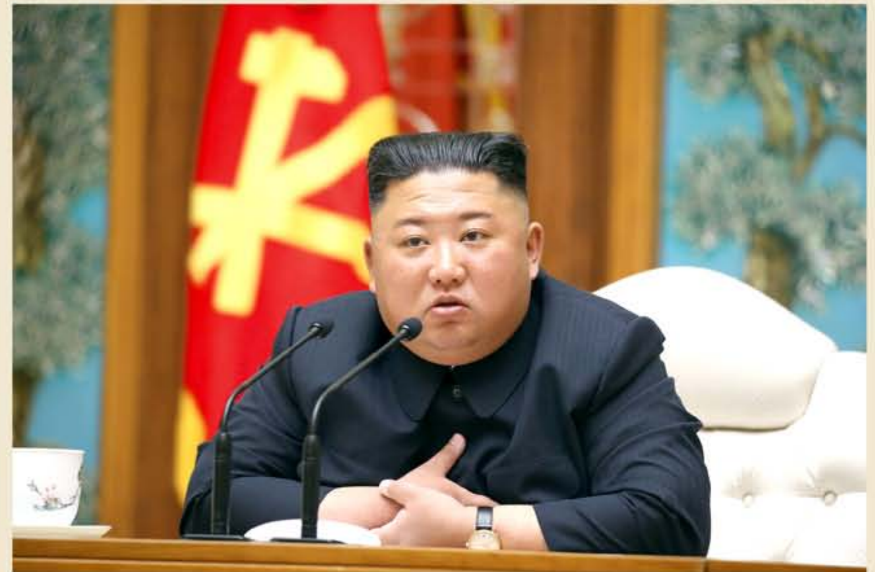
Kim Jong Un attending the meeting in April 2020

Chairman Kim Jong Un said that Party organizations at all levels, cadres and Party members should launch a revolutionary campaign to thoroughly carry out the policies of the Party Central Committee with greater consciousness and strenuous efforts as the meeting of the Political Bureau adopted the joint resolution and put forward new and important policies and tasks.