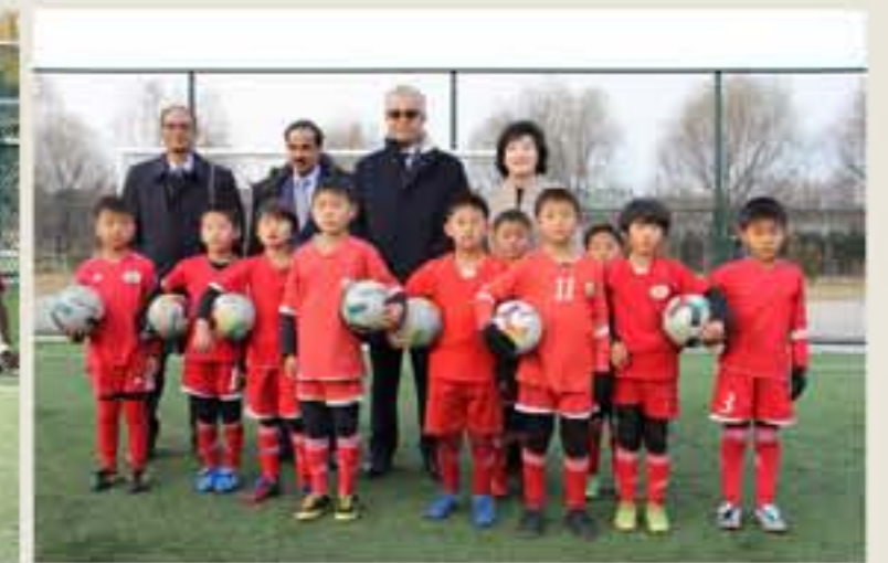
At the Pyongyang International Football School together with the AFC members