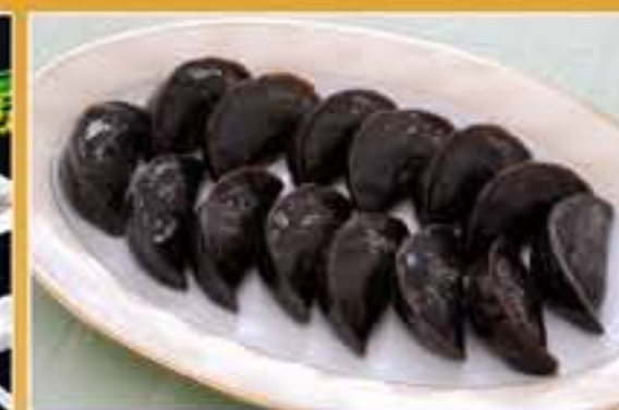
Frozen potato cake