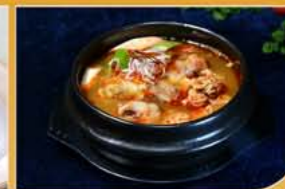
Spicy Pollack soup

The area of Hamgyong Province in Korea covers the present-day North and South Hamgyong and Ryanggang provinces, and some parts of Kangwon Province.