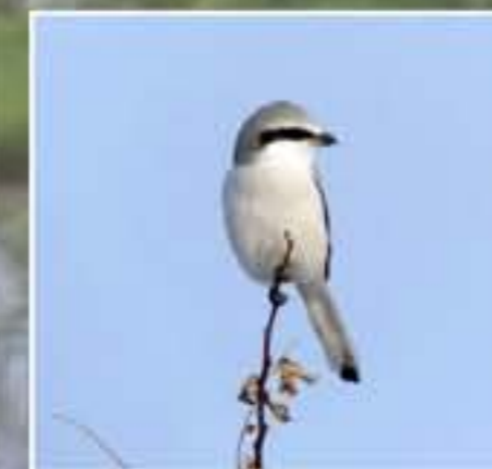
Chinese Grey Shrike