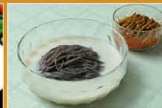
Frozen potato noodles and yongchae kimchi