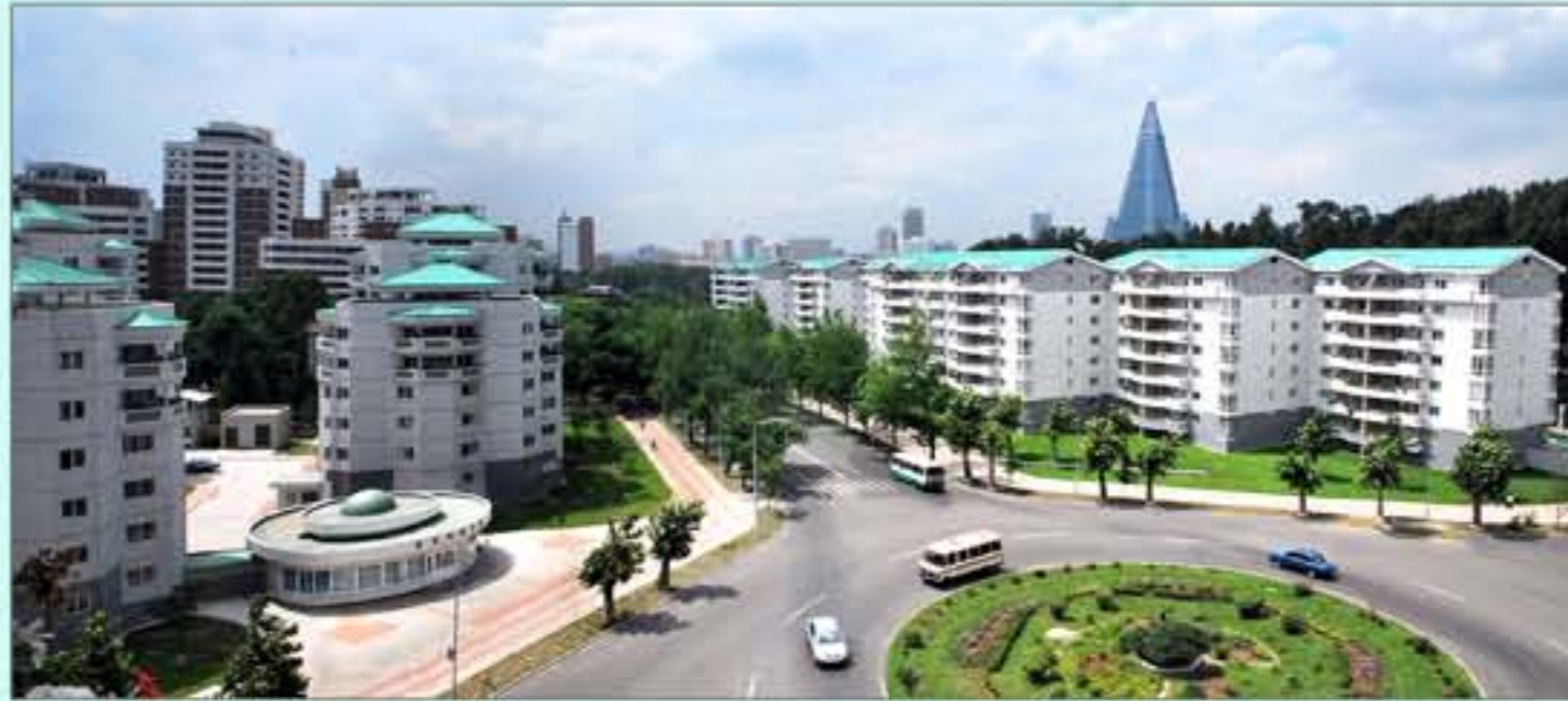
Mansudae Street erected in 2009