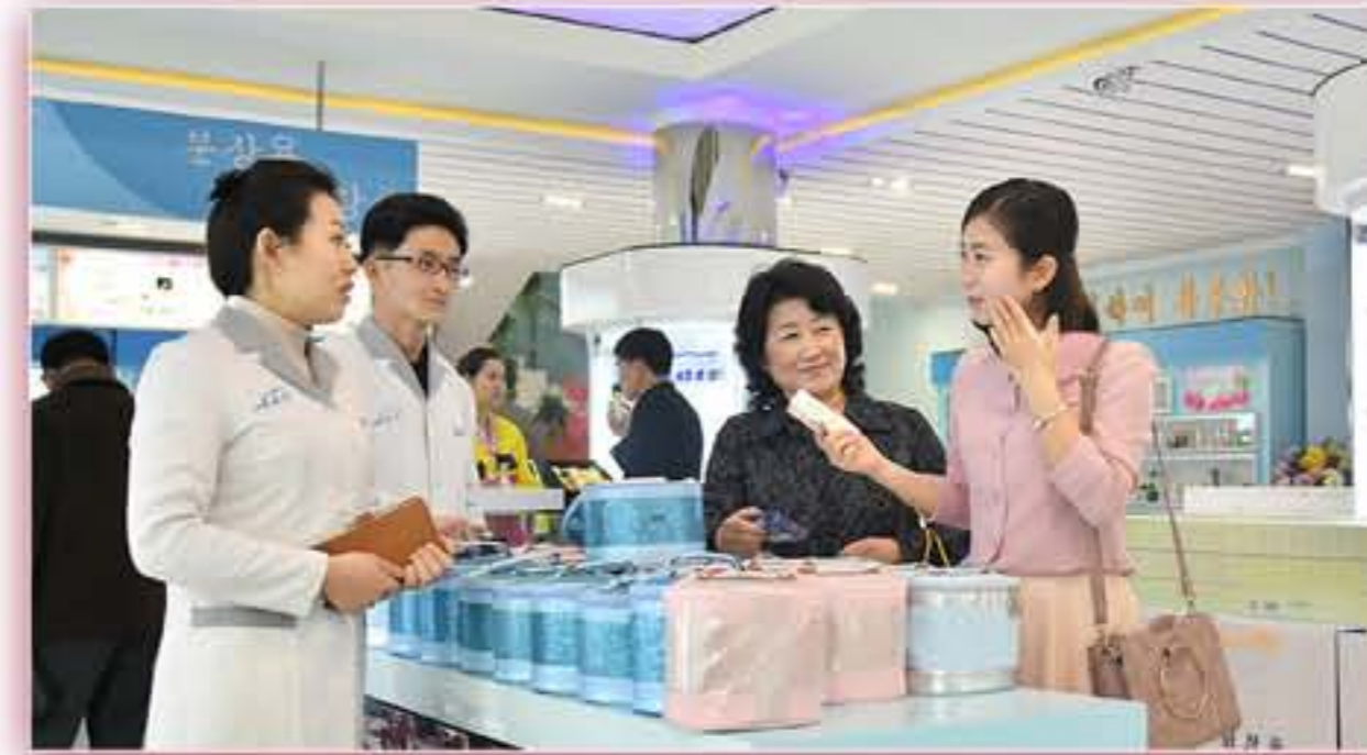
Unhasu cosmetics enjoy popularity among people

Unhasu cosmetics of the Pyongyang Cosmetics Factory are enjoying popularity among users.