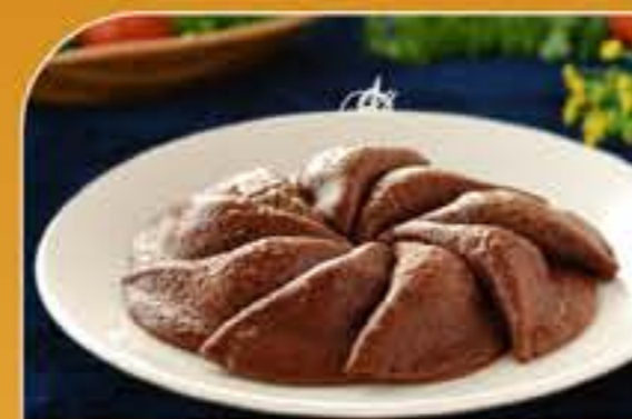
Glutinous Indian millet pancake