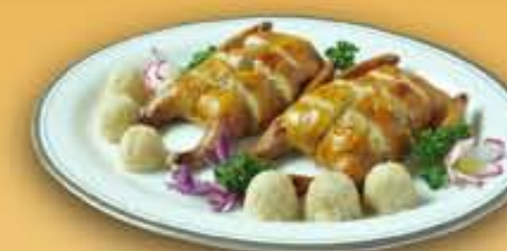
Steamed broiler chicken

Typical dishes are potato starch noodles, pancake made of glutinous Indian millet, tangogi soup, hot Pollack soup, yongchae kimchi and fermented spicy flatfish.