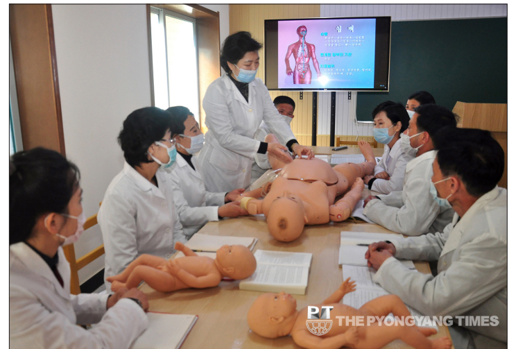
Lectures are given for medical workers at Pyongyang doctors' in-service training college.