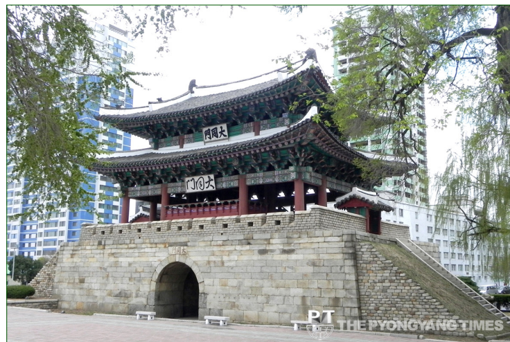
Spring-tinged Taedong Gate and Ryongwang Pavilion (right) in Pyongyang.

Hanging on the pavilion is a calligraphic board with a poem reading "The river flows in a rush along the foot of long walls and mountains are seen here and there to the east of the vast plain". The poem was written