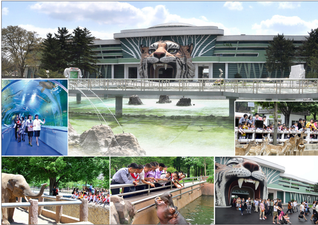
More than 3.5 million people have visited the Central Zoo since its reconstruction four years ago.

It will take over a day to look round all the places in the Central Zoo.