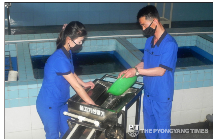
Employees sort out fries to move them into outside ponds on the Unha Fish Farm.