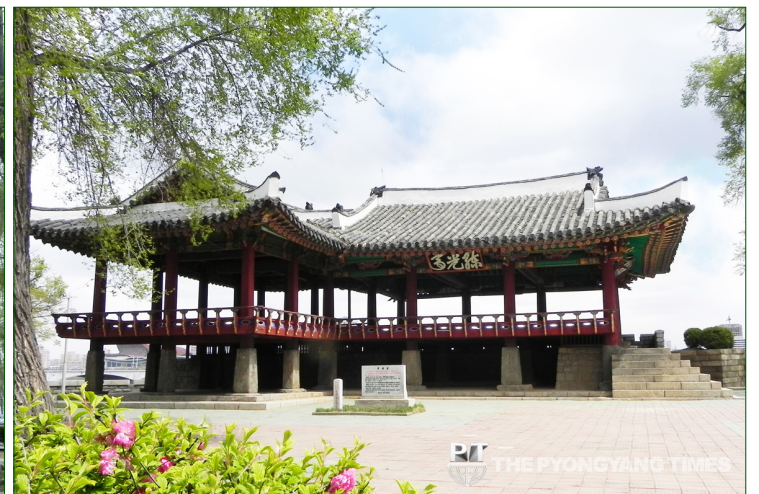
SONG JONG HO