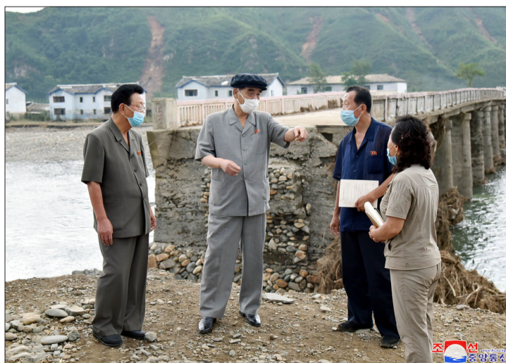
Senior official Pak Pong Ju (second from left), inspects Kimhwa county town, Kangwon Province, to learn about flood relief effort.

Acquainting himself with the rehabilitation project in Sohung and Pongsan counties, he urged the designing organs to design the structures in a responsible way. He also discussed and took practical measures to rehabilitate the drainage pumping stations immediately, improve all the waterways as planned and put the cultivation of crops on a scientific and technical basis.