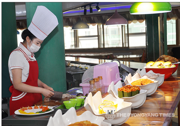
A cook prepares a dish at the cooking festival hall on Ryomyong Street, Pyongyang.