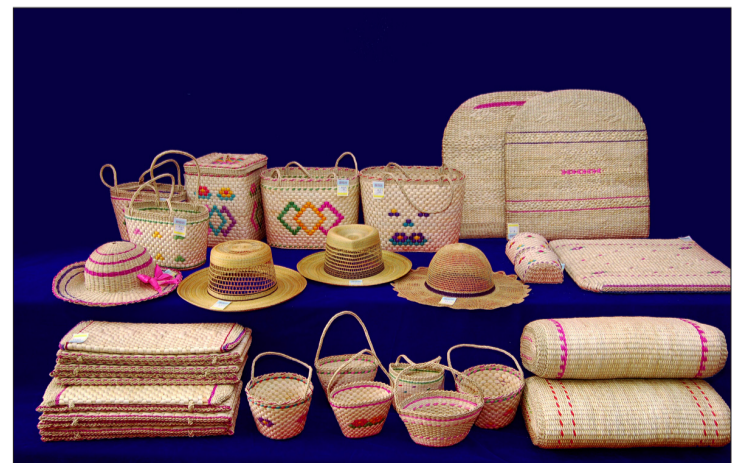
Various kinds of grasswork products.