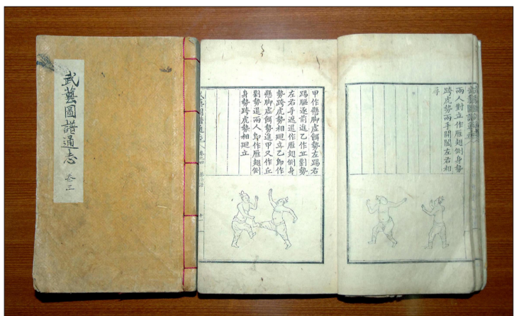
Korean martial art classic, Muyedobothongji .