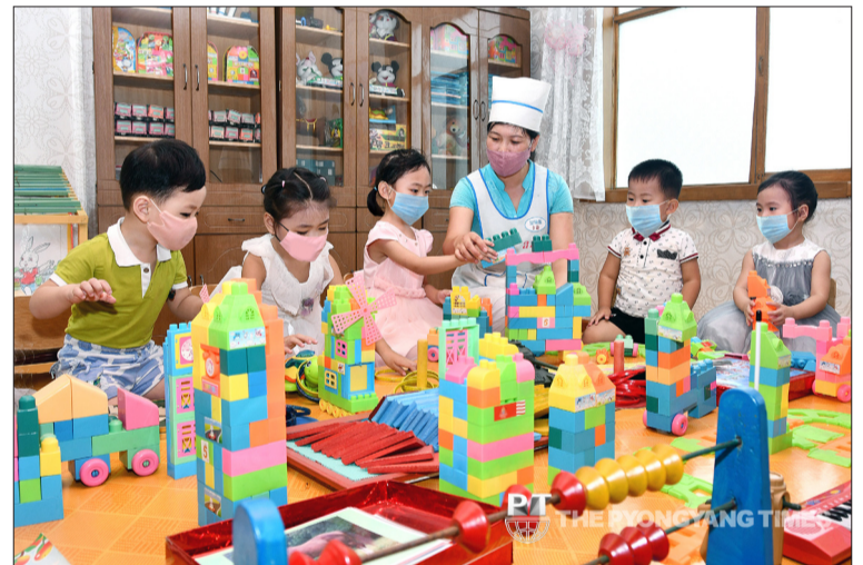
Children play with construction toys at Namsin Nursery in Songyo District, Pyongyang.