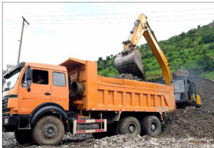
An excavator loads a truck in the reconstruction project for flood-stricken Taechong-ri, Unpha County, North Hwanghae Province.