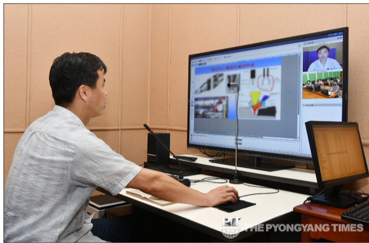
A lecturer gives online lecture at the Grand People's Study House in Pyongyang.