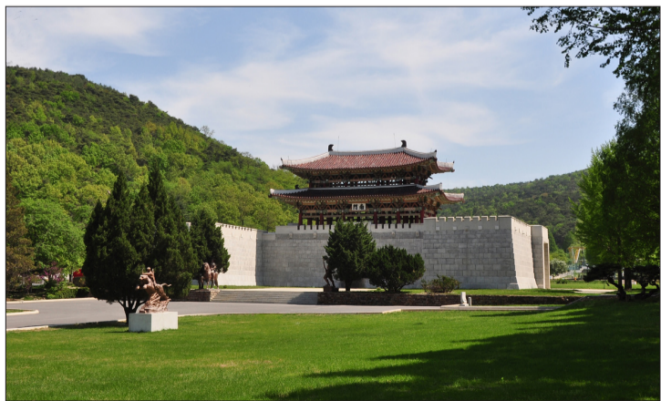
The Nam Gate in Mt Taesong.