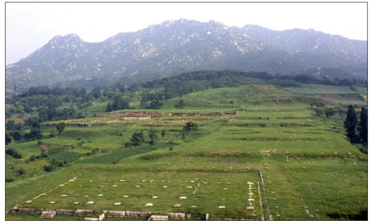
The palace site of Manwoltae on the world cultural heritage list.