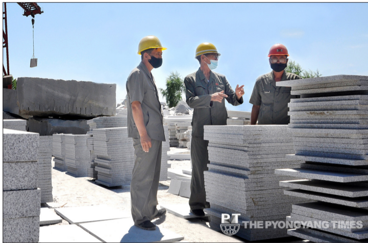
Officials discuss ways to improve the quality of products at the Taedonggang Stone Processing Company.