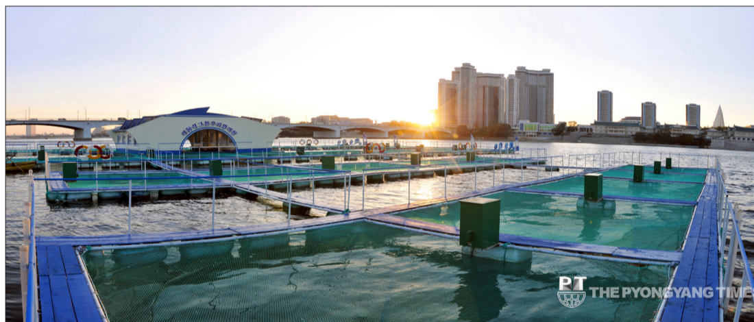
A mobile cage-net fish farm built on the Taedong River in Pyongyang.