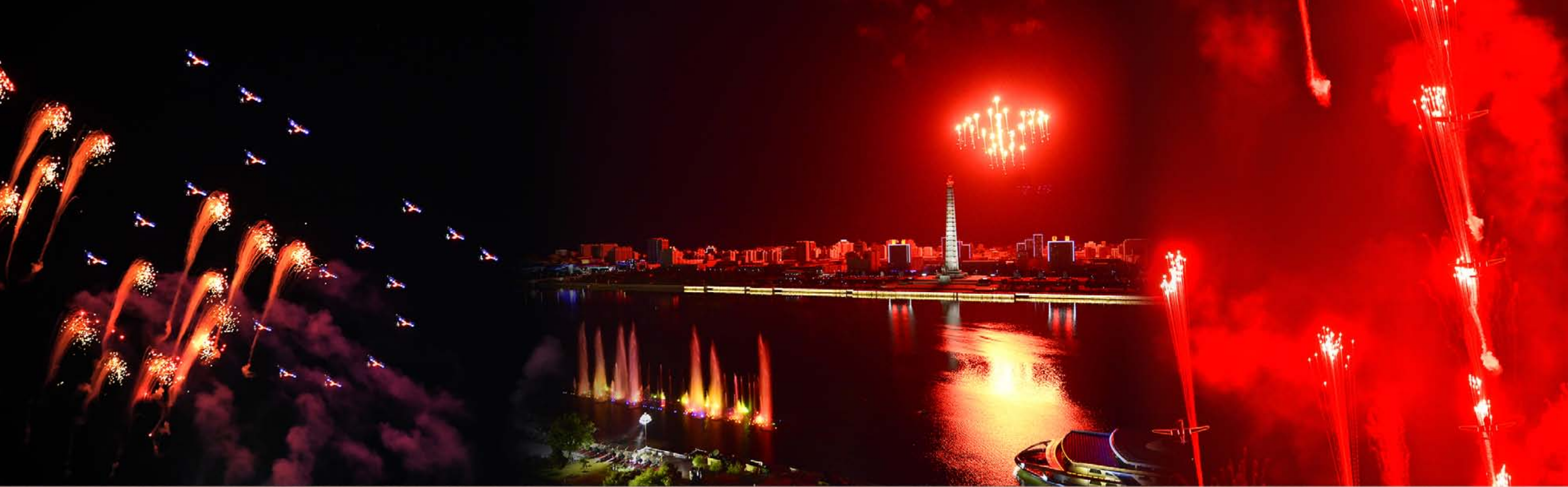
There was a flight in the sky above Kim Il Sung Square, demonstrating the invincible might of the Juche-oriented air force