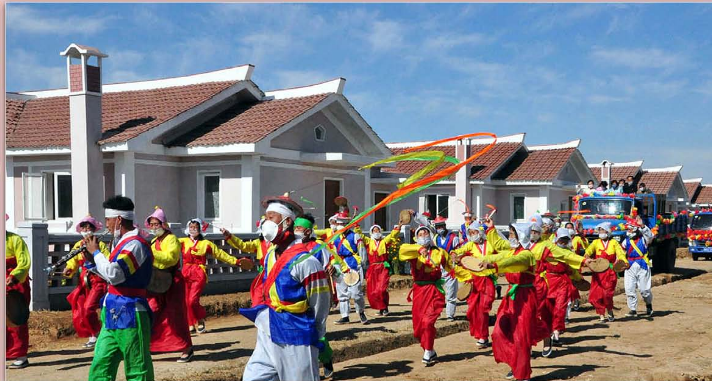
Flood victims moved to new houses on the eve of the October holiday