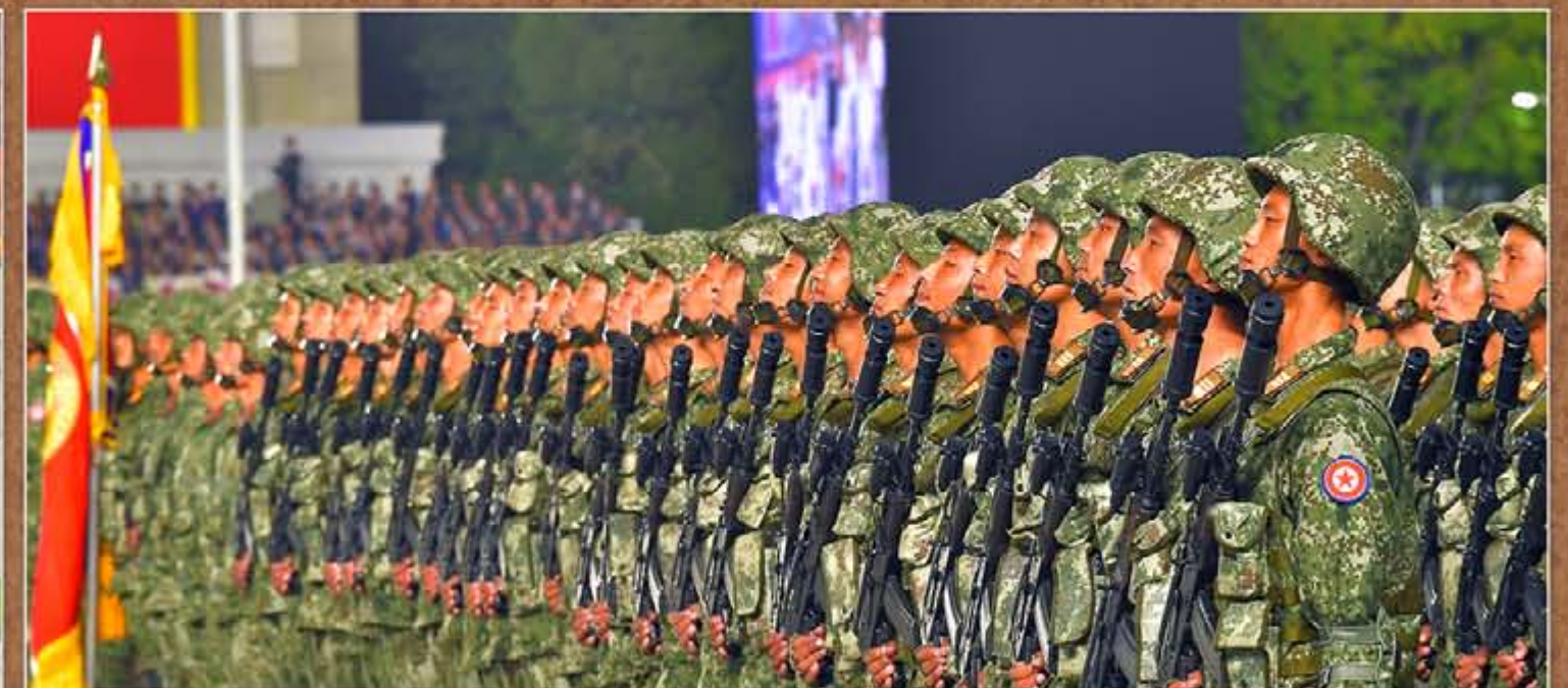
KPA Marshal Pak Jong Chon, chief of the KPA General Staff, ordered the columns of the armed forces of the DPRK to start the military parade