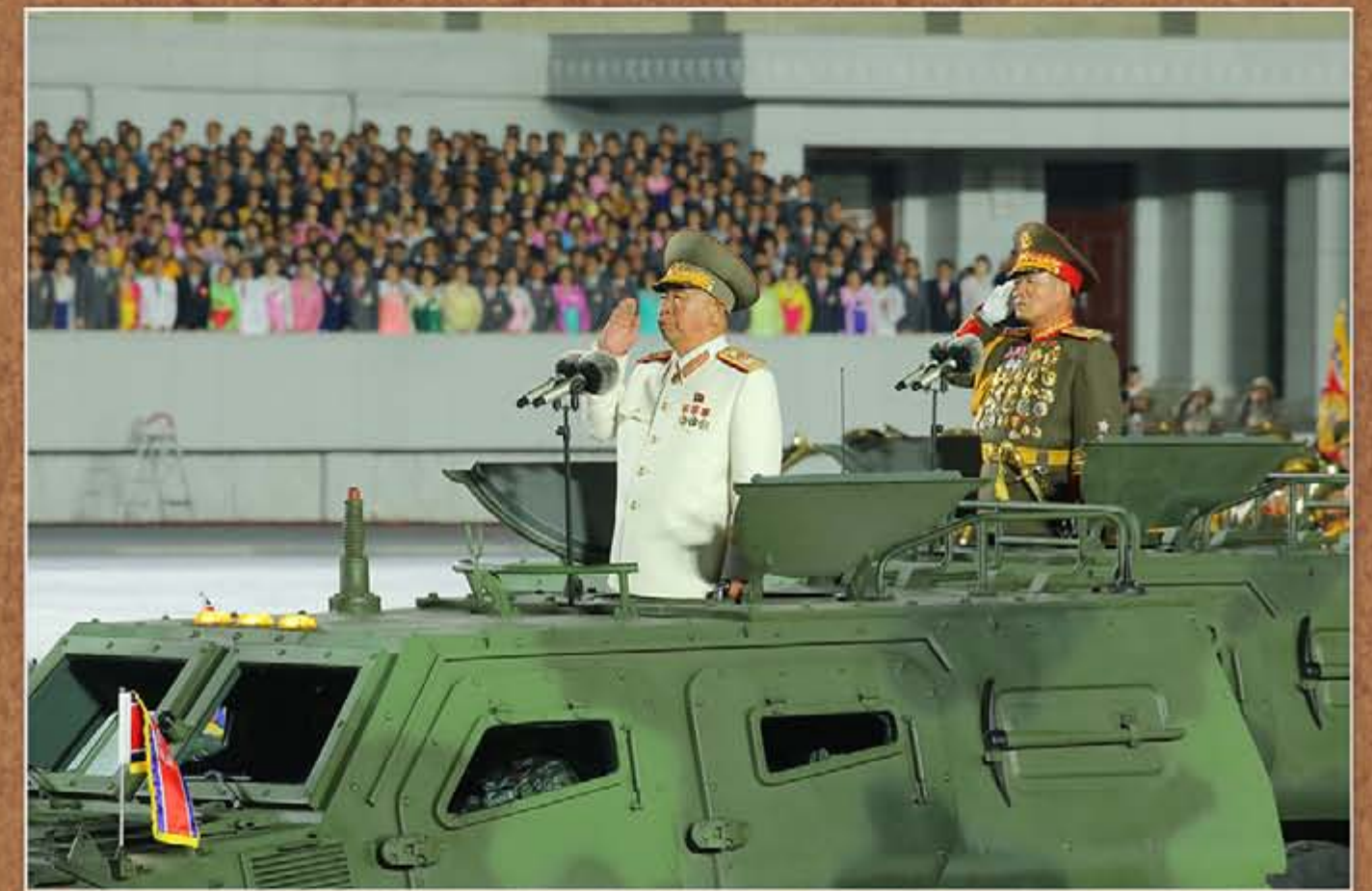
KPA Marshal Ri Pyong Chol, vice-chairman of the Central Military Commission of the WPK, reported to the Chairman of the WPK that the military parade was ready to start

On the order of Marshal Pak Jong Chon, chief of the