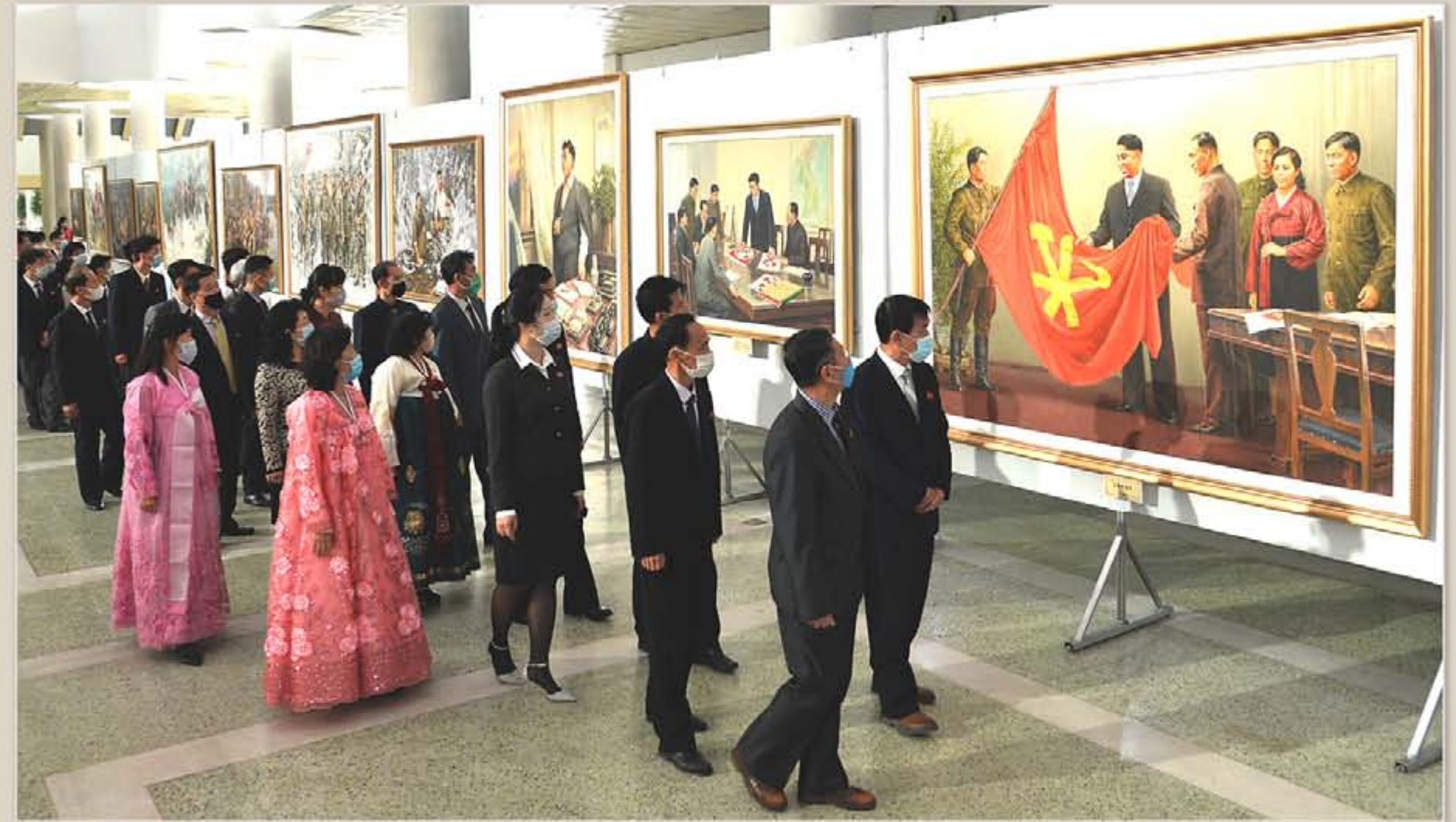
National art exhibition

All the Korean people celebrated the 75th birthday of the Workers' Party of Korea significantly.