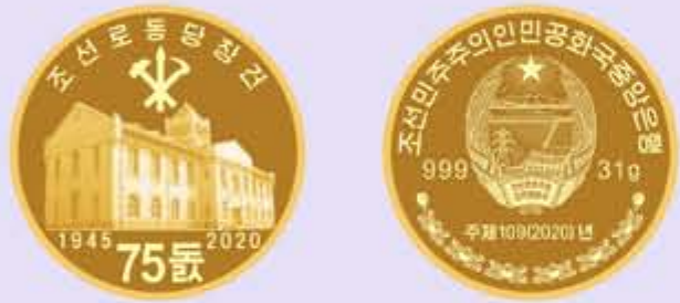
Commemorative coin "75th Founding Anniversary of the Workers' Party of Korea" (gold coin)