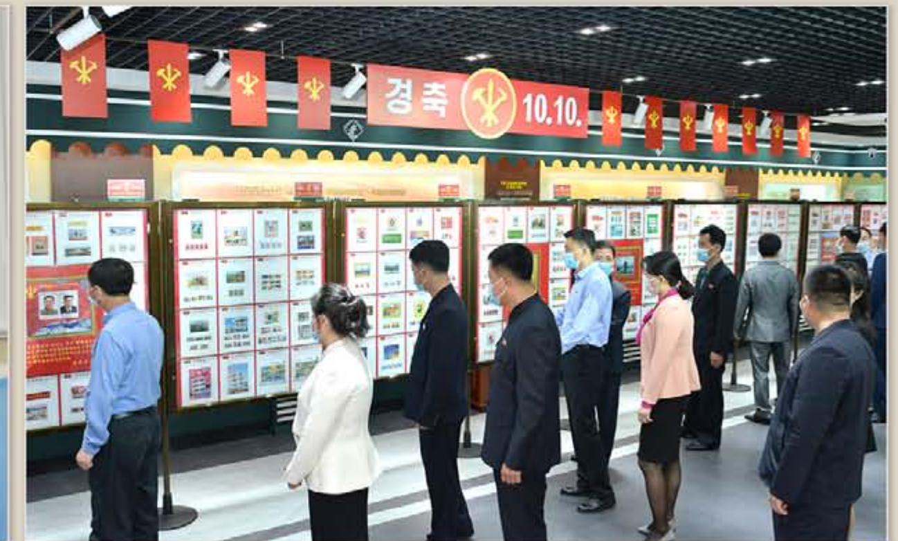
National exhibitions of books, industrial art designs and Korean stamps