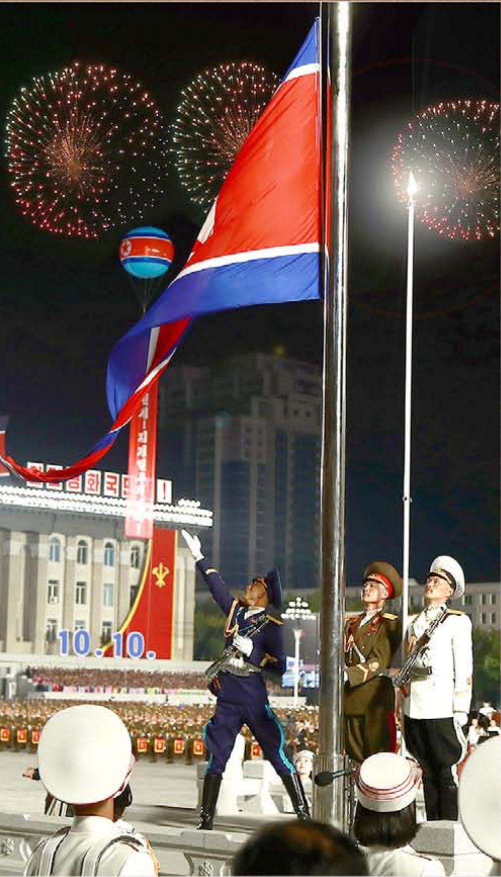
The national flag was hoisted amid the playing of The Patriotic Song