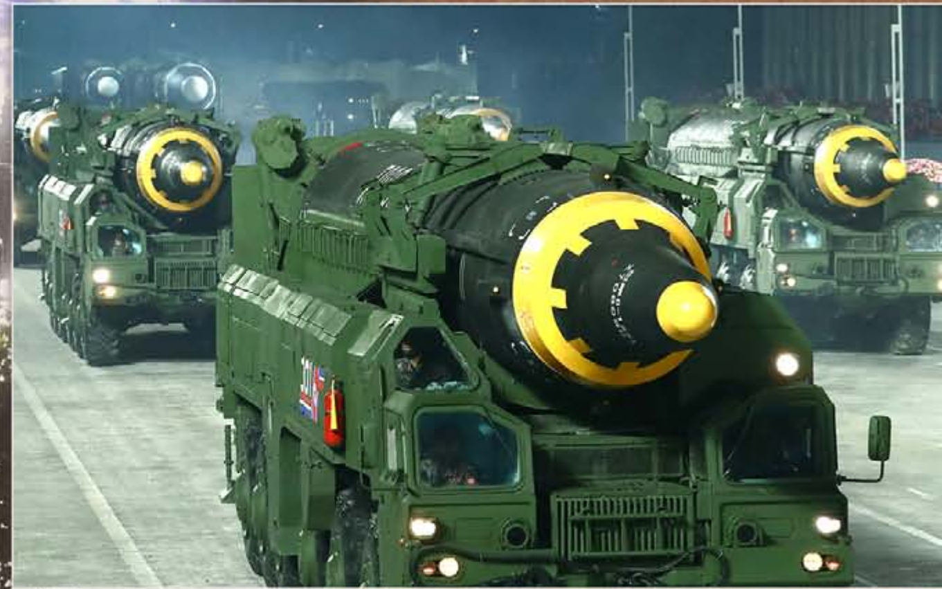
Columns of ICBMs demonstrate the dignity and strength of the DPRK