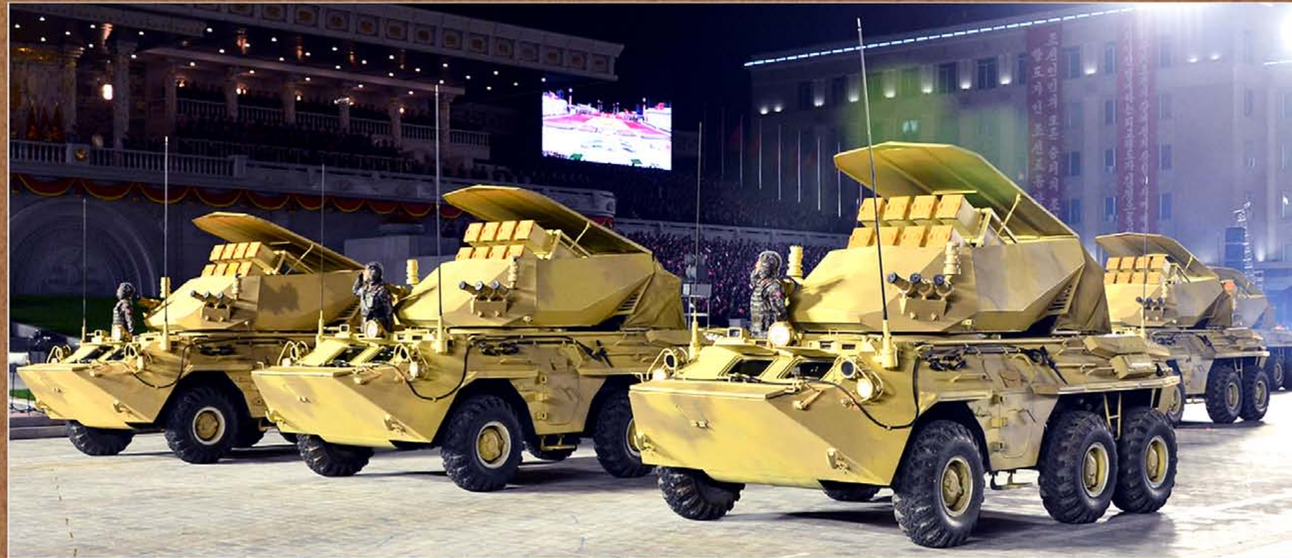
Columns of mechanized units began their procession led by the column of armoured vehicles

of pride of the armed forces of the DPRK.