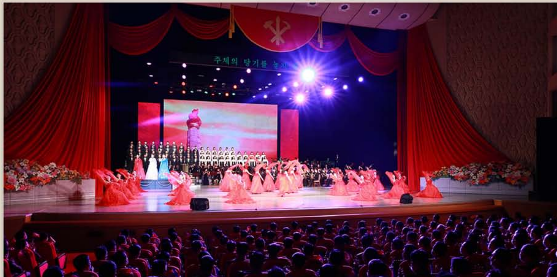
Joint performance of the Mansudae and Wangjaesan art troupes and concert of the National Symphony Orchestra