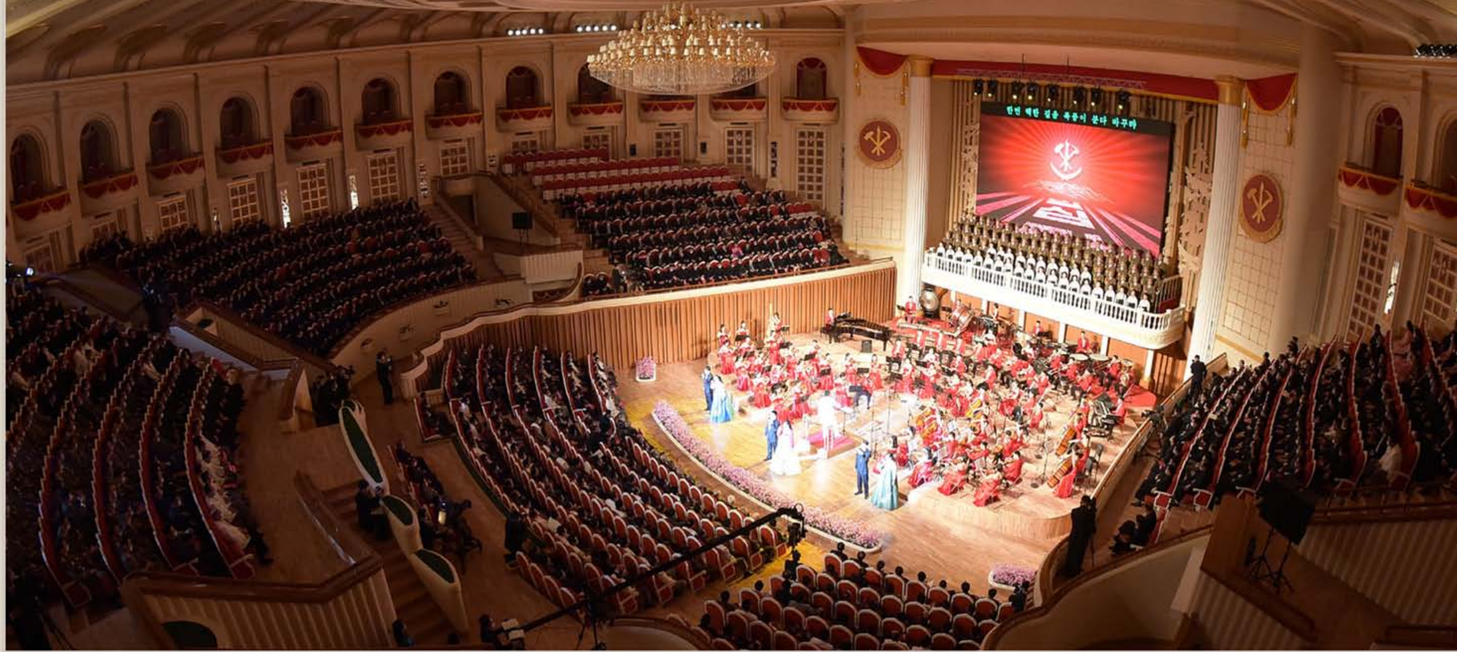
Performance of the Samjiyon Orchestra