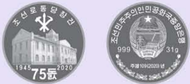
Commemorative coin "75th Founding Anniversary of the Workers' Party of Korea" (silver coin)