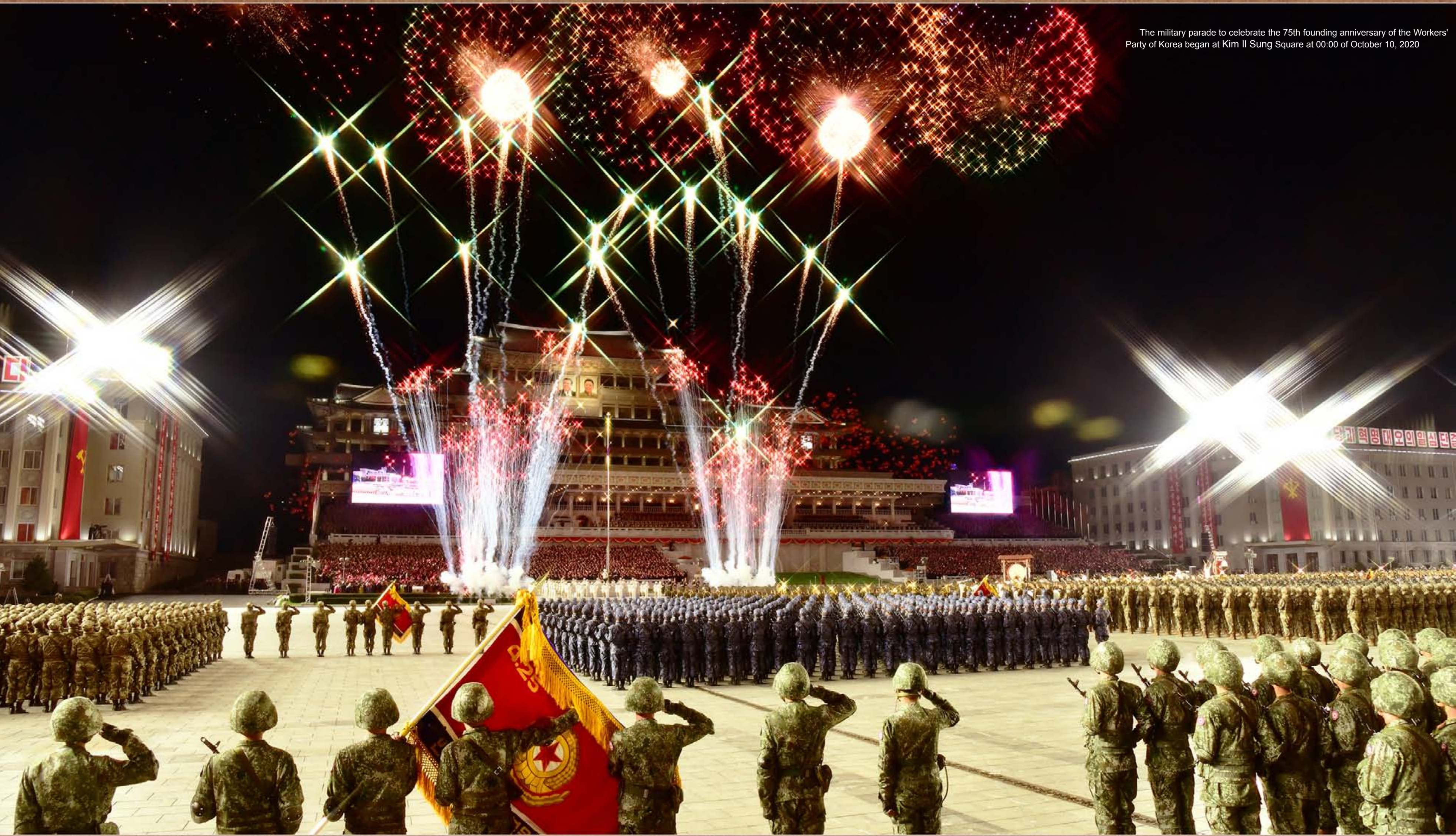
The military parade to celebrate the 75th founding anniversary of the Workers' Party of Korea began at Kim Il Sung Square at 00:00 of October 10, 2020