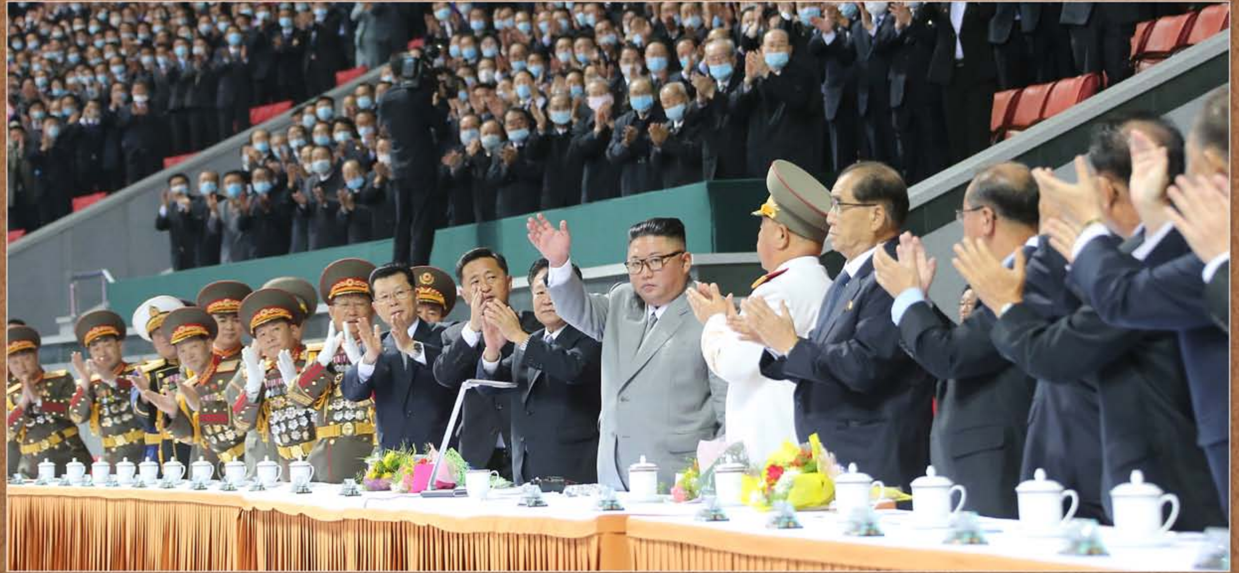
Supreme Leader Kim Jong Un waved back to the performers of the grand gala and the audience in October 2020