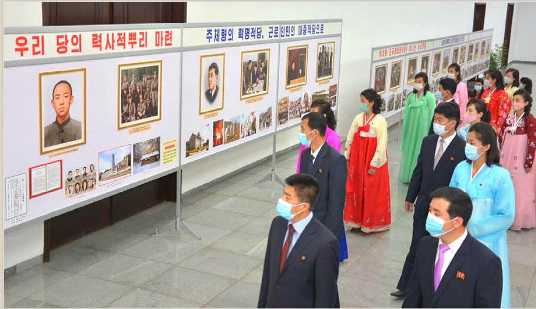
National photo exhibition