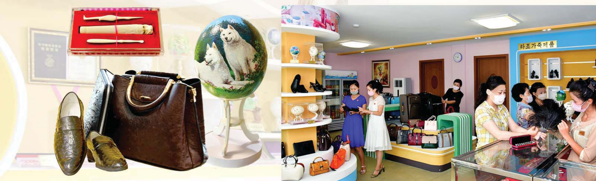
Ostrich goods are favourably commented upon by people.

Article by Pak Un Yong