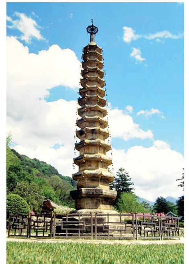
An octagonal 13-storeyed pagoda.