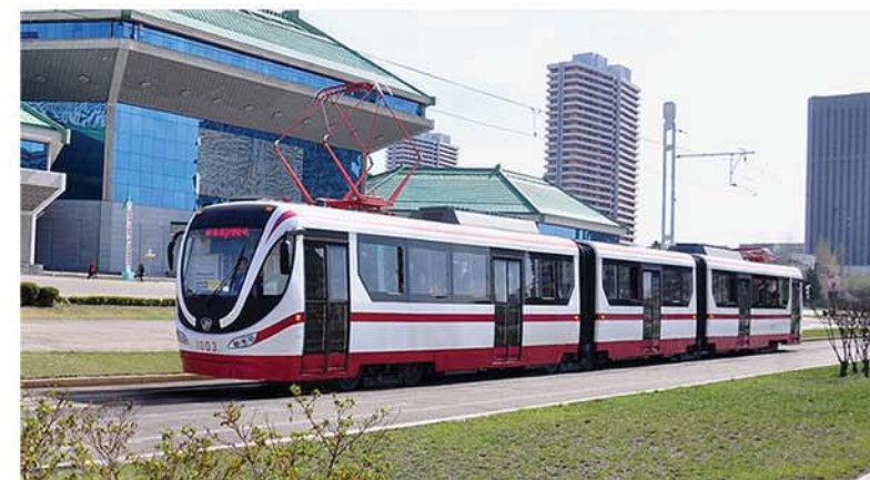
A new-type tramcar runs along a street in Pyongyang.

Once he visited the Wonsan Army-People Power Station built by the people of Kangwon Province. Pointing to the large Korean writing Self-reliance inscribed on the dam of the power station, he said that it really invigorated him, and that the power station was the one which had proved again that self-reliance was the only way out and that there was nothing impossible to do when they held fast to self-reliance and self-development as a driving force.