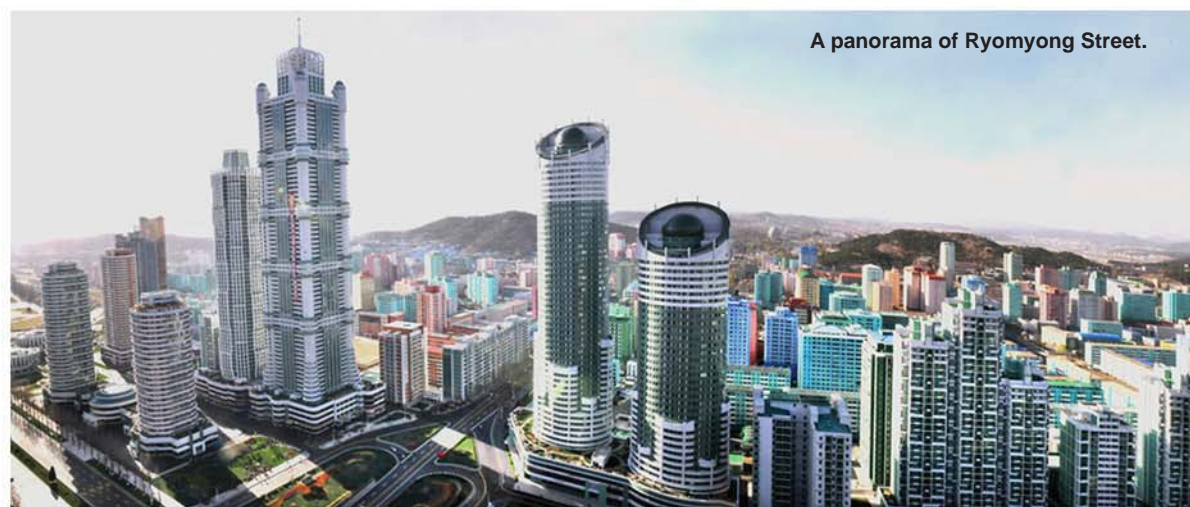
A panorama of Ryomyong Street.

In March 2016 the Supreme Leader declared the beginning of construction of Ryomyong Street on the spot. He said that the project was not simply the formation of a street, but a political occasion for demonstrating the stamina of the DPRK that, standing up more steadfastly in the face of all forms of sanctions and pressure from the hostile forces, is dashing to beat the world, its advance to realize the supreme ideal of the people and the fact that it can do what it is determined to and become as well-off as anyone else in the world in its own way.