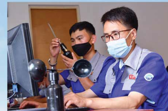
Research is under way for meteorological observation devices.

▶ and have a scientific understanding of the meteorological and climatic change in the mountain.