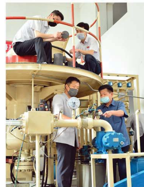
Research gets intensified.

Those sci-tech achievements were highly appreciated as they had pioneered a new phase of the material processing technology.