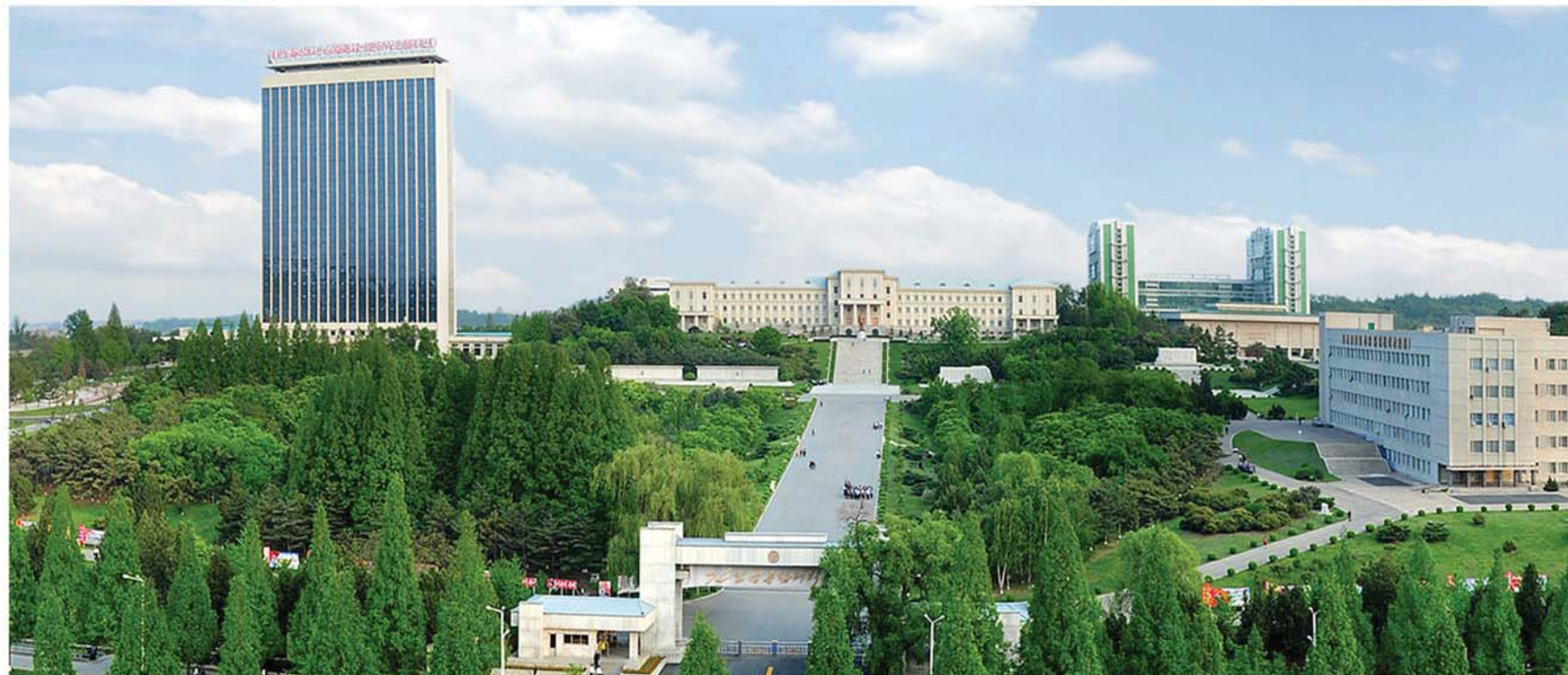
A panorama of Kim Il Sung University.

built on the hill. Thus the Grand People's Study House, a grand palace of learning for all people, rose on the hill, a spot the leader had valued for 20 years.