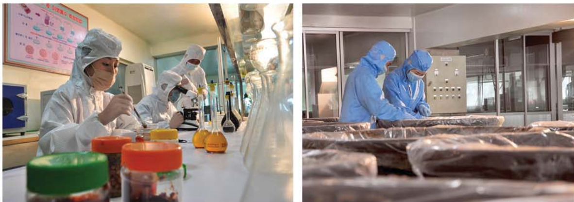
Traditional methods and techniques of making jang are carried on with to retain the original tastes.

J ANG IS A UNIQUE CONDIMENT of the Korean nation, representative of the country's food culture. The meaning of the word jang covers soy sauce, plain paste and peppered paste altogether.