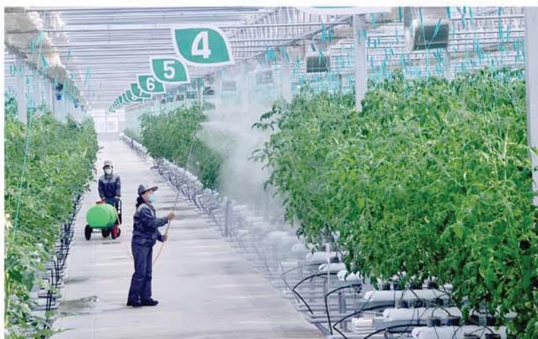
Views of the Jungphyong Vegetable Greenhouse Farm.