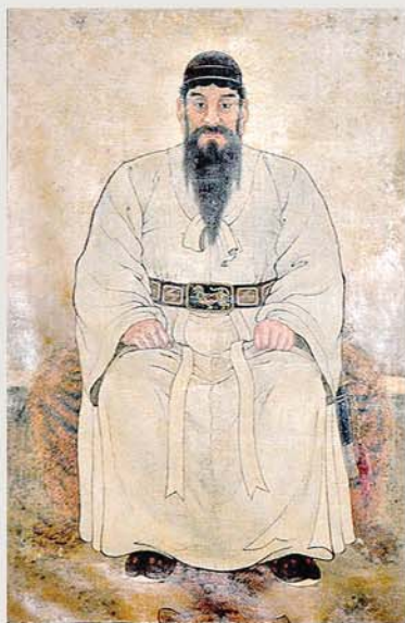
A portrait of King Tangun.