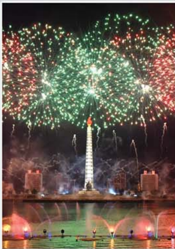
Back Cover: In the festive evening

Photo taken by Ri Yong Myong in October 2017