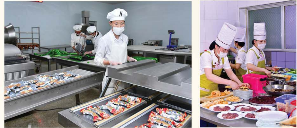
Ostrich meat and its processed goods are supplied to service establishments.

In Central District, Pyongyang is situated the Yaksan Restaurant, part of the Changgwang Restaurant Chain. The restaurant is famous for its os- ►