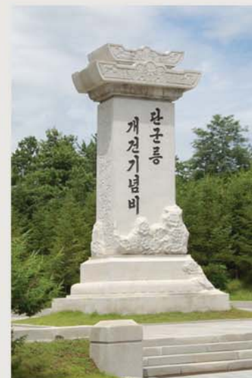
The Monument to Reconstructed Mausoleum of King Tangun.

Five gateposts, which are 1.5 to 10 metres high, stand on each side of the tomb in order of their height. They are in the style of