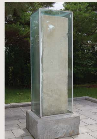
The Monument to Improvement of the Mausoleum of King Tangun.

menhir of Ancient Joseon. The already-existing Monument to Improvement of the Mausoleum of King Tangun was moved to the east of the section of the monument to reconstruction.