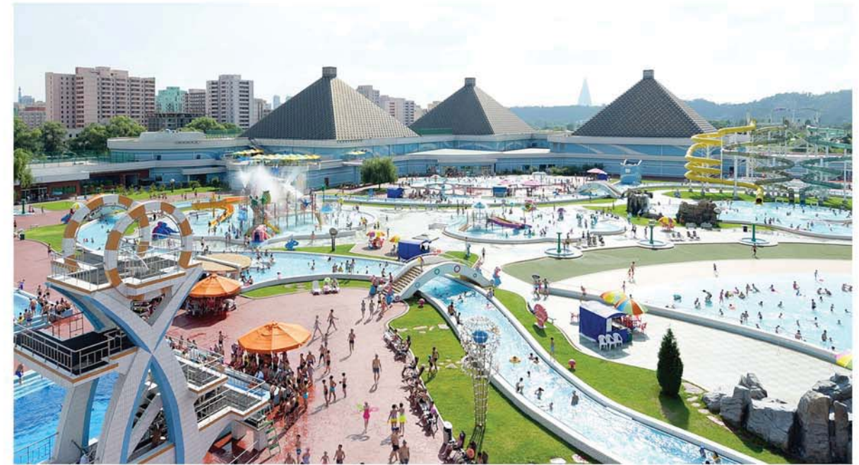
A view of Munsu Water Park (August 2019).

In mid-December Juche 62 (1973) Kim Il Sung went up the hill and suggested building a large library there since the city already had a palace of culture and a schoolchildren's palace. Then children would study in the schoolchildren's palace and adults would do in the library, he mentioned, adding that the people would like it if a library was