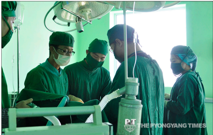
Medical workers engage in an operation at the Nampho City People's Hospital.

The application of cystoscope with CCD camera has made it possible for the consultative meeting of doctors on cystic diseases.