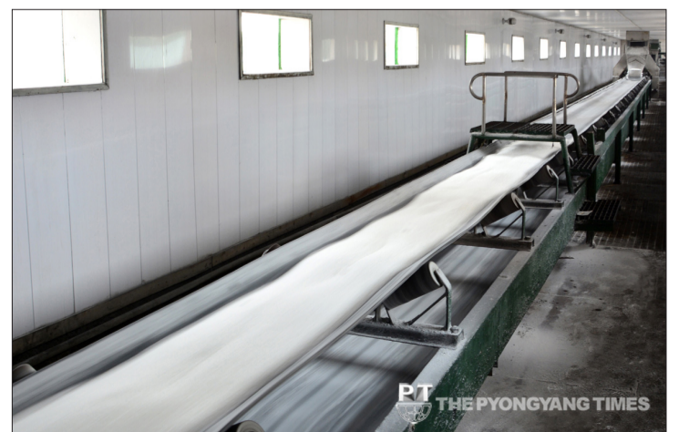
The fertilizer production plan is overfulfilled every day at the Namhung Youth Chemical Complex.

Mun Kyong Nam, deputy manager of the Namhung Youth Chemical Complex