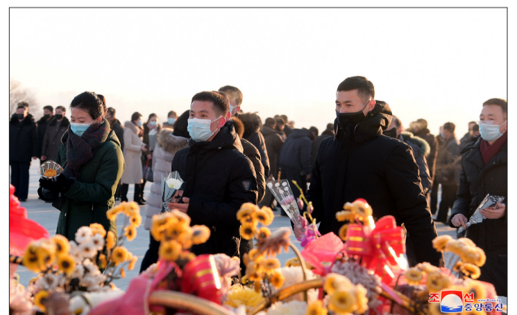
Pyongyang citizens lay flower baskets and bouquets at the statues of President Kim Il Sung and Chairman Kim Jong Il on Mansu Hill on Thursday to mark the ninth anniversary of the demise of Chairman Kim Jong Il.