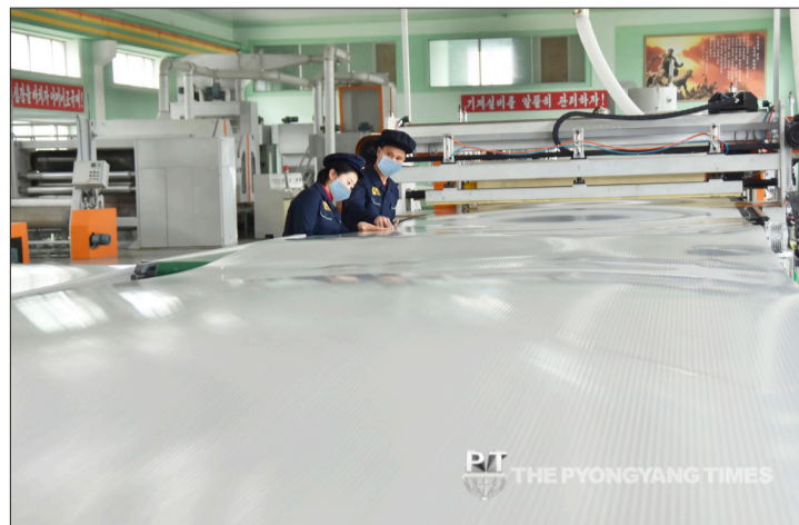
RYANG KUM CHOL