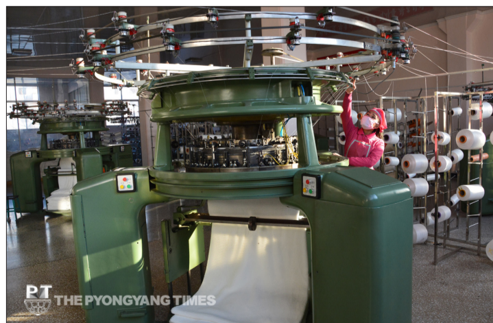
RYU KWANG HYOK