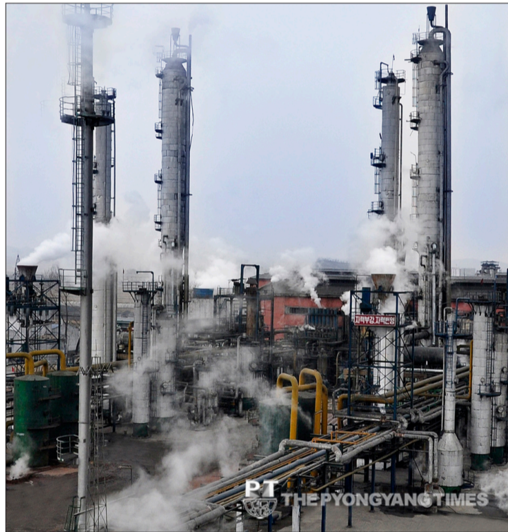
Part of the ammonia production process at the Namhung Youth Chemical Complex.