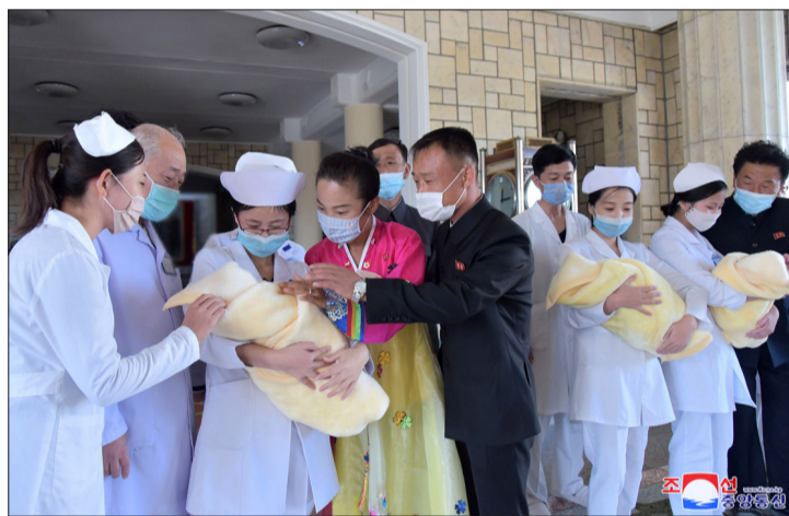
A couple from Kim Chaek City leave the Pyongyang Maternity Hospital with their triplets amid the blessing of well-wishers.