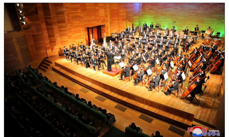
The National Symphony Orchestra gives a concert at the Moranbong Theatre in honour of Chairman Kim Jong Il.