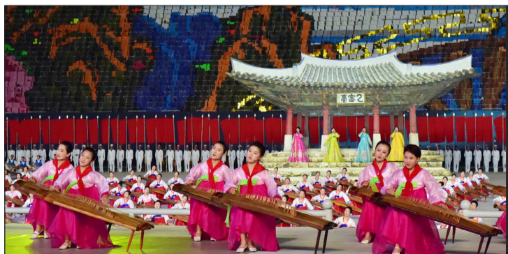
A scene from kayagum ensemble in the grand mass gymnastics and artistic performance "The Land of the People" in 2019.