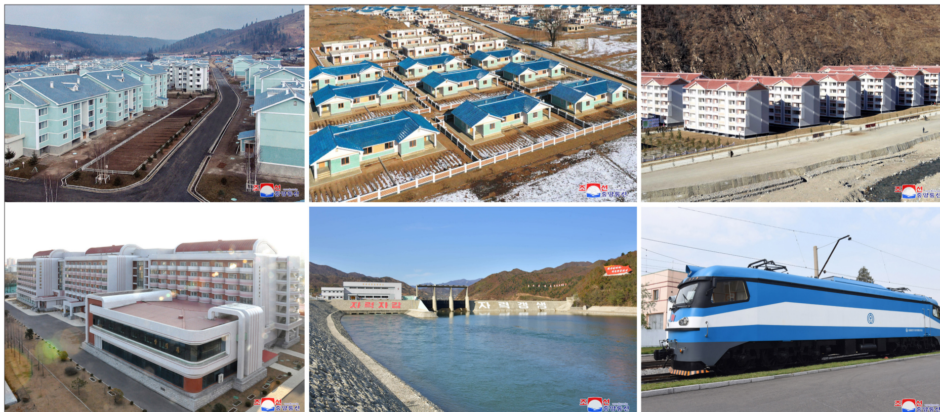
Part of the achievements made across the fields during the 80-day campaign of loyalty.

The historic 80-day campaign clearly proved once again that no force on earth can stop Juche Korea that dynamically advances by holding single-minded unity and self-reliance as the treasured sword and backed by the inexhaustible creativity and spiritual strength of the people, following the idea and leadership of the great Party.