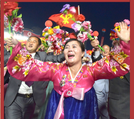
The Korean people smiled away the challenges throughout 2020 although the malignant virus threatened their lives from moment to moment and serious natural calamities harassed them. Extra-large measures were taken, with decent houses provided gratis to the afflicted people and precious achievements made in economic sectors. The crowds extend highest respects to Supreme Leader Kim Jong Un in the marvellous celebrations of the 75th anniversary of the founding of the Workers' Party of Korea.