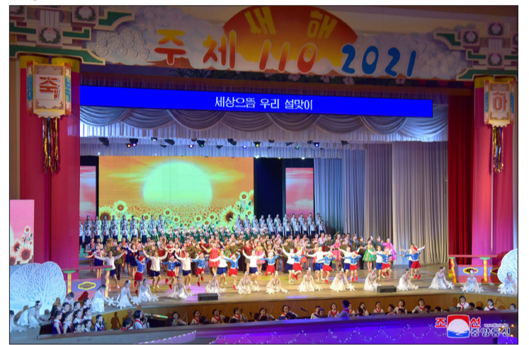
A scene from the schoolchildren's performance for celebrating the New Year.