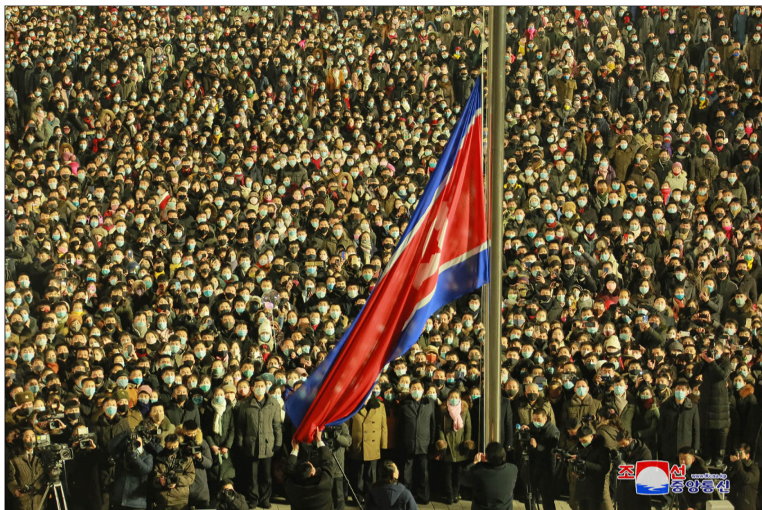
The flag of the DPRK is hoisted by three representatives of workers, farmers and intellectuals at Kim Il Sung Square in Pyongyang on New Year's Day of 2021 as crowds of people look on in salute.

A national flag-hoisting ceremony was held solemnly at Pyongyang's Kim Il Sung Square on January 1 2021.