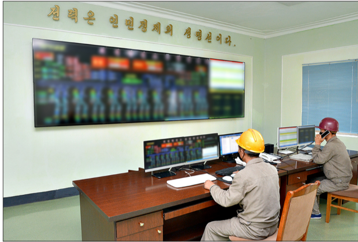
Workers monitor power generation at Huichon Power Station Unit 2.

percent more efficient than the previous one and its lifespan is over ten times longer.