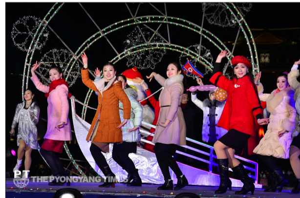
A gala performance is staged at Pyongyang's Kim Il Sung Square on New Year's Eve to the delight of citizens.