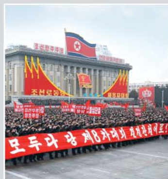
Front Cover: A scene from the Pyongyang city army-people joint rally held to vow to carry out the decisions of the Eighth Congress of the WPK

Inside Back Cover: I Sing in Praise of the Party