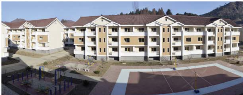
Some of the new houses built in disaster-stricken areas.