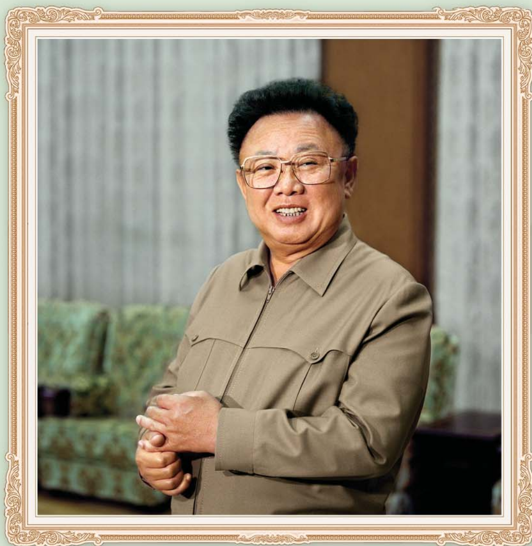
Chairman Kim Jong Il of the DPRK National Defence Commission in October 2000.

“S INGLE-HEARTED UNITY IS my philosophy of revolution”—this is what Chairman Kim Jong Il said referring to his political creed. Firmly convinced of the absolute truth of single-hearted unity he steadily consolidated the