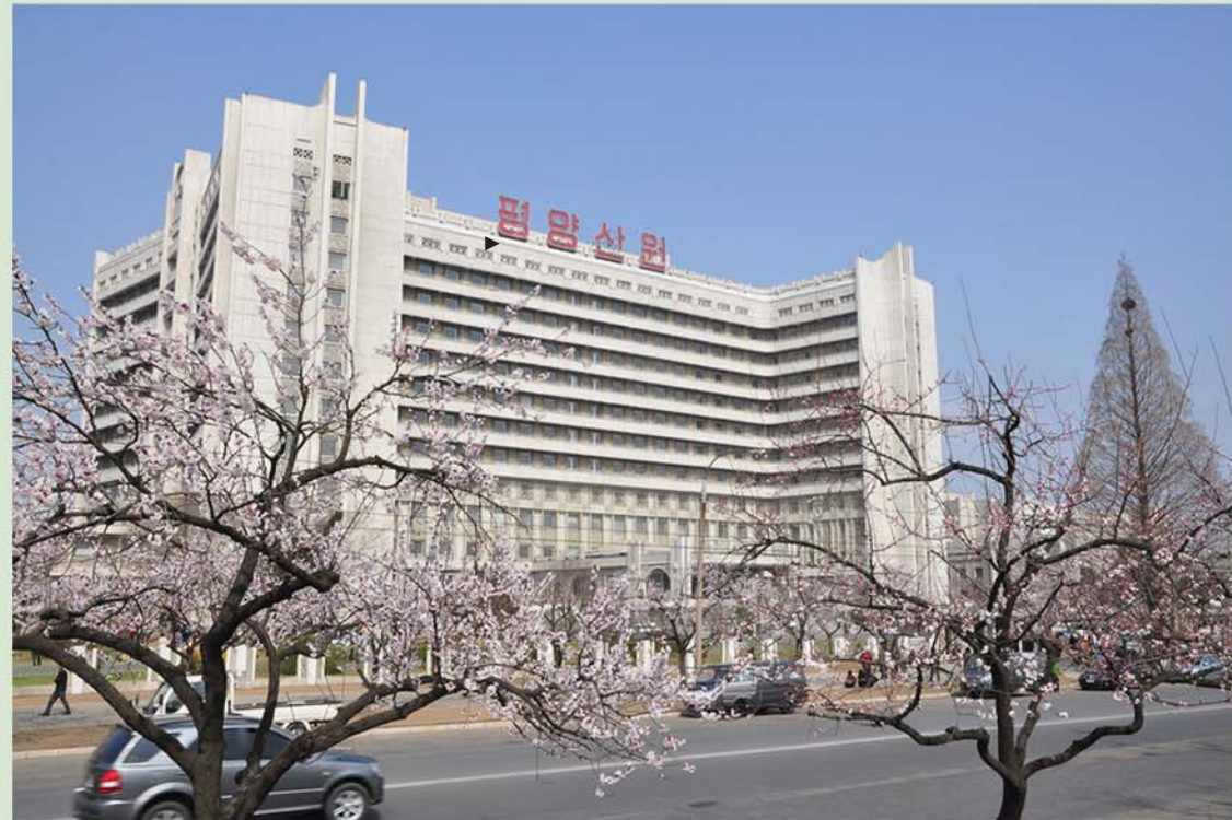
The Pyongyang Maternity Hospital.