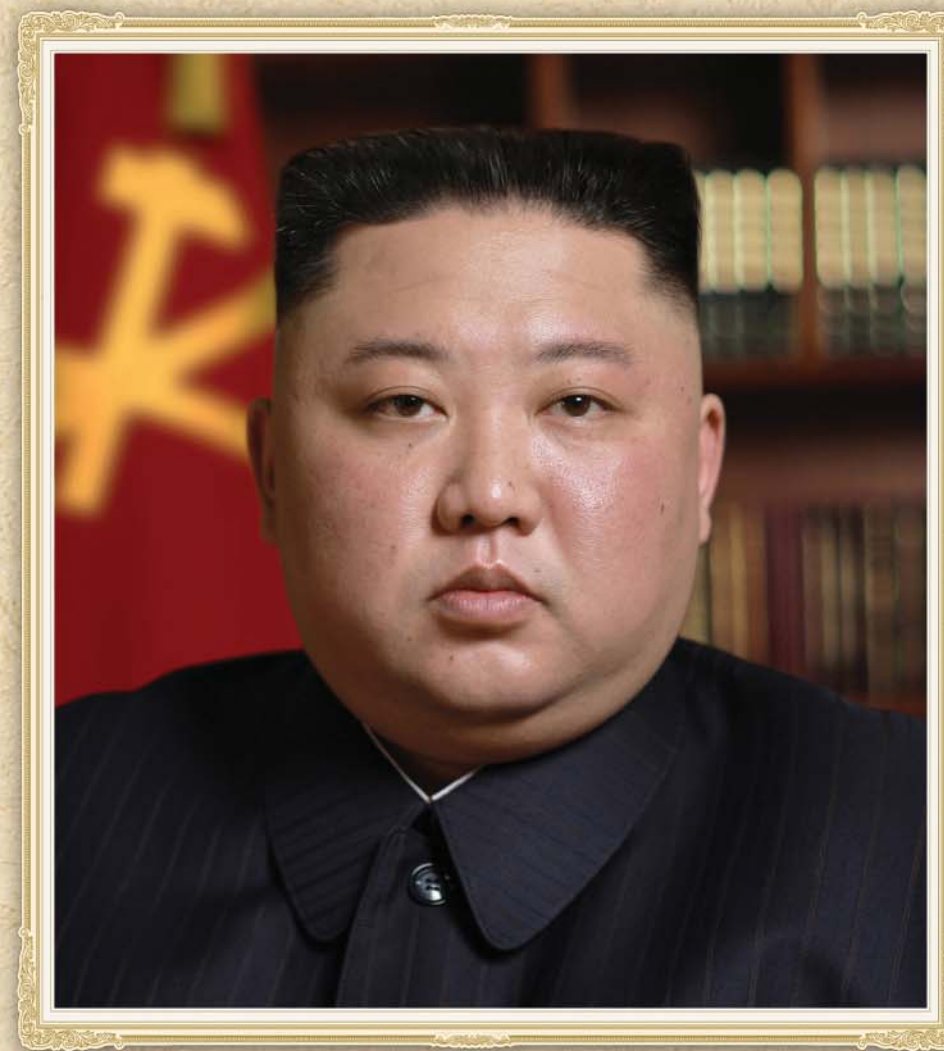
Kim Jong Un, general secretary of the Workers' Party of Korea.

T HE EIGHTH CONGRESS OF THE Workers' Party of Korea discussed the fourth item on the agenda "Election of the central leadership body of the WPK".