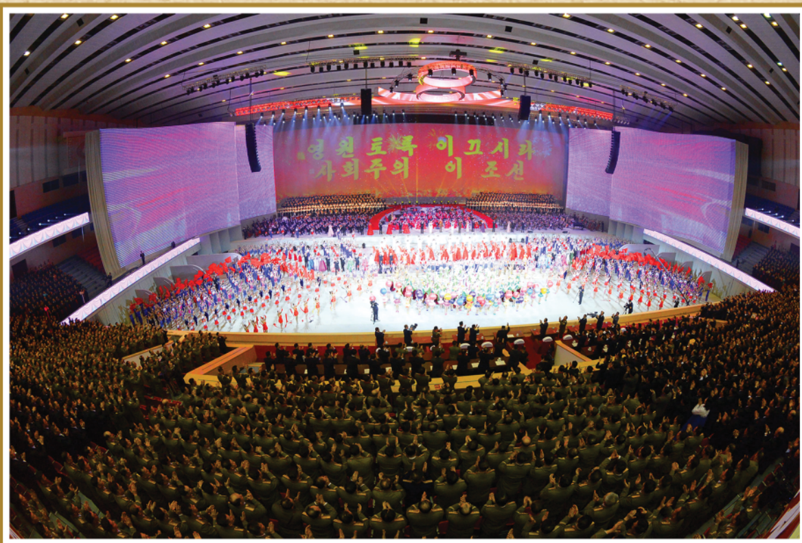
The grand artistic performance We Sing of the Party takes place with splendour in the presence of Kim Jong Un, general secretary of the WPK, in celebration of the Eighth Congress of the WPK in January 2021.