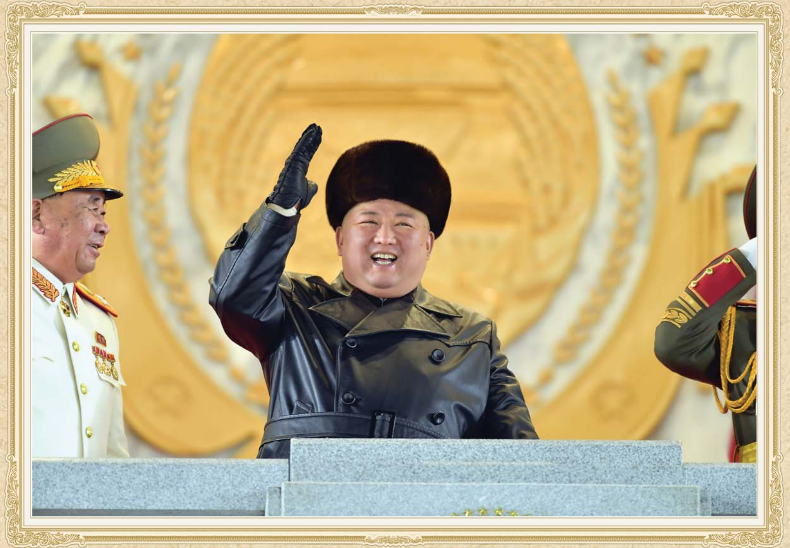
Kim Jong Un acknowledges the enthusiastic cheers of the participants in the military parade in January 2021.