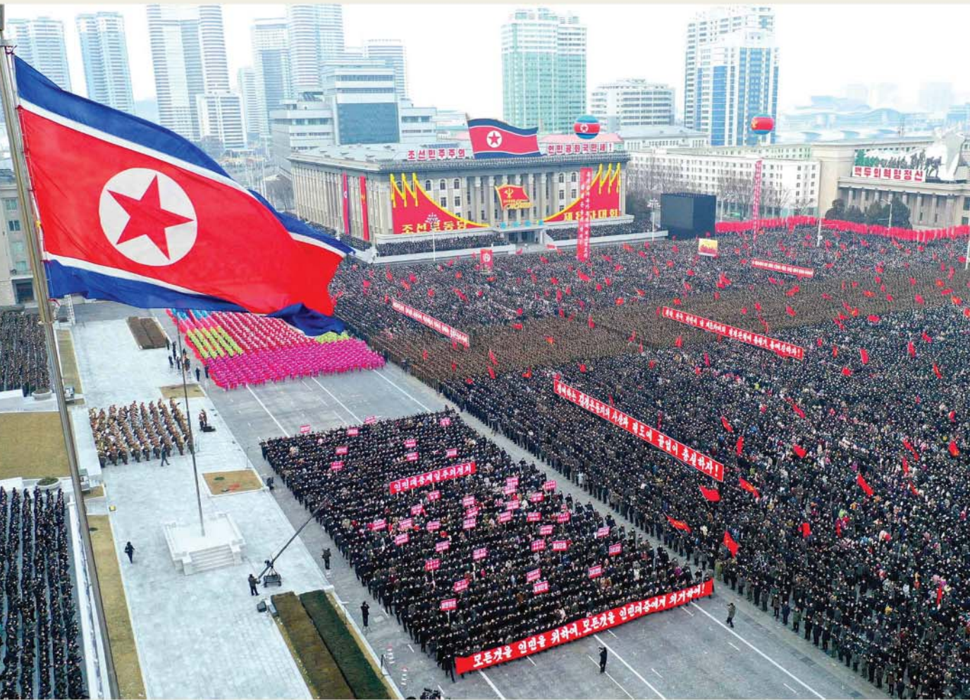
A Pyongyang city army-people joint rally takes place to vow to carry out the decisions of the Eighth Congress of the WPK in January 2021.