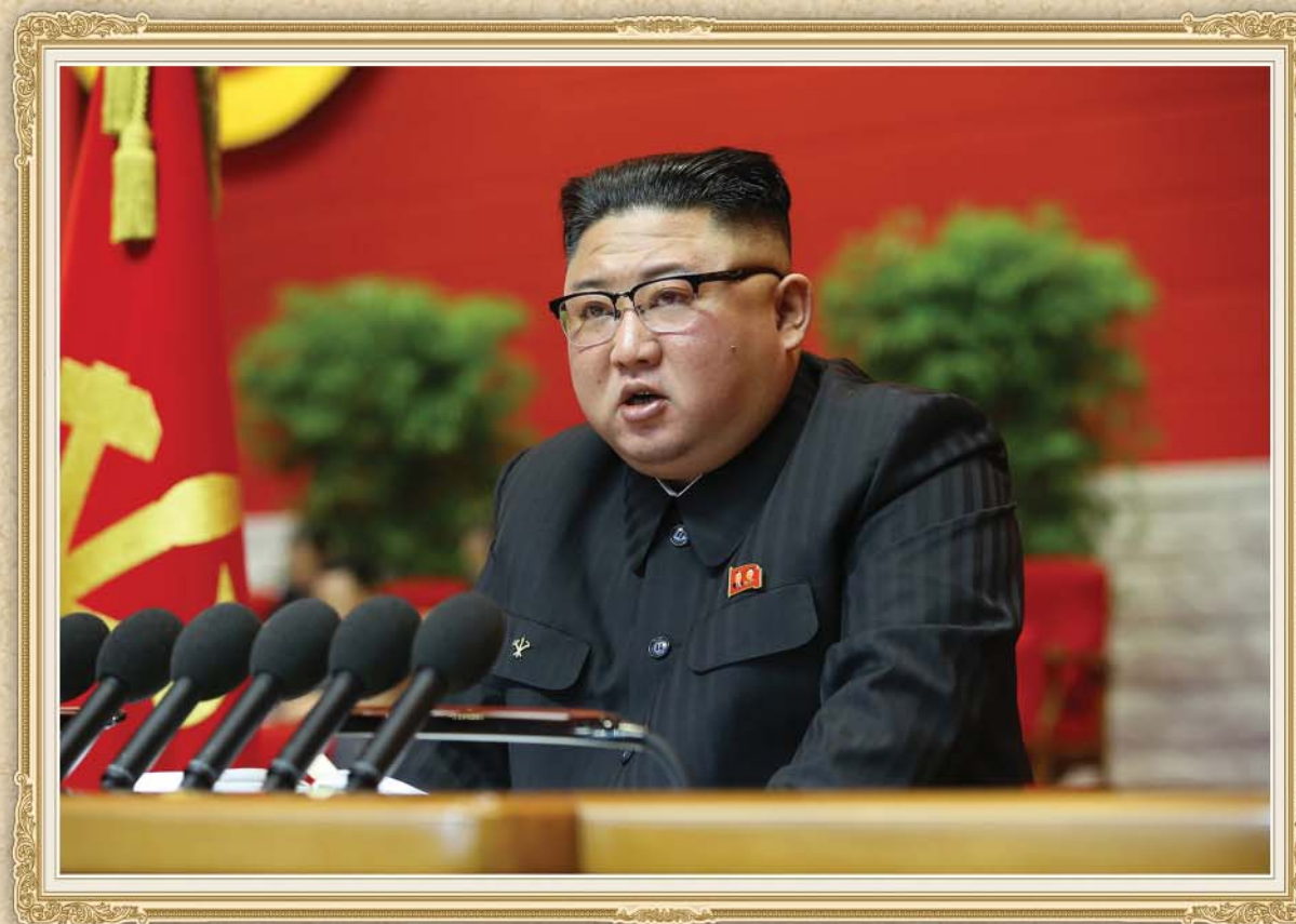
Kim Jong Un makes the report on the work of the Seventh Central Committee of the WPK in January 2021.

The report noted that serious mistakes were revealed in the work of several fields including economic work under the grave internal and external situations, but those were deviations made in the stage of new development and in the course of the advance of the socialist cause and were problems