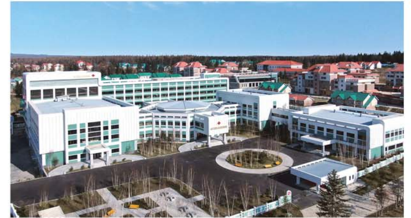
A view of the Samjiyon City People's Hospital.

A foundation was laid to put apatite concentrate production on a normal basis at the Phungnyon, Yongyu and Jungsan mines, while a lead smelting line