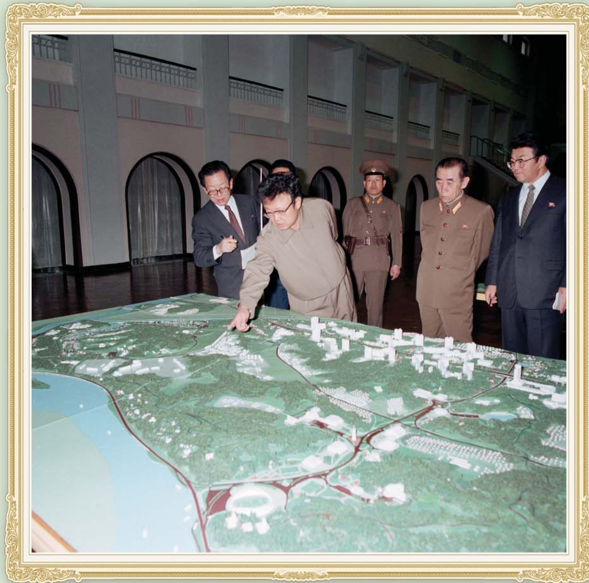
Chairman Kim Jong Il examines the plan of some important projects in Pyongyang in March 1985.

T HE HISTORY OF THE SOCIALIST KOREA had periods called Golden Age of Pyongyang. The time of the 1970s and the 1980s turned out to be the heyday of creation and construction thanks to the wise leadership of Chairman Kim Jong Il.