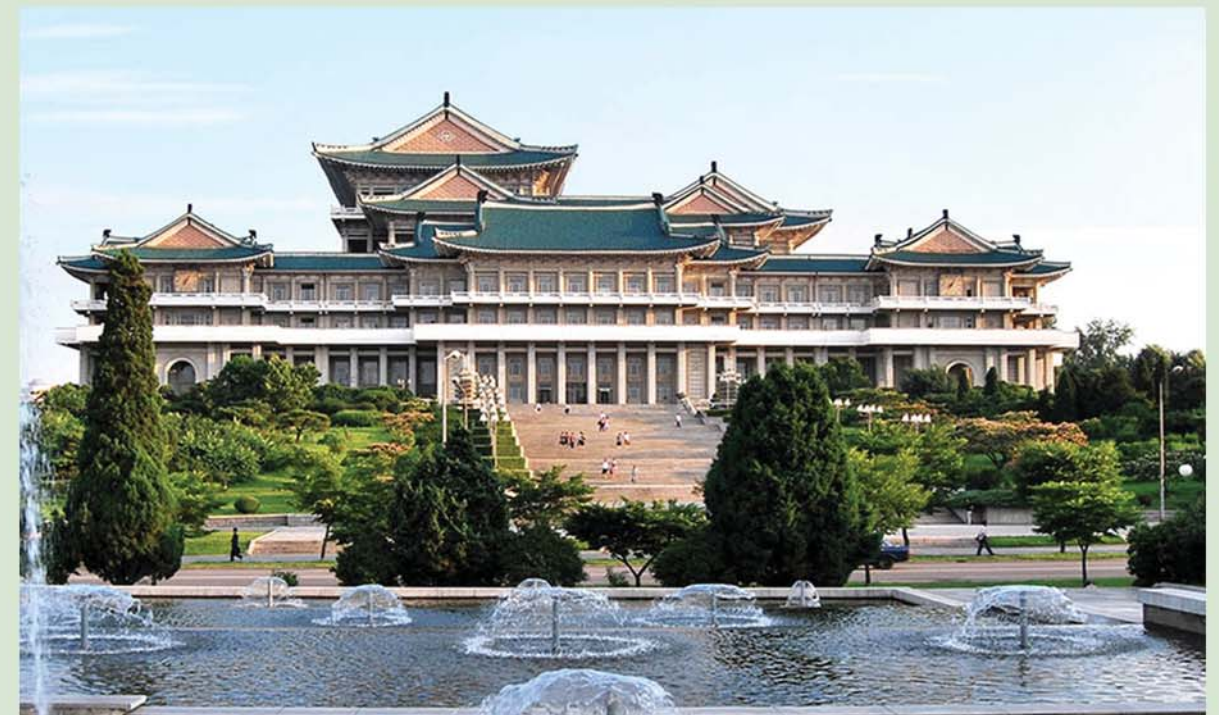
The Grand People's Study House.

On the occasion he also said that the appearance of the capital was just that of the country, and that the project to rehabilitate and construct Pyongyang into the city of revolution and the people was an important task to demonstrate the authority and dignity of the country. And he said that, true to the intention of the Premier, high-rise apartment blocks had to be built in downtown Pyongyang, canals be built on the Taedong and Pothong Rivers with promenades lined with trees so that people could enjoy their recreational and leisure time to the full, and parks and pleasure grounds be built on Moran, Changgwang and Haebang Hills and