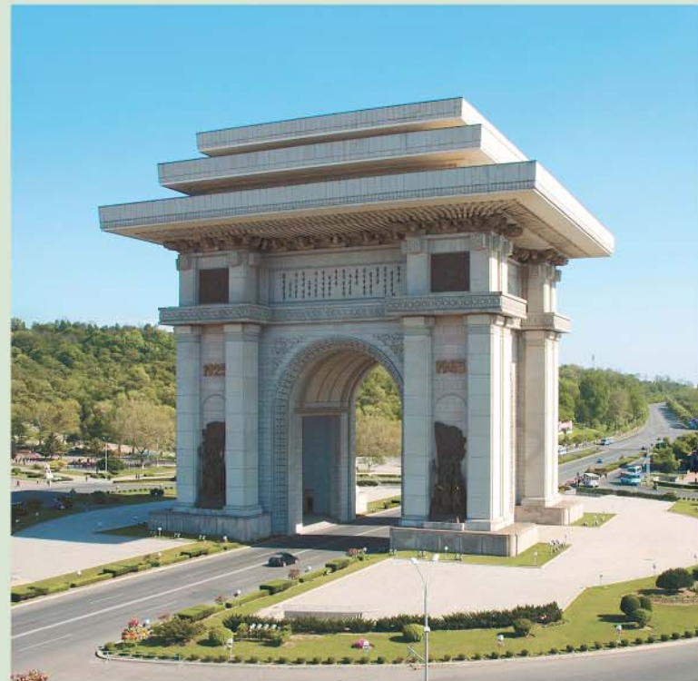
The Arch of Triumph.