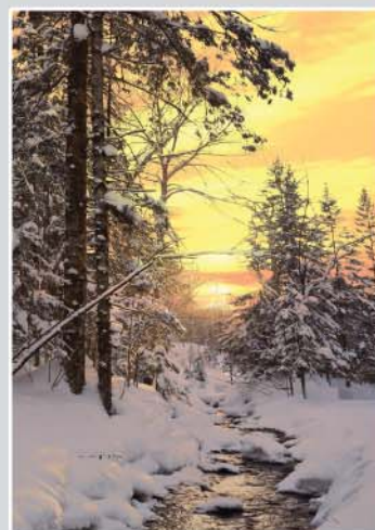
Back Cover: The Sobaek Stream in the glow